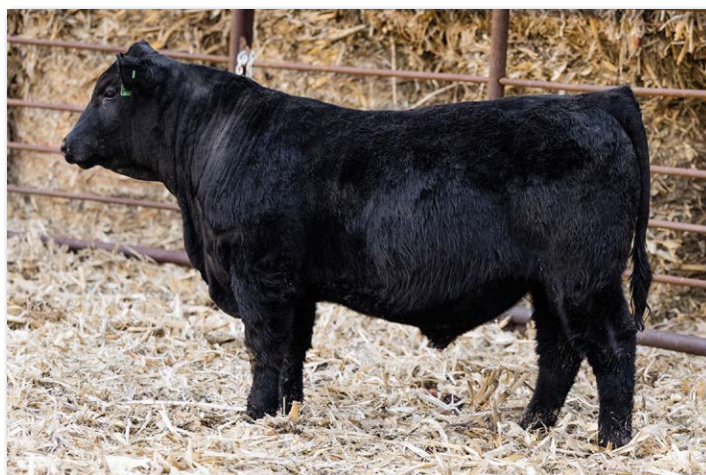
TSN ICONIC N316 Sells as Lot 5.

This bull is bred almost identical to Lot 4. Bred to add pounds and profit.