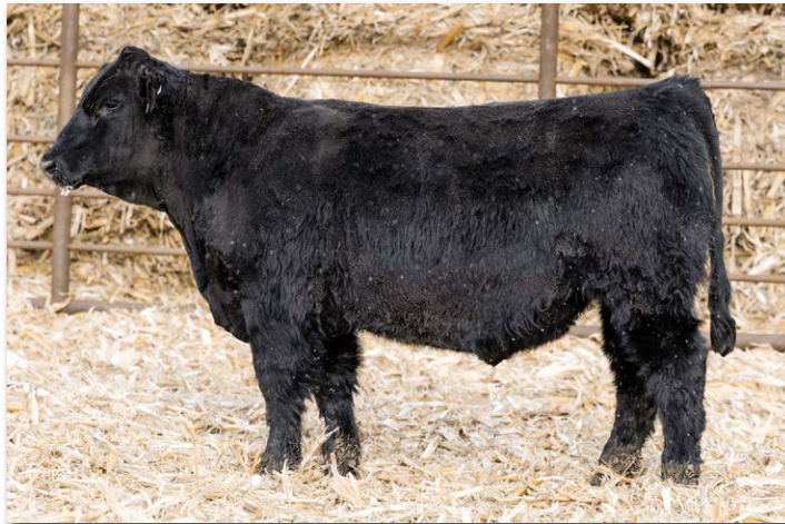
TSN ANTHEM N808 Sells as Lot 30.