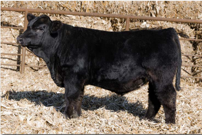
TSN EAGLE N236 Sells as Lot 57.

A 3/4 brother to Lot 55. Eagle has been our go to bull, and he's crossed well with these 2 High Security daughters.