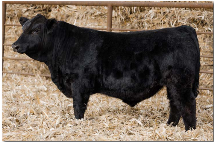
TSN GUARDIAN N052 Sells as Lot 27.

LOT 26 TSN GUARDIAN N716 GGP Homo Black Homo Polled PB SM ASA #4564235 N716 BD: 3/18/2025