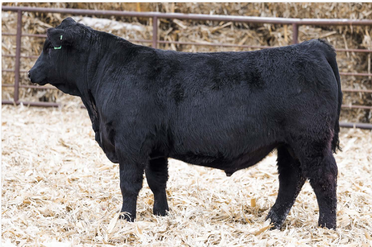
TSN ICONIC N231 Sells as Lot 1.