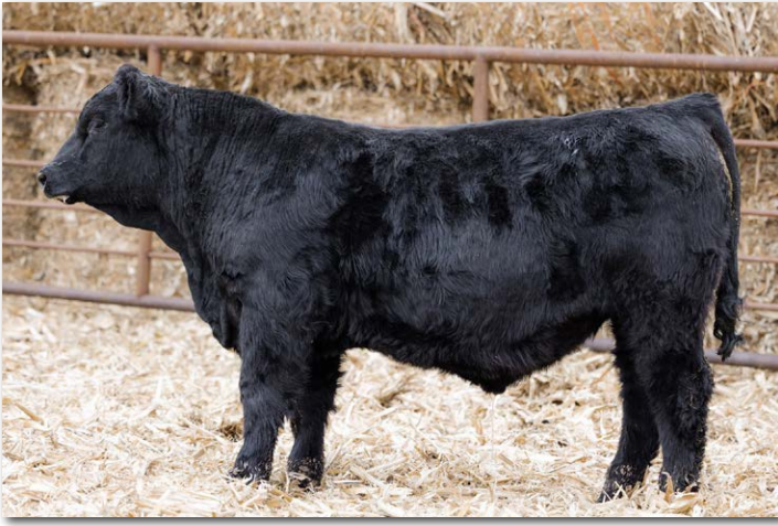
RT9 BALD EAGLE N185 Sells as Lot 66.