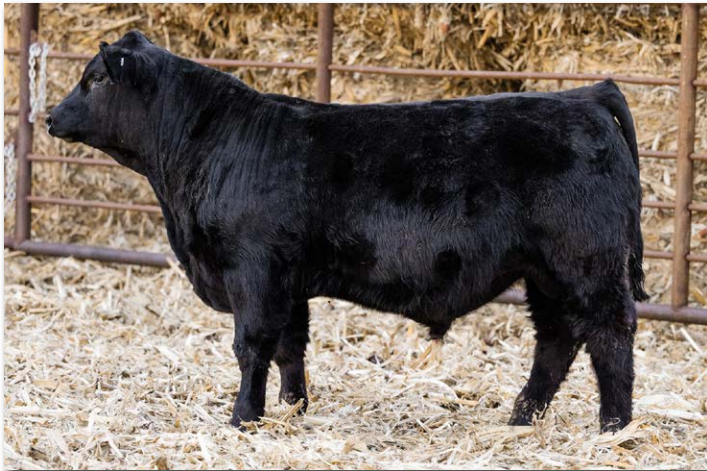
TSN GLOBAL N002 Sells as Lot 43.

I was very excited on picture day when we ran this bull into the pen, and I got to see how this bull was progressing. He's got the soft, deep middle we've come to expect from the Bold Ruler calves and pairs that with an API and TI in the top 10% of the breed.