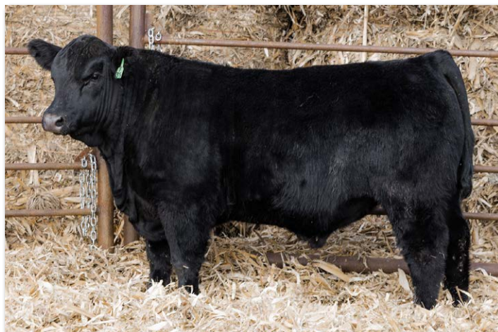
TSN ICONIC N319 Sells as Lot 4.

Another powerful, easy fleshing F1. He's got the calving ease influence of Bold Ruler on the cow side. Top 2% for All Purpose Index while still in that 1% for Terminal Index.