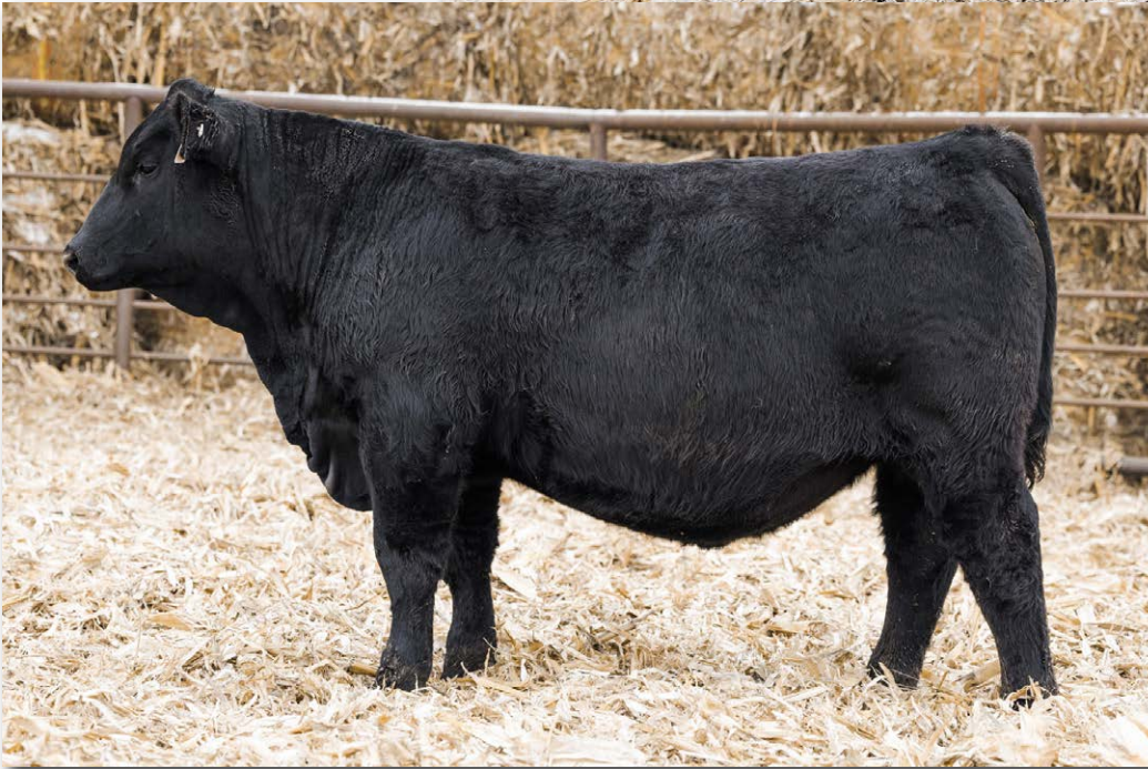
TSN STATESMAN N312 Sells as Lot 12.

LOT 12 TSN STATESMAN N312 ⚡GGP Homo Black Homo Polled 3/4 SM 1/4 AN ASA #4564142 N312 BD: 1/28/2025