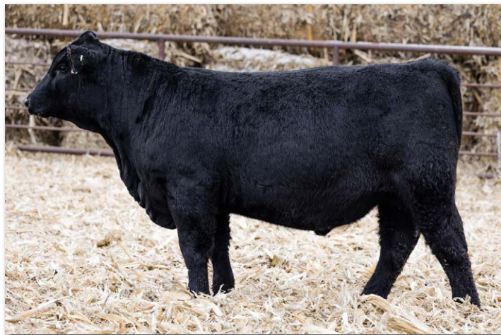
TSN HOMESTEADER N358 Sells as Lot 45.

A son of our Home Town son, Homesteader. He came in with a 112 weaning weight ration and gained nearly 4 lbs./day.