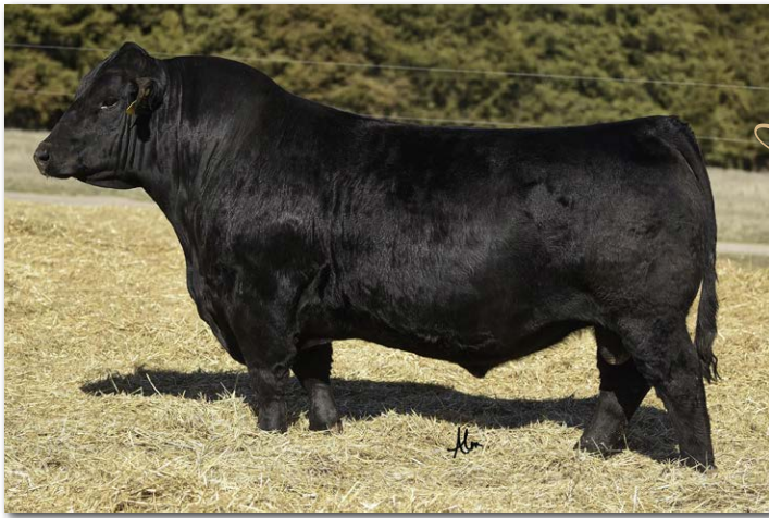
CLRS GUARDIAN 3176 Sire of Lots 26-29.