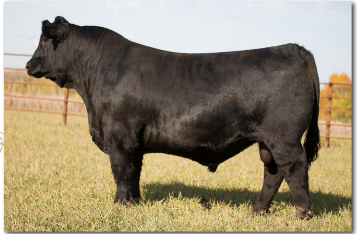
IRON CREEK NEVER SAY NEVER 9 Sire of Lots 36-39.