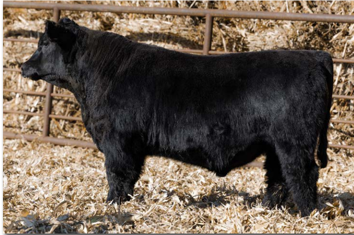
TSN SUMMIT N821 Sells as Lot 48.