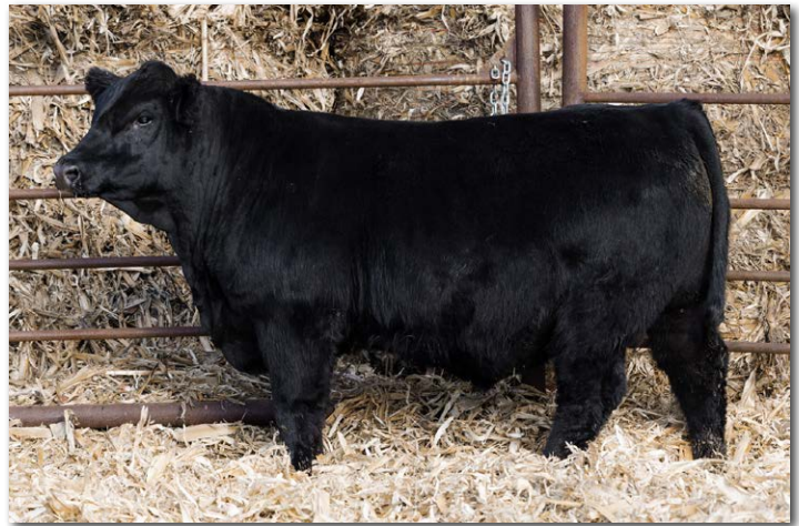
TSN BALD EAGLE N917 Sells as Lot 63.

A big, stout power bull here. Extremely thick and deep bodied in his makeup.