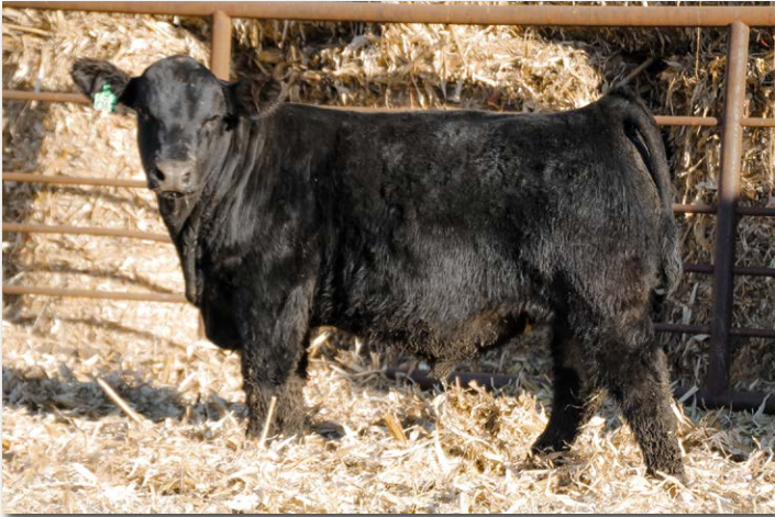
TSN ICONIC N710 Sells as Lot 7.

Comes in a little more moderate package with the influence of Cimarron on the cow side.