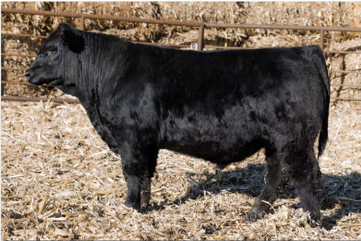
RT9 STATESMAN M271 Sells as Lot 23.

The only Statesman son to earn the ACE logo, -3.2 for Birth Weight EPD.