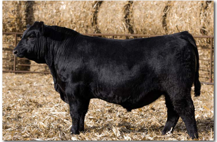
TSN ICONIC N308 Sells as Lot 9.

Another top ratiating bull, at 113 for weaning, and he kept on going at almost four and a half pounds per day. Big growth bull in the top 1% for WW and YW EPDs.