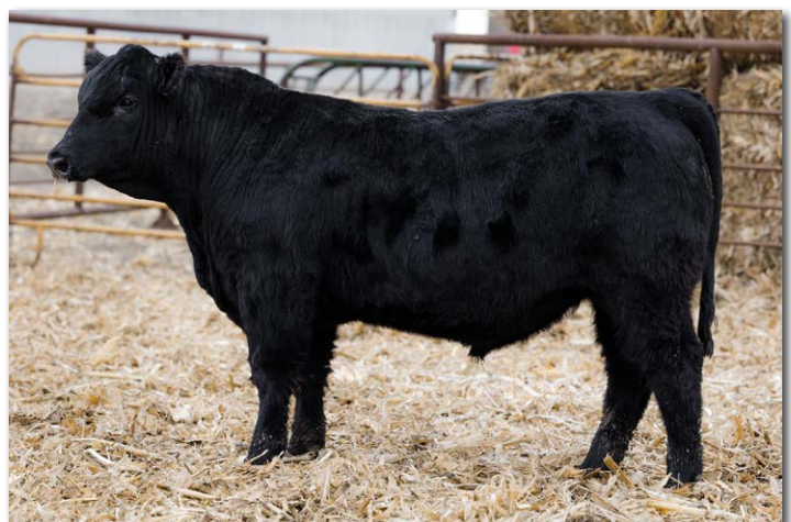
RT9 BALD EAGLE N162 Sells as Lot 65.

RT9 Bald Eagle N162- Another Bald Eagle son that received an ATM shield. He's in the top 10% for weaning and yearling and has been a fast grower in the bunch.