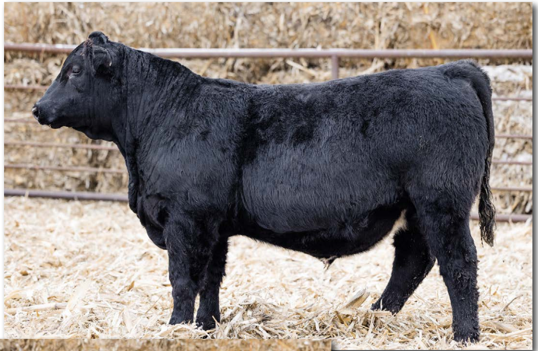
TSN STATESMAN N309 Sells as Lot 13.