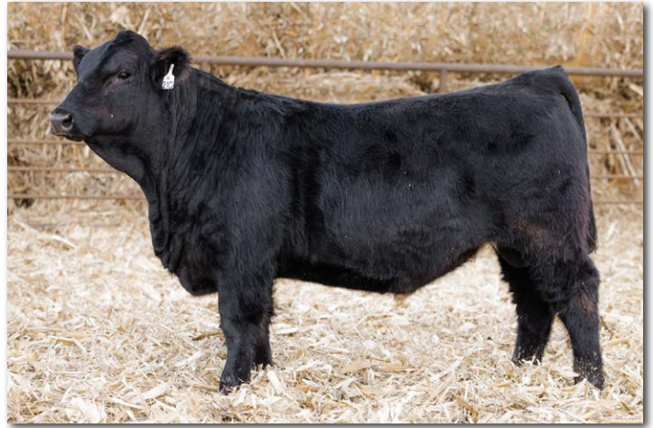
TSN HONOR N210 Sells as Lot 70.

We really liked the Honor sired bulls we had a couple years ago, and decided to come back to him. He adds thickness and tends to moderate frame on bigger cows.