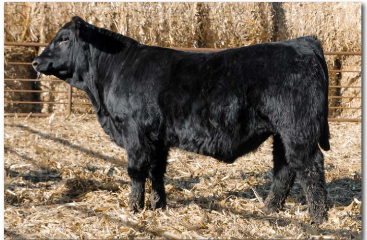
TSN MEDICINE MAN N910 Sells as Lot 52.

A G+ bull sired by the calving ease sire, Medicine Man.