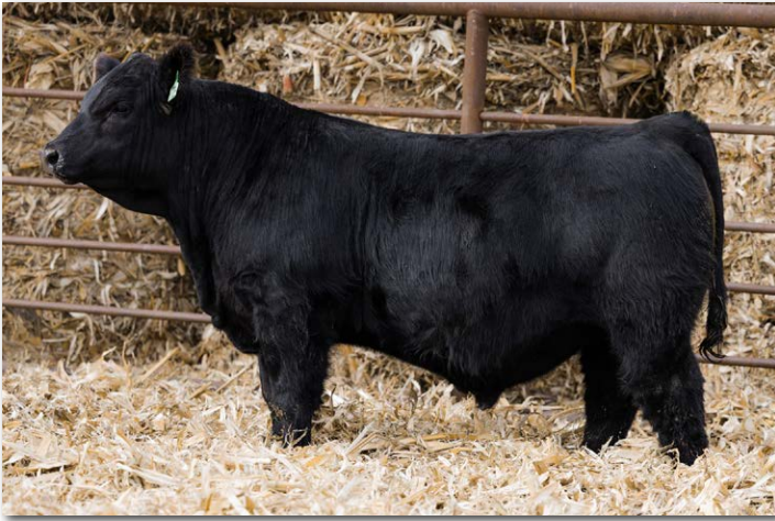
TSN EAGLE N112 Sells as Lot 56.