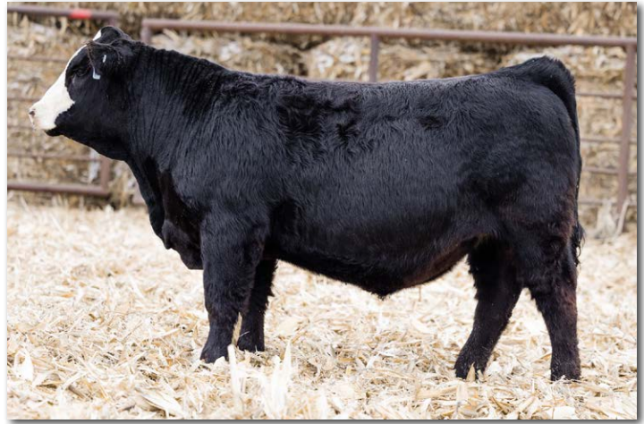
TSN ANTHEM N585 Sells as Lot 32.

The Anthem ET brothers out of Statesman's dam. Another uniform group with the exception of Lot 33, the bigger framed heavy gaining bull. These calves were a little younger and out of the older cow group.