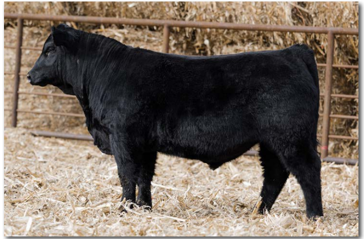
TSN SUMMIT N235 Sells as Lot 50.

Another ATM bull with the outstanding growth numbers from the Summit bull.