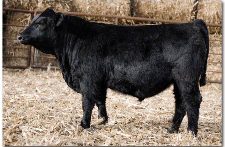
TSN SUMMIT N203 Sells as Lot 51.

Bred like the Lot 49 bull. Summit x Guardian, a terminal sire prospect.