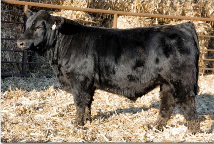
TSN STATESMAN N931 Sells as Lot 22.