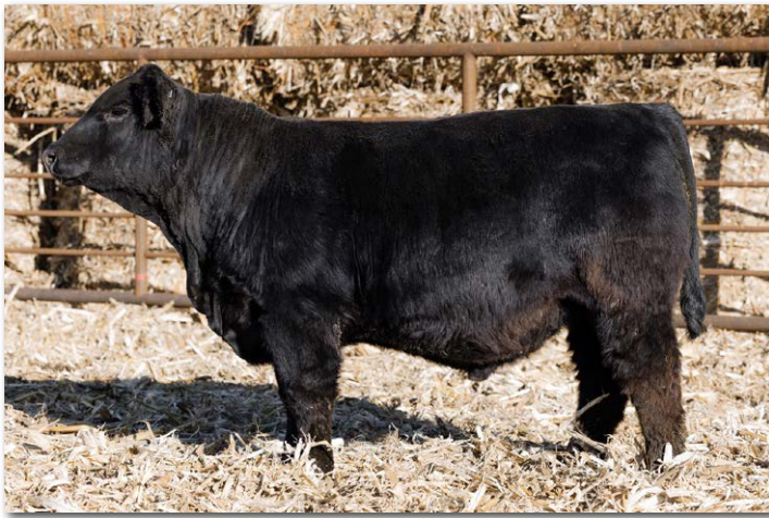
RT9 BOLD RULER N028 Sells as Lot 42.