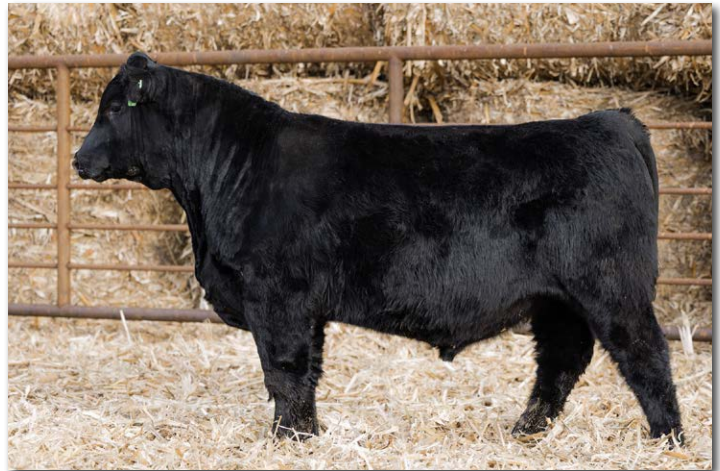
TSN HOME TOWN N350 Sells as Lot 40.

A top 1% API bull. We had 1 last straw of Home Town in the tank and hit a home run combining him with this Bold Ruler daughter. A nice balance of calving ease, growth, maternal, and carcass traits.