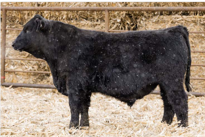
TSN STATESMAN N104 Sells as Lot 24.