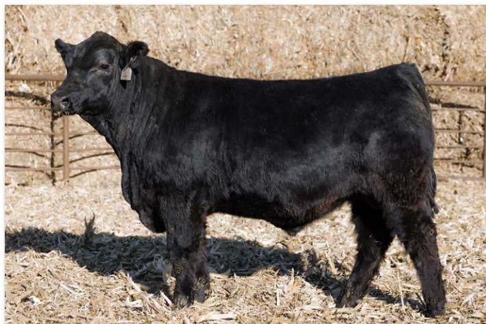
RT9 ESSENTIAL N857 Sells as Lot 46.

The look of this Essential son has really impressed us. He's big, extended, and has a nice front end.