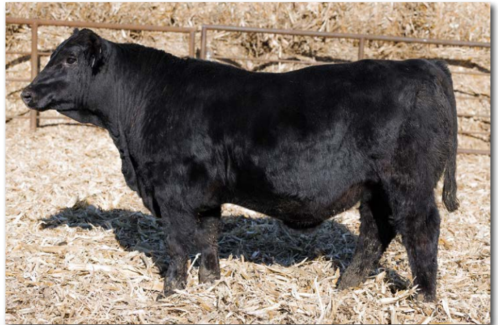
TSN HONOR N818 Sells as Lot 71.

A high gaining ATM bull out of a cow that has produced 6 calves with an average weaning ratio of 105.