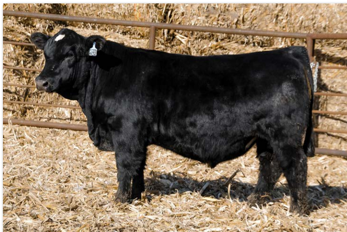
TSN ANTHEM N432 Sells as Lot 31.

LOT 30 TSN ANTHEM N808 GGP PB SM BD: 3/20/2025