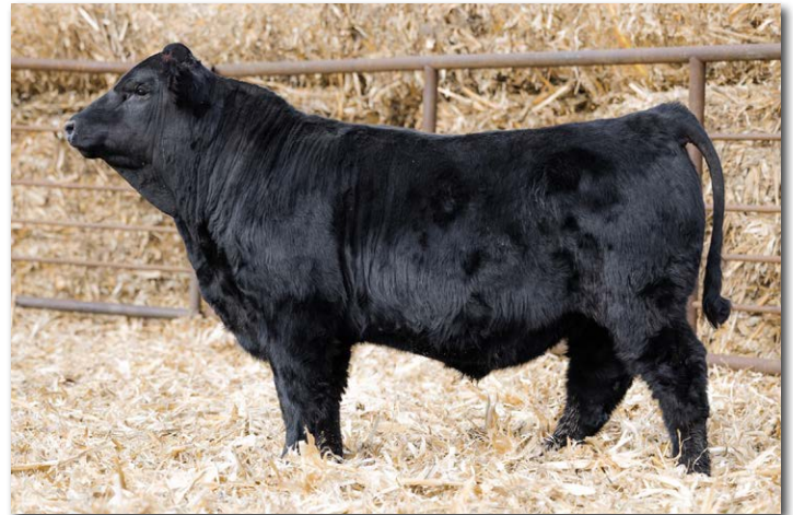
TSN EAGLE N704 Sells as Lot 54.

We still love Eagle, and this ET bull out of our Rimrock cow is one of the reasons why. He ranks high for calving ease and weaning weight.