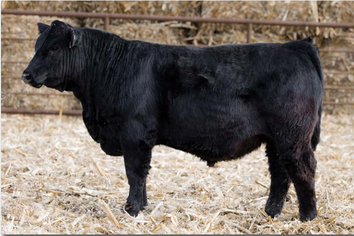
RT9 DOUBLE EAGLE N262 Sells as Lot 67.

A nice Bald Eagle son who's extended and bigger framed.