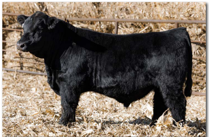
TSN STATESMAN N828 Sells as Lot 21.

Here's a little different cross on this Statesman son with Sure Fire and Sure Bet on the cow side. Dam's weaned 6 calves with an average weaning ratio of 104.