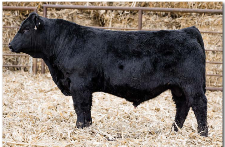
RT9 BALD EAGLE N160 Sells as Lot 64.

Lot 64 is an ATM bull who we were really impressed with his balance and masculinity.