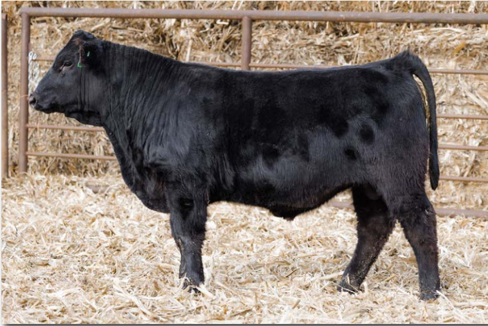
TSN NEVER SAY NEVER N348 Sells as Lot 37.

LOT 37 TSN NEVER SAY NEVER N348 ♂GGP Homo Black Homo Polled 5/8 SM 3/8 AN ASA #4564177 N348 BD: 1/20/2025