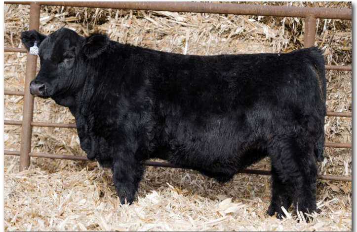
TSN STATESMAN N228 Sells as Lot 20.

Here's the bull that ranked 2nd to Lot 19 at weaning, also ratioing 117. Dam's Essential sired heifer ratioed 121 last year to give her an average of 119 on her first 2 calves.