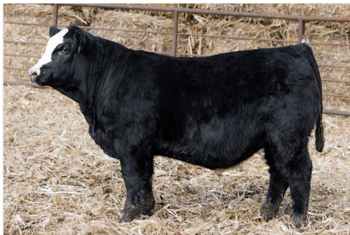
TSN BALD EAGLE N845 Sells as Lot 58.

If you're looking for a baldie, here he is. This one caught our eye all summer. We used quite a bit of Bald Eagle last year and were impressed by the performance of his calves.