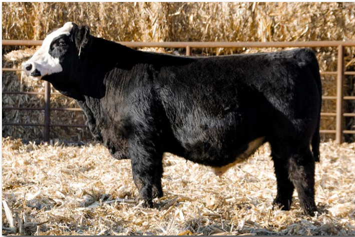
RT9 BALD EAGLE N268 Sells as Lot 61.

Another high performing blaze-face. Ratioed 111 at weaning to rank 1st of 13. He combines the growth of Bald Eagle with the genomic power of Beacon.