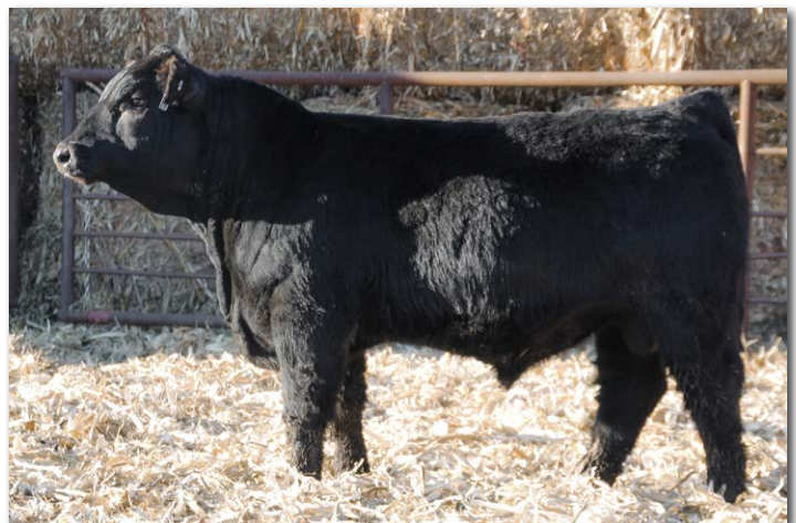
TSN BOLD RULER N332 Sells as Lot 41.

The top API bull in the offering combined with top tier calving ease. The Bold Ruler sons have been one of our favorite sire groups.