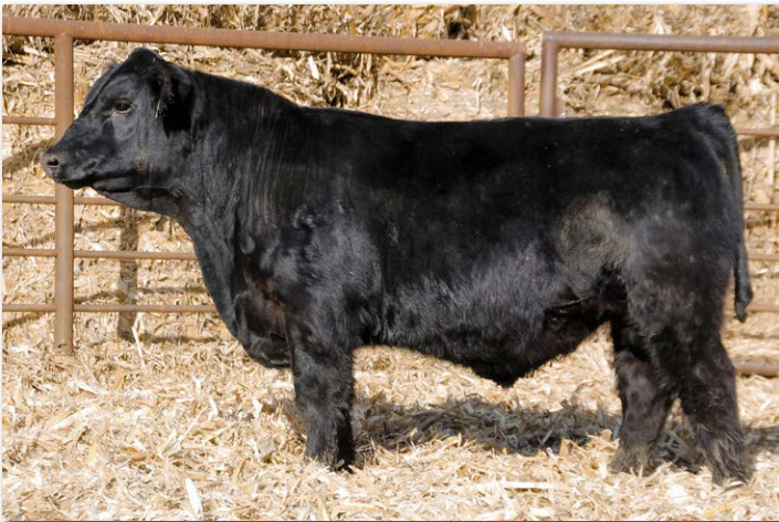
TSN NEVER SAY NEVER N113 Sells as Lot 38.

Ranking in the top 4% for both API and TI, combined with a 4lbs.+ on his average daily gain.