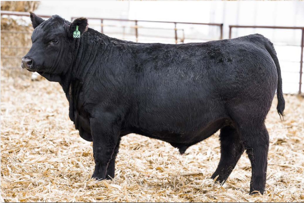
TSN ICONIC N356 Sells as Lot 2.

LOT 2 TSN ICONIC N356 1/2 SM 1/2 AN Hetero Black Homo Polled ASA #4564185 N356 BD: 1/26/2025