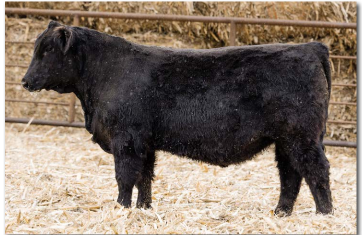
TSN GUARDIAN N740 Sells as Lot 28.

The Statesman full brothers. It would be hard to find a more uniform set. They're very similar both in phenotype and genotype. We've went back and forth all summer over which one is our favorite. Interestingly, unlike Statesman, they all earned the ATM logo.