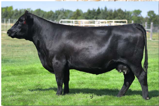
TSN MISS EAGLE H345 Dam of Lots 26-36.