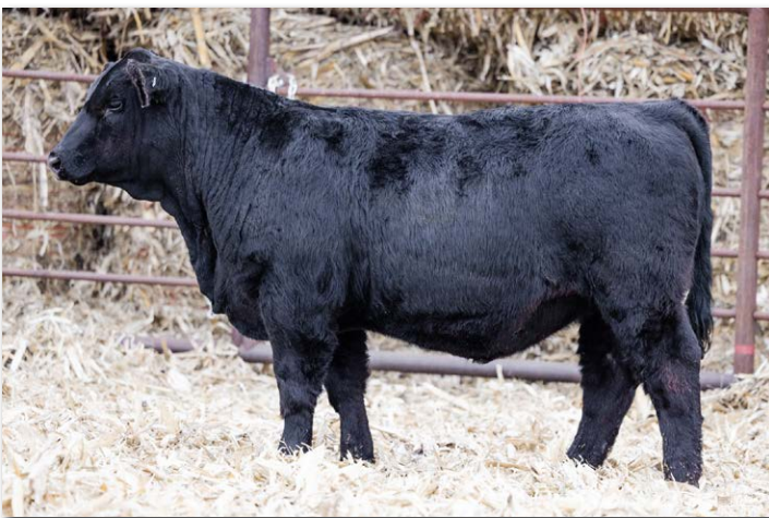
TSN STATESMAN N836 Sells as Lot 18.

These Statesman calves continue to impress us. This one comes out of a Bold Ruler daughter.