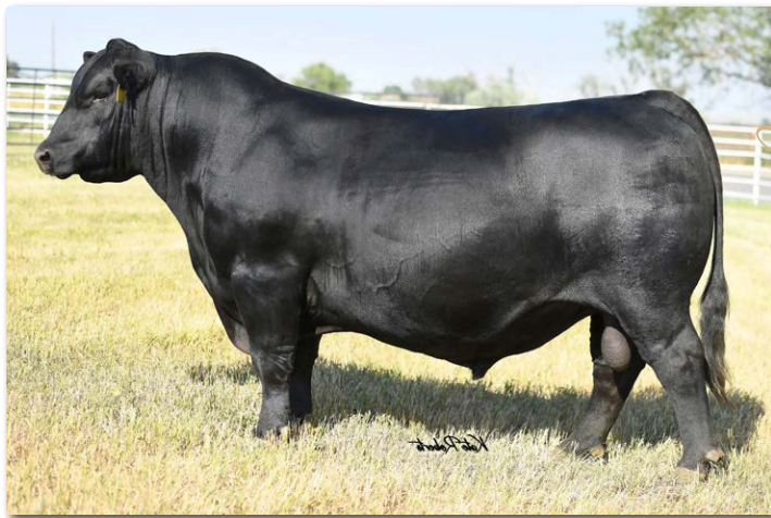
DB ICONIC G95 Sire of Lots 1-11.