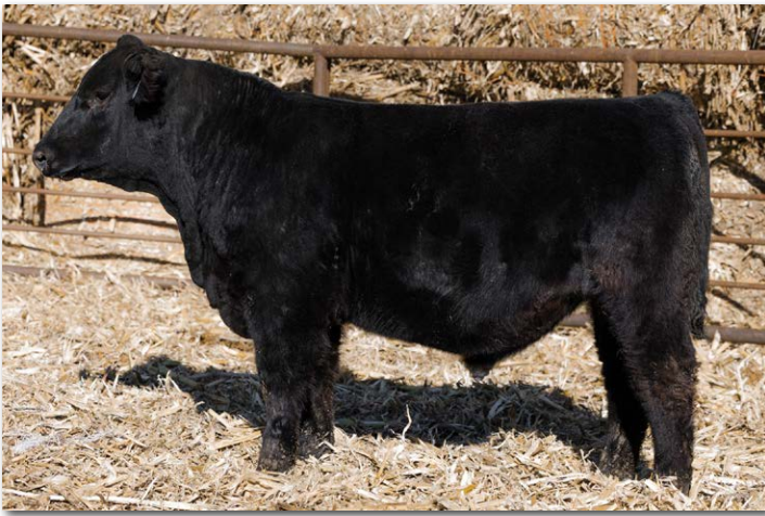
TSN STATESMAN N303 Sells as Lot 16.