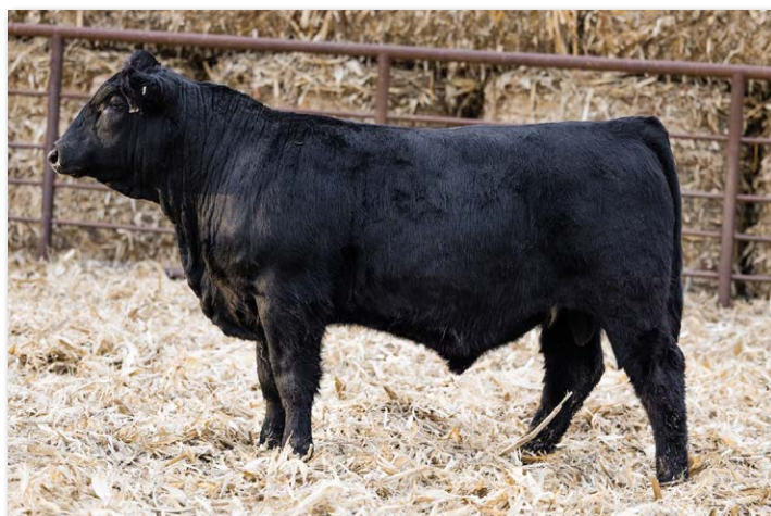
TSN RESOURCE N047 Sells as Lot 47.

We like the moderate frame and thickness of the Resource calves, and this bull has done a nice job post weaning.