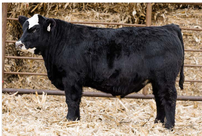
TSN BALD EAGLE N131 Sells as Lot 59.

This bull is out of one of favorite cows. She produced a top performing Genesis son and has a Bold Ruler daughter in the herd. This bull should add some color and style.