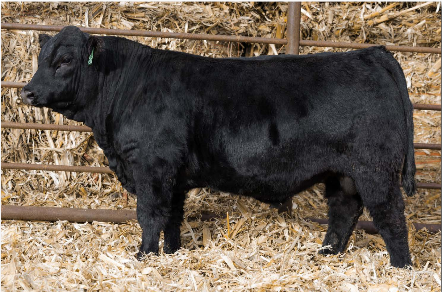
TSN NEVER SAY NEVER N340 Sells as Lot 36.