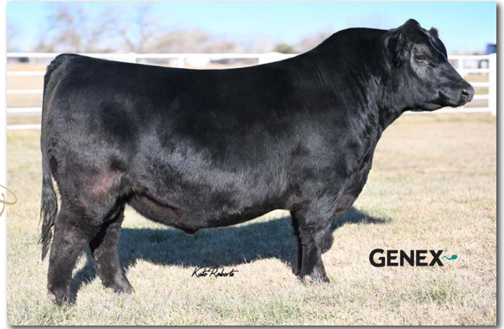
BSUM SUMMIT 303L Sire of Lots 48-51.