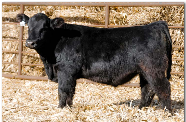
TSN GENESIS N566 Sells as Lot 34.

Statesman half-brothers, sired by Genesis. We were impressed that the H345 cow crossed so well with all 3 sires. Lot 34 is the calving ease, higher API bull, Lot 35 is the bigger, growthier ATM bull. We're excited to add 2 full sisters to these bulls to our herd.