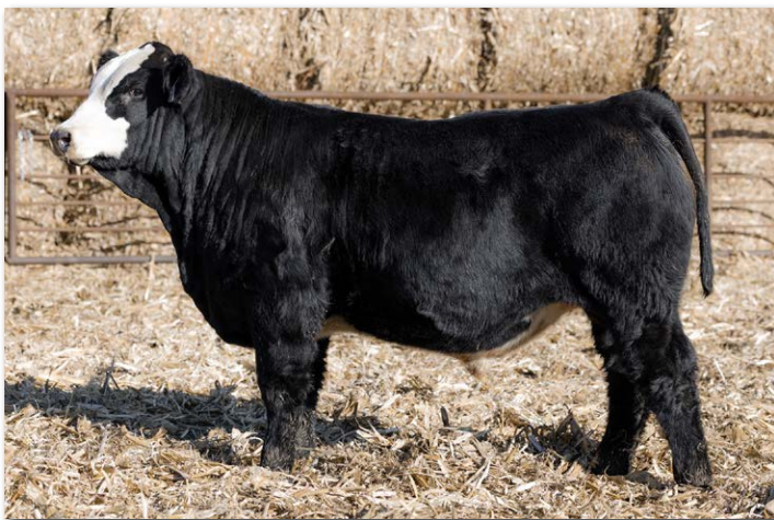
TSN BALD EAGLE N117 Sells as Lot 62.

TSN Bald Eagle has done a great job of making good looking calves for us. Our baldy N268 bull's a moderate soft bodied bull that we like his balance and look on.