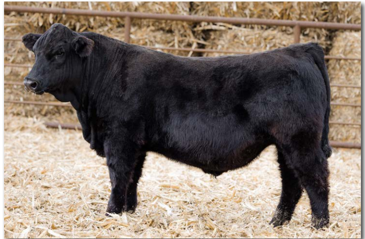
TSN ANTHEM N594 Sells as Lot 33.

The Anthem ET brothers out of Statesman's dam. Another uniform group with the exception of Lot 33, the bigger framed heavy gaining bull. These calves were a little younger and out of the older cow group.