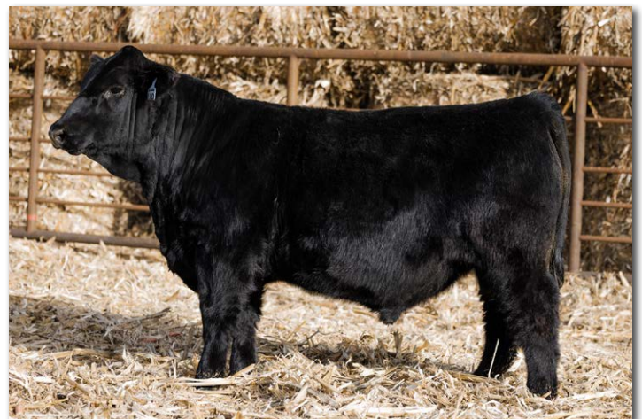
TSN GUARDIAN N110 Sells as Lot 29.

The Statesman full brothers. It would be hard to find a more uniform set. They're very similar both in phenotype and genotype. We've went back and forth all summer over which one is our favorite. Interestingly, unlike Statesman, they all earned the ATM logo.