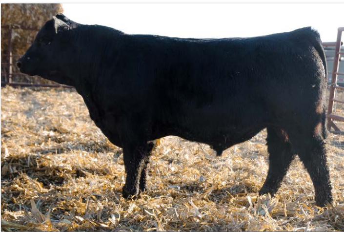
TSN ICONIC N606 Sells as Lot 8.

One of the younger bulls. Out of a full sister to Architect's dam.