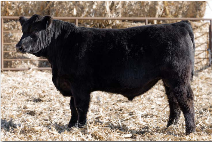
TSN STATESMAN N355 Sells as Lot 17.

Another big, growthy bull that ratioed 112 at weaning. Moderate birth weight out of a 2-Year-old Jurisdiction daughter.