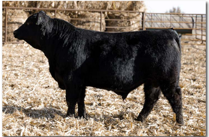
TSN ICONIC N745 Sells as Lot 10.

A top performer here. Ranked 1st of 14 for a 121 weaning ratio and continued that growth streak at over 4.5 lbs./day. Dam has had 6 calves with an average weaning ratio of 109.