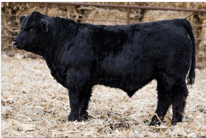
TSN UNDISPUTED N947 Sells as Lot 44.

A younger bull, sired by Global, the full brother to Bold Ruler. Top 10% for WW, YW, and ADG EPDs.