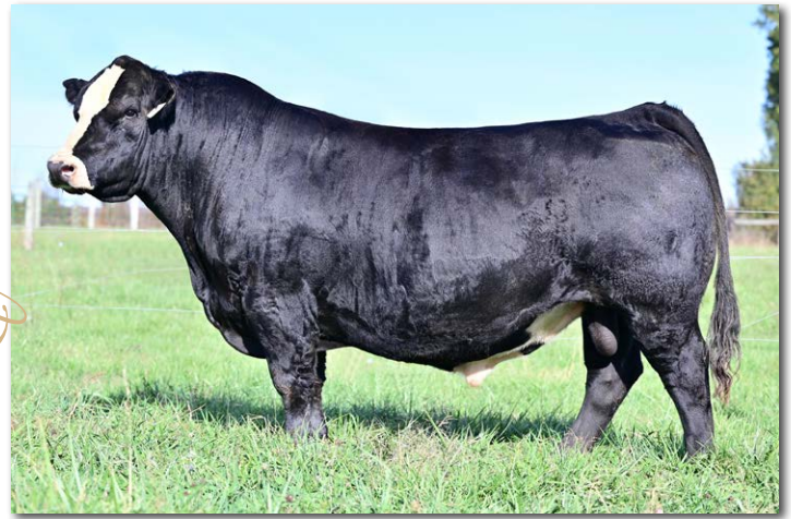
LCDR ANTHEM 33K Sire of Lots 30-33.