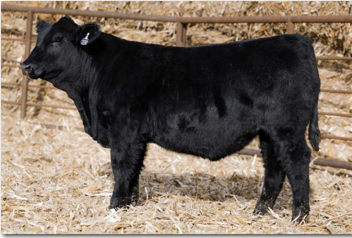
TSN GENESIS N610 Sells as Lot 35.

LOT 35 TSN GENESIS N610 GGP Homo Black Homo Polled PB SM ASA #4564215 N610 BD: 3/25/2025