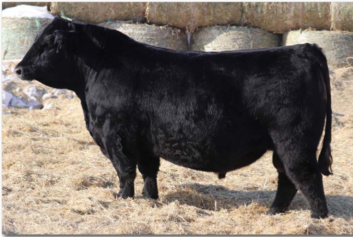
TSN STATESMAN K006 Sire of Lots 12-25.