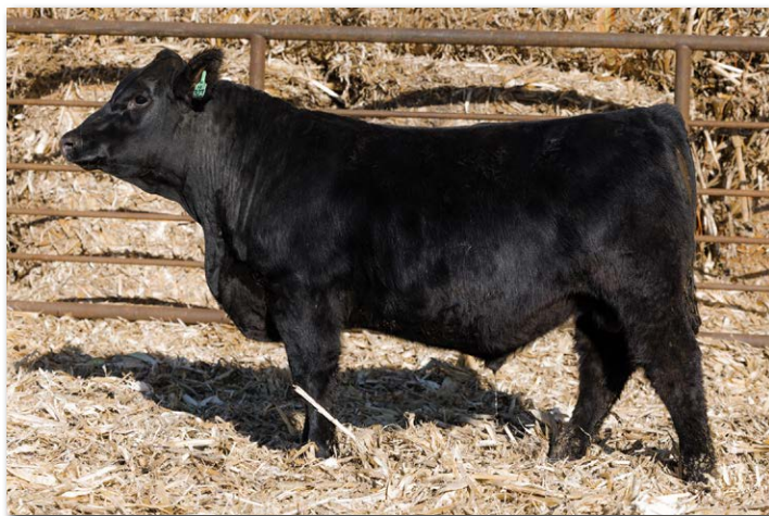
TSN SUMMIT N323 Sells as Lot 49.