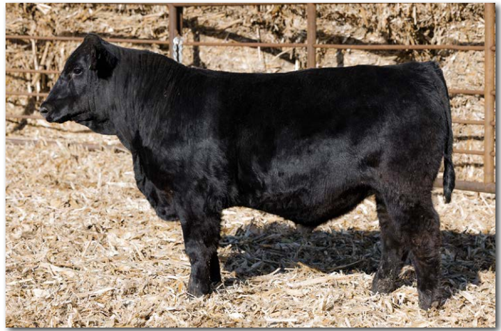
TSN NEVER SAY NEVER N349 Sells as Lot 39.

A high gaining, ATM bull that combines the top carcass traits of Never Say Never with the growth of Genesis.