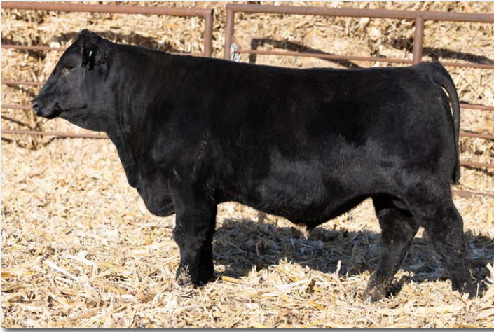
TSN ICONIC N311 Sells as Lot 6.