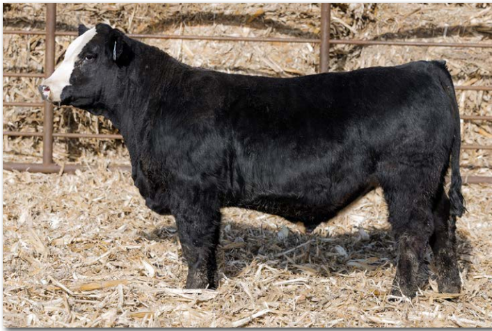
TSN BALD EAGLE N015 Sells as Lot 60.