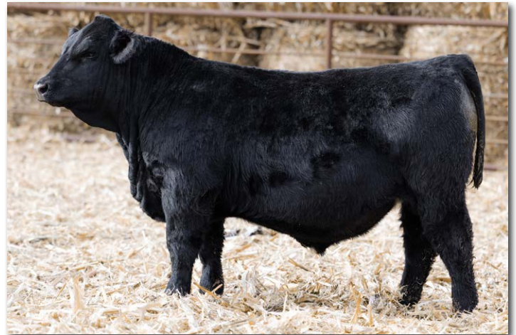
TSN STATESMAN N313 Sells as Lot 14.

This guy started pretty small, but that didn't slow him down. He's more moderate frame, but he's stout and still ranks in the top 4% for weaning and yearling EPD.