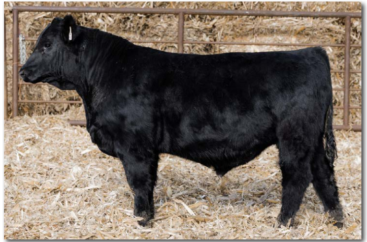
TSN STATESMAN N211 Sells as Lot 19.

Out of a High Security daughter that really seems to click with Statesman. Her first calf, a heifer, ratioed 117 at weaning to rank 3rd of 16. This full brother ratioed 119 to rank 1st of 29.