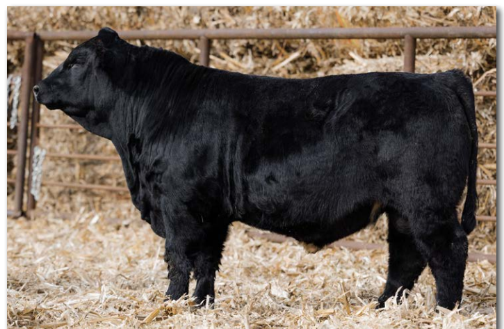
TSN STATESMAN N336 Sells as Lot 15.

A bigger framed bull here. A 3/4 brother to last year's high seller, TSN Commandment, we like the Statesman x Genesis cross.