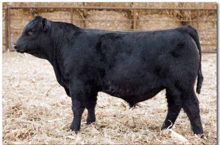
TSN ICONIC N217 Sells as Lot 11.

Iconic on an Eagle sired cow. 4th highest post weaning gain. What a set of feeder calves he would make.