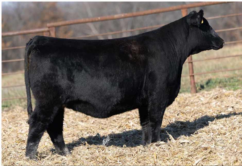
DRAKE MISS K177M Sells as Lot 78.

Outstanding Jackson heifer Aled to FHCC Majority due 2/15. Her bull calf's planned mating API 186 and TI 109. Top 2% and top 1% of the breed.