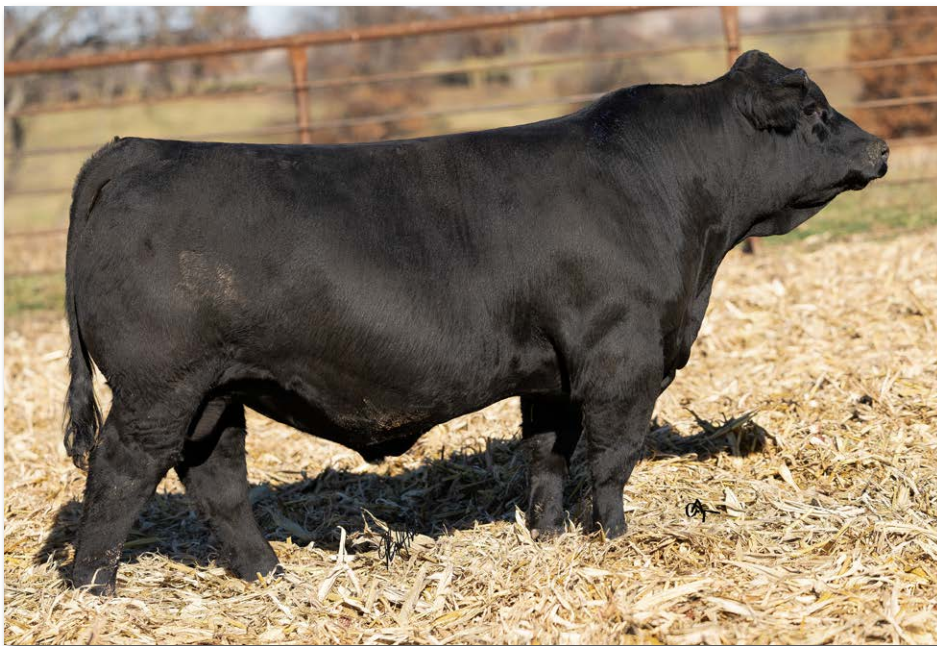
IRON CREEK CEASAR 95N Sells as Lot 59.

We purchased Caesar's dam from Schooley Cattle Co. at their 2025 sale as the $12,000 high selling bred female. She was bred to Kodiak and from that mating produced this meat machine. Top 10% in all growth categories, top 10-20% in milk, maternal weaning and Stay and top 20% marbling. A commercial cattlemen or women's answer.