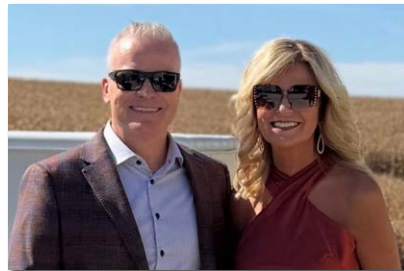
Iron Creek Cattle Co.