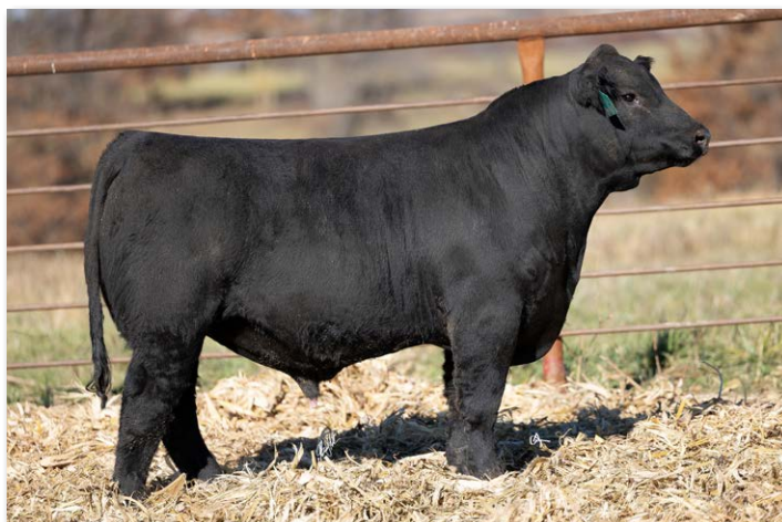
IRON CREEK G959N Sells as Lot 24.