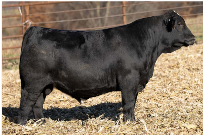
IRON CREEK OLD TOWN ROAD E043 Sells as Lot 14.