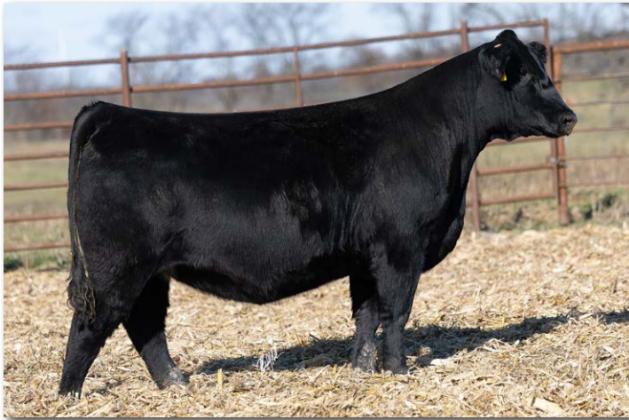
DRAKE MISS K30M Sells as Lot 87.