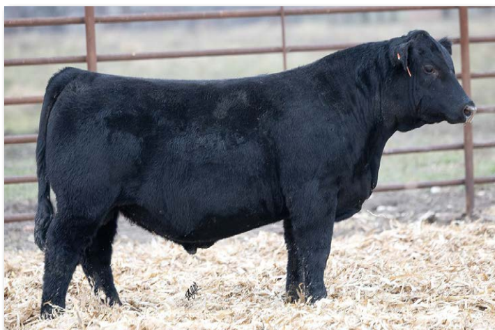
IRON CREEK BUILT DIFFERENT 34M