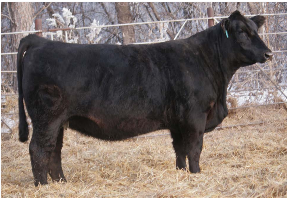
KBHR MATRON OF HONOR F202 Dam of Lots 16, 17.

Prowess, for use on cows only, carries the same broad base of excellent EPDs as his brother and is especially strong on carcass with top 3% marbling and ribeye area with top 1% carcass weight.