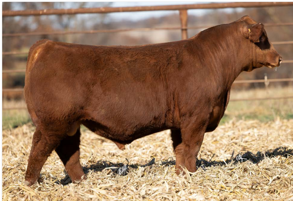
IRON CREEK RED HOOK J040M Sells as Lot 18.