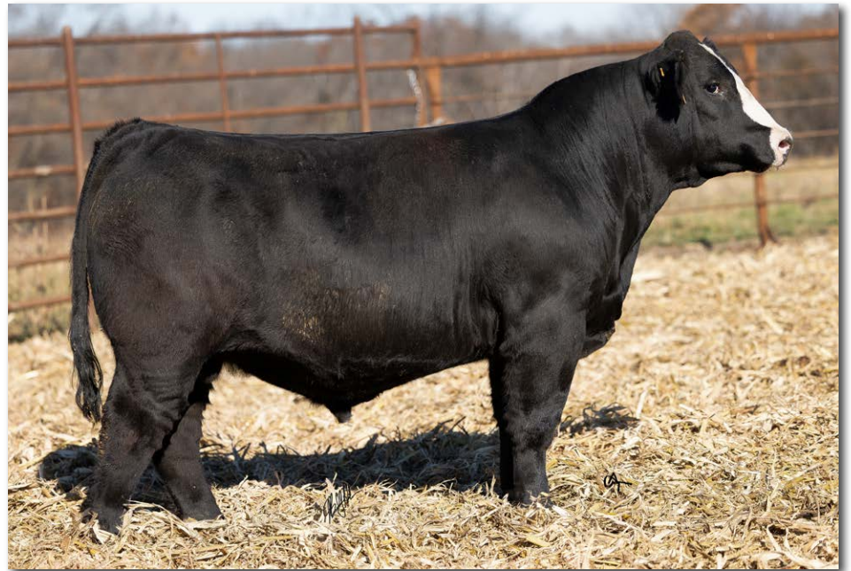
IRON CREEK SICARIO J037M Sells as Lot 16.

At eight years of age Matron remains youthful, maintains an excellent udder, breeds back on the first breeding each year and acts as the herd matron- keeping an eye on all the calves. She just doesn't miss. Sicario carries that excellent Matron look with outstanding growth (top 4-5%), maternal (top 2-25%) and carcass (top 1-10%) with a top 5% All Purpose Index and top 3% Terminal Index. An outstanding purebred bull for use on cows.