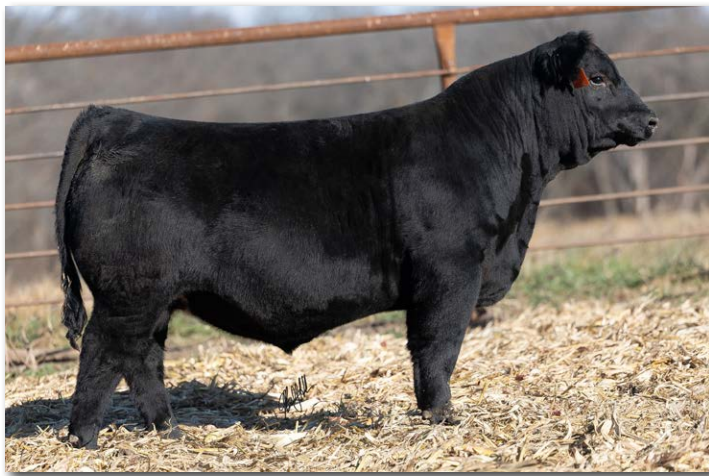
HARLAN BULL K76N Sells as Lot 49.