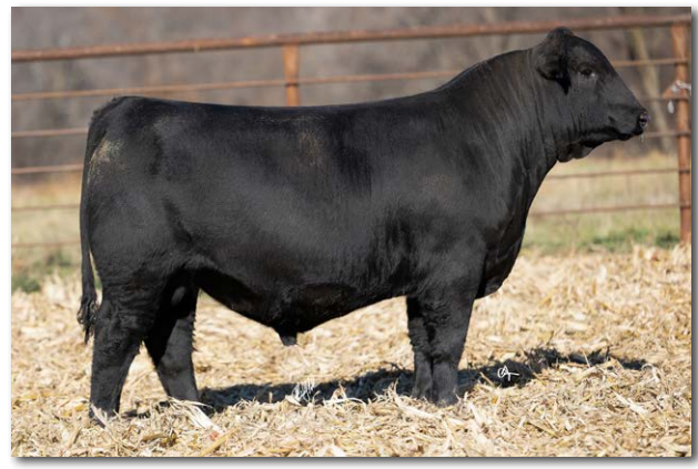
IRON CREEK 20N Sells as Lot 36.