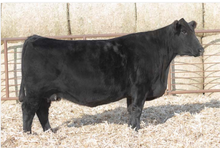
HOOK'S CRYSTAL 1C Dam of Lots 20-22.