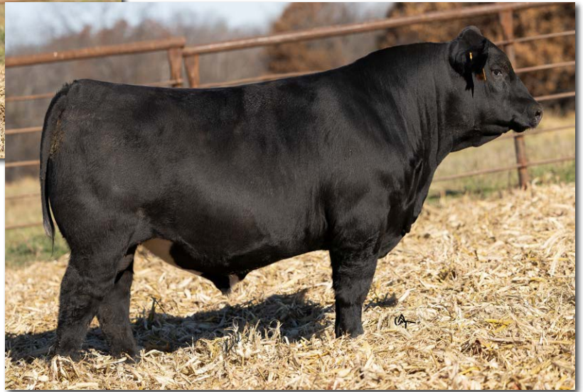
IRON CREEK ZION H003M Sells as Lot 8.