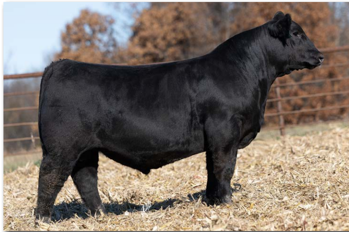
IRON CREEK L107N Sells as Lot 43.