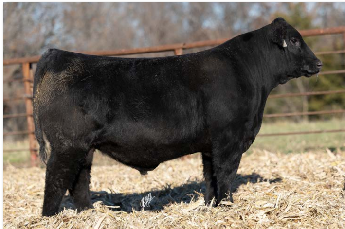
DRAKE BULL F136N Sells as Lot 64.

A Most Wanted son out of a tremendous purebred Angus cow sired by Silveiras Style. Sure like the way this guy is put together and his EPD shows him in the Top 15% for CE. A weaning weight of 768 with a yearling weight of 1453.