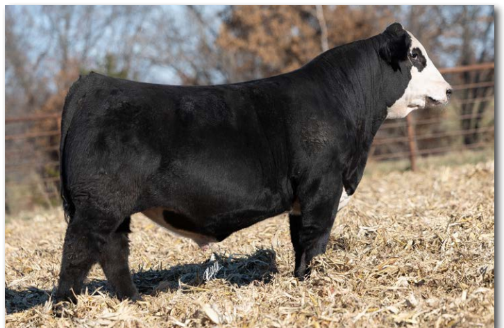
DRAKE BULL F390N Sells as Lot 6.