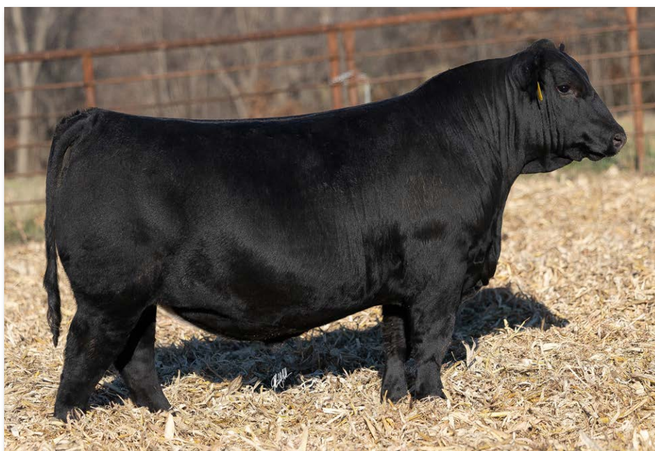
DRAKE BULL L185N Sells as Lot 3.

A favorite Jackson son. A favorite because of his combination of phenotype, EPDs and Performance. He has that rare combination of great CE, Top 10% and great performance with WW, YW, and ADG all in the Top 10%. Also tops in his own performance with a WW of 743 and YW of 1589.