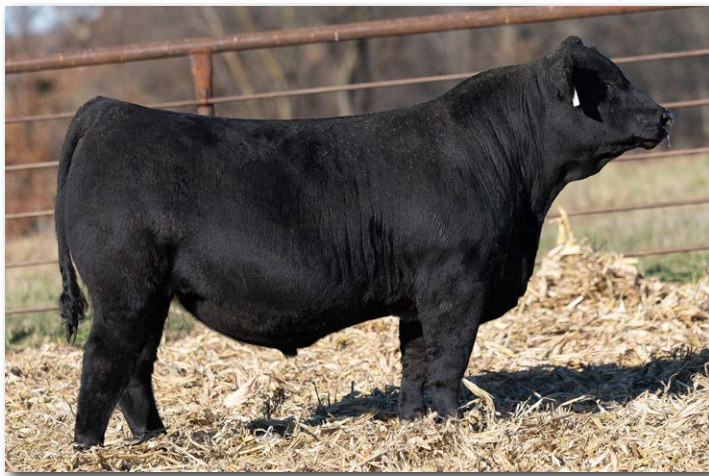
DRAKE BULL D104N Sells as Lot 25.