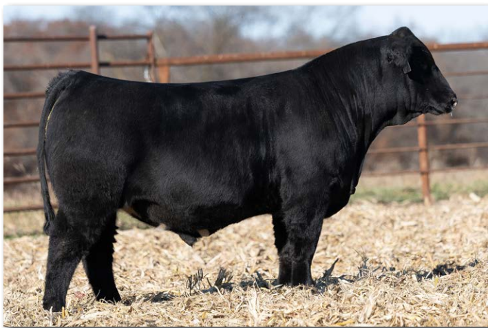
DRAKE IC J93N Sells as Lot 45.