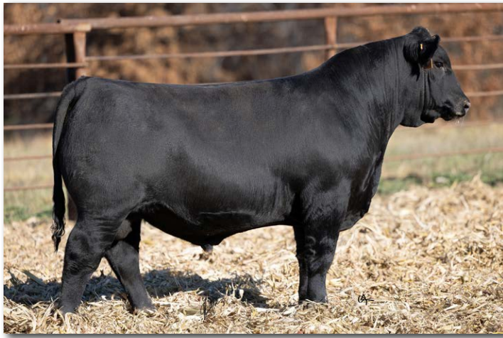
IRON CREEK 4427M Sells as Lot 72.