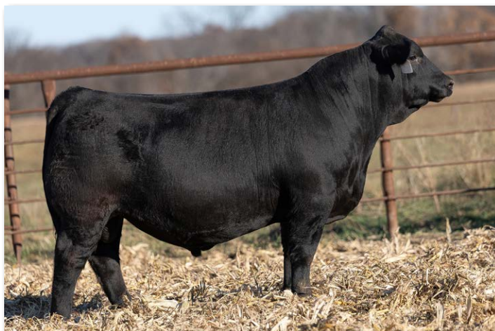
DRAKE BULL G27N Sells as Lot 23.