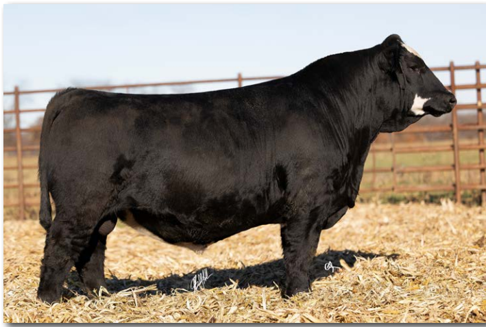
K73M Sells as Lot 60.