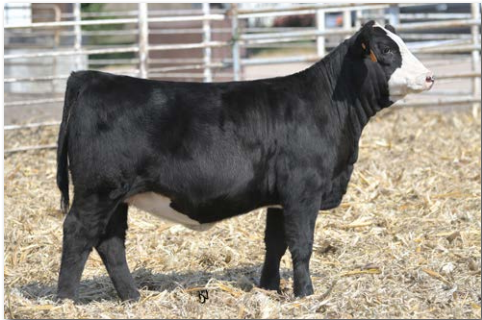
TJ 20H Dam of Lot 75.