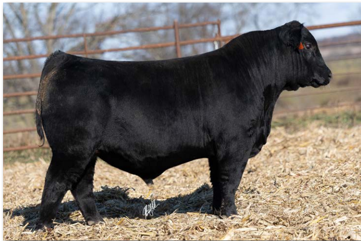
HARLAN BULL C44N Sells as Lot 50.