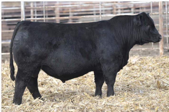
CCR SPEAK NOW 6178G