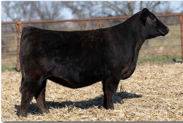
DRAKE MISS H765M Sells as Lot 86.