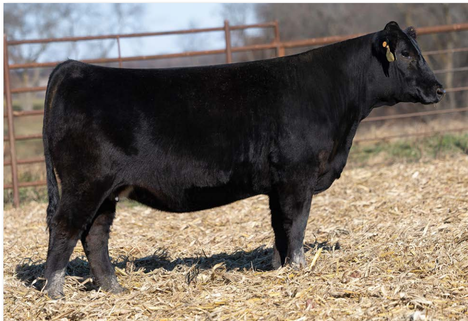
IRON CREEK MARY A37M Sells as Lot 85.

Another outstanding Matron daughter, this one sired by the commercial power bull, Genesis. Mary combines a top 15-20% growth EPD set with top 10-20% maternal traits, top 1% marbling and 3% ribeye and a top 2% API and top 1% TI. Elite balance across all traits combined with an attractive look and near perfect neck and shoulder structure. AI to Mason Landmark May 12. Due 2/10 with a bull calf. Pasture exposed to Built Different.