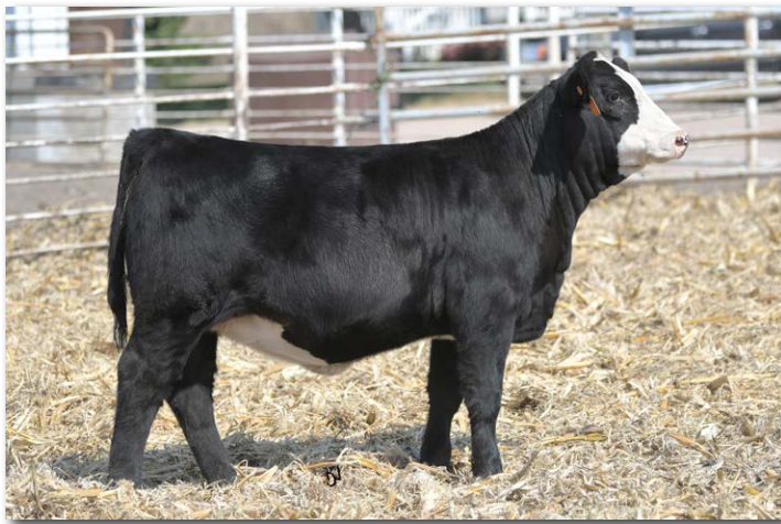
TJ 20H Maternal grandam of Lots 38, 42.