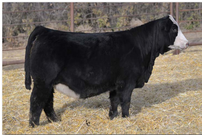
LCDR MS JETTA 93J Dam of Lot 45.