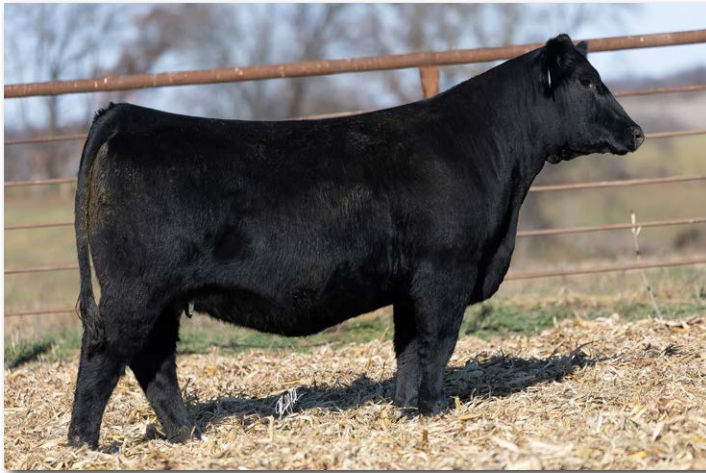
DRAKE MISS G107M Sells as Lot 80.

Love this heifer from our favorite angus base family. What a cow family: Jackson, Platte River, Silveiras Style to the $25,000 Hotz Elsa out of Cherry Knoll Elsa 8014. Her Knockout bull calf will be fun due 3/10.