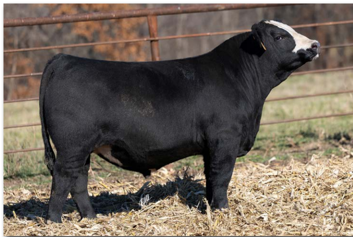
IRON CREEK TURNING POINT 12N Sells as Lot 15.