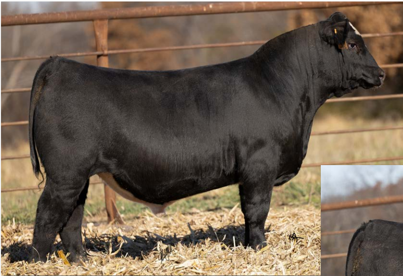
IRON CREEK RUTHLESS 9449M Sells as Lot 7.