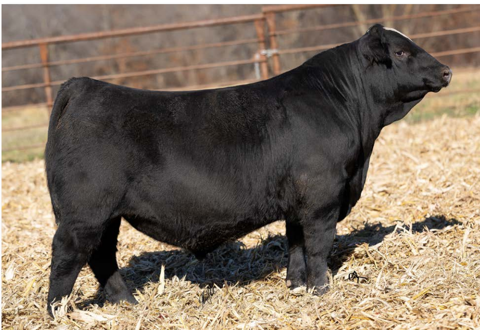
IRON CREEK BIGG SWIGG H012M Sells as Lot 12.

Bigg Swigg is perhaps the most intriguing bull in the flush and the deepest bull we have ever raised. Need some growth? Bigg Swigg is the growth king of the flush with elite top 1% weaning, yearling and average daily gain as well as top 1% $GN, all with a top 30% calving ease, top 1-25% maternal traits and top 2% carcass weight and 3% marbling. This all adds up to a 184 All Purpose Index and a whopping 113, top 1% Terminal Index. This bull will raise massive weaning weights AND productive, high growth daughters. Gained 5.75 pounds per day on 60 day test.