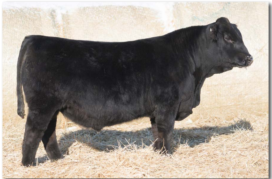
HA KNOCKOUT 2K Sire of Lots 43-48.

Big spread genetics is what the Knockout sons will provide to potential bull buyers. The cattle come light and explode thereafter for growth. The bulls combination of STAY and marbling places them in rare air amongst purebred bulls in the IGS database. Likewise, if you need to improve docility the Knockouts will be perfect candidates.