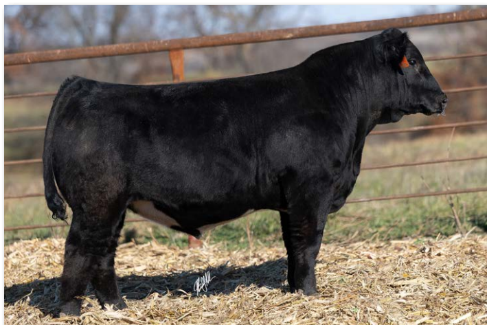
HARLAN BULL B811N Sells as Lot 56.