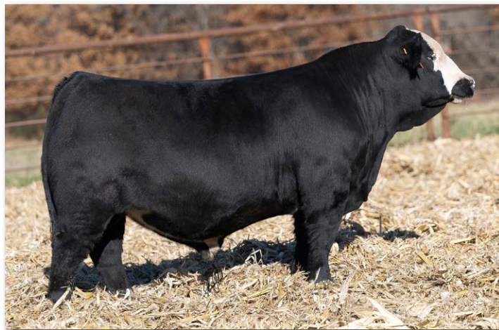
IRON CREEK QUANTUM 3325N Sells as Lot 13.