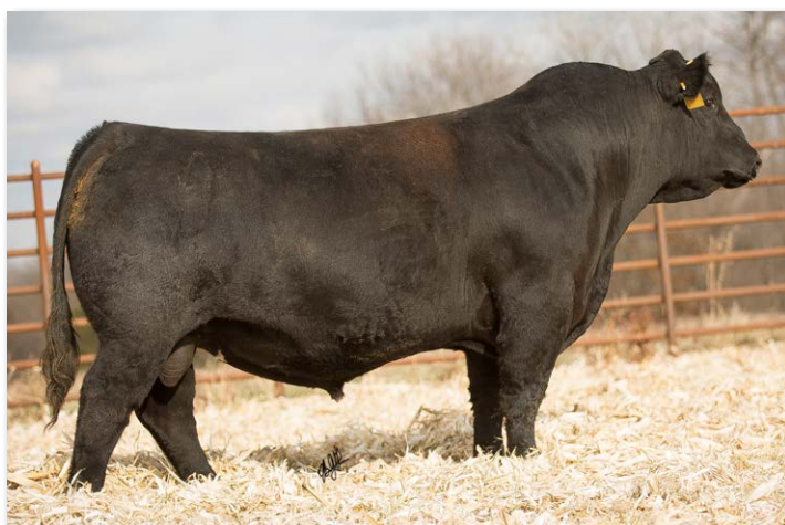
TJ BONAFIDE 647H