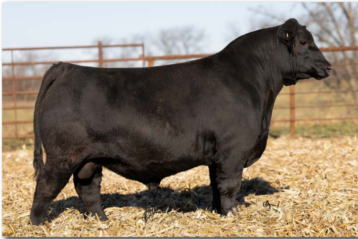
IRON CREEK DEADWOOD 9827M Sells as Lot 69.

This Deadwood x Blackbird son is unbelievable- a powerful fall bull with just a special look and broad based excellence in his EPD profile-top 20% calving ease with top 2% gain, top 10-25% in maternal traits and top 1% marbling and carcass weight. Blackbird does not miss and this will be one of the last opportunities to buy Blackbird genetics. Buy with confidence.