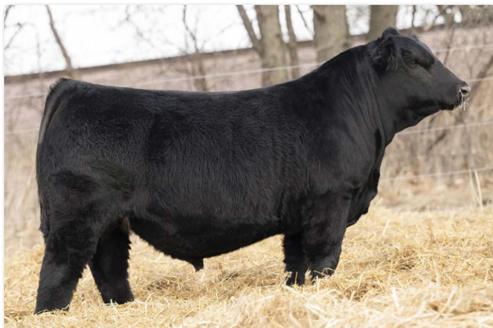
FIVE STAR JACKSON J10