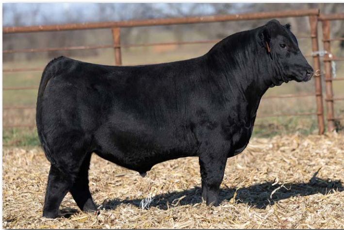
HARLAN BULL B69N2 Sells as Lot 55.