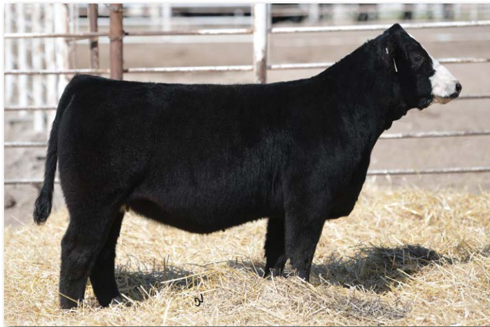
TJ 954G Maternal grandam of Lot 62.