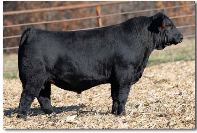
HARLAN BULL K3N Sells as Lot 34.