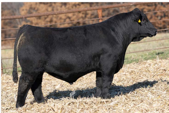
DRAKE BULL L954N Sells as Lot 62.

773M is out of an outstanding Eagle daughter we purchased from Triangle J and by dad's Bonafide bull. This bull is bred for growth and this is verified with his top 3% weaning weight and yearling weight EPDs. An excellent bull from a cow that produces a good one every year.