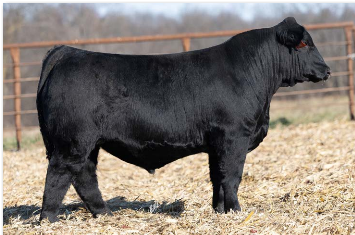
HARLAN BULL K26N Sells as Lot 31.