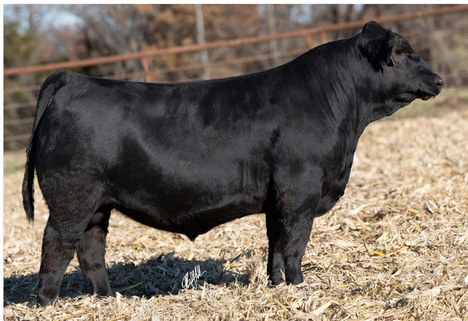
DRAKE IC L20N Sells as Lot 42.

Don't miss this guy- his dam is a stunning Jackson daughter out of our full sister to the stud bull TJ 50K and is sired by the Drake Simmental female maker, HA Knockout. An outstanding phenotype with superior balance and strength in his genomically enhanced EPDs-top 20% calving ease, top 25% birthweight, weaning weight, yearling weight, and average daily gain. Knockout transmitted his maternal strength as L20N is in the top 5% for Stay and Milk and 10% for maternal calving ease and maternal weaning weight with a top 15% docility. His numbers round out with a top 4% marbling, 3% All Purpose Index of almost 180 and a top 5% Terminal Index. This seedstock quality bull will work for virtually any breeder to produce outstanding females and animals that will perform in the feedyard and on the rail. Owned by Drake Simmental and Iron Creek.