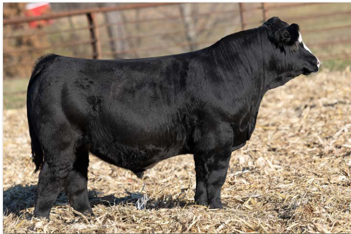
DRAKE BULL K158N Sells as Lot 38.