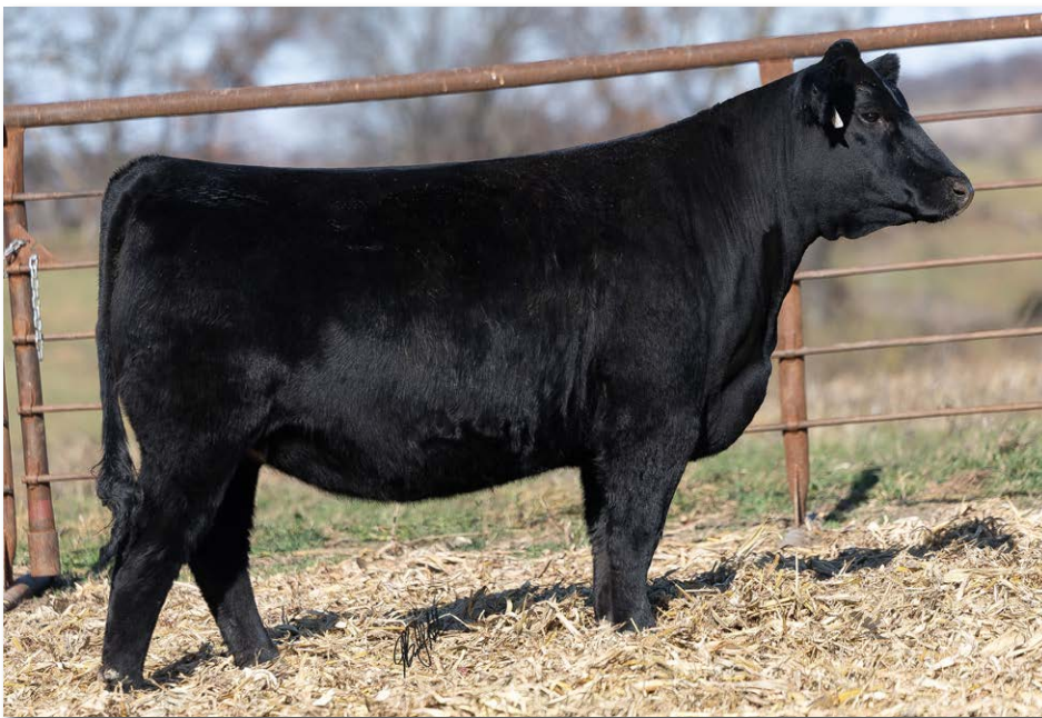
DRAKE MISS F33M Sells as Lot 76.

Mating to Limitless could be a homerun. F33M comes from the great JS Dolly 33X cow family. We really like our Limitless calves. Sells bred to ES Limitless due 2/22 with heifer calf.