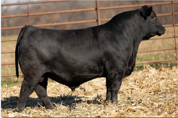
IRON CREEK SURPASS 3296M Sells as Lot 70.

This bull's sire, BJ Surpass, is an Angus breed-leader for maternal and foot strength-and this bulls shows it. 3296M has as good a set of EPDs as you will find-with top 10-15% calving ease and growth traits and top 1-5% maternal traits. And look at him! Outstanding phenotype- the type of bull you are proud to have in your pasture- and he is an age advantaged fall bull!