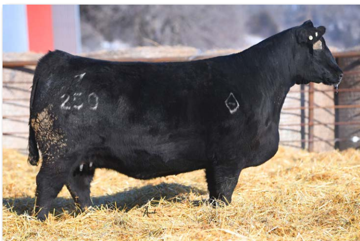
MONTANA BLACKBIRD 7250