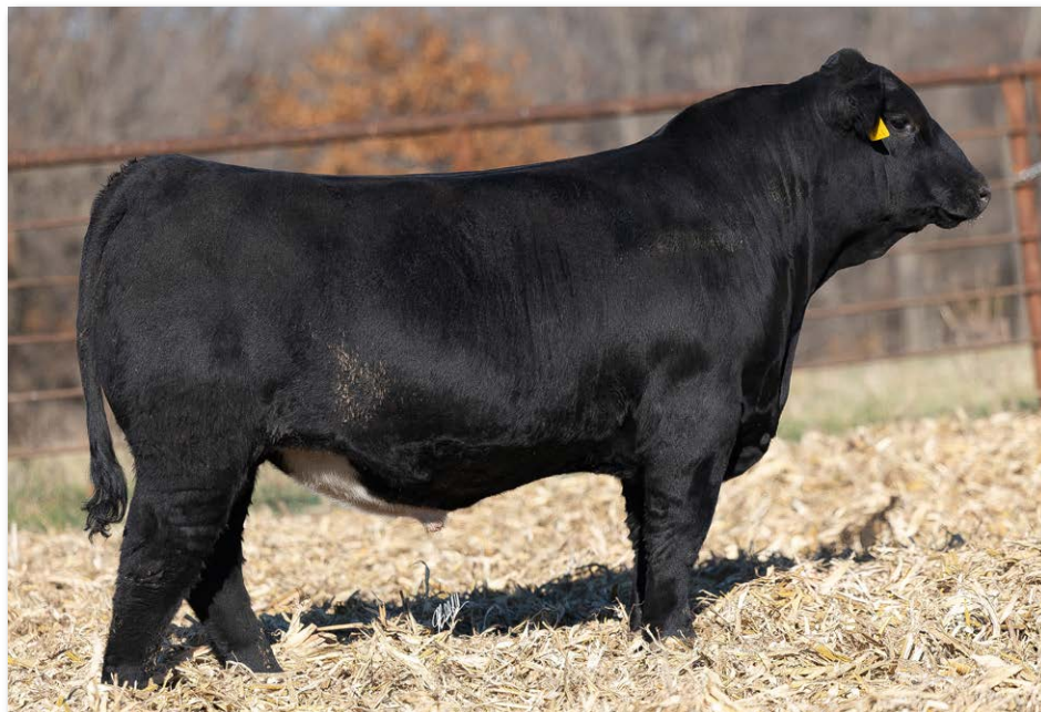
DRAKE BULL L136N Sells as Lot 2.

One of those bulls that brings everything together in one beautiful package. We will start with his own performance: BW 79 lbs, WW 848 lbs, ADG 5.32 lbs, and YW 1689 lbs. He is our Top WW bull, a new top yearling weight bull in our over 70 years in the business. Sired by the $65,000 Five Star Jackson and dam by the great TJ Bonafide. Maternal Granddam a purebred Angus by Silveiras Style 9303. For sure one of our favorite cow families of all time. Now his EPDs: WW 105.5 - Top 1%, YW 161.6 - Top 3%, ADG Top 15%. Maternal EPDs: Milk Top 4%, MWW Top 1%, Sensible CE, excellent CW and Marb. Look N136N over and you will see a big volume, deep ribbed, heavy muscled bull. Excellent on his feet and legs and easy on the eyes. Raised by a two year old heifer with no creep feed. Think what he can do for your program.