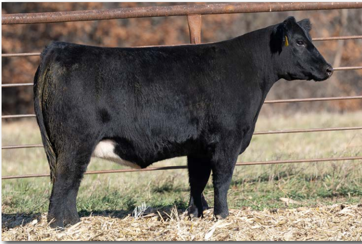
DRAKE MISS K207M Sells as Lot 79.