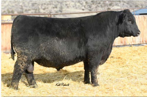
BASIN KEYSTONE 2021 Sire of Lots 67, 68.

Another outstanding Keystone x Blackbird son- outstanding EPDs across the board and outstanding to look at on the hoof- these bulls are just can't miss guys!