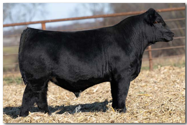
HARLAN BULL K69N Sells as Lot 33.

A Jackson son that is good fronted and smooth made. If you are looking to make some females I would think this guy could do just that for you.