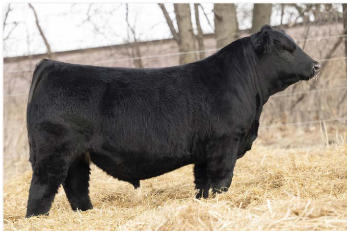
FIVE STAR JACKSON J10 Sire of Lot 74.

A sale feature without a doubt, K904M represents what we love about the Jackson females. Strong top line, soggy depth of body, outstanding shoulders and neck and moving on sound feet and legs. We purchased the grandmother 904G at Triangle J several years ago and her Eagle daughter, 904M's dam, is a thing of beauty that will be in our herd for a long time to come. 13 traits in the top 35% of the breed. Depth of pedigree to match her royal look. AI May 7 to Ruby Quadrant. PE to Knockout. Due 2/23 with bull calf.