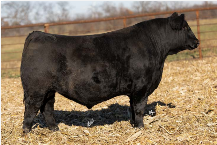
IRON CREEK MR JACKSON C006M Sells as Lot 21.