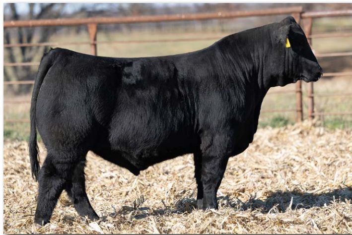
DRAKE BULL L404N Sells as Lot 63.