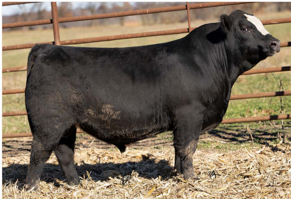
IRON CREEK HIGH TIDE E042M Sells as Lot 9.

High Tide brings growth and more growth- top 2% weaning weight and 1% yearling weight and average daily gain in an attractive Sim-Angus package His strong carcass and Index numbers complement a reasonable calving ease-an outstanding commercial bull. Gained 6.73 pounds on 60 day test.