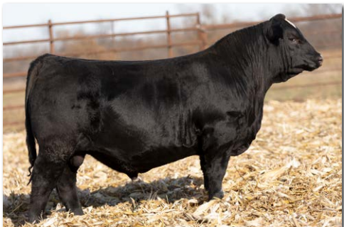
J76L Full brother to Lot 58.

The full brother to the $32,000 Drake Power Cat. With 12 EPD numbers in the top 30% and WW of 720 and a YW of 1388 he will do the job. Remember, none of these bulls ever had creep feed.