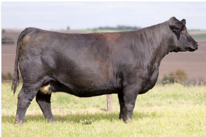
TJ MISS 29B