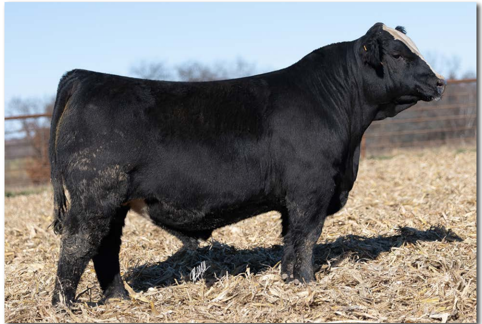
IRON CREEK AUDACITY 21N Sells as Lot 11.

Audacity brings an amazing combination of elite balanced numbers and elite looks to the offering. Top 25% calving ease with top 2-3% growth, 1% $GN, top 3-20% in every maternal trait, 2% carcass weight, 3% marbling with elite top 1% All Purpose Index and Terminal Index. RETAINING FALL BREEDING RIGHTS ON AUDACITY. Buyer receives spring breeding rights and 50% semen rights. Gained 6.25 pounds per day on 60 day test.