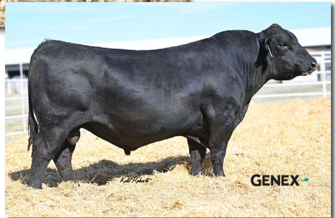
GIBBS 9114G ESSENTIAL Sire of Lots 83, 84.

LOT 83 IRON CREEK MATRON D033M ♂GGP Homo Black || Homo Polled PB SM 1/22/2024 D033 ASA# 4378540