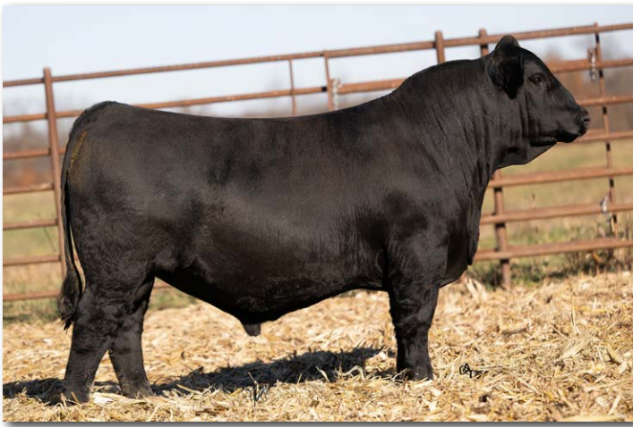
IRON CREEK RESPECT 8180M Sells as Lot 20.