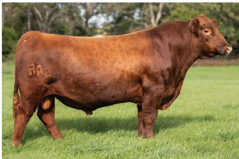
BIEBER JUMPSTART J137 Sire of Lots 18, 19.

Red Hook is a phenotypically pleasing and genetically powerful red Sim-Angus. His dam is a beautiful full sister to Five Star Jackson, the $65,000 bull we purchased with Drake Simmental from Five Star. We love the Jumpstart calves and the combination with Jazzy really hit. Excellent growth and maternal traits with a top 2% docility EPD and top 35% calving ease. A seedstock or commercial bull to be proud of.