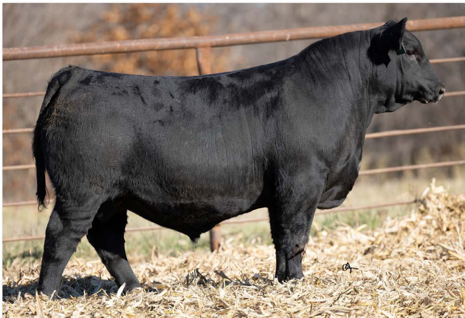
IRON CREEK 71N Sells as Lot 41.

71N combines the best of our genetics on both sides of his pedigree. Sired by the $65,000 Jackson, 71N is out of an Eagle daughter of the Montana Blackbird donor. A really nice bull with balanced EPDs across the board showing strength in all production areas.