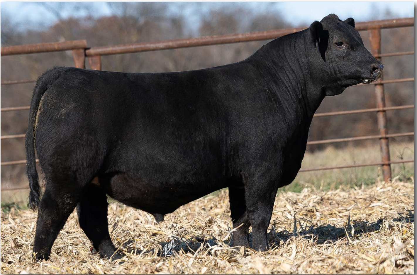
DRAKE BULL J207N Sells as Lot 1.