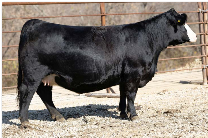
IRON CREEK MOXIE D68K

FOR REFERENCE | FIVE STAR JAZZY J14 Homo Black II Homo Polled PB SM 2/22/2021 ASA# 3947793