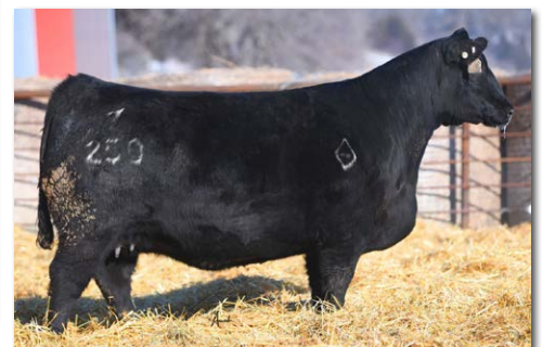
MONTANA BLACKBIRD 7250 Dam of Lots 67, 68.

In the past two years we have aggressively sought Angus sires with strong feet/claw scores as we have found foot issues to be a uniquely Angus issue. Basin Keystone is the 2023 Basin Angus top selling bull at $135,000 for two-thirds interest and he brings top foot scores along with outstanding EPDs across the board and a very practical, moderate frame to the equation. Dublin is representative of the Keystones we have seen-and benefits from his dam's strong genetic contribution. Look at the balance in his EPDs, top 20% calving ease and weaning weight, top 10% yearling weight, top 4% average daily gain, outstanding maternal traits of top 4% maternal calving ease, 5% milk and 10% maternal weaning weight, with top 2% carcass weight and marbling and strong API and TI Indexes. An excellent commercial bull.