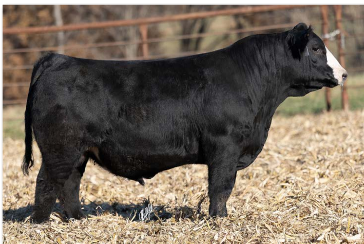
DRAKE BULL K76N Sells as Lot 57.