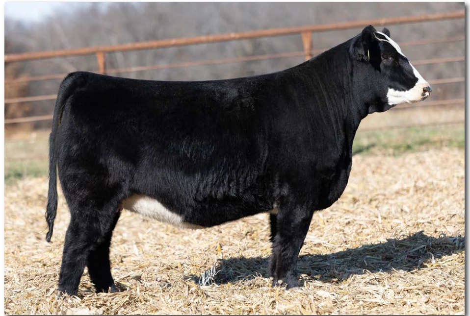
DRAKE MISS M5 Sells as Lot 75.

We are so proud of this year's heifer group. We pledged to continually offer more attractive females while maintaining or improving EPD profiles. M5 constitutes delivery on that pledge. One of the most attractive females we have ever raised, with pedigree and numbers to match. Sired by what we believe to be a new breed leader among female producers, the $65,000 Five Star Jackson, and out of a full sister to Triangle J's stud bull, TJ 50K, her pedigree is in rare air. But she isn't just a pretty face with a wealthy family- she has substance. Substance of body and substance of genetic potential, featuring 14 EPDs in the top 30% of the breed with balanced excellence from calving ease, to growth, to maternal, carcass and Indexes. A purebred donor female with unlimited breeding options. AI to Ruby Quadrant May 7. PE to HA Knockout. Due 2/23 to Ruby Quadrant.