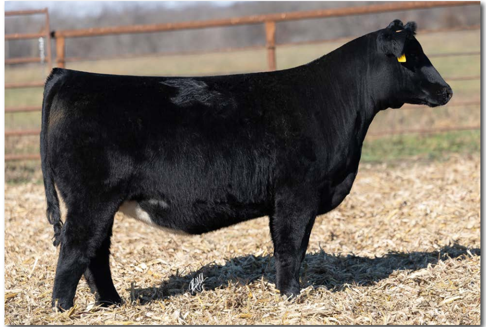
DRAKE MISS F21M Sells as Lot 77.

Jackson Heifer mated to the great Angus bull, Majority. Her heifer calf's planned mating API's 185. Sells bred to FHCC Majority due 2/15 with heifer calf.