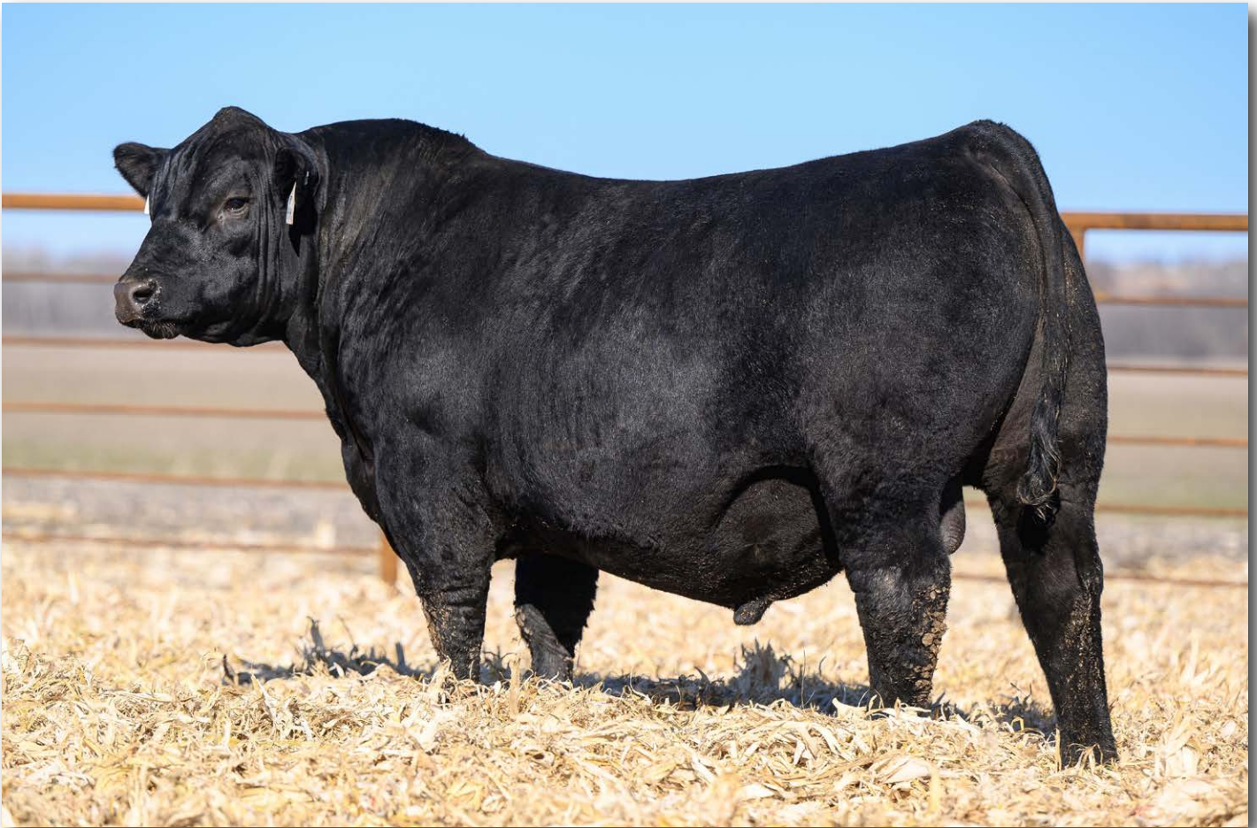
RVR HAYMAKER 414K Sire of Lots 4-6.

We received the River Creek Farms catalog a few years ago and I immediately stopped at the picture of Haymaker listed in the catalog. I studied his outcross pedigree and his numbers, along with his video, and immediately called dad. Dad saw what we saw. A bold, powerful beast with other-worldly growth. He was the perfect bull to put on our balance group of females to result in bulls with reasonable calving ease and unheard of growth, while maintaining strong maternal and carcass traits and a sound structure. Iron Creek and Drake Simmentals then teamed up to purchase Haymaker for $29,000. The bulls in this sale are the first to be offered by him anywhere and are from natural service on a breeding group. We have never been more impressed with an initial set of calves from any bull we have ever used (and those of you that know mom and dad know they have produced and purchased some of the best bulls in the Simmental breed for the past 50 years). We will not be selling semen on Haymaker and his genetics will be available exclusively from Drake and Iron Creek. Haymaker is in the elite top 1% in the entire breed for weaning weight, yearling weight and average daily gain.