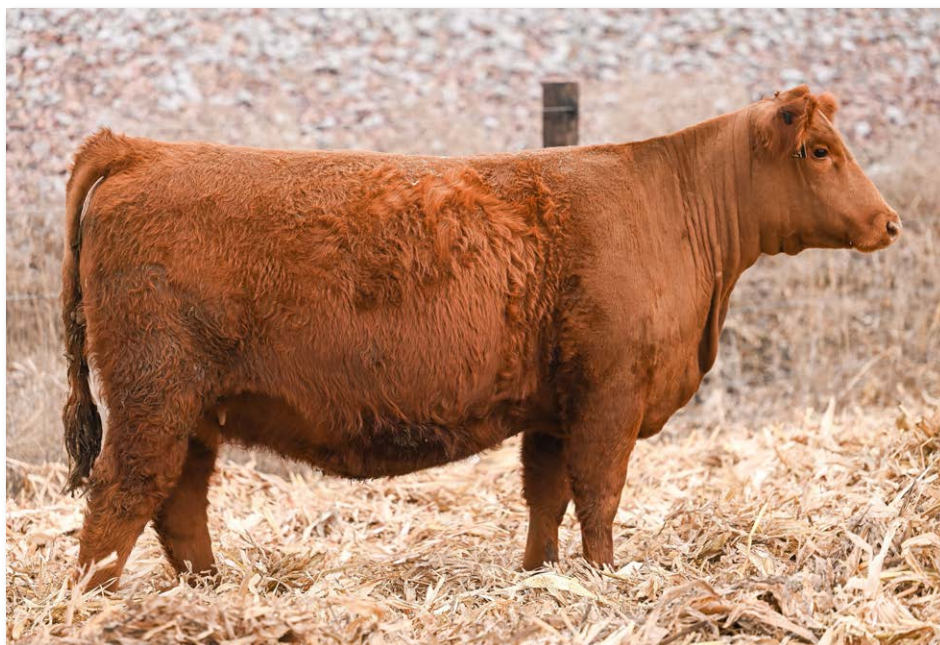
FIVE STAR JAZZY J137 Dam of Lots 18, 19.

A full brother to Red Hook with exceptional, balanced EPDs. Again, top 5-10% growth, top 10-15% maternal traits and good calving ease. If you are looking for a red bull, these boys will work.