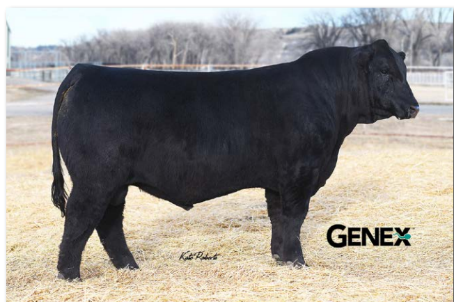
LBRS GENESIS G69 Sire of Lot 85.