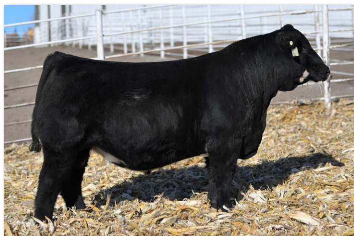
TJ WAR PAINT 759J