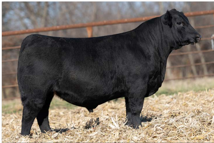
DRAKE BULL D499N Sells as Lot 26.