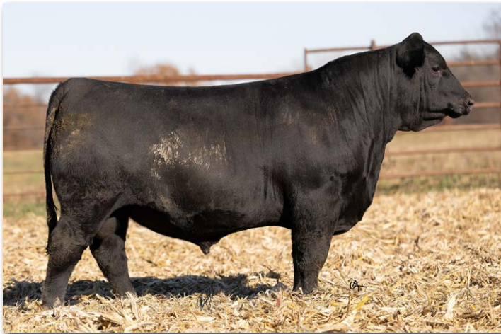
IRON CREEK BOSS 3253M Sells as Lot 71.

Another Keystone son and this one out of our Angus donor purchased from Galaxy Beef in Missouri. Boss is just that- top 2% gain with top 1% maternal calving ease, 5% milk and 4% maternal weaning weight and top 2% marbling-with a top 30% calving ease. He will produce calves that will perform in any segment of the beef industry- they will perform in the feedlot or your pastures- all will gain with the best in the world and his daughters will be outstanding cows.