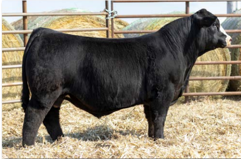
KBHR REVOLUTION H071 Sire of Lots 16, 17.