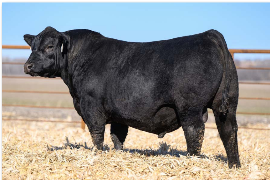
RVR HAYMAKER 414K Sire of Lots 23-30.