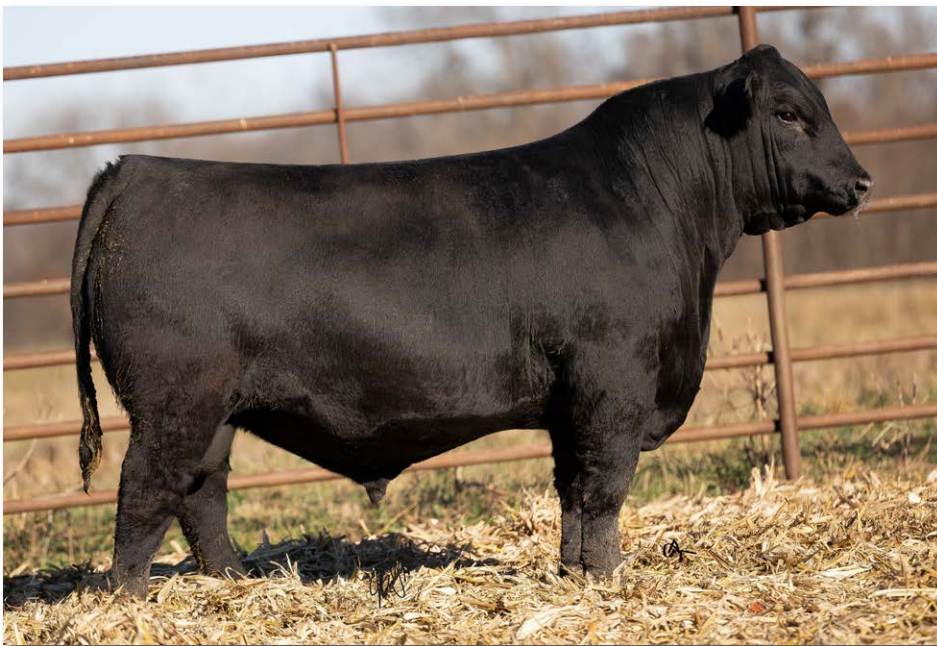
IRON CREEK DUBLIN 8192M Sells as Lot 68.

In the past two years we have aggressively sought Angus sires with strong feet/claw scores as we have found foot issues to be a uniquely Angus issue. Basin Keystone is the 2023 Basin Angus top selling bull at $135,000 for two-thirds interest and he brings top foot scores along with outstanding EPDs across the board and a very practical, moderate frame to the equation. Dublin is representative of the Keystones we have seen-and benefits from his dam's strong genetic contribution. Look at the balance in his EPDs, top 20% calving ease and weaning weight, top 10% yearling weight, top 4% average daily gain, outstanding maternal traits of top 4% maternal calving ease, 5% milk and 10% maternal weaning weight, with top 2% carcass weight and marbling and strong API and TI Indexes. An excellent commercial bull.