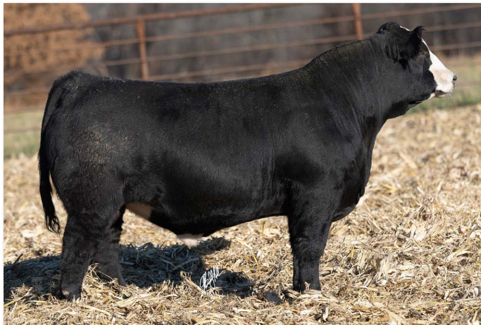
DRAKE BULL G954N Sells as Lot 4.