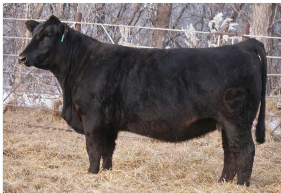
KBHR MATRON OF HONOR F202 Dam of Lots 83-85.

These three Matron daughters have donor potential. Matron of Honor has been our lead donor for over 5 years. She is the kind of female that produces outstanding seedstock and commercial bulls—we have sold over 40 bulls from Matron and have averaged over $9,000.00. She does everything right—breeds back on the first breeding each year, maintains great body condition year around, still has a perfect udder at almost 8 years of age and is an attentive mother. All with outstanding, across the board EPDs and a still top 2% All Purpose Index of 181.5. Crossed with Essential and Genesis she has created attractive, balanced females with unlimited breeding potential.