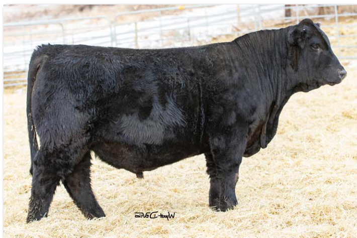
BSUM MOST WANTED 117J