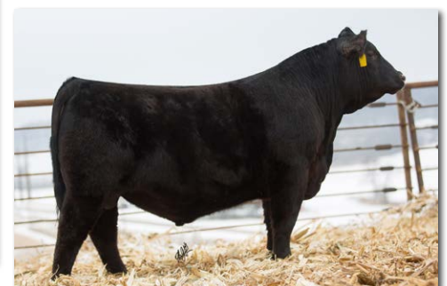
IRON CREEK HICKOK C44K Sire of Lots 11-15.

Bigg Swigg is perhaps the most intriguing bull in the flush and the deepest bull we have ever raised. Need some growth? Bigg Swigg is the growth king of the flush with elite top 1% weaning, yearling and average daily gain as well as top 1% $GN, all with a top 30% calving ease, top 1-25% maternal traits and top 2% carcass weight and 3% marbling. This all adds up to a 184 All Purpose Index and a whopping 113, top 1% Terminal Index. This bull will raise massive weaning weights AND productive, high growth daughters. Gained 5.75 pounds per day on 60 day test.