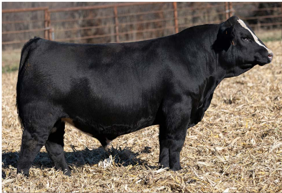
IRON CREEK THRESHOLD 4400M Sells as Lot 10.

Threshold is an absolute beast with, again, outstanding growth and carcass traits (top 2% carcass weight, and top 10% marbling and ribeye area) with stronger maternal traits and top 1/3 calving ease. An outstanding seedstock or commercial bull for the discriminating breeder. Gained 5 pounds per day on 60 day test.