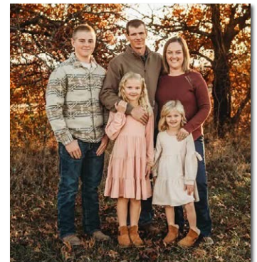
Harlan Cattle Co.