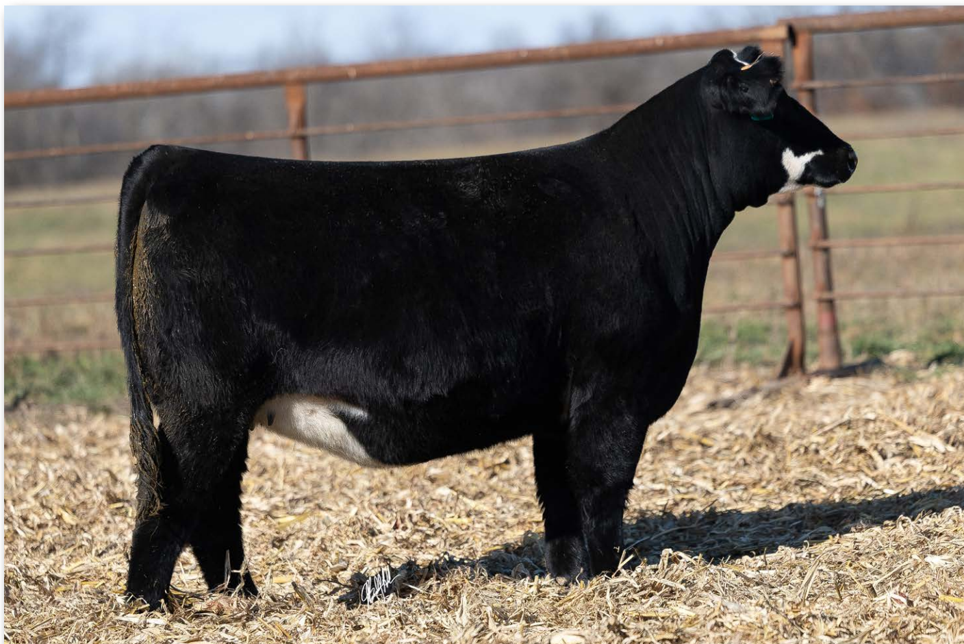
K904M Sells as Lot 74.