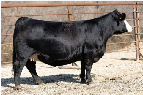
IRON CREEK MOXIE D68K Dam of Lots 7-15.