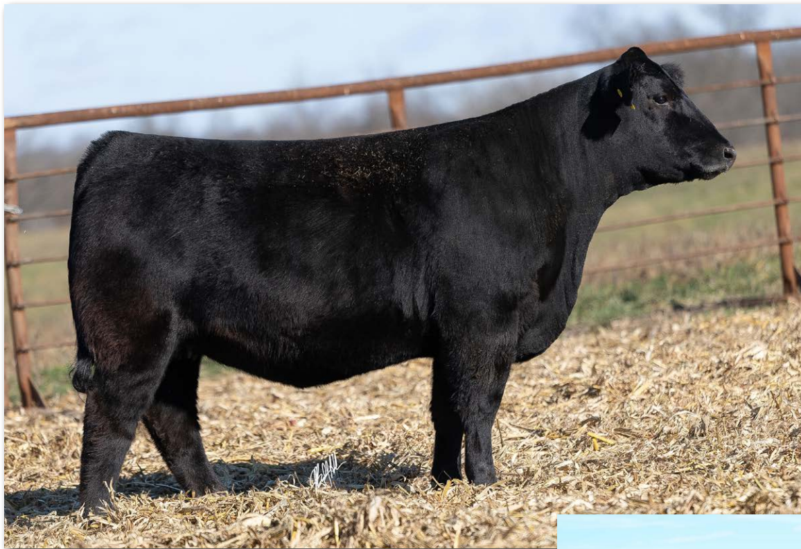
IRON CREEK MATRON D033M Sells as Lot 83.