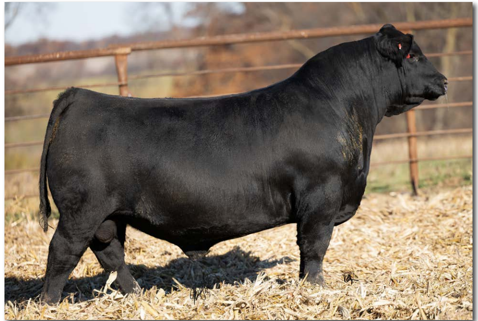
IRON CREEK BELFAST 8108M Sells as Lot 67.