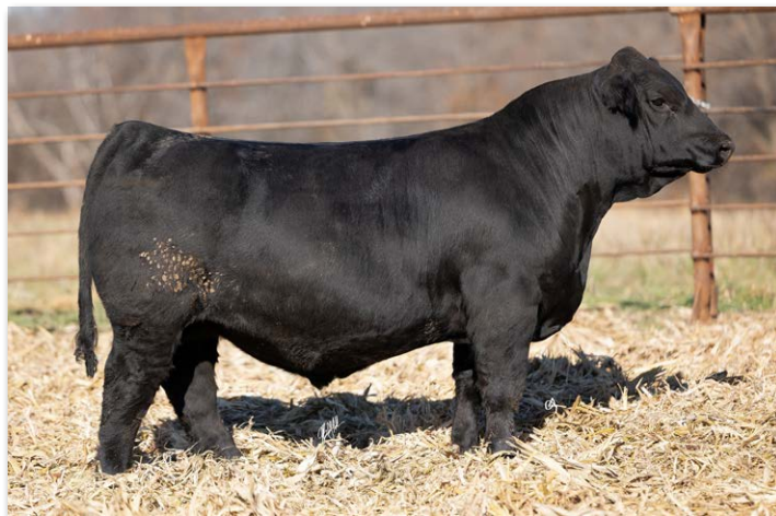
IRON CREEK L180N Sells as Lot 44.