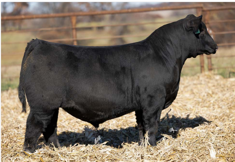
IRON CREEK BELFAST J107N Sells as Lot 5.

Belfast represents that we hoped and aspired to by using Haymaker on our balanced cows. His mother is a beautiful Platte River daughter of the famous TJ Miss 29B donor we purchased for $20,000. The evaluation of Belfast starts with his stunning physical appearance- power and elegance combined. A lot of "pretty" bulls don't have substance, but Belfast is a top 1% weaning weight (107) and 1% yearling weight (174) powerhouse. Yet he has top 2% maternal weaning weight and top 30-35% milk and maternal calving ease and top 20% marbling and 35% ribeye area. While his calving ease indicates he is a use-on-cows only bull, the numbers say the same of Haymaker and we have had virtually no issues with Haymaker births. An exciting opportunity to purchase a rare bull with breed leading growth and looks.