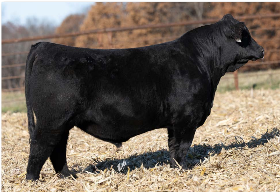
DRAKE BULL J76N Sells as Lot 58.