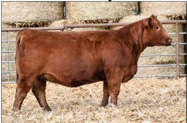
M248 Sells as Lot 52.