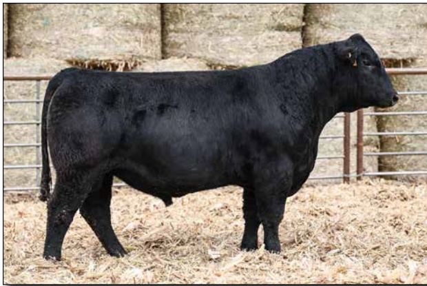
M294 Sells as Lot 15.

A baldy Homeland bull with a great API. I think this bull will make fantastic daughters to build a fancy herd.