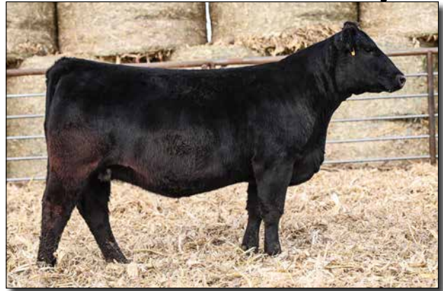
M812 Sells as Lot 48.

Bred to LF Money Order (4473153). Safe to calve 3/26/2026. Power and thickness is what this heifer has! An embryo heifer that has stuck out since day one.