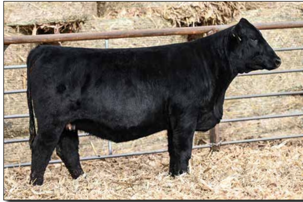
M621 Sells as Lot 45.

AI bred to LF Laser (4350261). Safe to calve 2/26/2026. LF Laser calves have been everything we hoped they would be and more. This baldy heifer bred to Laser will do it too!