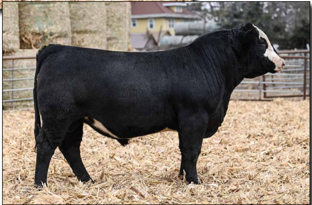
M192 Sells as Lot 2.