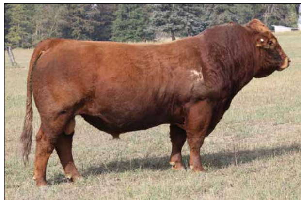
HSF CARDINAL 133G Sire of Lots 3, 4.

This three-quarter dark red bull was an embryo to the top selling red bred heifer last year. I wish every calf I raised looked like him.