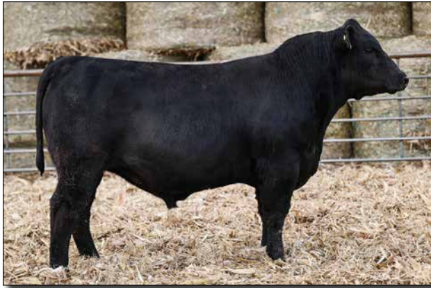
M701 Sells as Lot 13.

13 LF MADDEN M701 ØGGP Black || Polled 3/4 SM 1/4 AN BD: 4/1/2024 Bull ASA# 4473100