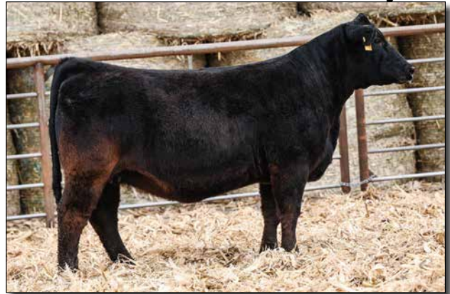
M114 Sells as Lot 56.

Bred to LF Money Order (4473153). Safe to calve 3/27/2026. We could write a book about this CLRS Homeland heifer. She does so many things right, powerful and feminine. Be sure to find her.