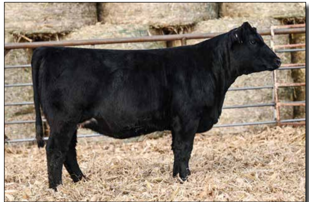
M177 Sells as Lot 66.

Bred to LF Money Order (4473153). Safe to calve 3/14/2026. This smooth made KBHR Sweetness daughter has a balanced phenotype and a proven pedigree to fit.