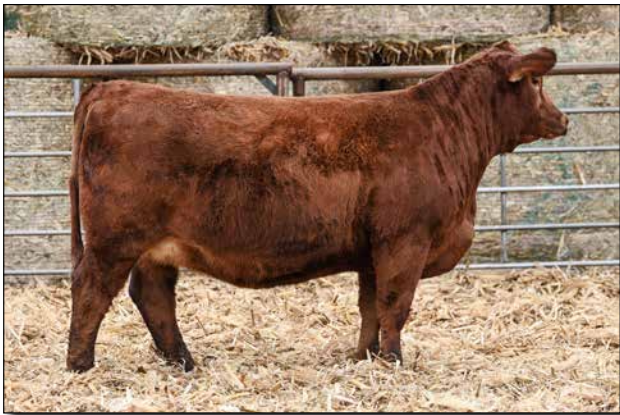
M31 Sells as Lot 62.

Bred to LF Money Order (4473153). Safe to calve 3/29/2026. Lot 61 is a feminine, smooth made 5/8 heifer. Will match up well with LF Money Order.