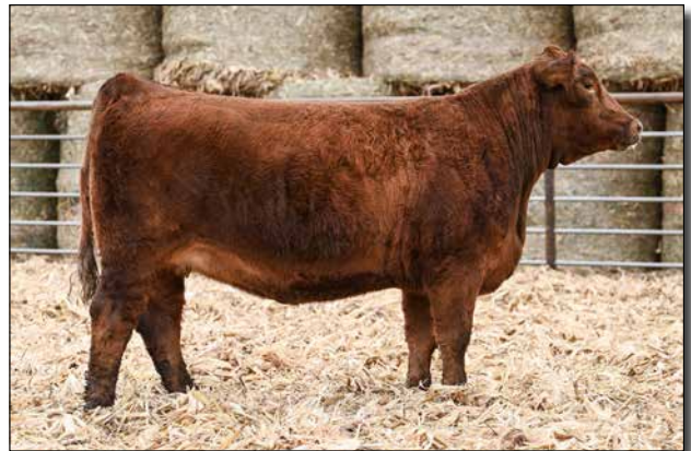
M165 Sells as Lot 57.

Bred to LF Money Order (4473153). Safe to calve 3/13/2026. A 3/4 red female whose hybrid vigor shows in her thick style.