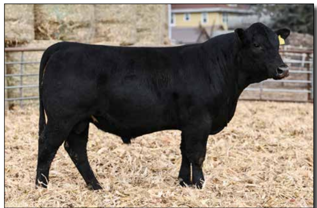
M172 Sells as Lot 36.

A five-eighths bull you have to like. Appreciate his hybrid vigor at its finest.