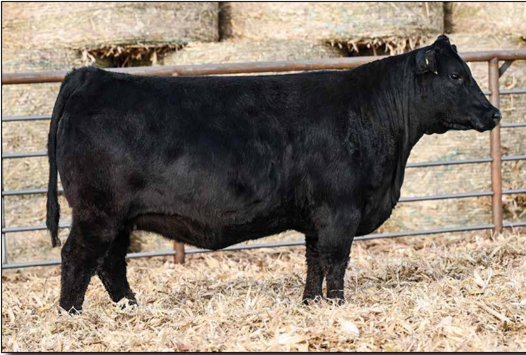
M221 Sells as Lot 38.