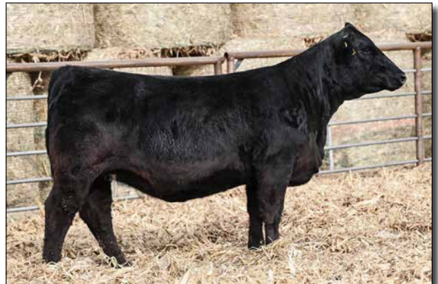
M247 Sells as Lot 42.

AI bred to HA Magnifique 72L (4196053). Safe to calve 2/13/2026. Lot 42 was thought long and hard about if she was going to be allowed on the sale. So much to like about this KBHR Global daughter. Another big time prospect to add to your herd right here!