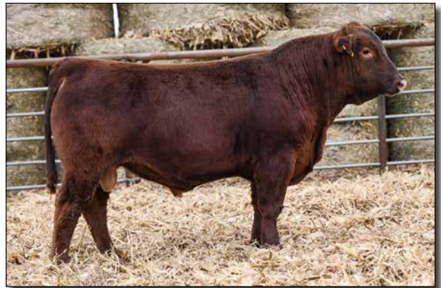
M71 Sells as Lot 26.

A strong Simmental Red Angus bull. Carrying the increased heterosis will offer an opportunity.