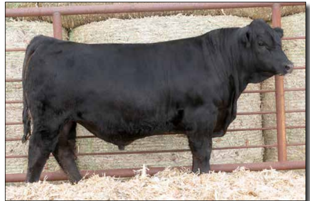
HOOK'S JOURNEY 7J Sire of Lot 38.

AI bred to HA Magnifique 72L (4196053). Safe to calve 2/14/2026. Lot 38 has tremendous body mass and eye appeal along with great EPDs and an AI calf to start her out as an elite female for your herd!