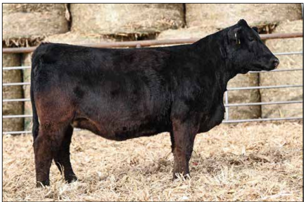
M255 Sells as Lot 54.

AI bred to LF Laser (4350261). Safe to calve 2/16/2026. Lot 53 does as lot of things right. LF Laser will be a great match for her.