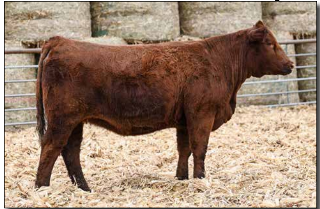
M130 Sells as Lot 65.

Bred to LF Money Order (4473153). Safe to calve 4/12/2026. This red purebred heifer has the API and balance to do some great things.