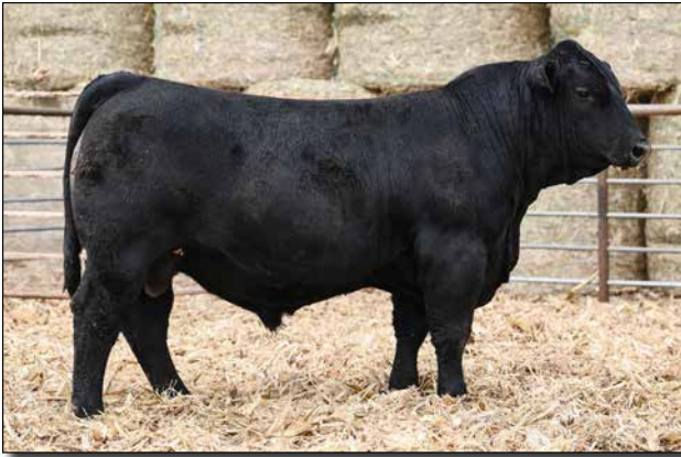
M637 Sells as Lot 5.