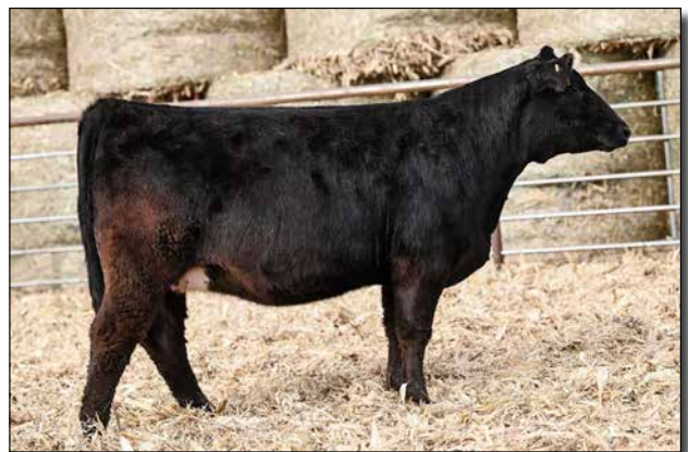
M702 Sells as Lot 51.

Bred to LF Money Order (4473153). Safe to calve 4/9/2026. Here is a CCR Cowboy Cut female with huge STAY and eye appeal.