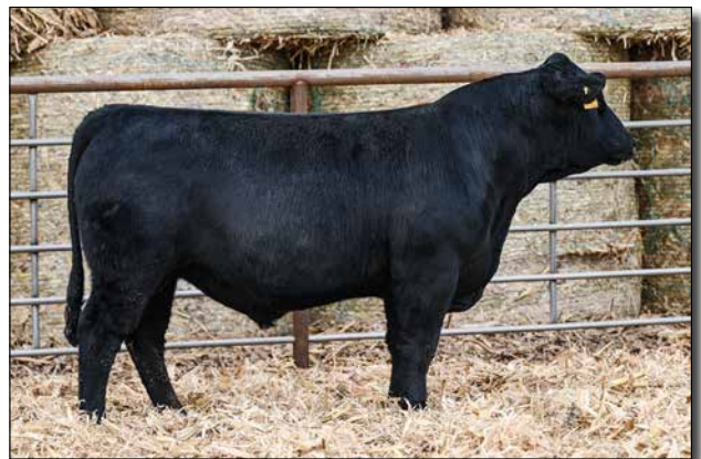
M144 Sells as Lot 19.

A three-quarter Reserve bull that does everything right. Lot 19 is from a powerful cow family with a genotype to back up the growth and muscle he has.