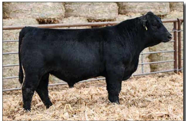
M04 Sells as Lot 27.

A five-eighths percentage bull with great calving ease and birth EPD's. A lot to like here.