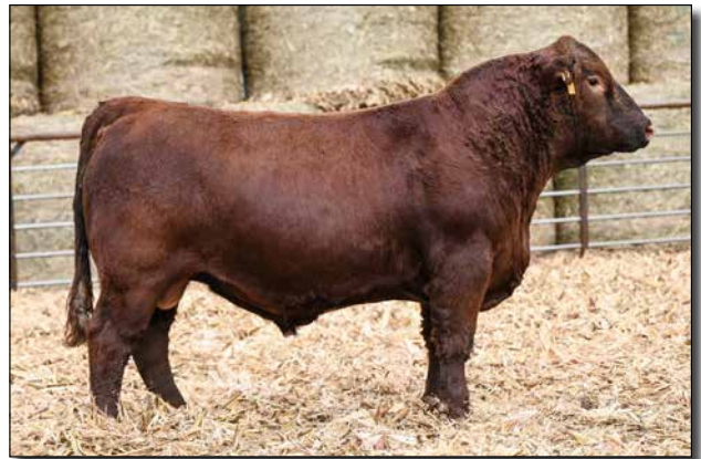
M61 Sells as Lot 17.

His name is Measure Up and this bull certainly does. He has top ranked calving ease, birth weight and API EPD numbers. Check him out!