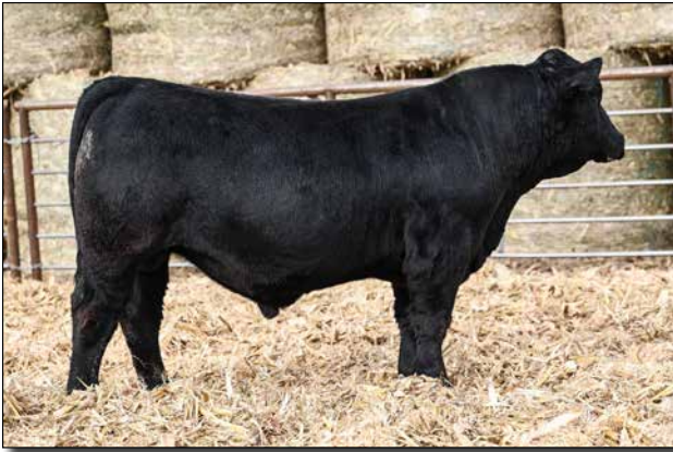
M011 Sells as Lot 29.

29 LF MARIO M011 XGGP Black || Polled PB SM BD: 5/7/2024 Bull ASA# 4473103