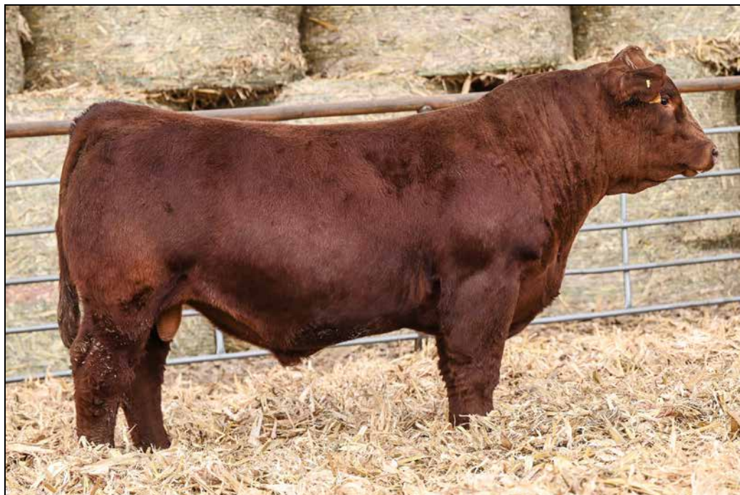
M9 Sells as Lot 3.