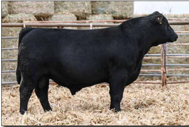
M573 Sells as Lot 14.

A Dividend bull with a beautiful front end. This bull follows suit with the rest of his cow family. Power and growth with an attractive look.