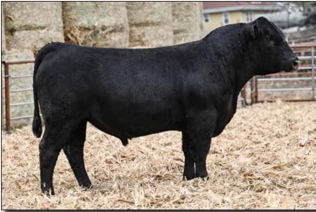
M69 Sells as Lot 30.

Be sure to mark this bull down on your list of bulls to take home.