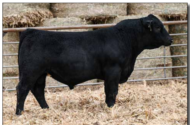
M141 Sells as Lot 20.

This cow bull, out of a well proven sire will raise high weaning weight calves with great docility. Proclamation bulls have good growth, an ideal look and are great bulls.