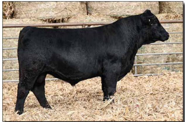
M909 Sells as Lot 34.

This guy will make a great commercial bull.