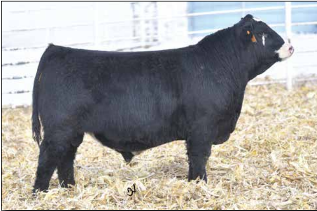
TJ TEARDROP 783F Paternal grandsire of Lot 40.