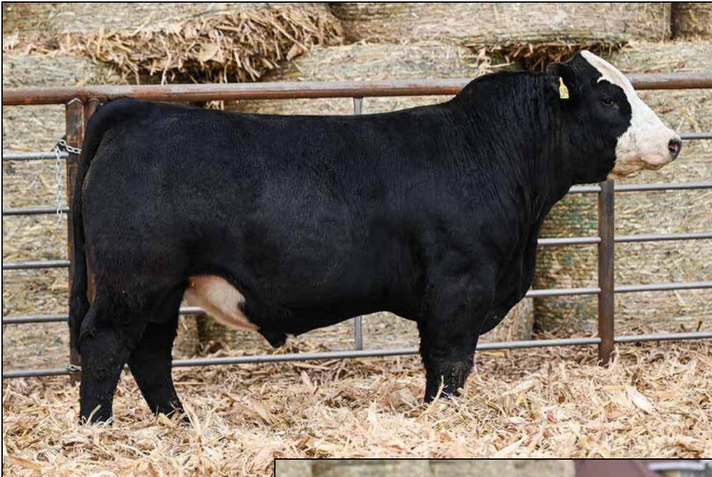
M514 Sells as Lot 1.