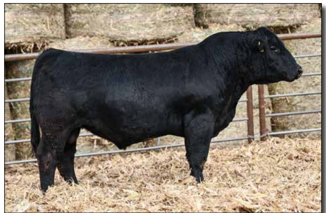
M52 Sells as Lot 11.

A three quarters Proclamation bull. You have to appreciate him for his completeness. He's good on paper and awesome to look at! One of my favorite bulls.