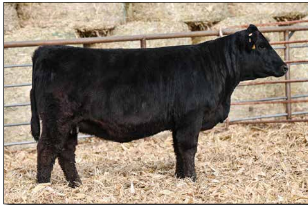
M26 Sells as Lot 46.

AI bred to LF Laser (4350261). Safe to calve 2/16/2026. A lot to love about this cow family. Plenty of cows in our herd from this blood line, well proven.