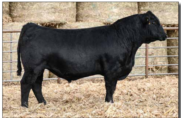
M975 Sells as Lot 18.

The only Guardian bull we have and he's a good one. Big and powerful. He will produce calves that really grow.