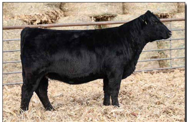
M3 Sells as Lot 59.

Bred to LF Money Order (4473153). Safe to calve 4/19/2026. This 3/4 blood goes back to two of our donor cows on both sides of her pedigree and has the style to match.