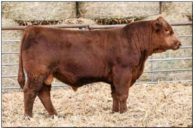
M131 Sells as Lot 23.

A Reserve bull with many things to like. He will make a great commercial man's bull.