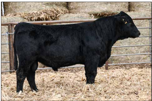
M4 Sells as Lot 24.

Check out the outcross pedigree of this red bull and his excellent EPD's. Take a good long look at him.