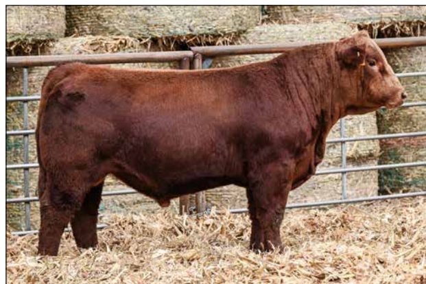
M665 Sells as Lot 4.

Full sib embryo to lot 3. Be sure to take a second look at this outstanding dark red bull.