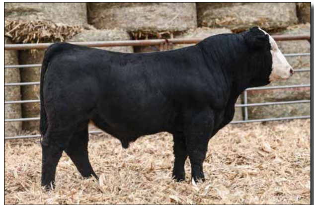
M747 Sells as Lot 35.

A blaze faced bull that will throw those nice baldy calves that top the market. Don't miss out!