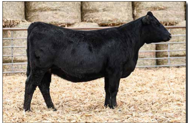
M191 Sells as Lot 67.

AI bred to LF Laser (4350261). Safe to calve 2/25/2026. Make sure to find this LCDR Reserve daughter. She has the numbers and power to make a fantastic cow.