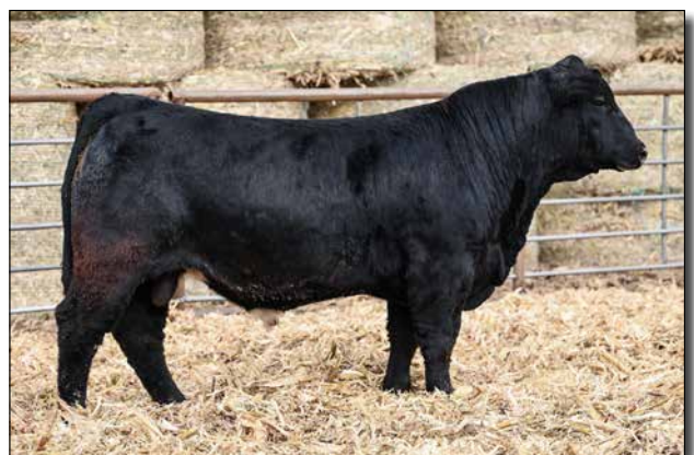
M022 Sells as Lot 28.