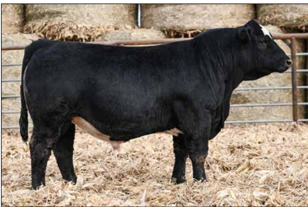
M239 Sells as Lot 8.

A red percentage fall bull with a little more size.