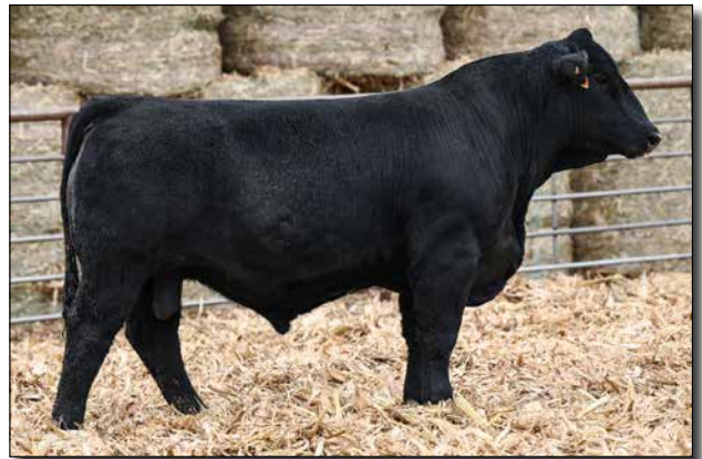
M188 Sells as Lot 9.

The KBHR Honor son that serviced our heifers this year has the calving ease, growth spread, and deep body to sire fantastic calves.