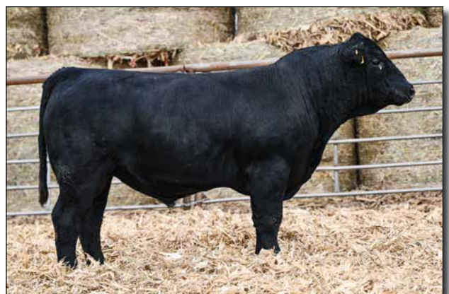
M969 Sells as Lot 12.

If you want to add some Cowboy Cut genetics in your herd, this guy can do it. There are not many of his progeny left.