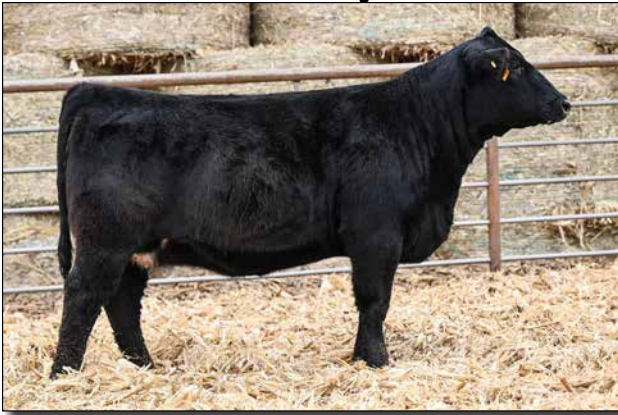
M911 Sells as Lot 44.