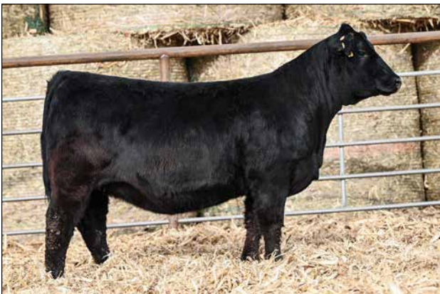
M1 Sells as Lot 41.

Bred to LF Money Order (4473153). Safe to calve 3/13/2026. Here is a natural born calf out of our donor cow Diana. A cow family that hits the mark every time.