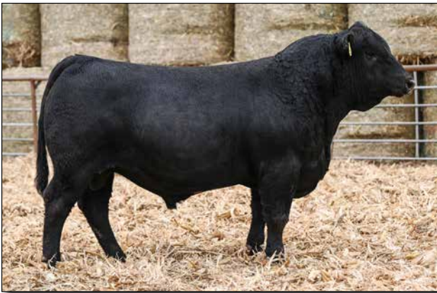
M279 Sells as Lot 6.

This purebred black embryo bull carries the red gene. Go either way with a black or red bloodline.