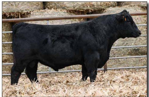
M180 Sells as Lot 10.

Another Homeland bull with the right amount of body along with eye appeal. Outstanding bull. Keep daughters out of this bull.