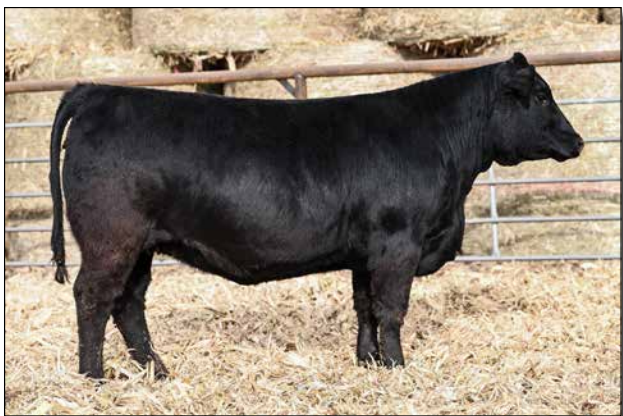
M326 Sells as Lot 55.

Bred to LF Money Order (4473153). Safe to calve 5/15/2026. This 3/4 blood heifer is from an embryo calf that has turned into a powerhouse cow for us. Lot 54 will do the same for you.