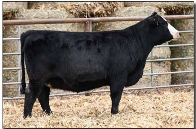
M612 Sells as Lot 50.

Bred to LF Money Order (4473153). Safe to calve 3/27/2026. Very attractive baldy heifer. TJ Rage has done great for us and this heifer will do the same for you.