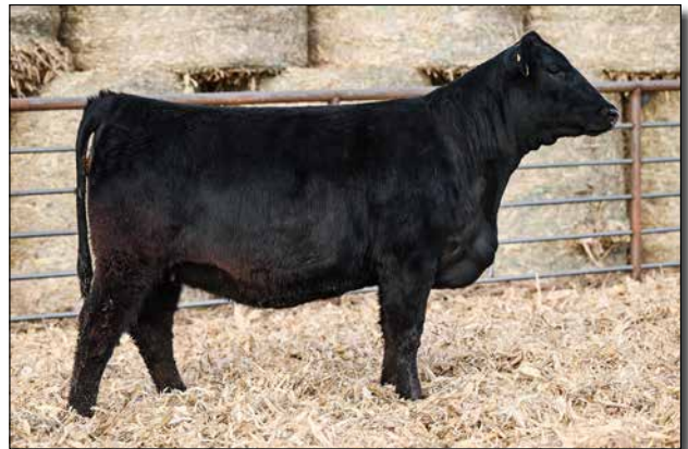
M25 Sells as Lot 58.

Bred to LF Money Order (4473153). Safe to calve 3/22/2026. Here is 5/8 heifer that has the look and bloodlines to work for you.