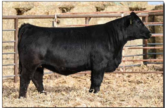
M400 Sells as Lot 49.

Bred to LF Money Order (4473153). Safe to calve 3/11/2026. Check out the calving ease this heifer has, it will make for an easy calving cow that still has the grow to perform.