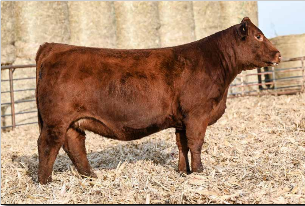
M11 Sells as Lot 43.