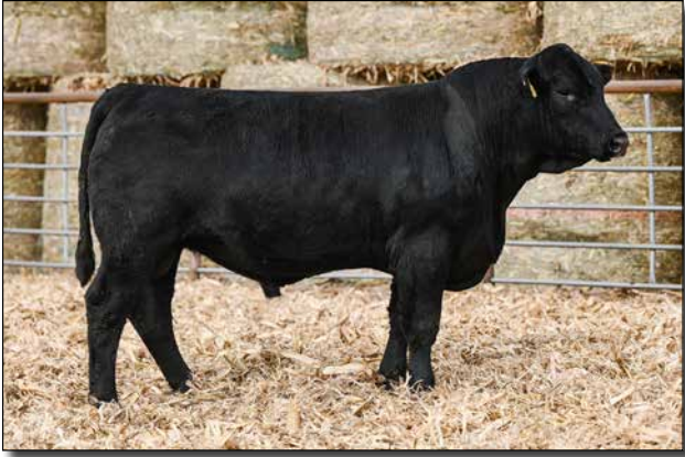
M51 Sells as Lot 37.