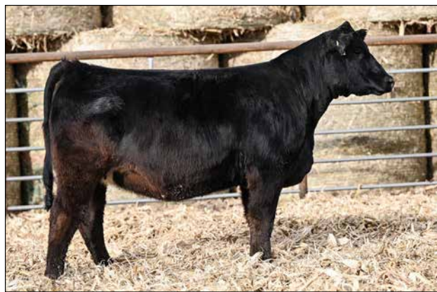
M614 Sells as Lot 47.

AI bred to LF Laser (4350261). Safe to calve 2/21/2026. Check the STAY on this female, Lot 46 has the balance and look to back it up. Great female!