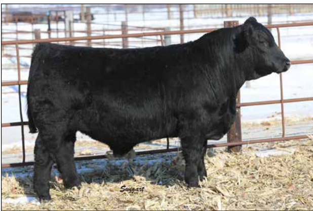
WBF RL DEETS H126 Sire of Lot 32.

Buy him. You will never be disappointed.