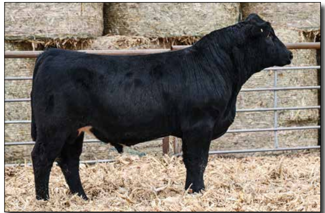
M721 Sells as Lot 25.

This bull will make a good commercial man's bull. You will like the body confirmation he puts in his calves.