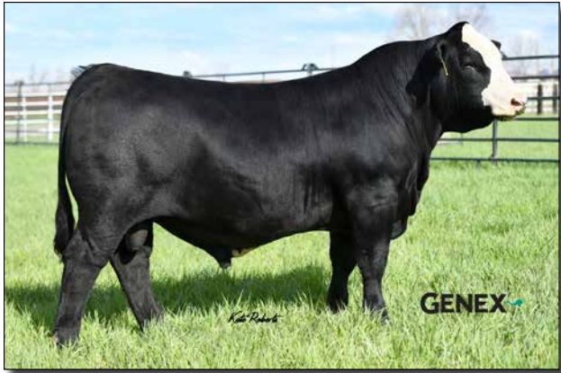
LCDR RESERVE 210J Sire of Lot 22.

This is the only Sweetness bull in the sale. He offers big time growth along with strong calving ease and eye appeal.