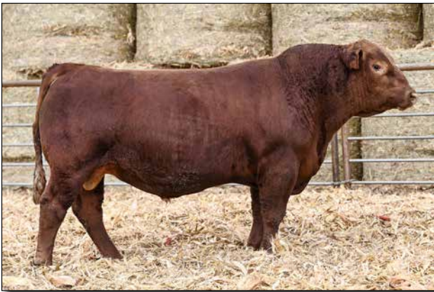
96L Sells as Lot 7.

If you like a calving ease bull loaded with meat and muscle, here's your bull. Plus his API is 161.