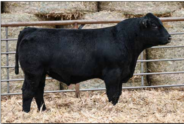
M149 Sells as Lot 31.

Here's a bull from one of my favorite cows. She always has a special one.