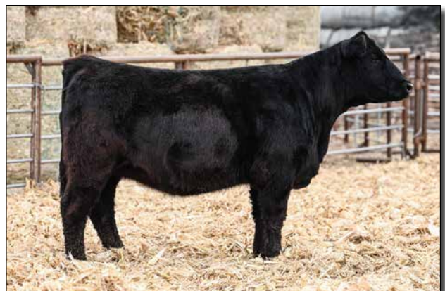
M214 Sells as Lot 68.

Bred to LF Money Order (4473153). Safe to calve 5/20/2026. Lot 68 is an outstanding KBHR Global daughter. Deep bodied, smooth made, and amazing STAY.