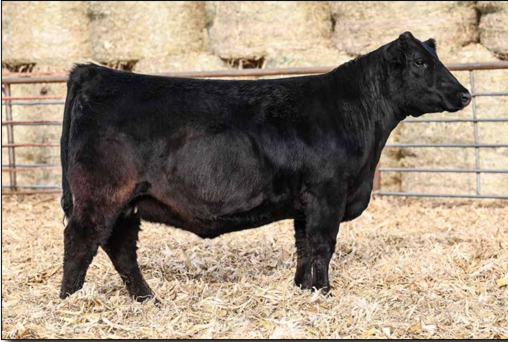
M7 Sells as Lot 40.