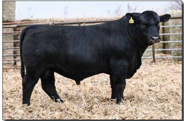
M41 Sells as Lot 33.

A three-quarter bull with just the right amount of heterosis. He's a bold-bodied big-footed bull who will sire very attractive calves.