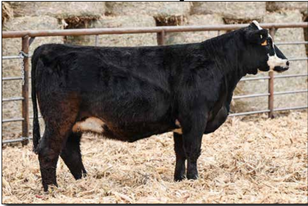
M708 Sells as Lot 60.

60 LF MACY M708 XGGP Black || Polled PB SM BD: 3/31/2024 Cow ASA# 4473083