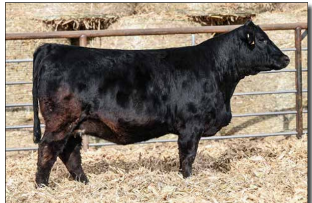
M59 Sells as Lot 39.

AI bred to JC Gold Rush (3870330). Safe to calve 2/22/2026. This rampage daughter does a lot of things right, bred to JC Gold Rush who will match great on her balance and power.