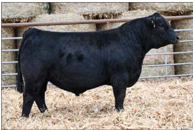
M288 Sells as Lot 16.

A Hooks Journey bull with extremely high calving ease numbers and an impressive 174 API. Then look at his body confirmation. He has it all!