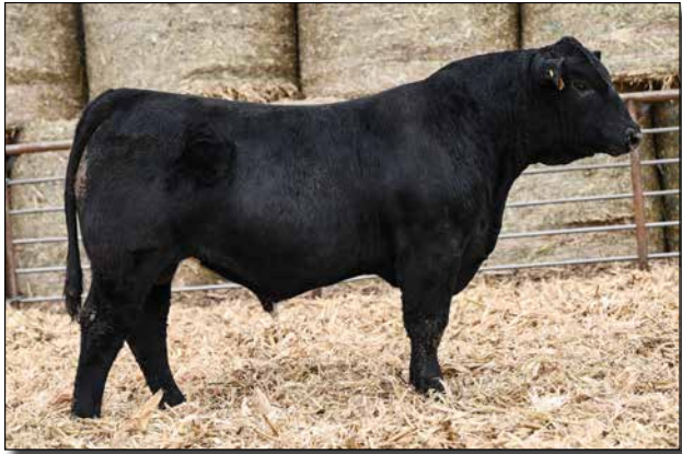
M321 Sells as Lot 21.

21 LF MARINER M321 XGGP Black || Polled PB SM BD: 3/8/2024 Bull ASA# 4473123