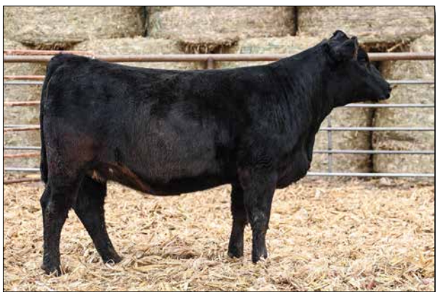
M914 Sells as Lot 53.

Bred to LF Money Order (4473153). Safe to calve 5/10/2026. Lot 52 is an outstanding red heifer. One that will catch your eye in the pen and on paper as well!