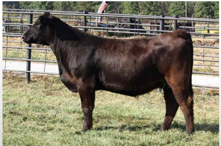
M950 Sells as Lot 9.

Pasture exposed to TJ 1600M (4368782) & TJ 591M (4366422) - TJ Arrowhead sons. Due to calve 2/20/2026. Confirmed bull calf.