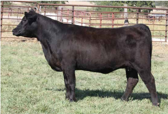
M1506 Sells as Lot 16.

Pasture exposed to CCR 6044J 4146L (4337820) & TJ 803M (4366141) - Heisman and Gold Sons. Due to calve 2/15/2026. Confirmed bull calf.