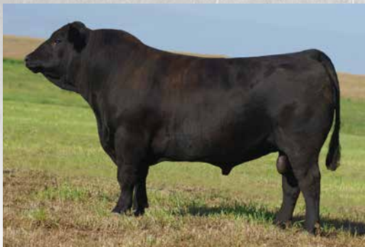
TJ HEISMAN 388F Maternal grandsire of Lots 2, 3.