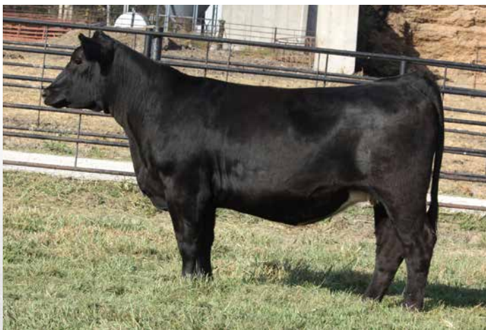
SFLC 812M Sells as Lot 6.

AI bred to Talon. Due to calve 1/15/2026. Confirmed bull calf.