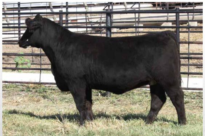
SFLC 727M Sells as Lot 20.

Pasture exposed to TJ 1600M (4368782) & TJ 591M (4366422) - TJ Arrowhead sons. Due to calve 2/25/2026. Confirmed heifer calf.