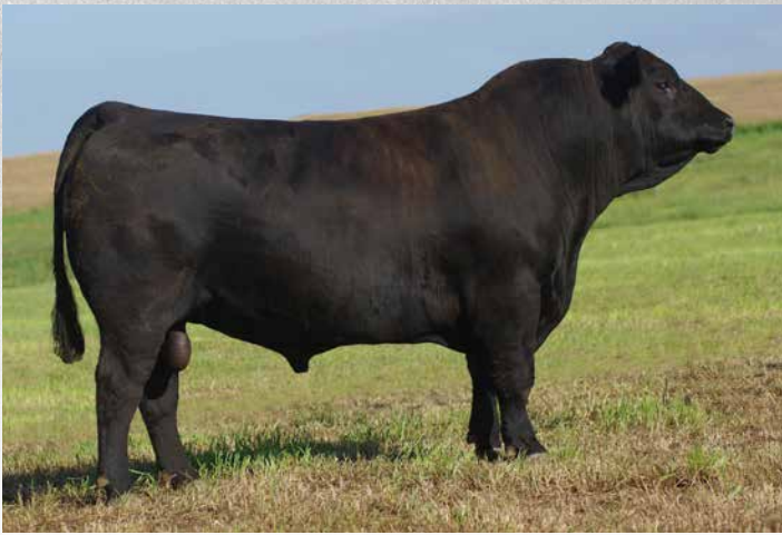
TJ HEISMAN Sire of service sires of Lots 27, 28.