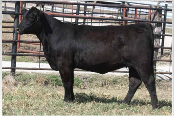
M1402 Sells as Lot 18.

Pasture exposed to TJ 1600M (4368782) & TJ 591M (4366422) - TJ Arrowhead sons. Due to calve 2/20/2026. Confirmed heifer calf.