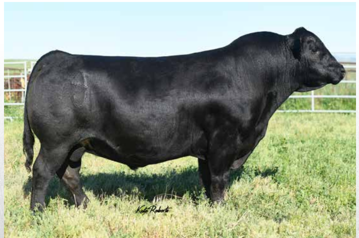
TJ ARROWHEAD Sire of service sires of Lots 23, 25, 26.

Pasture exposed to TJ 1600M (4368782) &amp; TJ 591M (4366422) - TJ Arrowhead sons. Due to calve 3/12/2026.