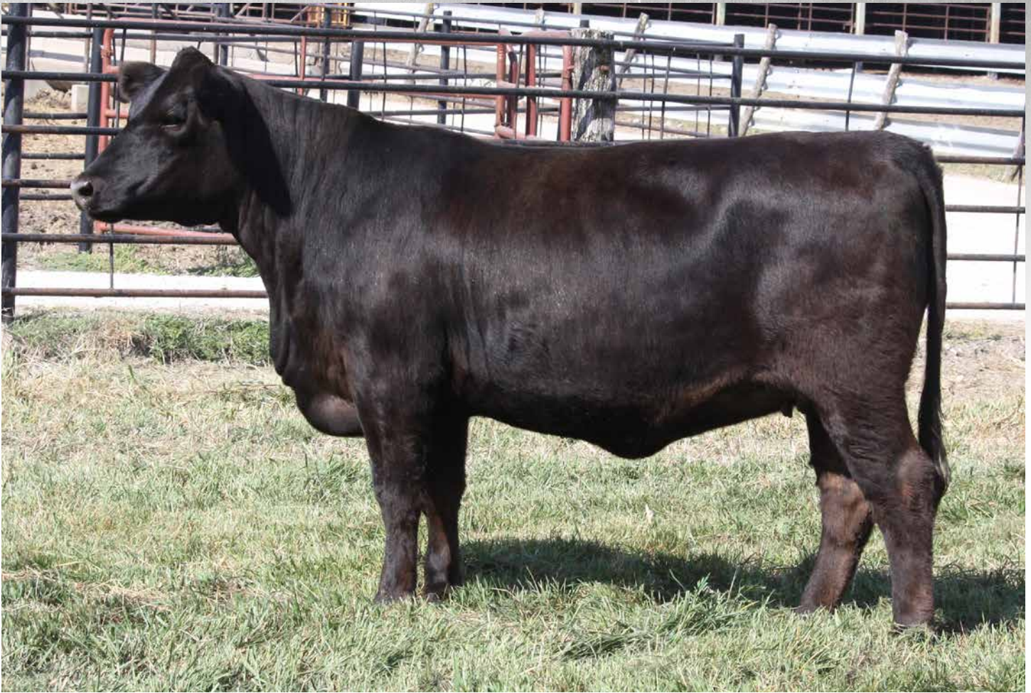
SFLC 031M Sells as Lot 1.