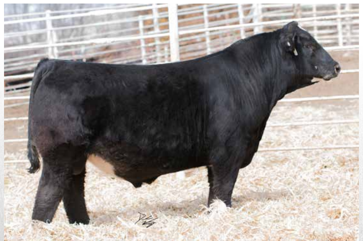
TJ FROSTY 318E Paternal grandsire of Lot 33.

AI bed to Talon. Due to calve 1/15/2026. Confirmed bull calf.