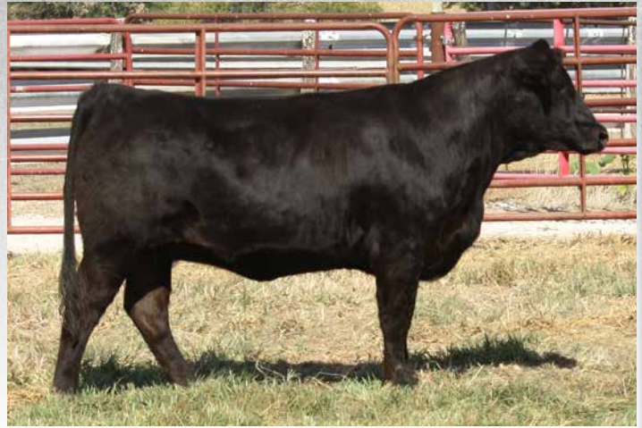
M14B Sells as Lot 24.

Pasture exposed to CCR 6044J 4146L (4337820) &amp; TJ 803M (4366141) - Heisman and Gold Sons. Due to calve 2/20/2026. Confirmed bull calf.