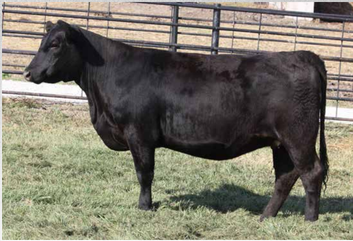
SFLC 433M Sells as Lot 4.