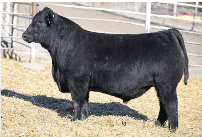
TJ 1600M Service sire of Lots 17-20.

AI bred to Gibbs Foundation 3019L (4284582). Due to calve 1/15/2026. Confirmed bull calf.