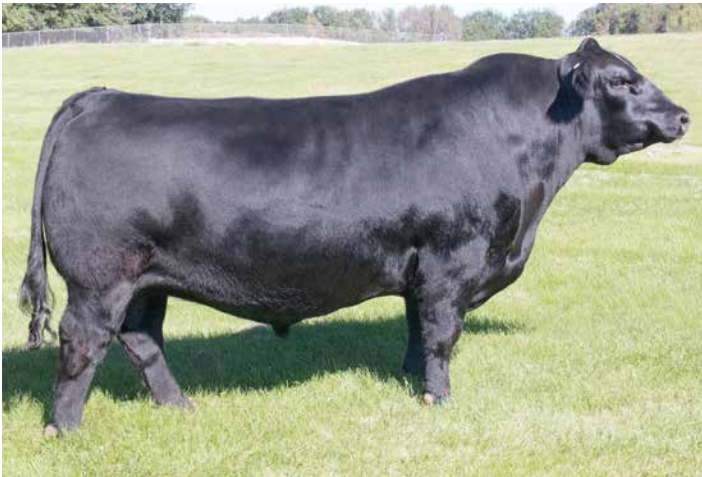
TJ GOLD Sire of service sires of Lots 27, 28.