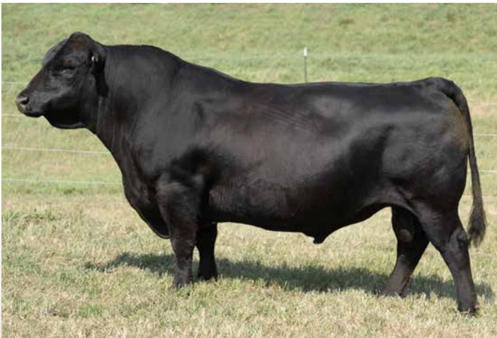
BRIDLE BIT ECLIPSE E744 Sire of Lots 1-3.