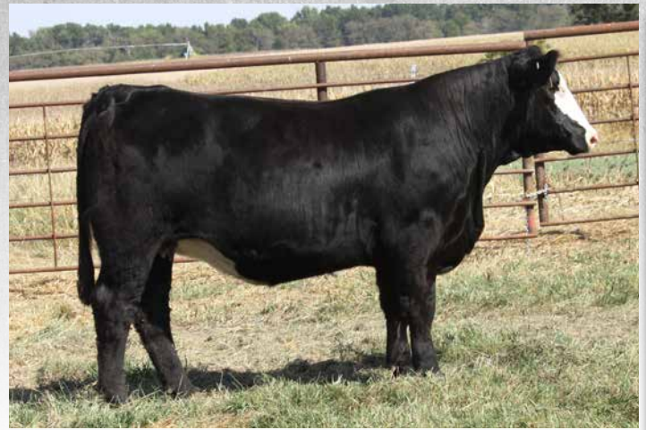
TSB 2324 HOPKE M230 Sells as Lot 13.

Baldy Purebred with added frame and performance. Carrying a Sim angus bull out of Hoover Republic. Get a great female and herd sire prospect in one package!