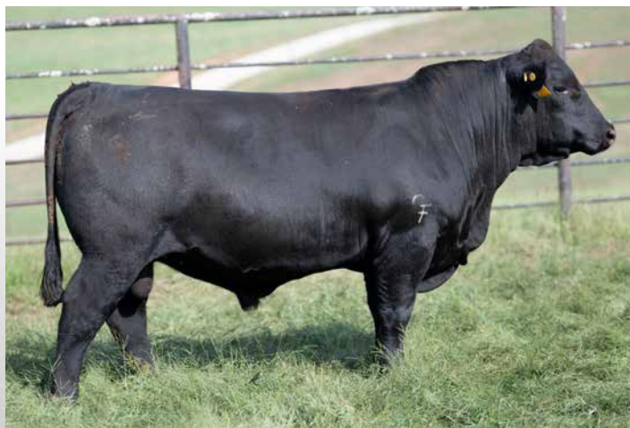
GIBBS FOUNDATION 3019L Service sire of Lots 2, 4, 10, 14, 16, 36, 37, 40, 41, 45, 54, 56, 57, 61, 71, 72, 77, 82, 85, 89, 92, 99, and 101.