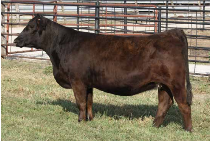
SFLC 618M Sells as Lot 5.

Lots 4-7 are 4 daughters from our 523H bull we called Rancher are just that. Absolutely the Ranchers kind. Very complete, fault free with longevity built in.