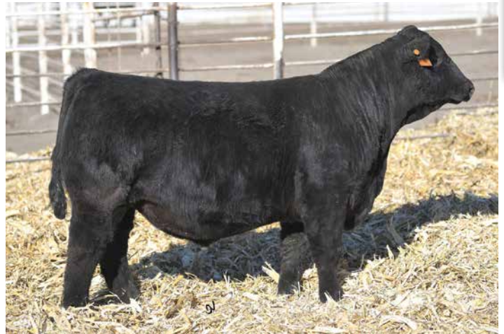
TJ 50K 485H Sire of Lot 32.

AI bed to Talon. Due to calve 1/15/2026. Confirmed heifer calf.