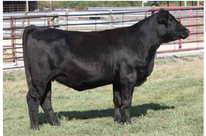
M16B Sells as Lot 14.

AI bed to Gibbs Foundation 3019L (4284582). Due to calve 1/15/2026. Confirmed bull calf.