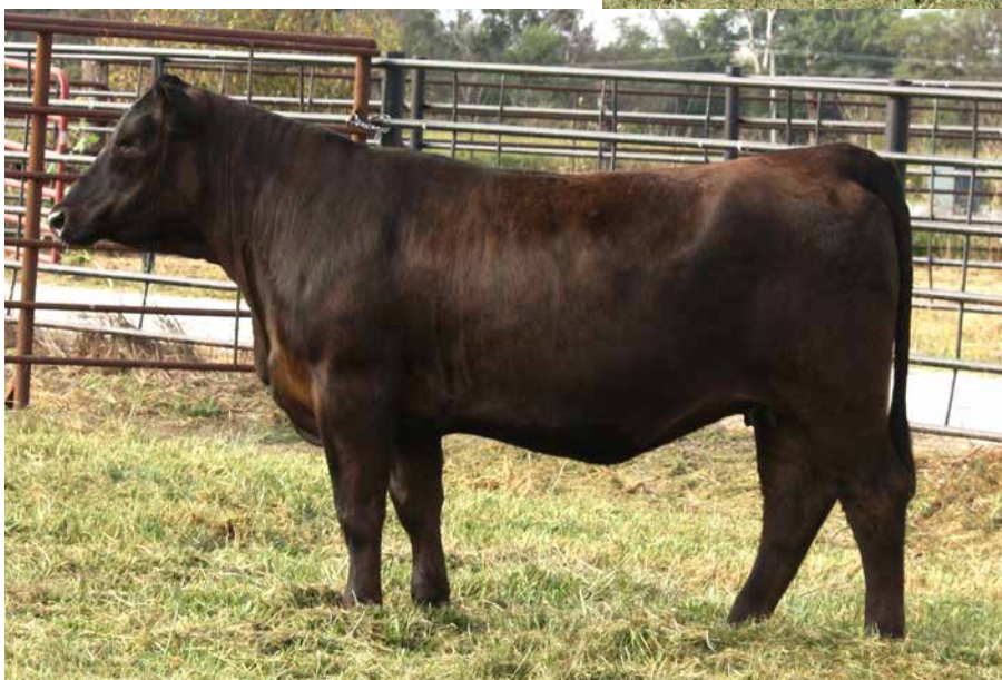
SFLC 07M Sells as Lot 2.

Lots 2 & 3 are flush sisters from our Bridle Bit Eclipse x 247J TJ Heisman donor. These 2 heifers are 6.5 frame if you are looking for females to make larger frame bulls. This was a very successful flush as we sold a full sib bull to Rodney Seals and 2 sisters to Brad Nahnkust and Dawn Brewer in our spring sale.