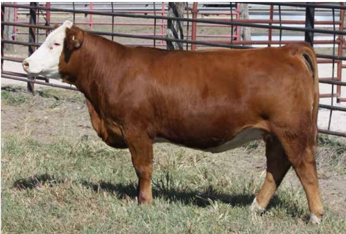
TSB 1018J PENDLETON M044 Sells as Lot 12.

Pasture exposed to TJ 1600M (4368782) & TJ 591M (4366422) - TJ Arrowhead sons. Due to calve 2/20/2026. Confirmed heifer calf.