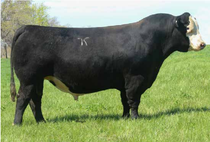
TSB BALD EAGLE K106 Sire of Lots 21, 22.