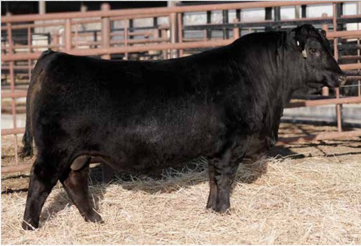
TERS LEOPOLD Service sire of Lots 21, 22.