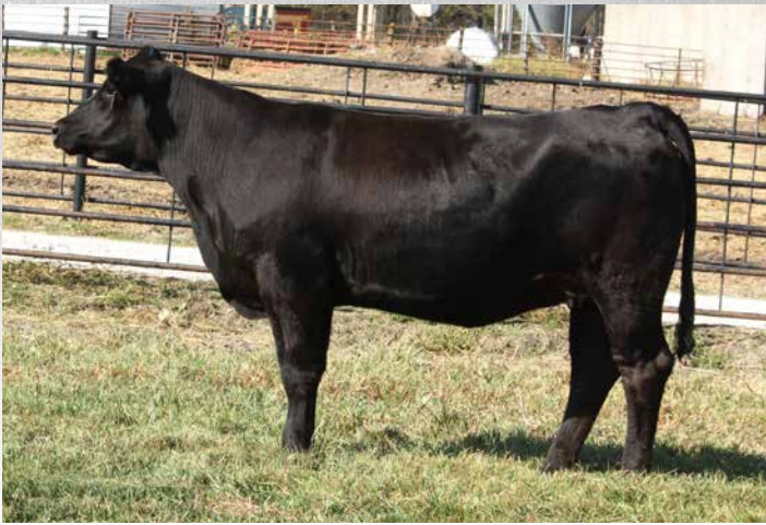
M814 Sells as Lot 15.

15 M814 GGP Homozygous Black Cow ASA #4386977 Homozygous Polled M814 1/2 SM 13/32 AN 3/32 CS BD: 3/3/2024 Adj. 205 643 G+ ATM