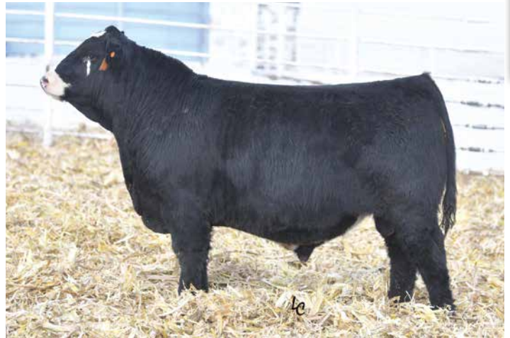
TJ TEARDROP 783F Paternal grandsire of Lot 19.

Pasture exposed to TJ 1600M (4368782) & TJ 591M (4366422) - TJ Arrowhead sons. Due to calve 2/20/2026. Confirmed bull calf.