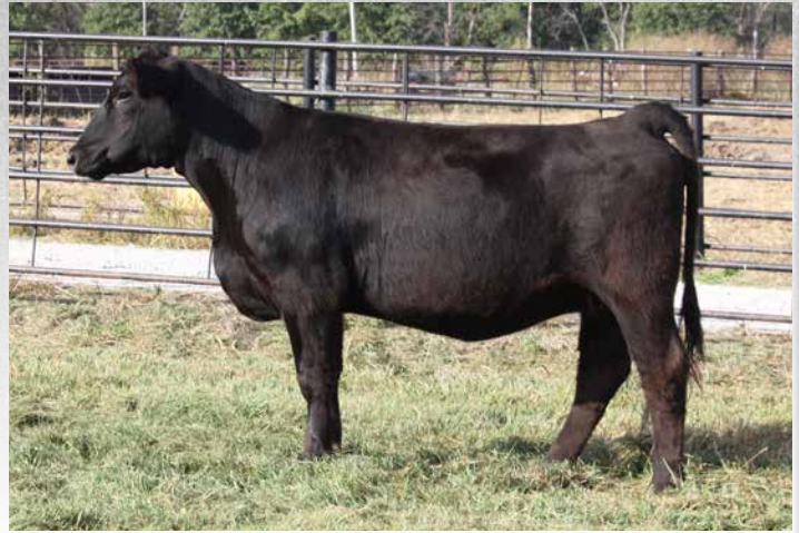
SFLC 81M Sells as Lot 7.

Pasture exposed to TJ 1600M (4368782) & TJ 591M (4366422) - TJ Arrowhead sons. Due to calve 2/5/2026. Confirmed heifer calf.