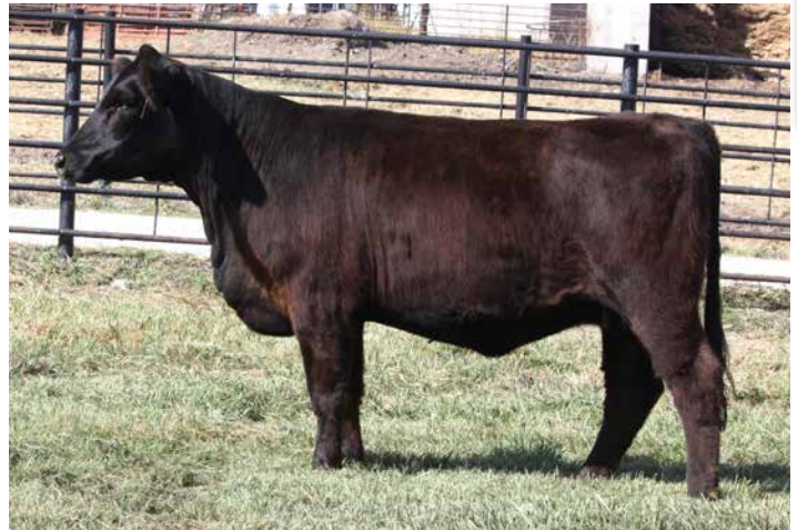
M61 Sells as Lot 8.

Lots 8 & 9 are two TJ Trooper daughters we purchased from Greg Ahlemeyer are phenotype standouts. M61 carries the G+ and ACE logo to enhance her value. Can't go wrong with either of these 2 females.