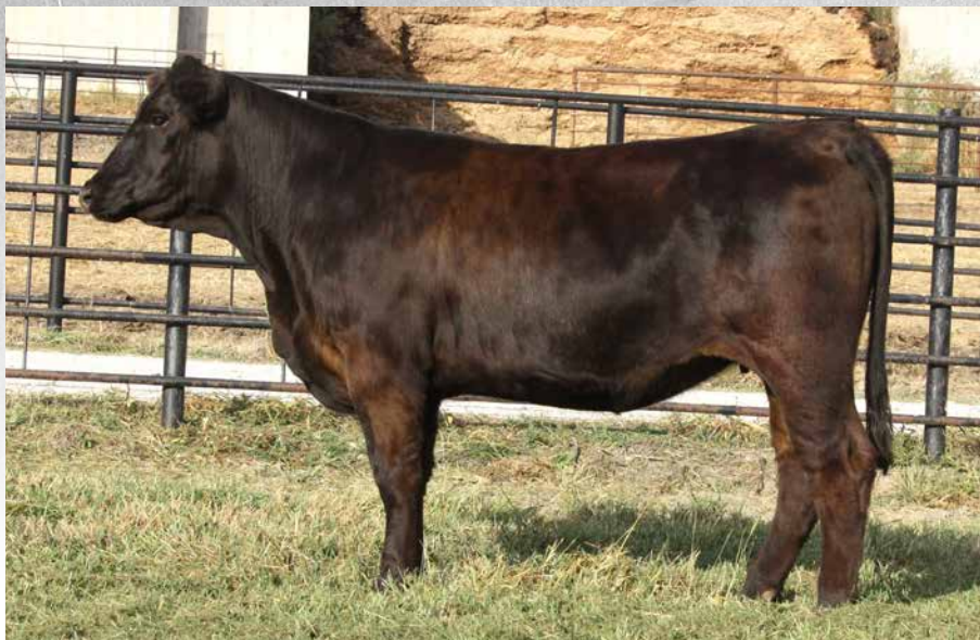
SFLC 656M Sells as Lot 3.