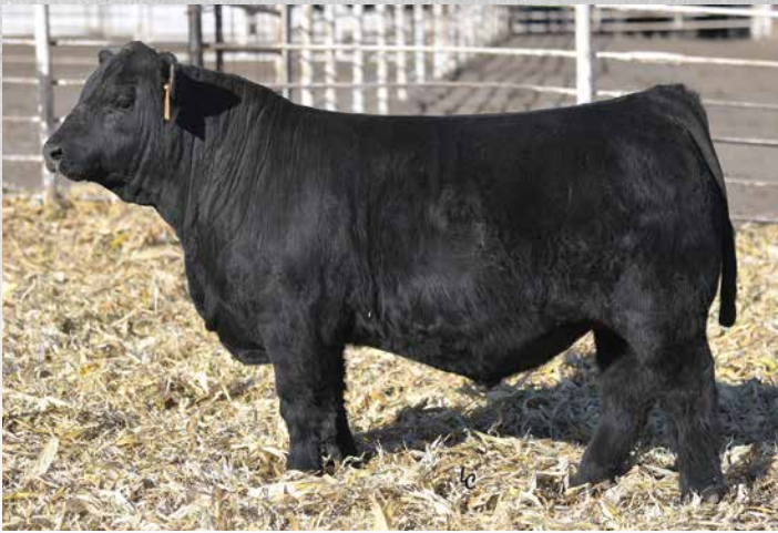
TJ MULTIPLIER 470H Sire of Lots 10, 11.