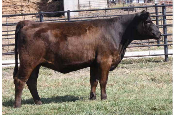
M53 Sells as Lot 25.

Pasture exposed to TJ 1600M (4368782) &amp; TJ 591M (4366422) - TJ Arrowhead sons. Due to calve 2/20/2026. Confirmed bull calf.