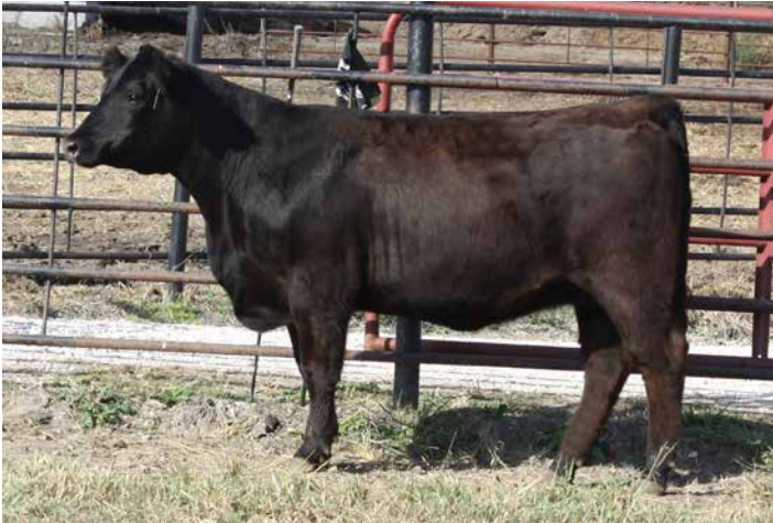
M12 Sells as Lot 11.

Lots 10 & 11 are two TJ Multiplier 470H daughters that have an excellent EPD profile. Calving ease genetics here if you are looking to make heifer bulls.