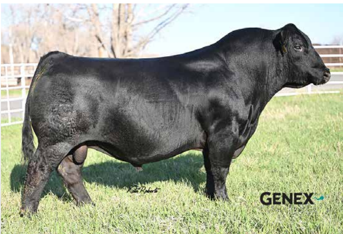
KBHR BOLD RULER H152 Sire of Lot 29.