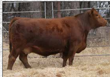
Dam of Hollywood