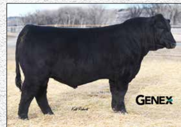
LBRS Genesis G69, Sire of Maestro