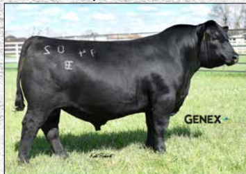
Sire of Bonanza