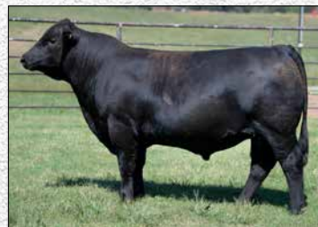
Gibbs 2510K Signature, Essential son