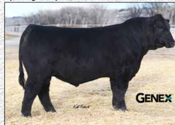
LBRS Genesis G69, Sire of Logan