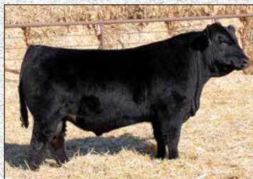
$65,000 selling Galileo son