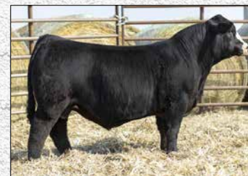
KBHR Revolution H071, Sire of Krown