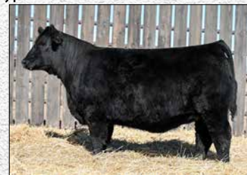
Daughter at Bridle Bit Simmentals