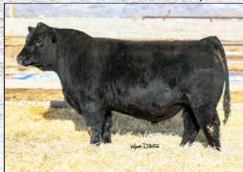
Son from Bulls of the Big Sky