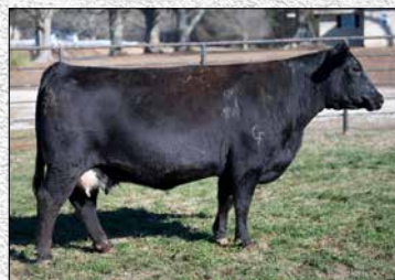
Dam of Prosperity