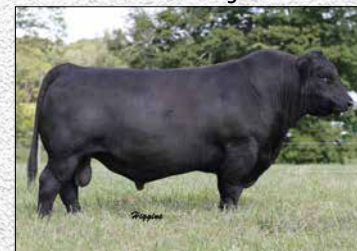
Redhill 672X X004 231A, Sire of Summit