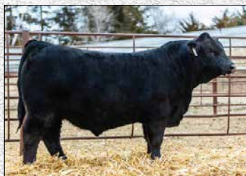
DTR Unrivaled, Falcon son

is working well with many positive reports. We are calving Falcon daughters, and they are amazing cows with picture-perfect udders.