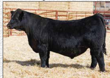
High Mark son