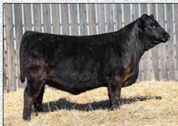
$200,000 maternal sister to GTO