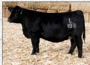
Jackson daughter at Eichacker Simmentals