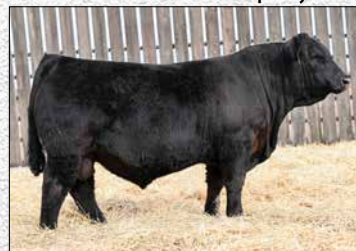
Bridle Bit Country Club, Eclipse son