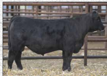
CCR Choichise 4142H, Sire of Leverage

GW TRIPLE CROWN 018C DAM: CCR MS 7662 T CROWN 1260J CCR MS COWBOY 7662E