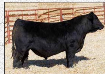
El Dorado son