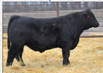
WS Jesse James 31J, Sire of Minute Man