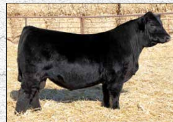
Quiet Man son