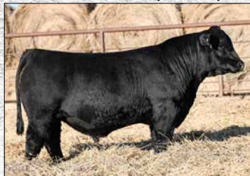
$167,500 selling Galileo son