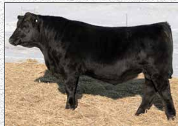
CLRS Kangaroo 956K, Sire of Maximus