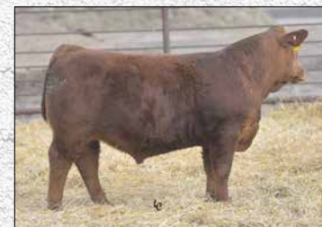
WS Hollywood 79H, Sire of Red Rush