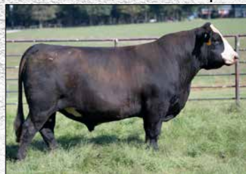
LCDR Reserve 210J, Sire of Prosperity