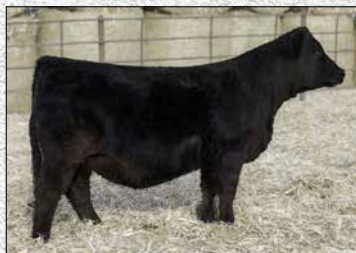
$40,000 top selling daughter from Schooley Cattle