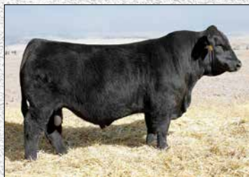
KBHR Honor, son of Beacon