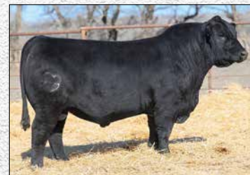
KBHR Homelander J071, Sire of Highwayman