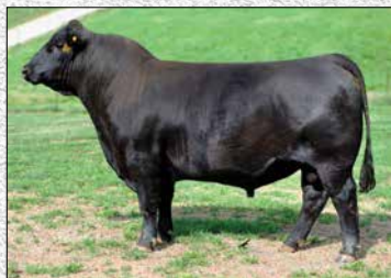
Maternal grandsire of Magnifique