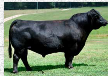
Sire of Hilltop

LD CAPITALIST 316 DAM: GIBBS 8090F EMPRISS 1085Y GIBBS 1085Y EMPRISS T091