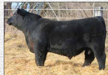
Maximus, Kangaroo son