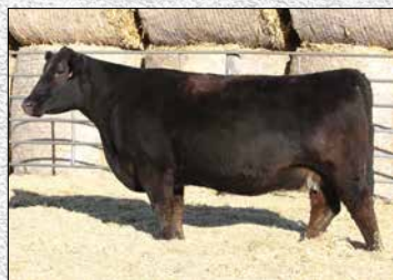
Daughter from Advanced Beef Genetics Dispersal