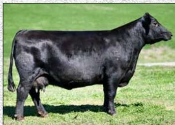
Dam of Kenworth