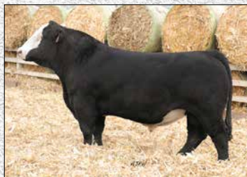
BAS Money Maker J801, Sire of My Generation