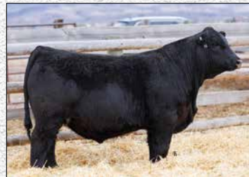
Fauth Step Up 4111, Next Up son