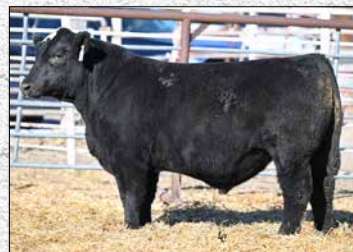
Medicine Man son