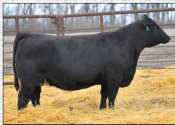
Dam of My Time