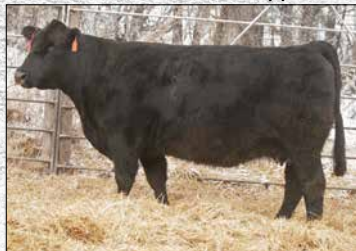
Dam of Kota