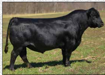
C-3 Next Up NS B220 J939, Sire of Step Up