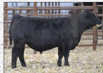
High Road son