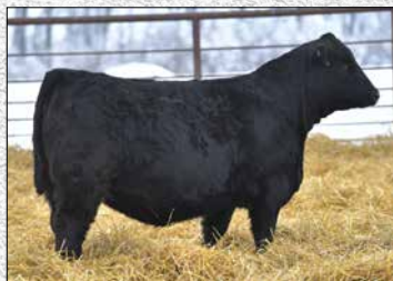
Dam of Marvel