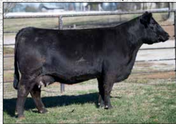
Fortune Teller daughter