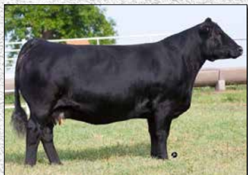
Dam of New Heights