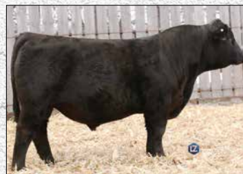
KBHR Global, Proclamation son