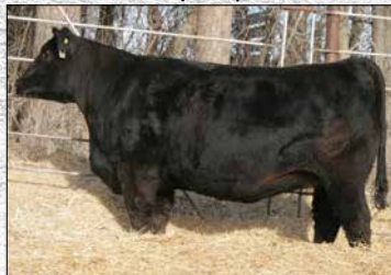
Dam of Credentials