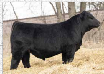
Five Star Jackson J10, Full Figures son