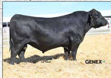
Gibbs 9114G Essential, Sire of Dakota