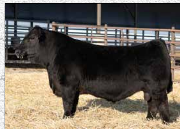
CLRS King James 616K, Sire of Morton