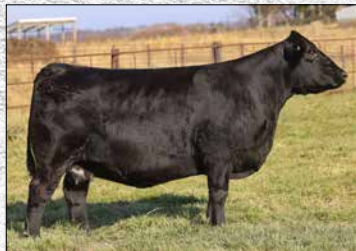
Dam of Undisputed