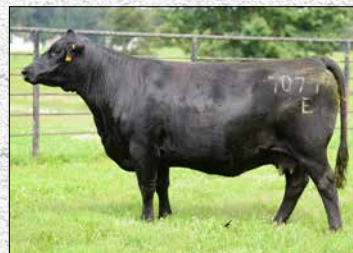
Dam of Signature