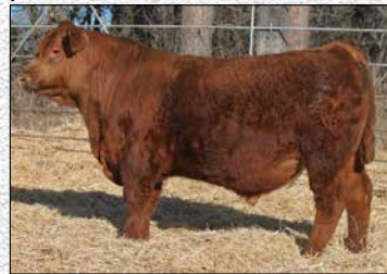
Son from Keller Broken Heart 2022