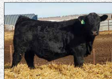
Son from Lassle Ranch Simmentals