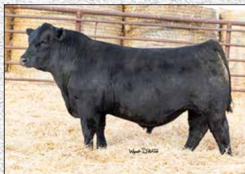
GW Medicine Man 200K, Fortune Teller son