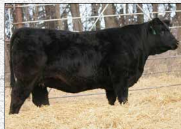
Grandam of Maximus