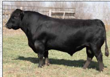
Hook's Galileo 210G, Sire of Gridmaster