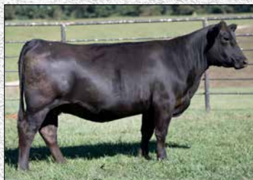
Dam of Leopold