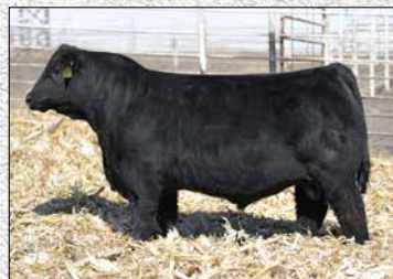
KBHR Bold Ruler J152, Sire of Limited Edition