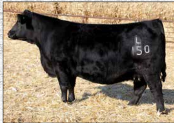
Homeland daughter from Eichacker Simmentals