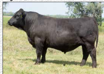
IR JRL Boomer J425, Eagle son