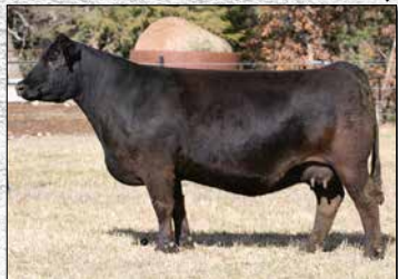
Grandam of New Heights