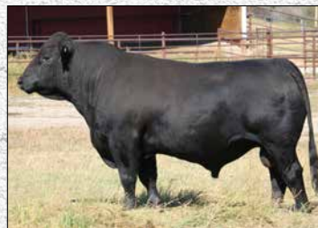
Sire of 7 and 7