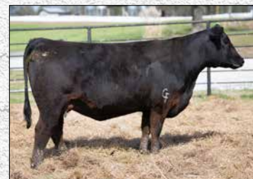
Dam of Highwayman