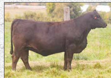
Full sister to Muscle Man