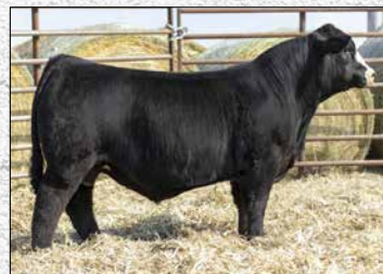
KBHR Revolution H071, Sire of Screenshot