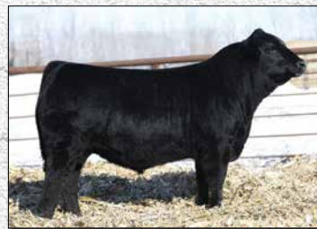
KRJ HZN Direct Impact F805, Sire of Dakota Pride