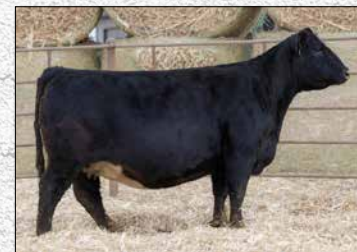
Dam of Limitless