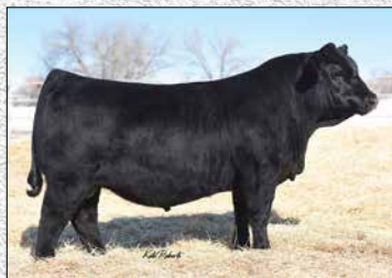
Hook's Eagle 6E, Sire of Anthem