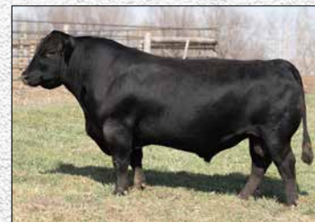
Hook's Galileo 210G, Maternal brother to Journey