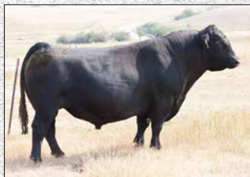
Sire of JCJ741L