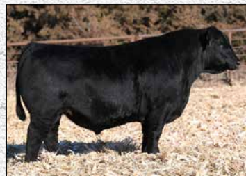
$100,000 top seller at Bridle Bit Simmentals