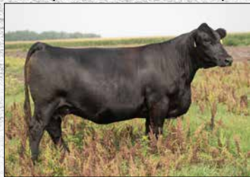
Dam of JCJ741L