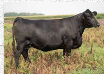
Donor dam of Journey