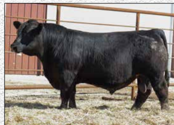
JC Lookout 10L, Countryman son