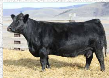
Sapphire, Dam of Logan