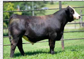
Stone Cold son