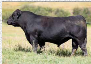
Sire of Red Progression