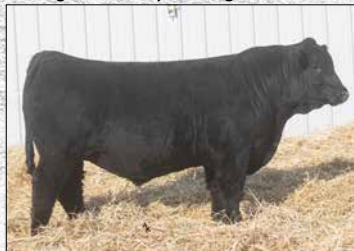
High selling Falcon son at Dakota Xpress