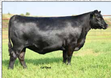
Maternal sister to Honor Code