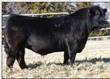
Mr SR 71 Right Now E1538, Sire of Gunpowder