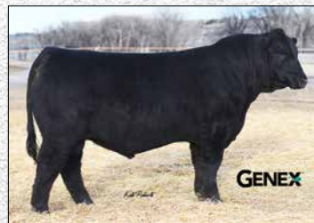
LBRS Genesis, Proclamation son