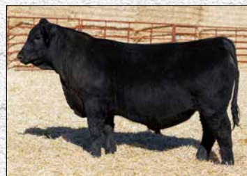
High Mark son