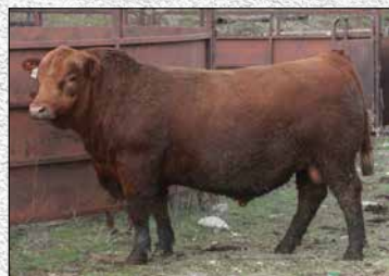
Mushrush Red Rush, Hollywood son