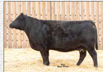
Dam of Country Club