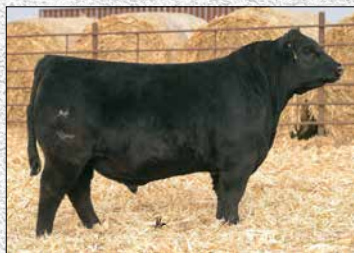
Sire of Hickok