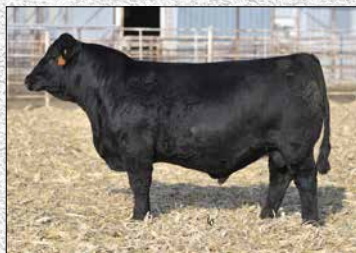
Encore son At Cow Camp Ranch