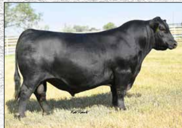
Sire of Supreme