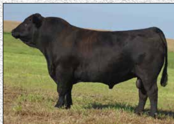
Maternal grandsire of Bonanza