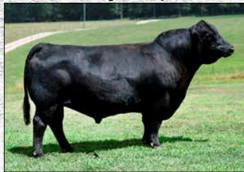
Sire of Leopold