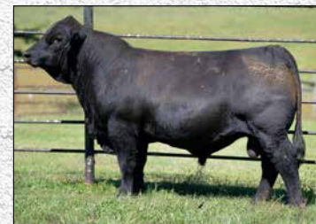
Sire of Haymaker Gibbs Hilltop 0062H,