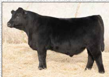
Son from Bred for Balance