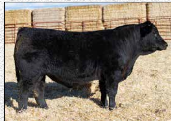
Total Power son