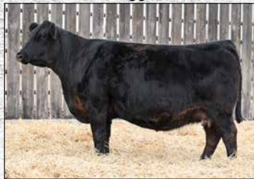
Dam of GTO