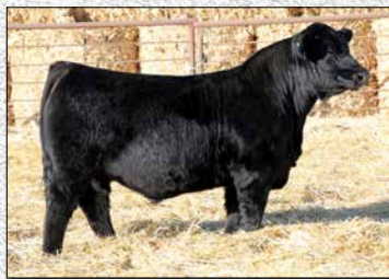
Reserve son from Eichacker Simmentals