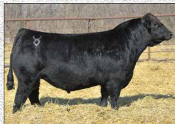
Sire of Haggard