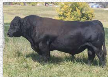
Redhill Countryman 81J, Sire of Lookout