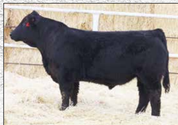
Frontline son at Barker Cattle Company