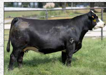
Stone Cold daughter