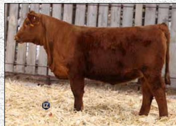
RFS Luna K63, full sister to Bruno