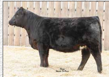
Dam of Morton