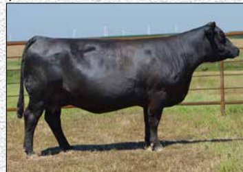
Dam of Bedrock