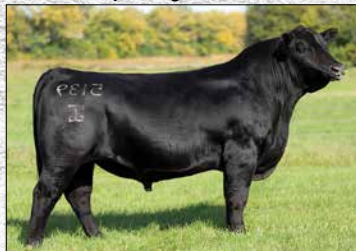
Sire of Supreme