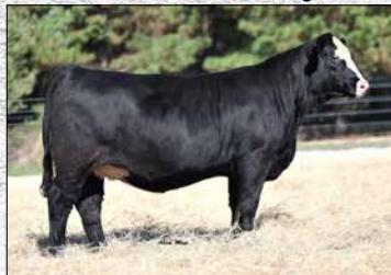
Baxley Farms L104, Daughter