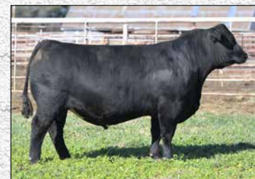
Sire of Primal