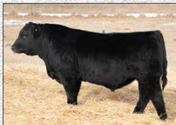
CLRS Mutual Fund 246M $21,000 son sold on the Bred for Balance Sale