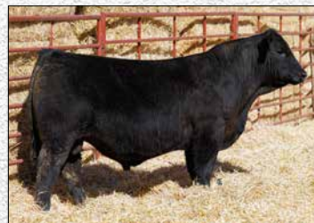
Medicine Man son