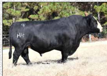
BXFM Guacho H4, Sire of Stoney Run