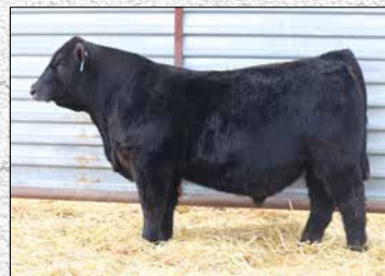
Special Ops son