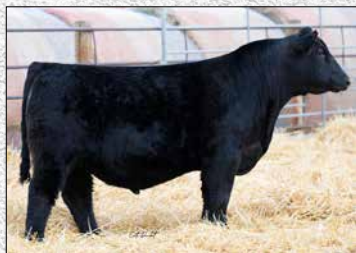
Homeland son from Black Summit