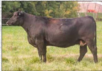
Donor female for JC Simmental in Michigan