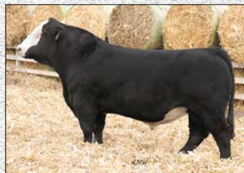
BAS Money Maker, Maternal brother to Mega Millions