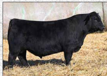
Global son from 2024 Gold Bullion Sale