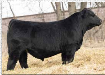
Five Star Jackson J10, Sire of Jack Red