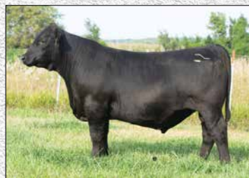
Sire of Lawless