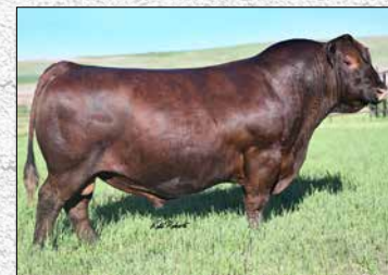
Sire of Pilot