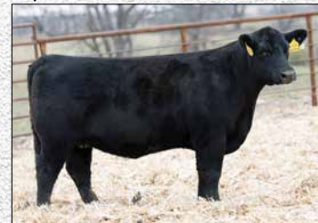
High Road daughter