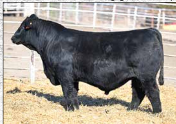
TJ 504M $60,000 high seller at the Triangle J Sale