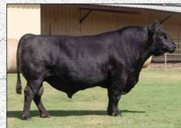
Maternal grandsire of Mesquite