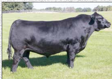
TJ Gold 274G, Maternal grandsire of Say When