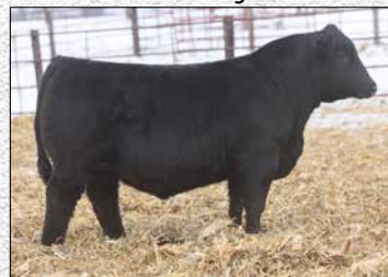
Wildberry Paton K059, Resource son