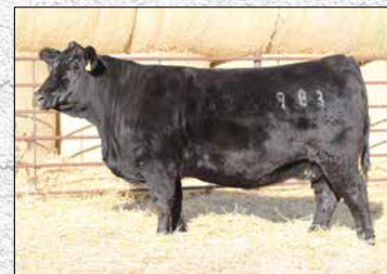
LRS Ms Eagle 983G, Dam of Dutton