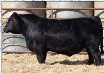
JC Minute Man, Jesse James son