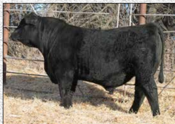
Sire of Top Dollar