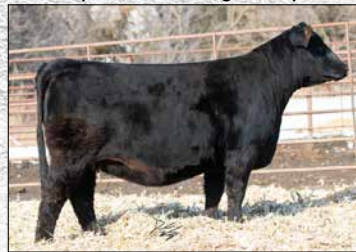
Dam of Haggard