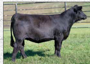
Dam of Maestro