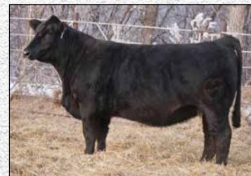
Dam of Fury Road