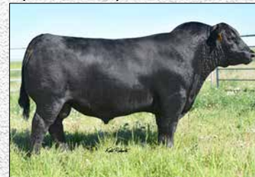
Sire of Mesquite