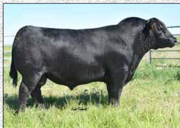
Sire of Mojave