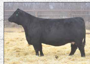
Dam of Summit