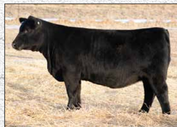
Next Up daughter