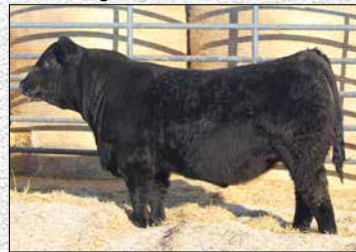
SRF Pivot, Global son