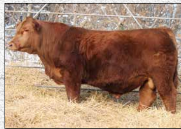
High selling son of All American from KBHR