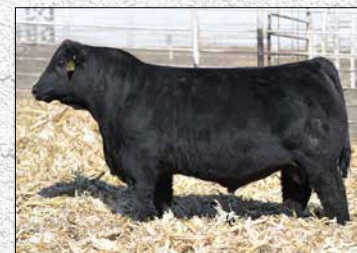
KBHR Bold Ruler J152, Sire of Bold Move