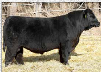
Sire of Undisputed