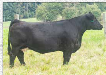
Grandam of Minute Man