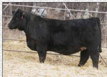
Dam of Revelation