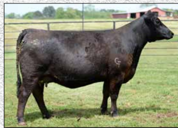
Dam of Kingpin