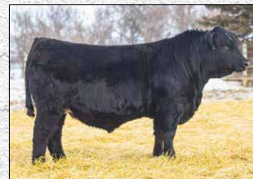
HABR Forefront M470, son of Forefront