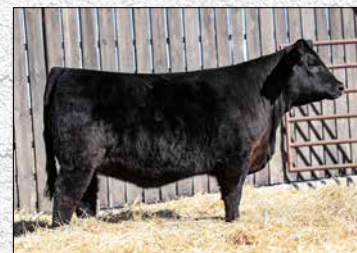
Full sister to Country Club