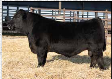
CLRS King James 616K, Sire of High & Mighty