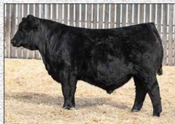
Bridle Bit GTO, Pontiac son