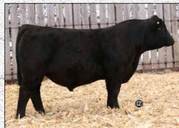
KBHR Global J138, Sire of Pivot