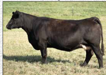
Full Figures daughter