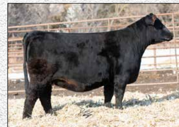
Dam of Krown