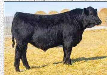
HABR Forefront M462, son of Forefront