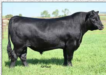
Maternal brother to Honor Code