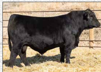
RFS Credentials, Essential son