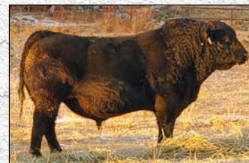
Sire of Summit