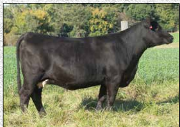
Dam of High & Mighty