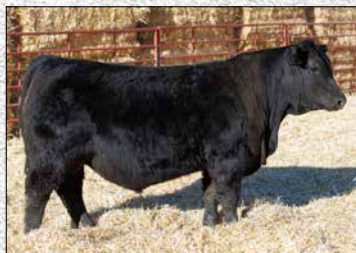
Jesse James son