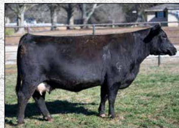
Dam of Culmination