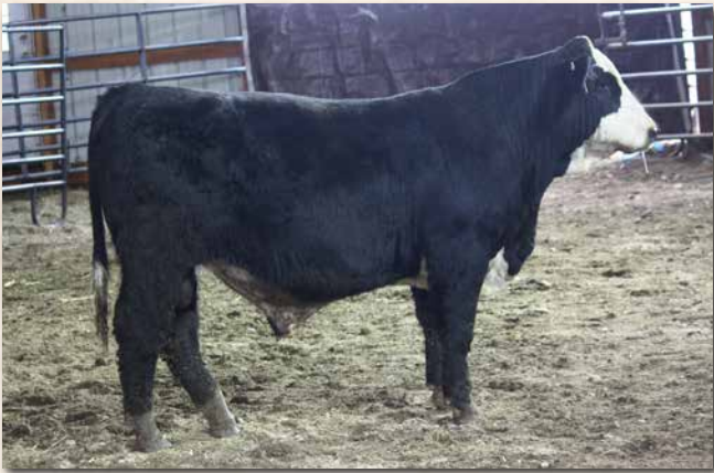
LYMANS STONECOLD L750 Sells as Lot 41.