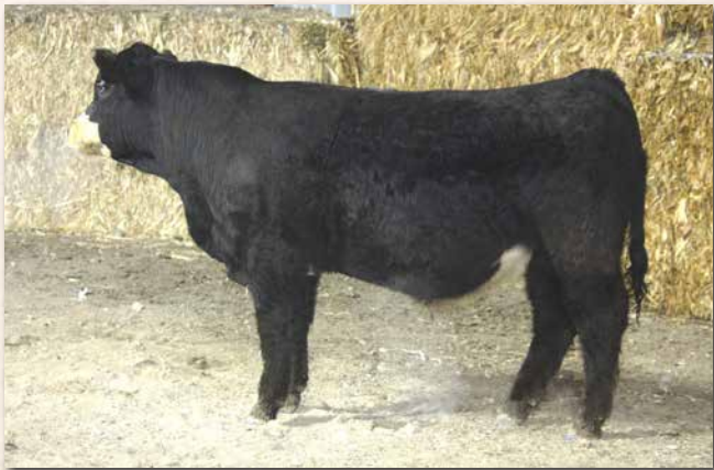
LYMANS STEPPING STONE L752 Sells as Lot 102.