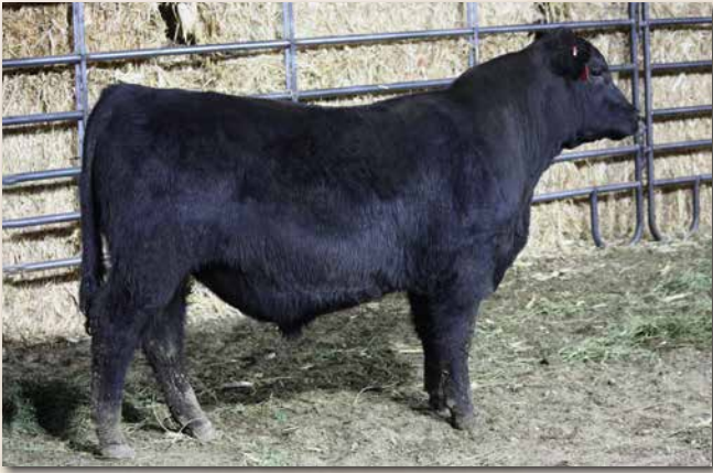
LYMANS PATRIARCH M62 Sells as Lot 56.