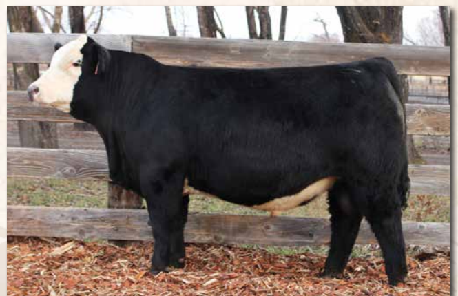
TFS OUTLAW 9790G Sire of Lots 24-26, 43-50, 73-75.