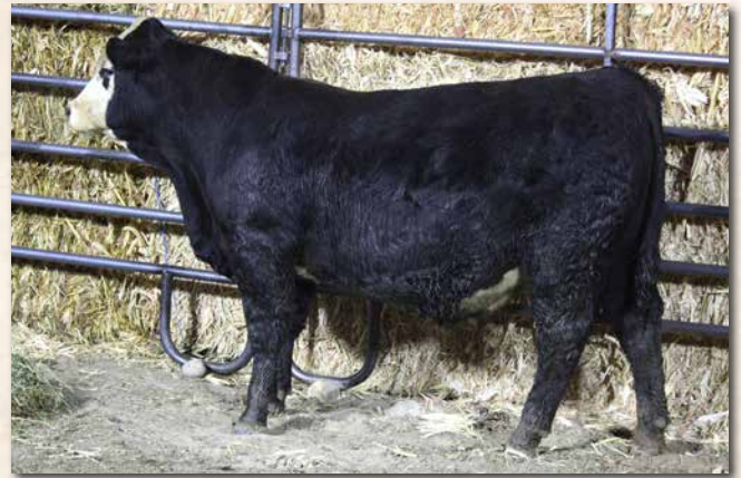
LYMANS OUTLAW M38 Sells as Lot 43.