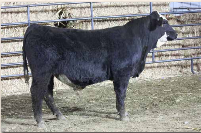
LYMANS STONECOLD M103 Sells as Lot 42.

Semen tested and Breeding Soundness evaluated - guaranteed to work.