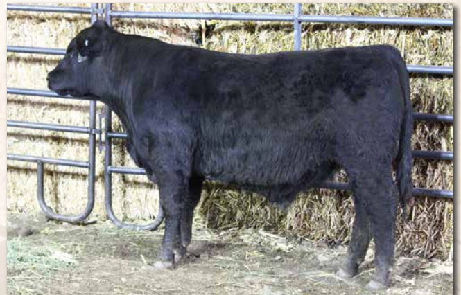
LYMANS FINAL ANSWER M98 Sells as Lot 100.