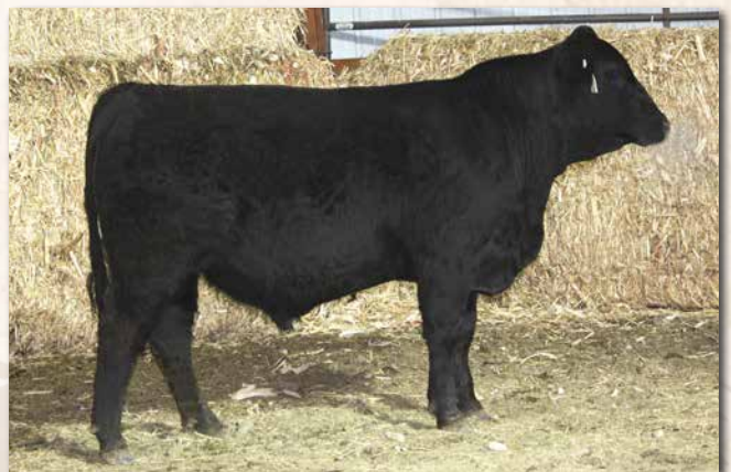
M16 Sells as Lot 70.