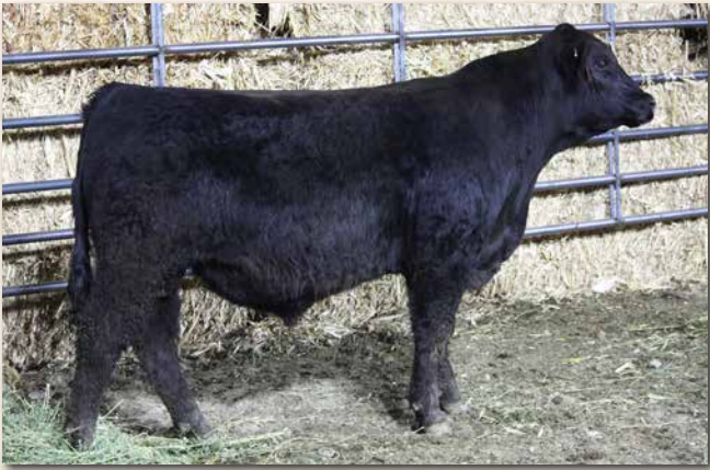
LYMANS PROGRESSIVE M58 Sells as Lot 37.

LOT 37 LYMANS PROGRESSIVE M58 ♂GGP 3/4 SM 1/4 AN M58 ASA# 4449048 BLACK, POLLED 1/27/2024 BW 82 WW 674 PAP 41