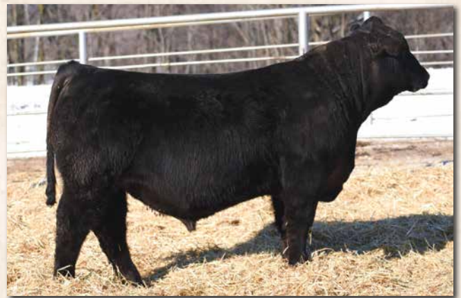
J-J ZINSER 514C Paternal grandsire of Lot 10.

DNA tested and RightMate scored - adding more value to your purchase.