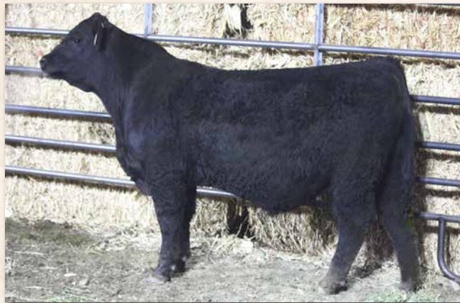
LYMANS PROGRESSIVE M45 Sells as Lot 22.