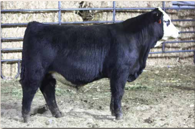
LYMANS OUTLAW M47 Sells as Lot 47.