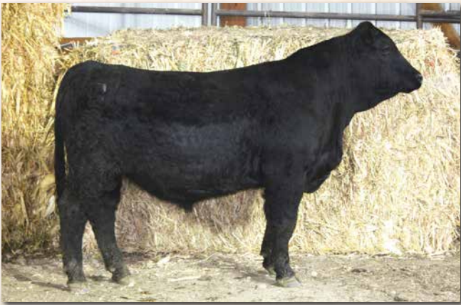
LYMANS STONECOLD M6 Sells as Lot 40.