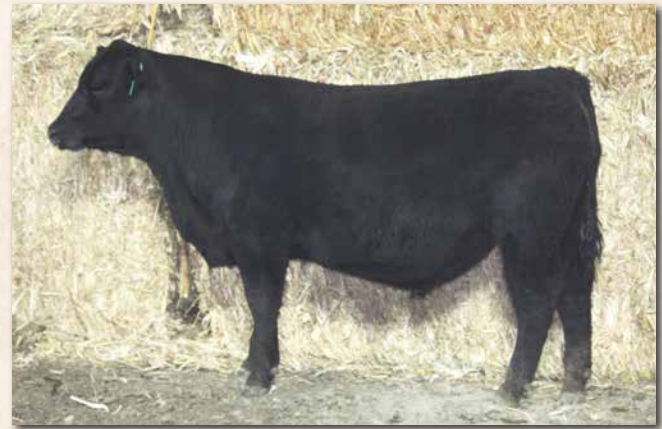
LYMANS JENKINS M125 Sells as Lot 38.

Jenkins was our selection in the 2022 Bred for Balance sale. His progeny are moderate at birth and really grow. He is stamping his calves with exceptional phenotype with tons of rib and volume. To top it off his progeny PAP test very well.