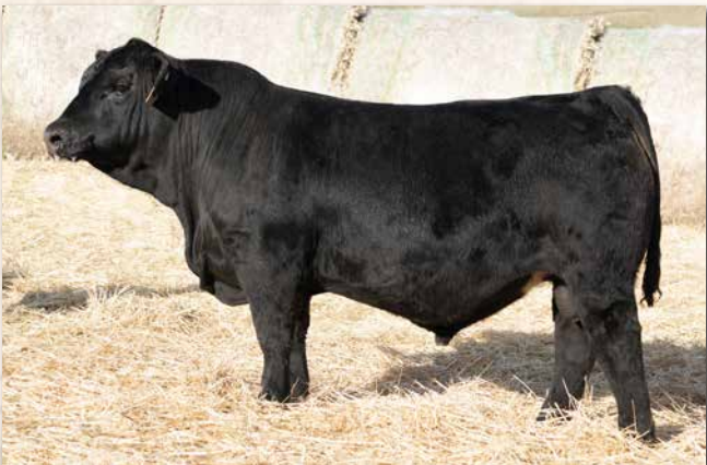
CLRS JENKINS 616J Sire of Lots 21, 38, 39, 86, 87.