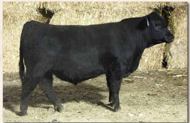
LYMANS OUTLAW M33 Sells as Lot 89.