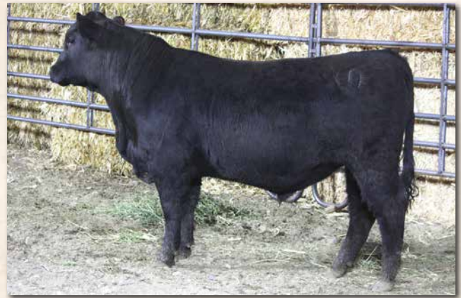
LYMANS GREAT WEST M30 Sells as Lot 27.