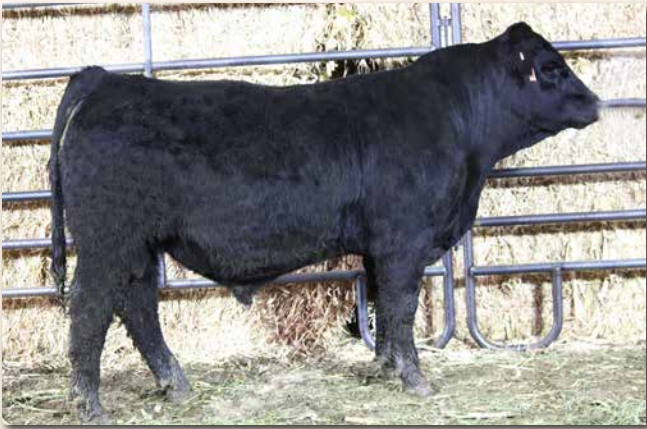
LYMAN'S PROUD M27 Sells as Lot 31.