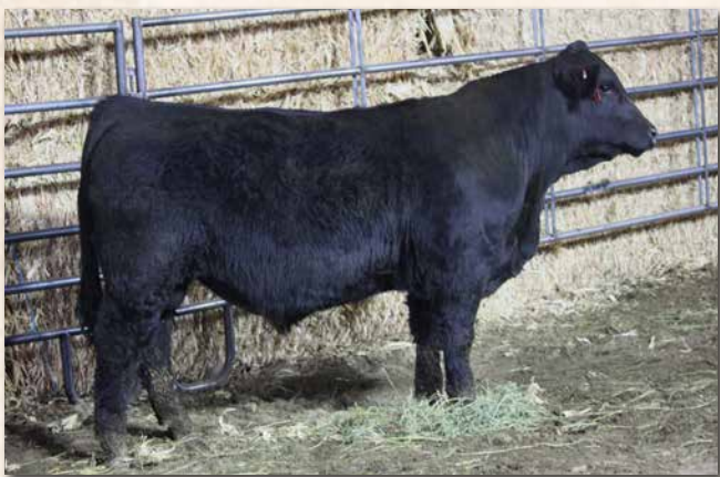
LYMANS OUTLAW M20 Sells as Lot 24.