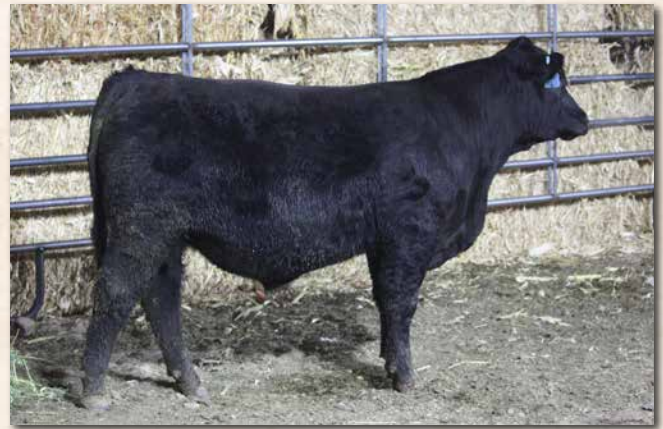
LYMANS OUTLAW M61 Sells as Lot 88.