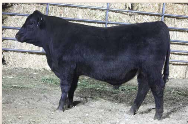
LYMANS PATRIARCH M97 Sells as Lot 55.