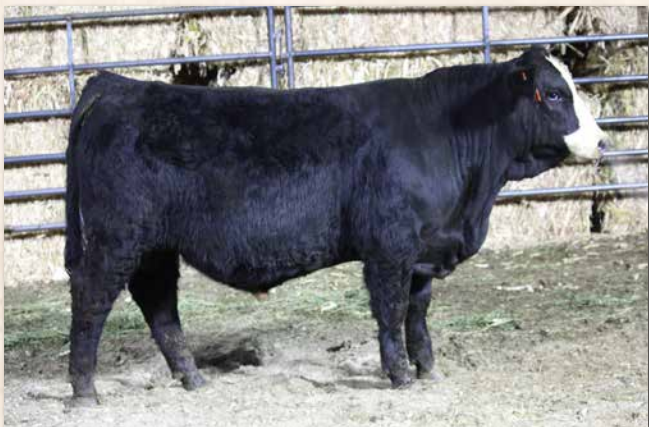
LYMAN'S PROUD M95 Sells as Lot 64.