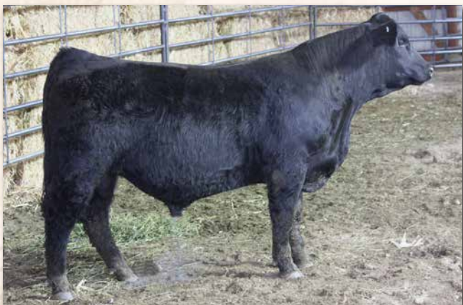
LYMANS GLOBAL M68 Sells as Lot 17.