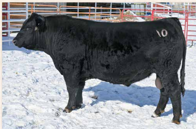
ASR AMERICAN PROUD H0301 Sire of Lots 1-4, 29-31, 61-64, 76-83.