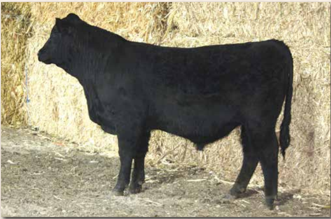
LYMANS CAVALRY M5 Sells as Lot 94.