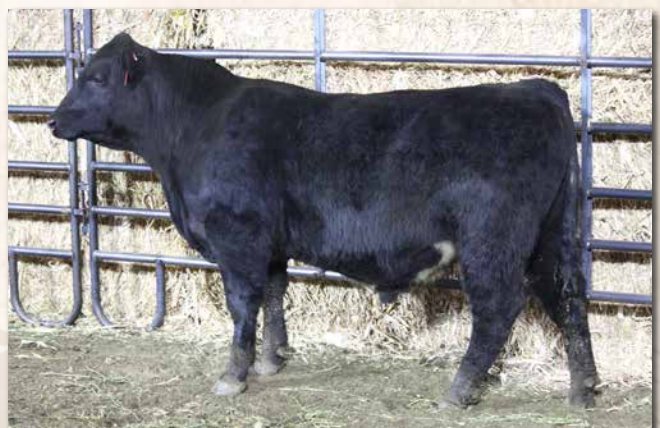
LYMANS MEDICINE MAN M35 Sells as Lot 9.