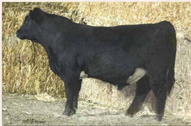
LYMANS STEPPING STONE L75I Sells as Lot 23.