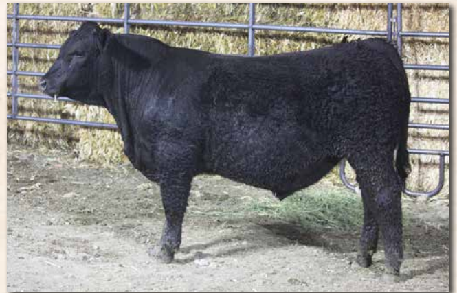
LYMANS PROUD M26 Sells as Lot 2.