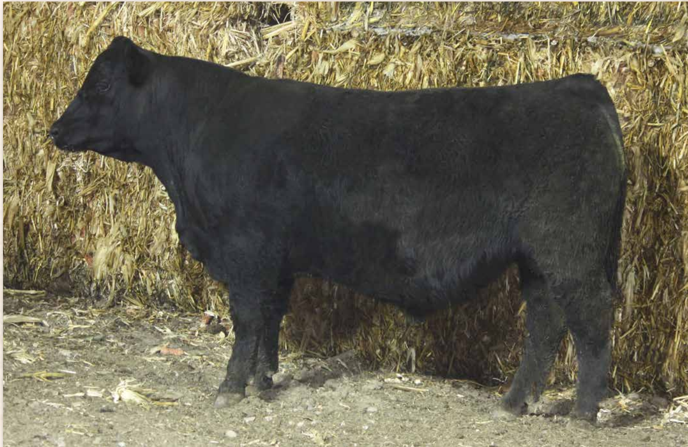
LYMANS MEDICINE MAN M21 Sells as Lot 5.