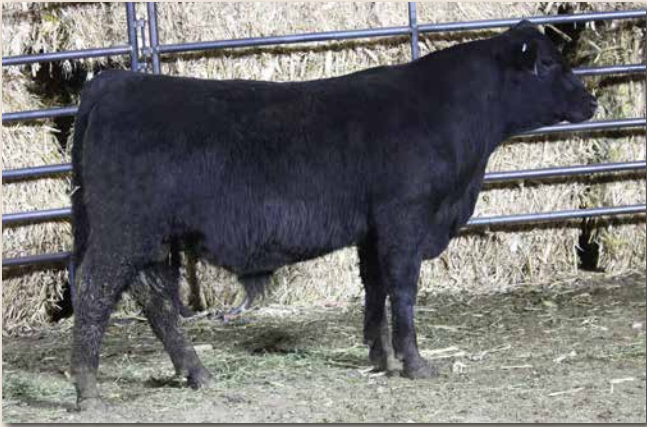
LYMANS CAVALRY M77 Sells as Lot 57.