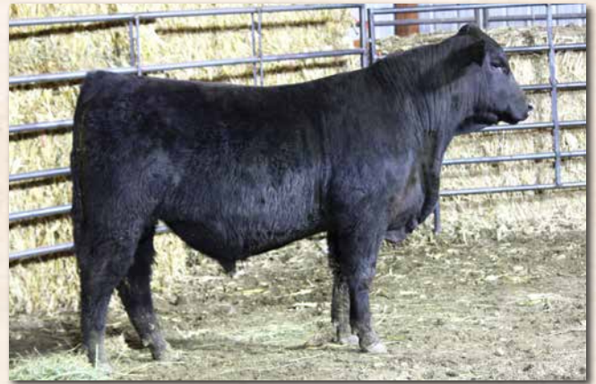
LYMANS GREAT WEST M19 Sells as Lot 18.

LOT 19 LYMANS GREAT WEST M88 ♂GGP 1/2 SM 1/2 AN M88 ASA# 4449075 BLACK, POLLED 2/8/2024