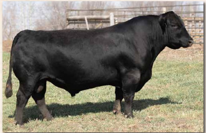
HOOK'S GALILEO 210G Sire of Lots 11-15, 33-36, 69.