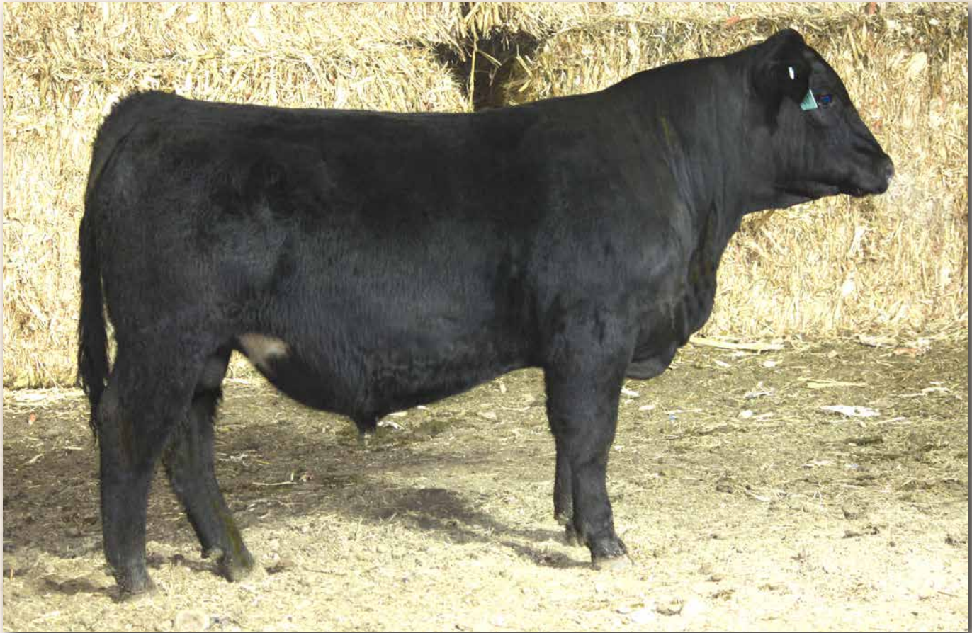
LYMANS GLOBAL M116 Sells as Lot 16.