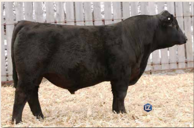
KBHR GLOBAL J138 Sire of Lots 16, 17, 67, 68