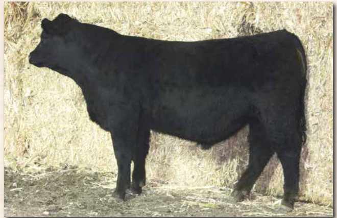
LYMANS MEDICINE MAN M13 Sells as Lot 6.