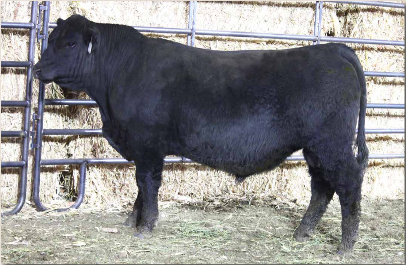
LYMANS BOOMER L755 Sells as Lot 20.