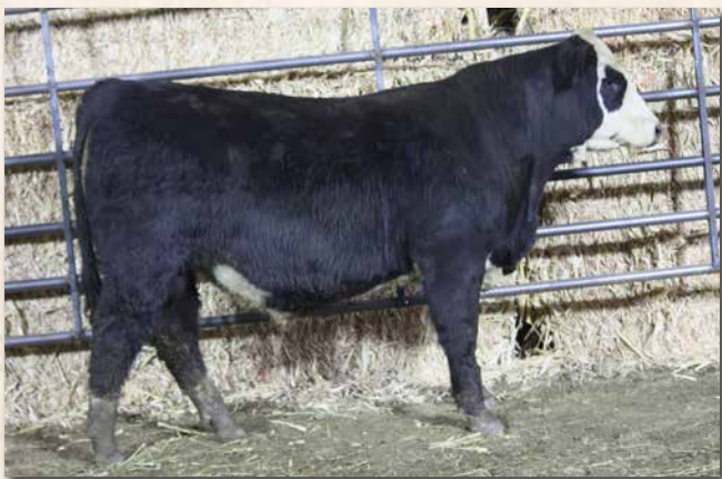
LYMANS OUTLAW M40 Sells as Lot 25.