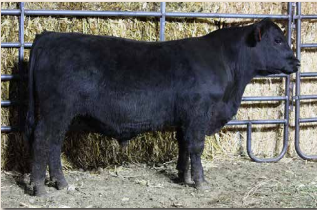
LYMAN'S CAVALRY M49 Sells as Lot 32.

LOT 31 LYMAN'S PROUD M27 ♂GGP 1/2 SM 3/8 AN 1/8 GV M27 ASA# 4449018 BLACK, POLLED 2/10/2024 BW 81 WW 752 PAP 37