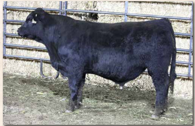
LYMANS GREAT WEST M41 Sells as Lot 28.