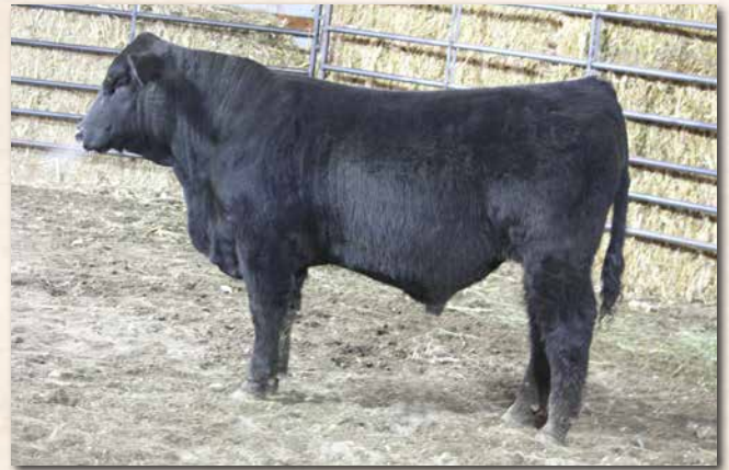
LYMANS GREAT WEST M60 Sells as Lot 96.