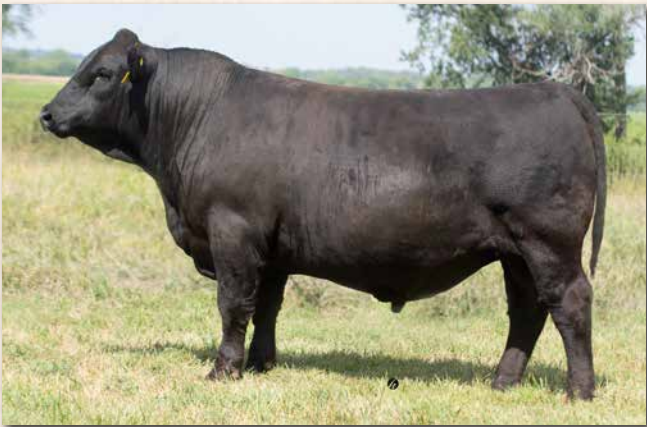
IR/JLN BOOMER J425 Sire of Lot 20.