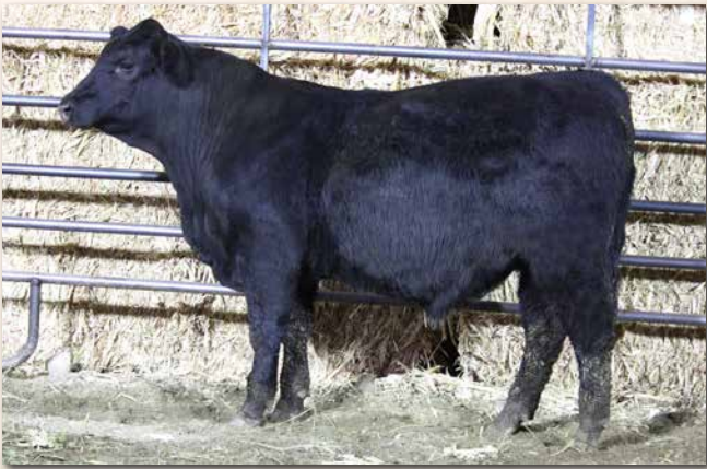
LYMANS UNITED M119 Sells as Lot 92.