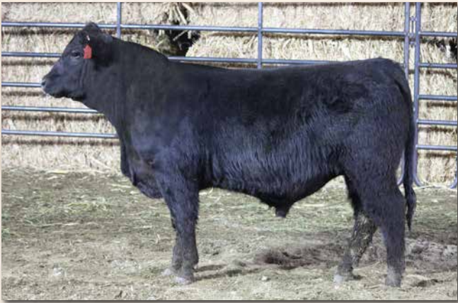
LYMANS CAVALRY M78 Sells as Lot 93.