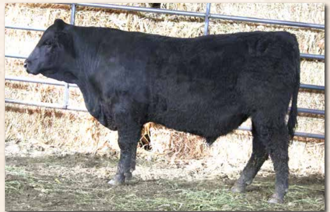
LYMANS OUTLAW M86 Sells as Lot 44.