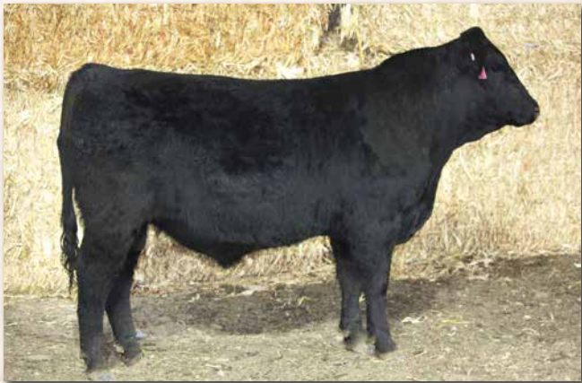
LYMAN'S PROUD M118 Sells as Lot 61.