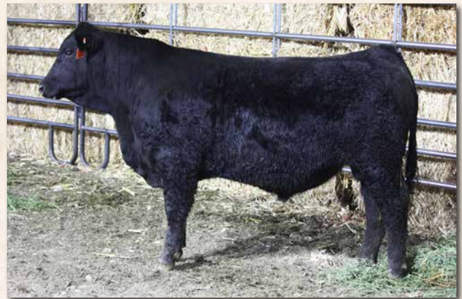
LYMANS PROUD M11 Sells as Lot 29.