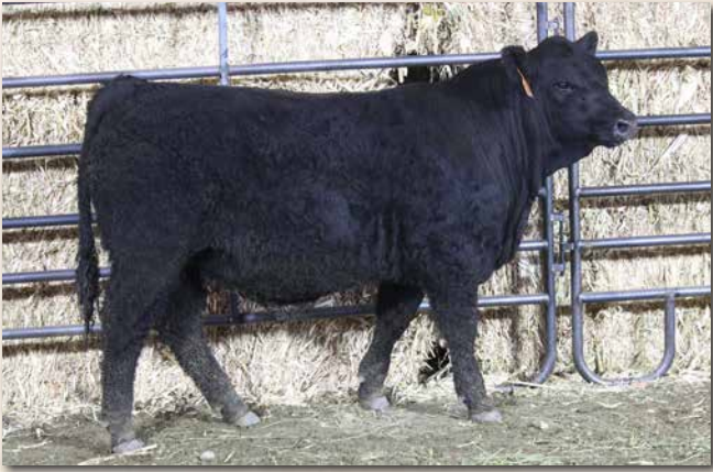
LYMAN'S PROUD M126 Sells as Lot 80.

LOT 80 LYMAN'S PROUD M126 ⚡GGP PB SM MI26 ASA# 4449109 BLACK, POLLED 1/26/2024 BW 88 WW 748 PAP 30