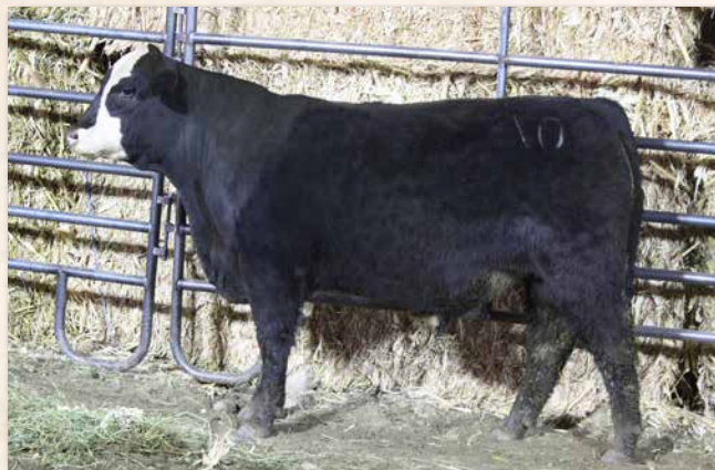
LYMANS OUTLAW M94 Sells as Lot 75.