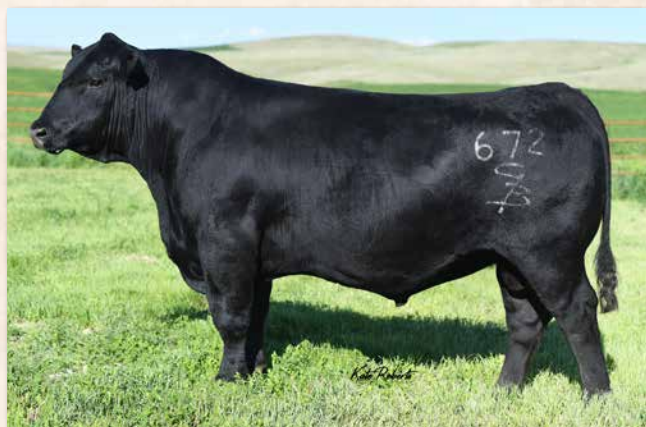
GB FIREBALL 672 Sire of Lots 52, 53.