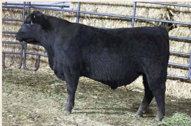
LYMANS PATRIARCH M59 Sells as Lot 51.