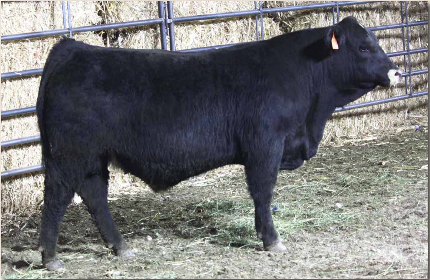
LYMANS PROUD M102 Sells as Lot 1.

LOT 1 LYMANS PROUD M102 ♂GGP 5/8 SM 3/8 AN M102 ASA# 4449086 BLACK, POLLED 2/13/2024 BW 80 WW 808 PAP 37