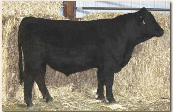
LYMANS HIGHLIFE M108 Sells as Lot 66.