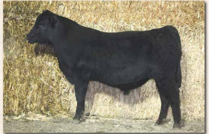
LYMANS CHERRY M117 Sells as Lot 60.