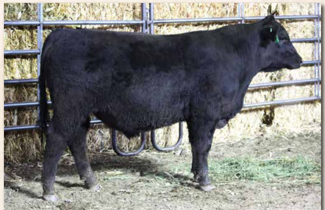
LYMANS GALILEO M120 Sells as Lot 12.