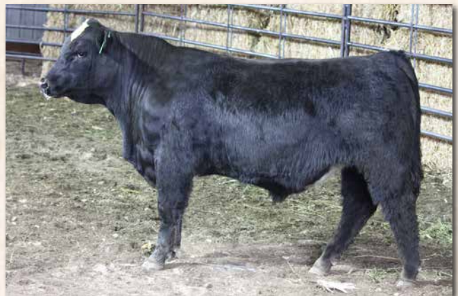
LYMANS MEDICINE MAN M89 Sells as Lot 8.