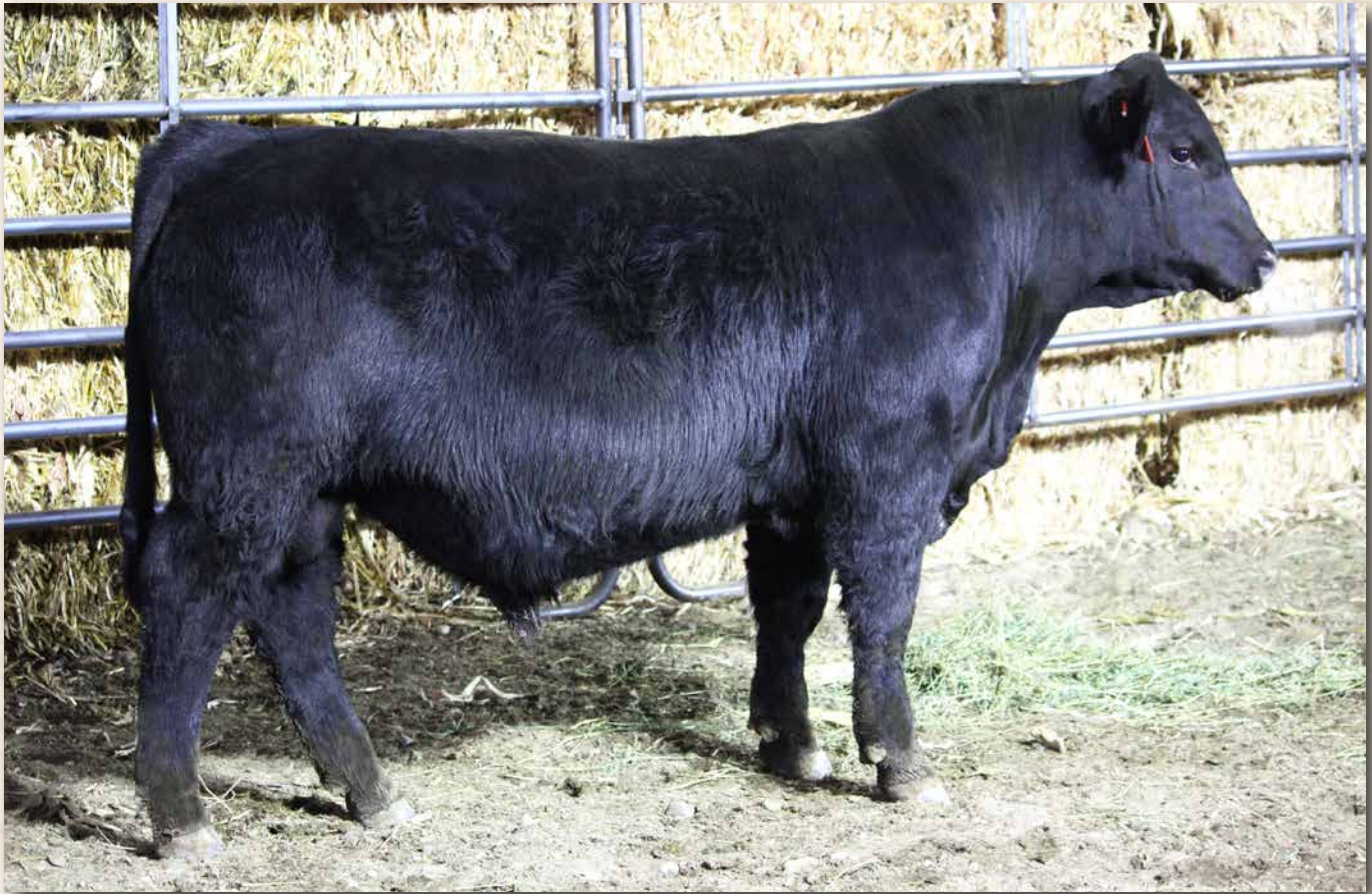
LYMANS ZINSER M15 Sells as Lot 10.