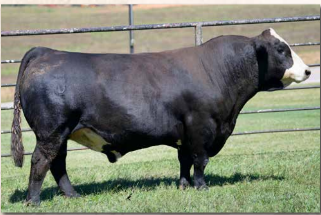
TJ STONE COLD 336G Sire of Lots 41, 42, 84, 85.

LOT 85 LYMAN'S STONECOLD M54 ⚡GGP 1/2 SM 1/2 AN M54 ASA# 4449043 BLACK, POLLED 1/1/2024 BW WW 778 PAP 39