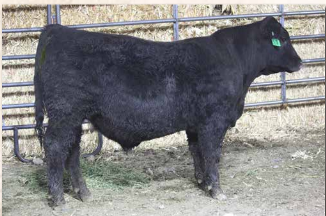
LYMANS OUTLAW M29 Sells as Lot 26.

LOT 24 LYMANS OUTLAW M20 ♂GGP 1/2 SM 1/2 AN M20 ASA# 4449011 BLACK, POLLED 2/4/2024