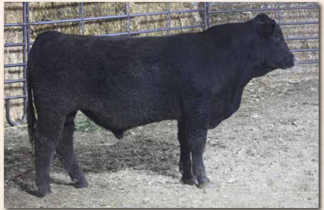
LYMANS GLOBAL M81 Sells as Lot 68.