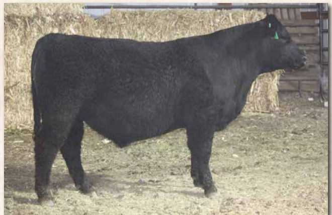
LYMANS GALILEO M31 Sells as Lot 13.