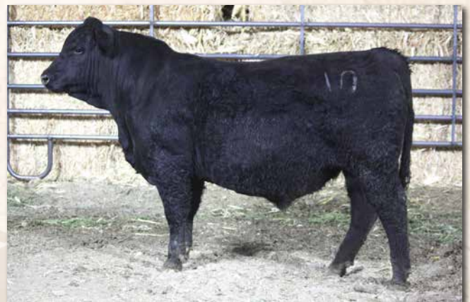
LYMANS PROUD M123 Sells as Lot 4.