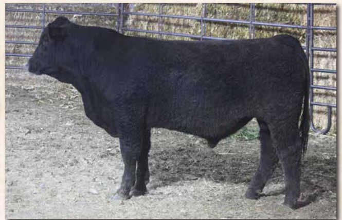
LYMANS OUTLAW M85 Sells as Lot 45.