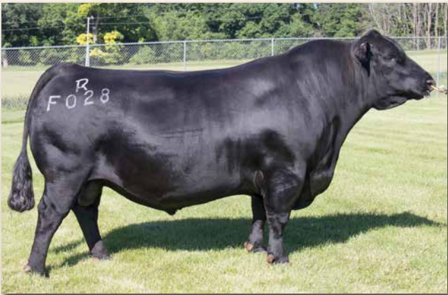
TEHAMA PATRIARCH F028 Sire of Lots 51, 54-59.