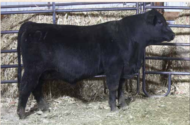
LYMANS PATRIARCH M17 Sells as Lot 59.