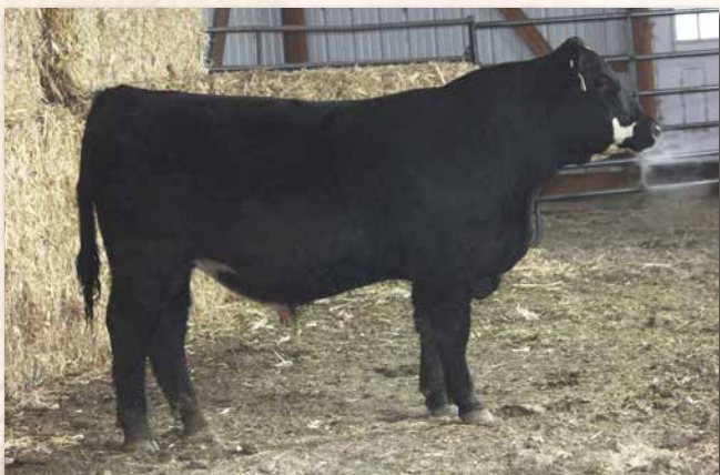
LYMAN'S STEPPING STONE L754 Sells as Lot 65.