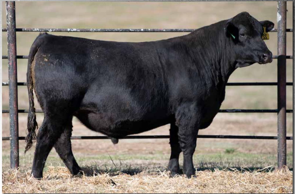
GIBBS 3482L KENNY ROGERS Sells as Lot 22.

We start the SimAngus bulls with a Kenny Rogers son that is a true heifer bull that is loaded with WW and YW. The Kenny Rogers sire group were our high selling sire group in our fall sale for a good reason. Look for this bull to be a heifer safe option out of this sire and improve marbling.