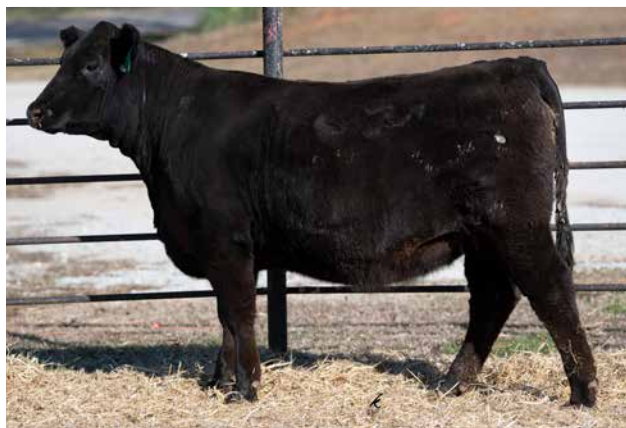
GIBBS 3083L MABELLE 1367J Sells as Lot 86.

• Bred 11/29/24 to TJ STONE COLD 336G, then pasture exposed to GIBBS JAM UP 2044K from 12/3 to 1/25. Calving date and planned mating EPDs available sale day.