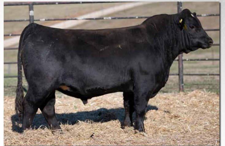
GIBBS 3519L Sells as Lot 47.