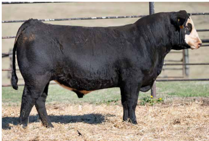
GIBBS 3231L RESERVE Sells as Lot 12.