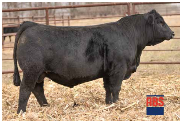
CCR BEDROCK 5171J