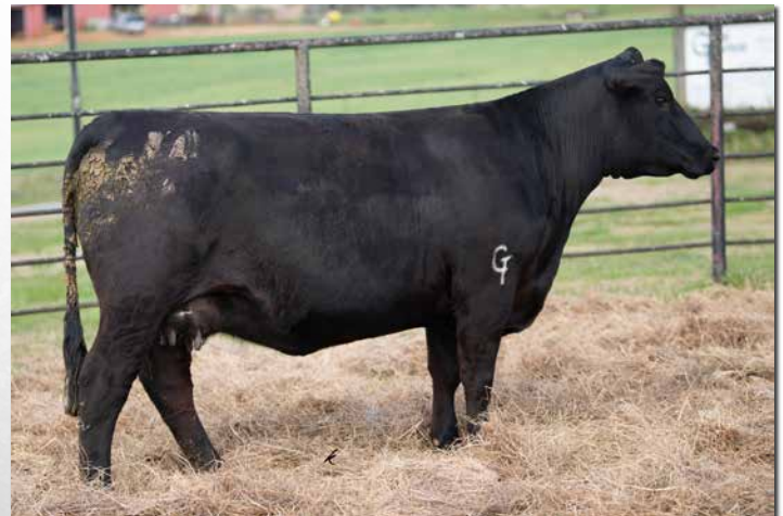
GIBBS 0038H STAR 0532X Dam of Lot 7.