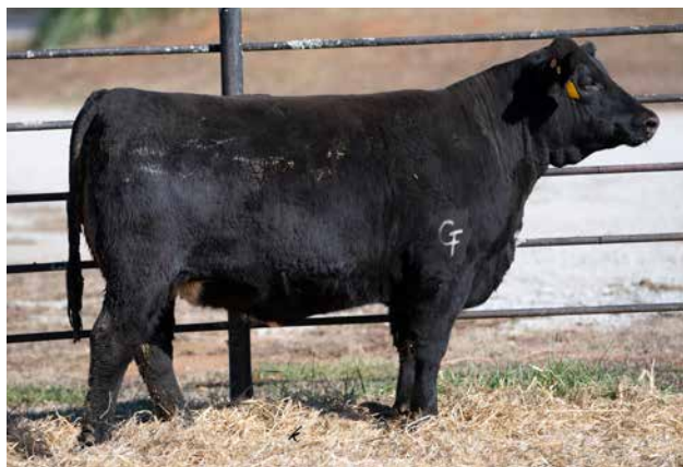
GIBBS 3076L MABELLE 1078J Sells as Lot 113.

• Bred 11/29/24 to GIBBS KINGPIN 1140J, then pasture exposed to GIBBS 8127F PROPEL from 12/3 to 1/25. Calving date and planned mating EPDs available sale day.