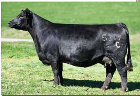
GIBBS 5319C LOUISE Y534 Dam of Lot 74.

74 GIBBS 3309L LOUISE 5319C ØGGP Homozygous Black ASA #4284705 Homozygous Polled 3309L 1/2 SM 1/2 AN BD: 9/9/2023