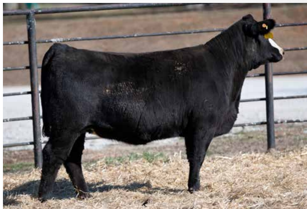
GIBBS 3510L Sells as Lot 85.

• Bred 11/29/24 to GIBBS HILLTOP 0062H, then pasture exposed to GIBBS 8127F PROPEL from 12/3 to 1/25. Calving date and planned mating EPDs available sale day. BALDY