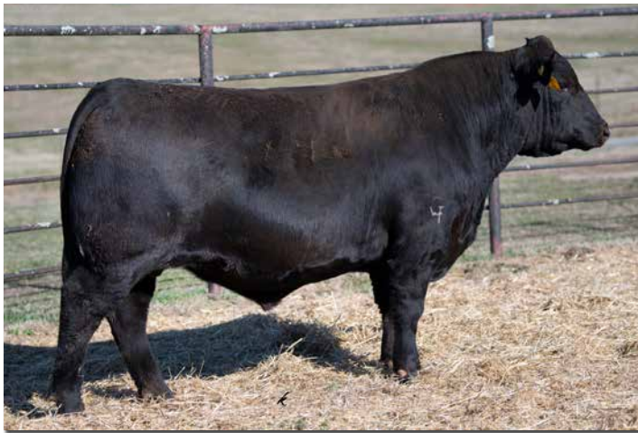
GIBBS 3470L ESSENTIAL Sells as Lot 21.