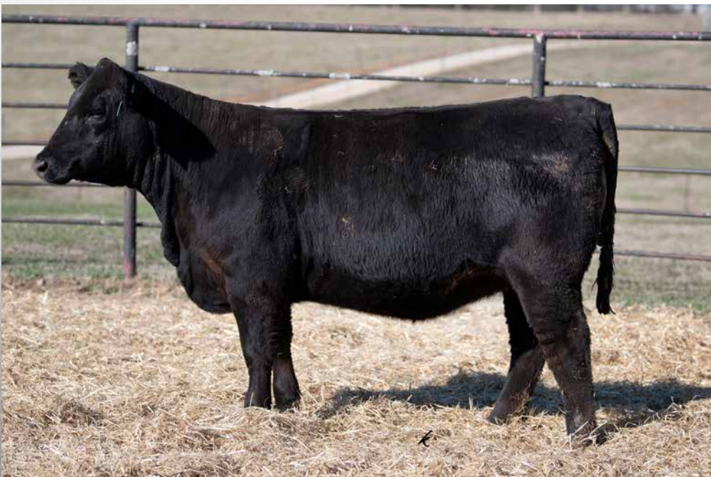
GIBBS 3164L REL 7346E Sells as Lot 75.

• Bred 11/29/24 to GIBBS 9114G ESSENTIAL, then pasture exposed to GIBBS 8127F PROPEL from 12/3 to 1/25. Calving date and planned mating EPDs available sale day.