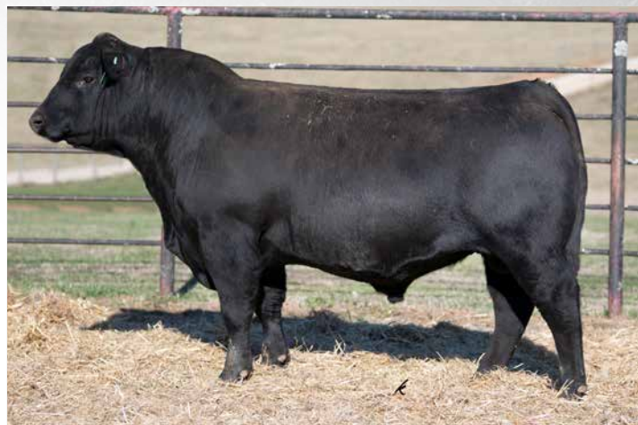
GIBBS 3685L GENERAL Sells as Lot 37.