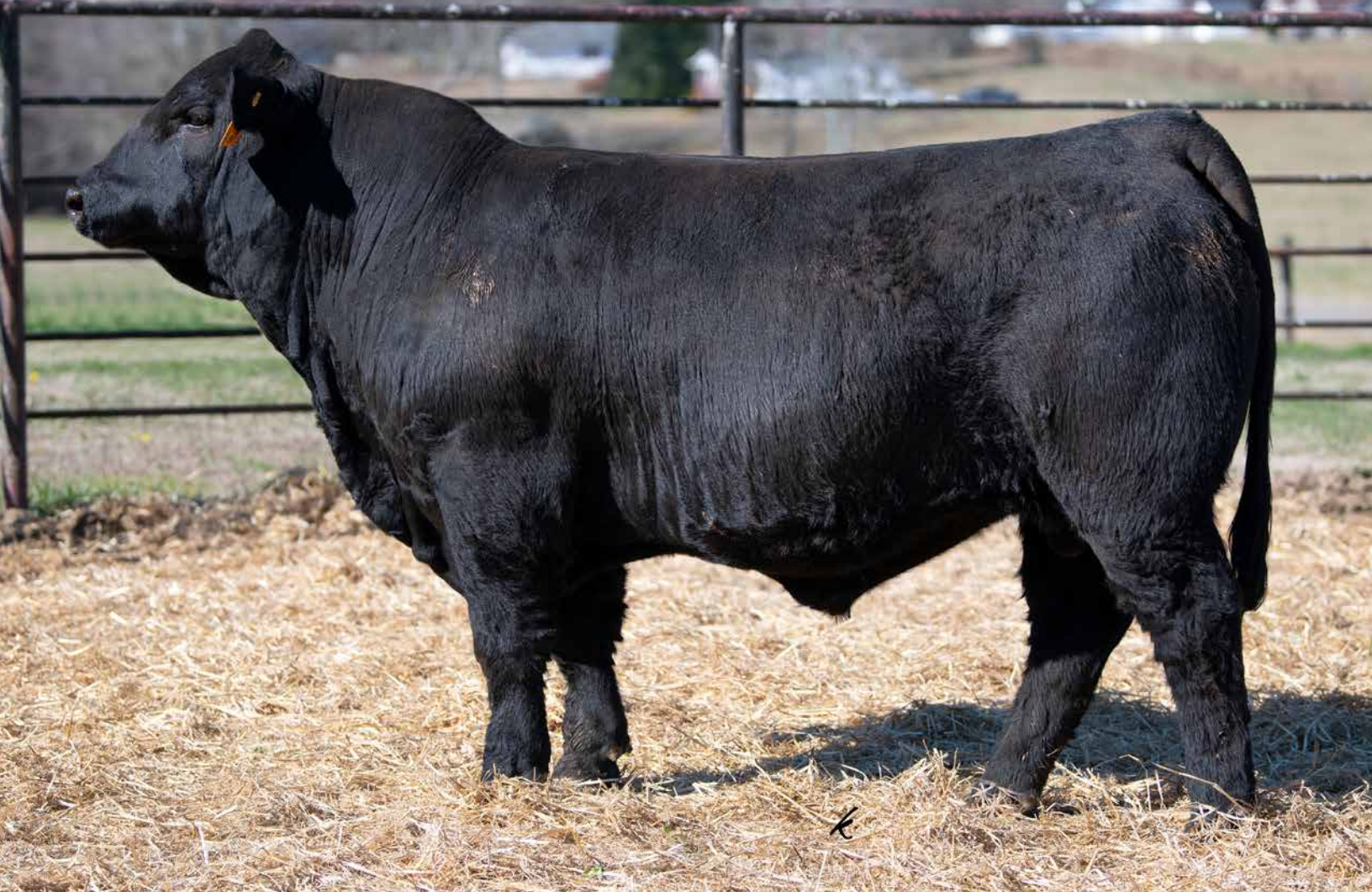
GIBBS 3516L HONOR Sells as Lot 1.