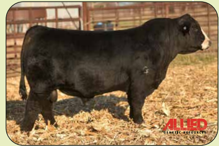
GIBBS BLAZER 3L02