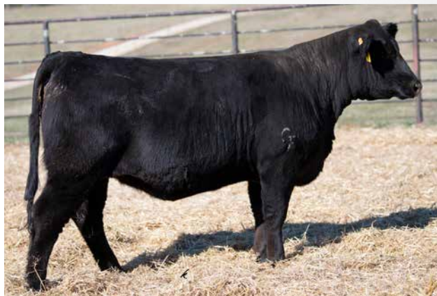
GIBBS 3443L MABELLE 7016E Sells as Lot 79.

• Bred 11/29/24 to GIBBS KINGPIN 1140J, then pasture exposed to GIBBS 8127F PROPEL from 12/3 to 1/25. Calving date and planned mating EPDs available sale day.