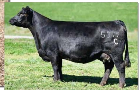
GIBBS 5319C LOUISE Y534 Dam of Lot 23.

We saved this Deadwood son to be a sale highlight in this spring sale. He as ET calf that we have loved since day one. He is a spread bull that excels in carcass merit as well as eye appeal. Sired by the $500,000 deadwood bull and backed by the LOUISIE cow family, you can not go wrong with this one.