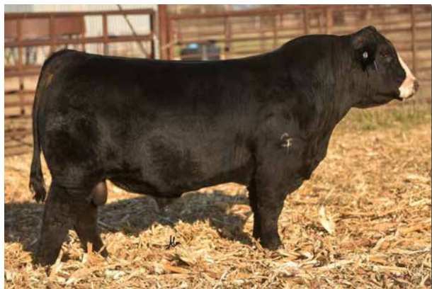
GIBBS BLAZER 3L02