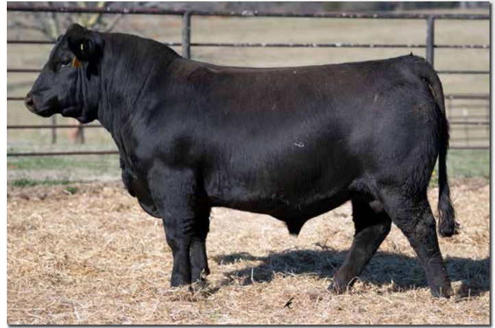
GIBBS 3530L RESERVE Sells as Lot 6.