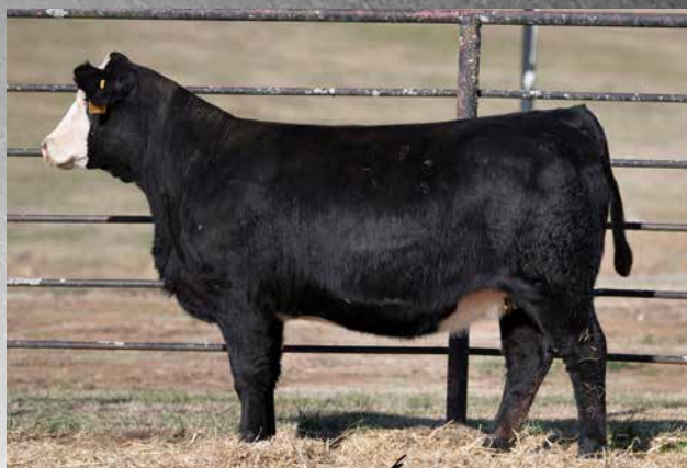
GIBBS 3456L JANET Y528 Sells as Lot 67.

• Bred 11/29/24 to GIBBS 9114G ESSENTIAL, then pasture exposed to GIBBS JAM UP 2044K from 12/3 to 1/25. Calving date and planned mating EPDs available sale day. BALDY