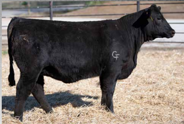
GIBBS 3135L Sells as Lot 76.

• Bred 11/29/24 to TJ STONE COLD 3366, then pasture exposed to GIBBS 8127F PROPEL from 12/3 to 1/25. Calving date and planned mating EPDs available sale day.