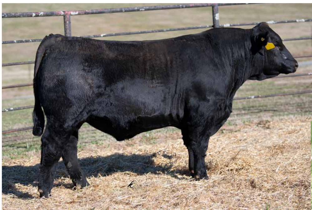
GIBBS 3461L DEADWOOD Sells as Lot 23.

We saved this Deadwood son to be a sale highlight in this spring sale. He as ET calf that we have loved since day one. He is a spread bull that excels in carcass merit as well as eye appeal. Sired by the $500,000 deadwood bull and backed by the LOUISIE cow family, you can not go wrong with this one.