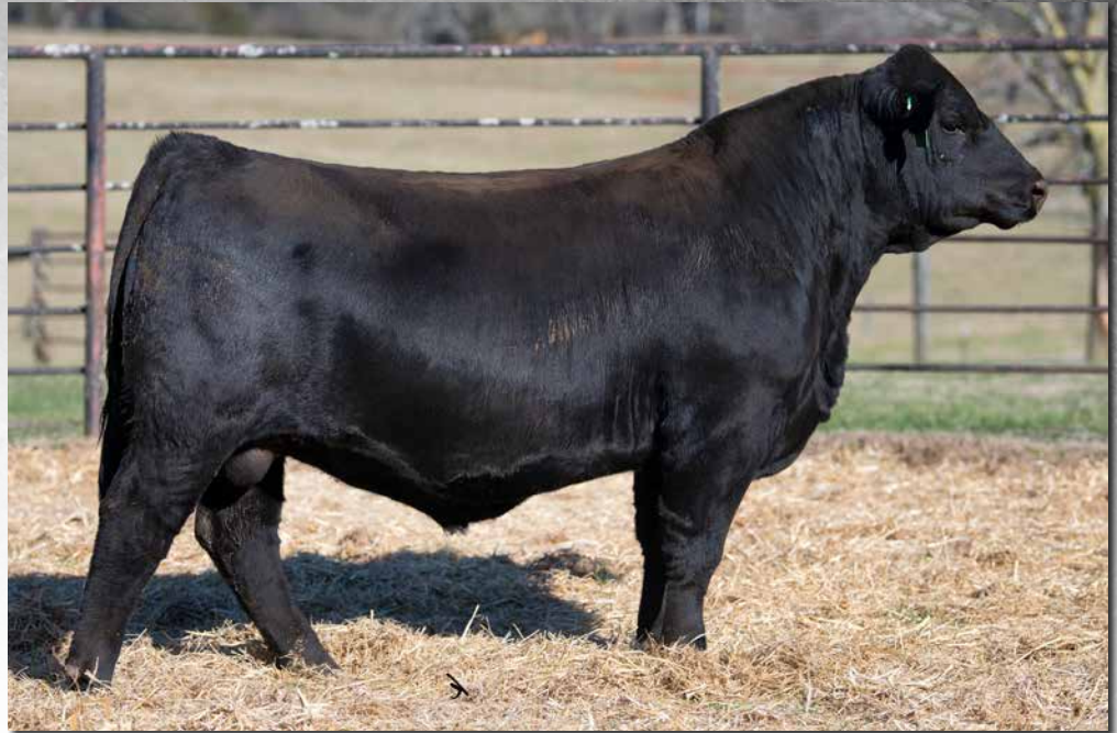
GIBBS 3611L CINCHED Sells as Lot 28.

This the looker of all the SimAngus bulls. This bull is physically dominant and extremely athletic. 3611L is a power bull that is guaranteed to add value to your next calf crop.