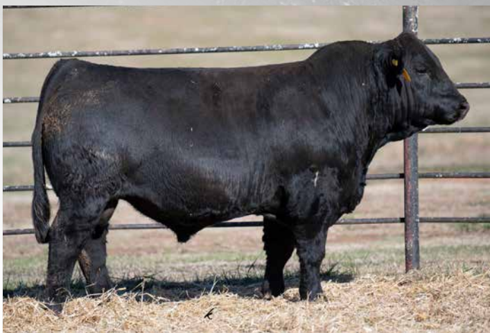
GIBBS 3555L HONOR Sells as Lot 3.