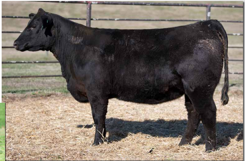
GIBBS 3309L LOUISE 5319C Sells as Lot 74.