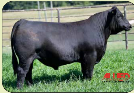
GIBBS PROSPERITY 3125L