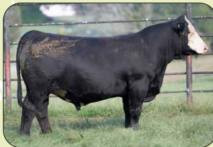
GIBBS LIGHTNING 3489L