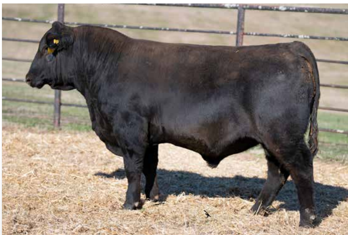
GIBBS 3L15 JERICO Sells as Lot 33.