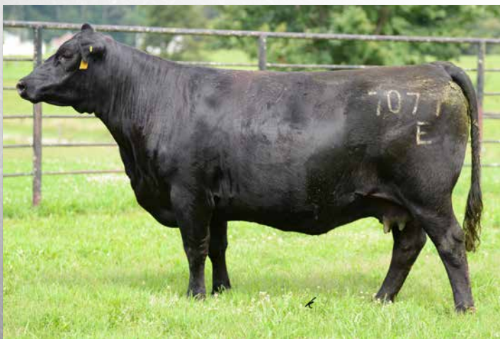
GIBBS 0700H LOUISE 7077E Dam of Lot 1.