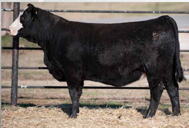
GIBBS 6206D CASSIA B208 Grandam of Lot 65.

66 GIF GIBBS 3537L JUDI 6476D ♀GGP Homozygous Black ASA #4284341 Homozygous Polled 3537L PB SM BD: 9/26/2023