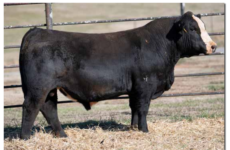
GIBBS 3514L Sells as Lot 48.

This bull is possibly the best option for a true baldy power bull. He will increase weaning weights and performance in your cow herd. He is admired for his striking eye appeal, bone, and shape. He goes back to the same cow family that produced the $55,000 high selling bull, GIBBS BLAZER 3L02.