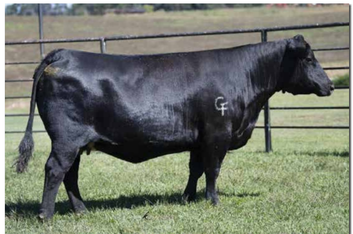
GIBBS 1346Y BLAKCAP9321W Dam of Lot 54.