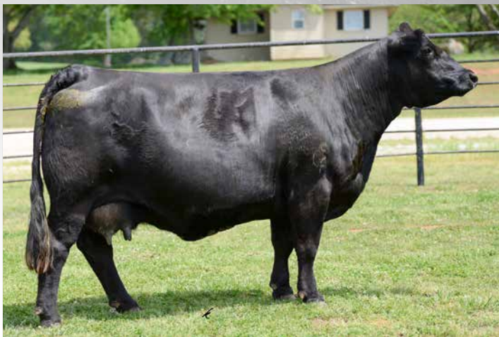
GIBBS 4181B STAR 2580Z Grandam to Lot 9.