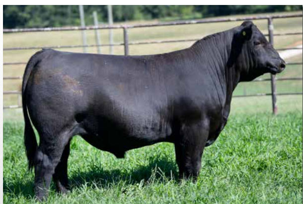
GIBBS PROSPERITY 3125L