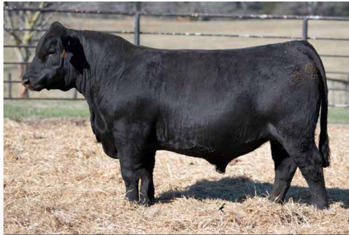
GIBBS 3620L RESERVE Sells as Lot 7.