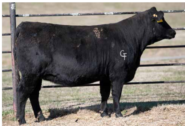
GIBBS 3089L JAUER 1180J Sells as Lot 90.

• Bred 11/29/24 to GIBBS KINGPIN 1140J, then pasture exposed to GIBBS JAM UP 2044K from 12/3 to 1/25. Calving date and planned mating EPDs available sale day.