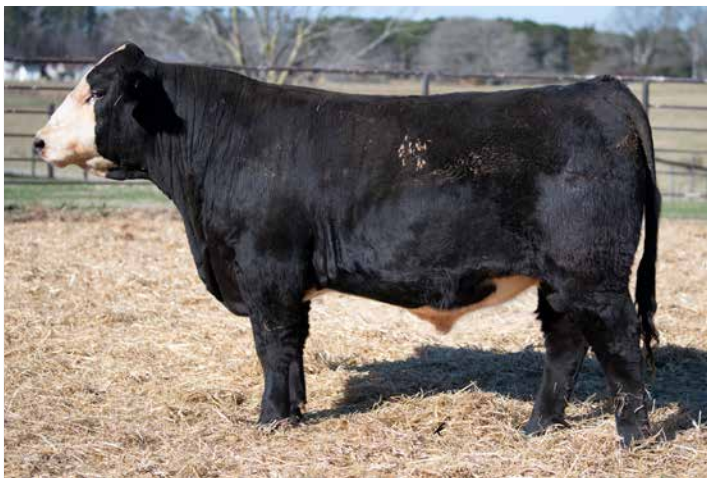
GIBBS 3319L GROUND BREAKER Sells as Lot 31.