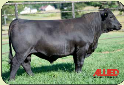
GIBBS FOUNDATION 3019L