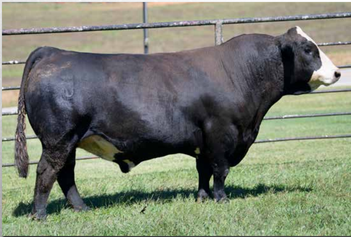
TJ STONE COLD 336G Sire of Lot 81.