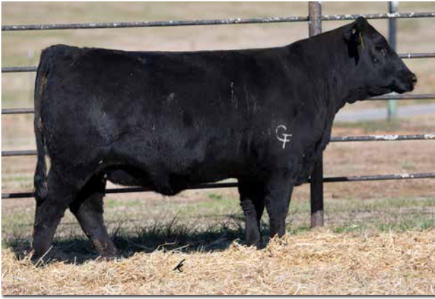
GIBBS 3474L ROSE 3375A Sells as Lot 102.

102 GIBBS 3474L ROSE 3375A ♀GFP Homozygous Black Homozygous Polled 1/2 SM 1/2 AN ASA #4284687 3474L BD: 9/20/2023