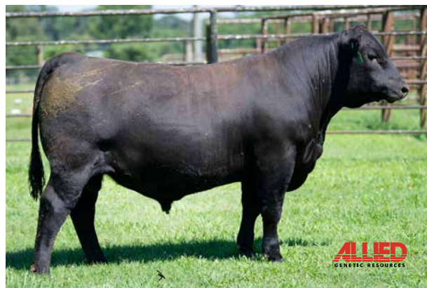
GIBBS KINGPIN 1140J