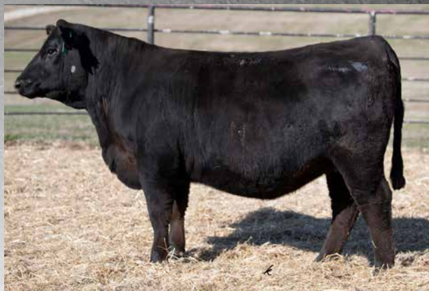
GIBBS 3681L JAUER 0448H Sells as Lot 94.

• Bred 11/29/24 to TJ STONE COLD 3366, then pasture exposed to GIBBS JAM UP 2044K from 12/3 to 1/25. Calving date and planned mating EPDs available sale day.