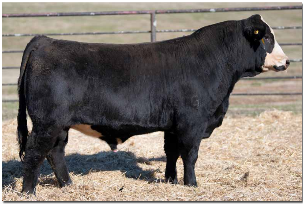
GIBBS 3608L STONE COLD Sells as Lot 29.

29 is the best baldy option heifer bull we have to offer in this sale. He is a stamp of the great stone cold. They have been crowd favorites for a while now because the excel in body, mass, hoof shape, and fleshing ability. This bull continues the legacy and will give you ideal daughters.