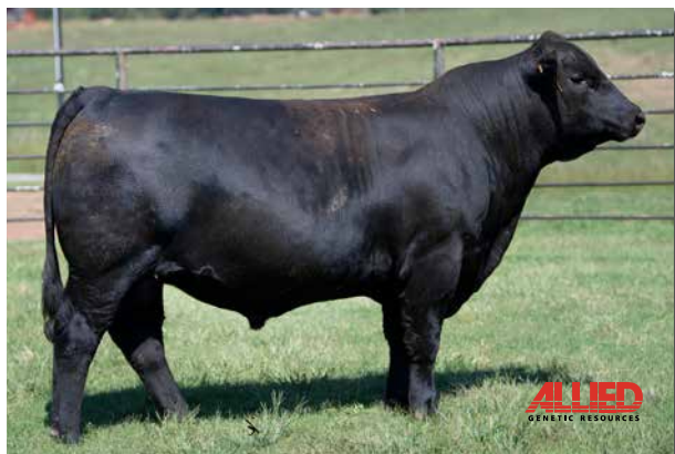
GIBBS SIGNATURE 2510K