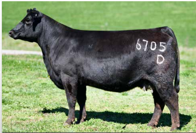
GIBBS 6705D ADM 1125Y Dam of Lot 104.

• Bred 11/29/24 to GIBBS KINGPIN 1140J, then pasture exposed to GIBBS 8127F PROPEL from 12/3 to 1/25. Calving date and planned mating EPDs available sale day.