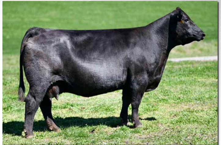
WS MISS ALL DAKOTA B208 Dam of Lot 18.