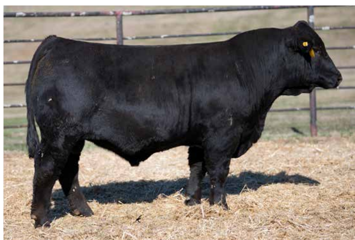
GIBBS 3593L HONOR Sells as Lot 4.