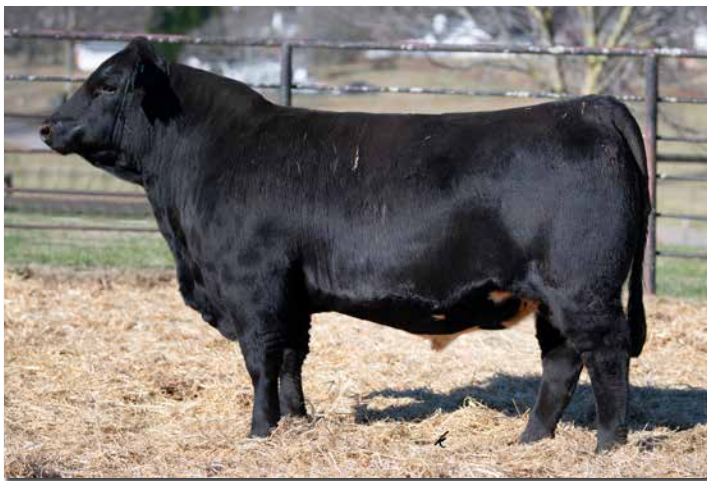
GIBBS 3690L RC EAGLE Sells as Lot 55.