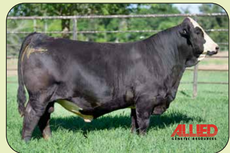
GIBBS CORNERSTONE 3363L