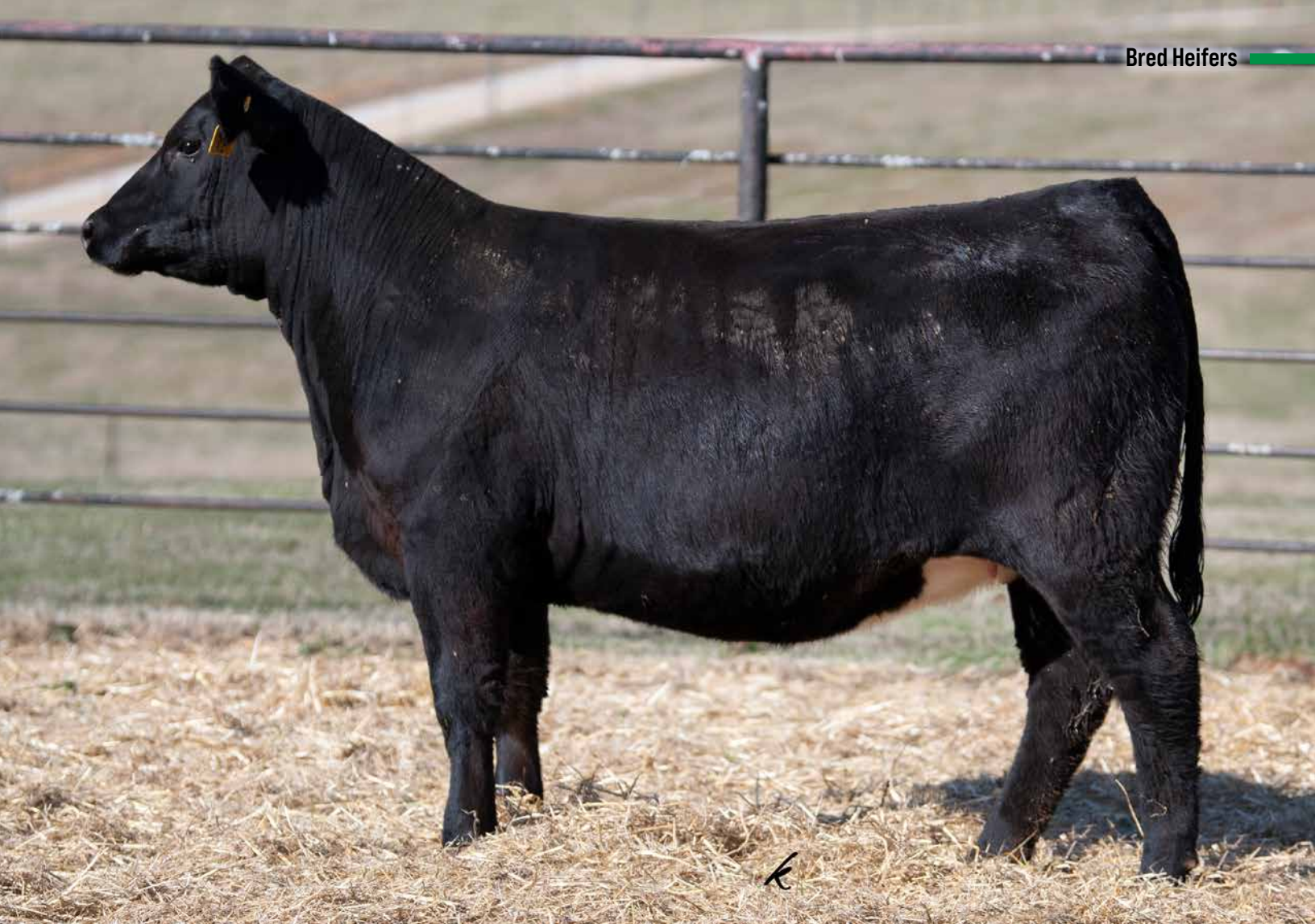
GIBBS 3358L MABELLE 4021B Sells as Lot 61.