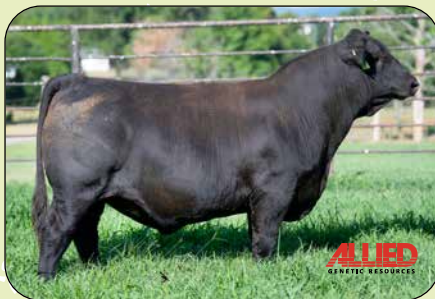
GIBBS HIGHWAYMAN 3130L