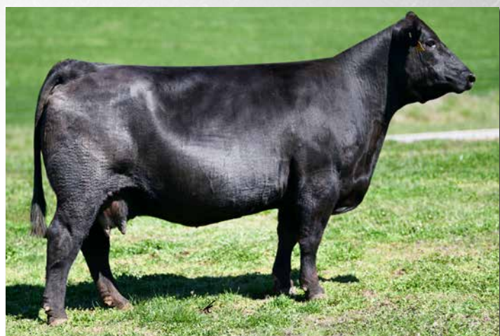
GIBBS 0170H DAKOTA B208 Dam of Lot 4.