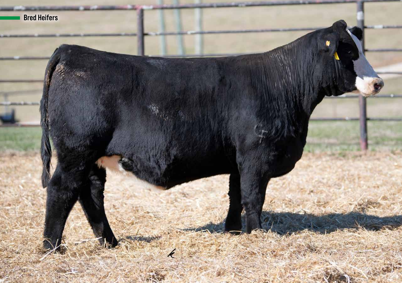
GIBBS 3283L JAUER 9271G Sells as Lot 81.