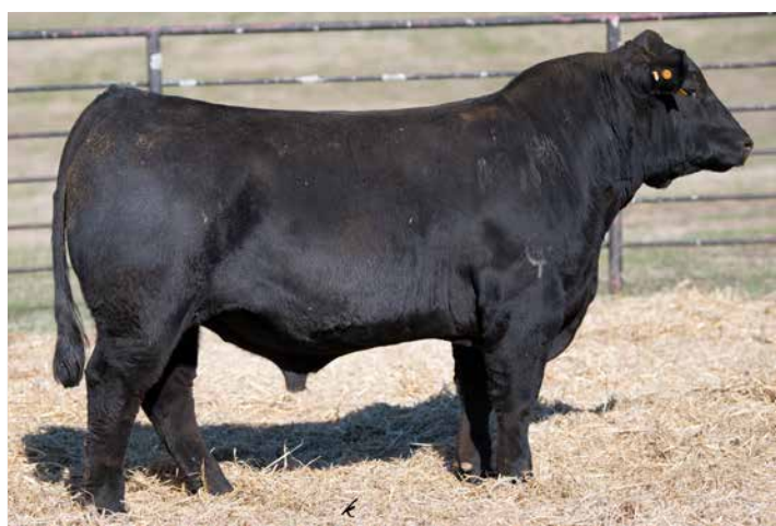
GIBBS 3233L RESERVE Sells as Lot 10.

Lot 10 is another natural calf to a donor cow. 5319C is a direct daughter to SSF LOUISE Y534 and is known for being the dam of GIBBS BULLDOG. This bull packs on the muscle and pounds. He is a heifer bull to most and offers eye appeal. He is soft and bold in his rib cage with an erect head and neck.