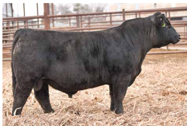
CCR FIRE POWER 8081J