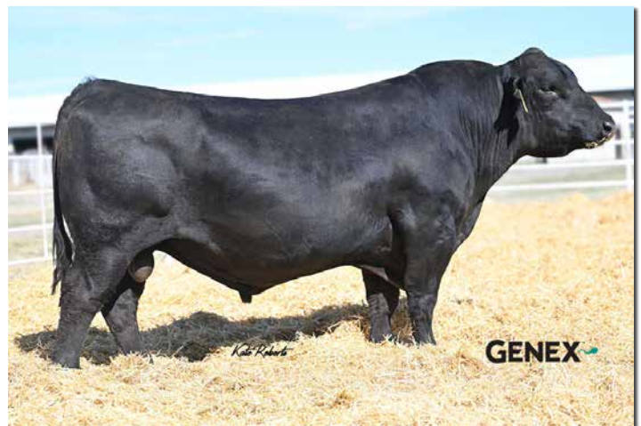
GIBBS 9114G ESSENTIAL Sire of Lot 61.

• Bred 11/29/24 to KBHR HONOR H060, then pasture exposed to GIBBS JAM UP 2044K from 12/3 to 1/25. Calving date and planned mating EPDs available sale day.