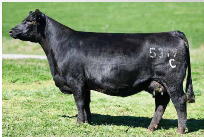
GIBBS 5319C LOUISE Y534 Dam of Lot 10.