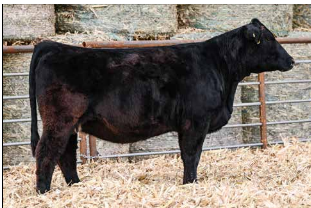
L110 Sells as Lot 54.