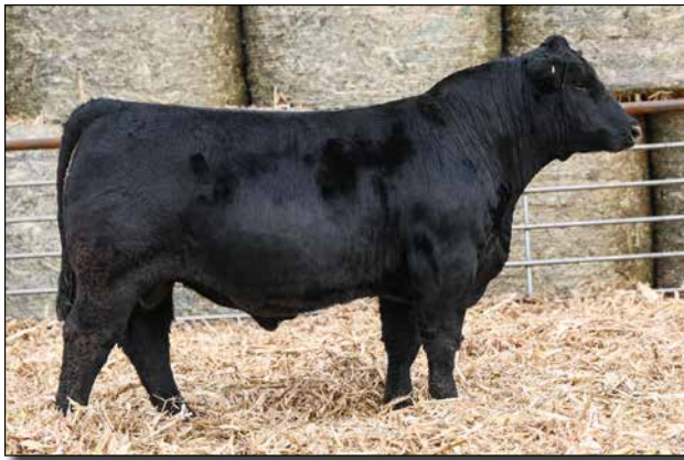
L63 Sells as Lot 28.

Pure black stretchy guy. Stylish embryo. Good calving ease to boot. Growthy bull.