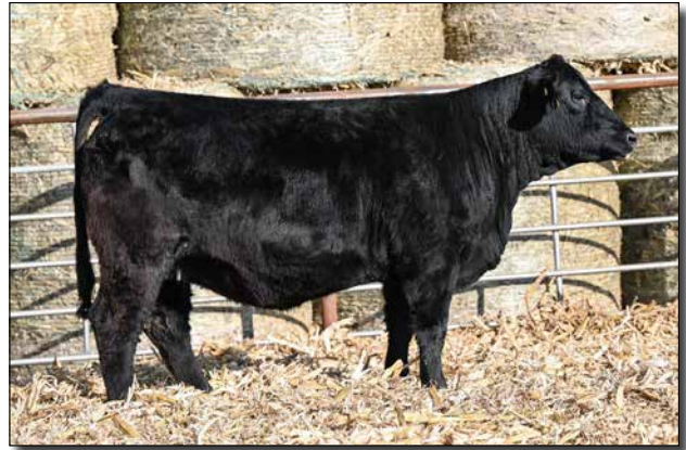
L116 Sells as Lot 57.

Bred to LF Laser (4350261). Safe to calve 4/13/2025. She's a front pasture kind that you'll want to show off! What a good-looking female. Has really good calving ease numbers.