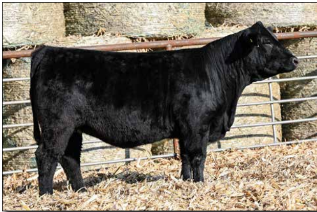
L35 Sells as Lot 62.

Bred to LF Laser (4350261). Safe to calve 5/5/2025. The youngest heifer in the sale but we really like her. Baldy girl with tremendous potential.