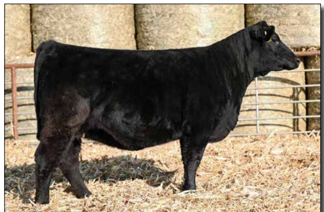
L175 Sells as Lot 49.

AI bred to JC Gold Rush (3870330). Safe to calve 3/20/2025. Good ribbed 3/4 blood heifer. From a cow family that's consistently produced for years.