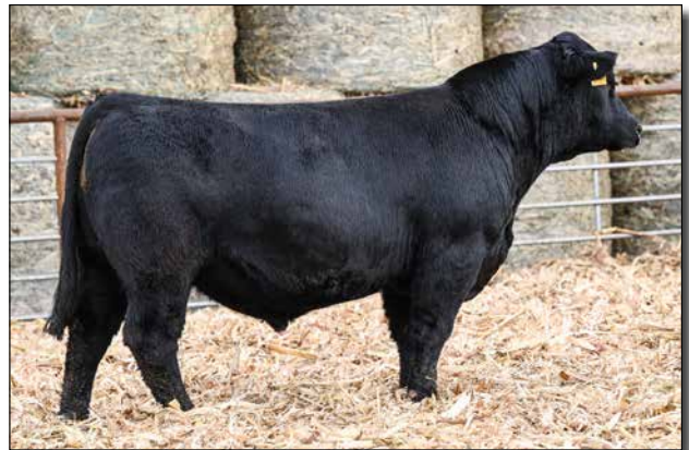
L101 Sells as Lot 23.

Take a look at the length on this guy! Calving ease of 16. Striking look to him.