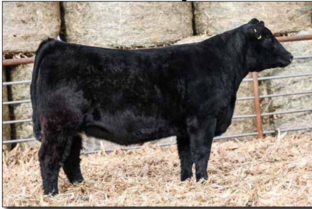
L73 Sells as Lot 42.