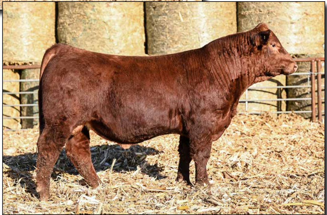
L400 Sells as Lot 13.