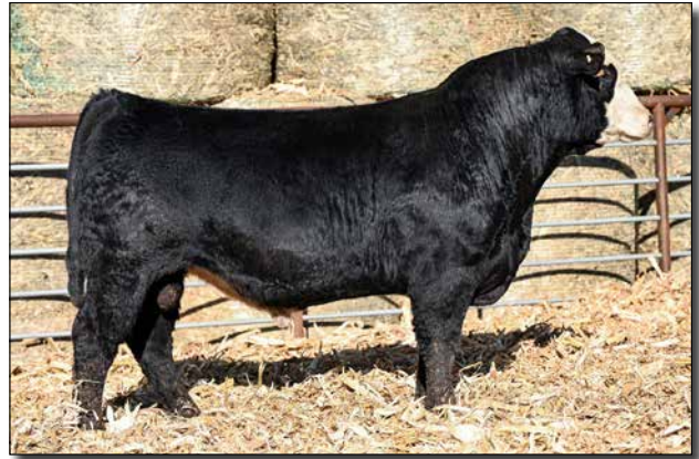
L612 Sells as Lot 31.

Attractive baldy bull profile with plenty of length and balance. Good feet on him.