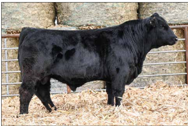
L022 Sells as Lot 30.

Solid black bull that will work great on commercial cows. SimAngus bull.