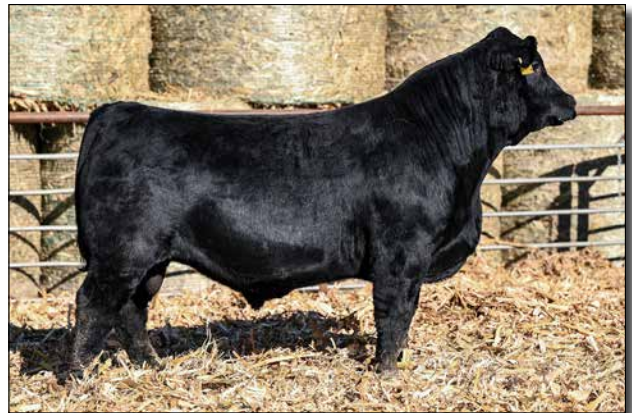
L178 Sells as Lot 11.

Picture a calf crop out of this guy. Big-time calving ease, growth, and a 164 API. What more could you want?