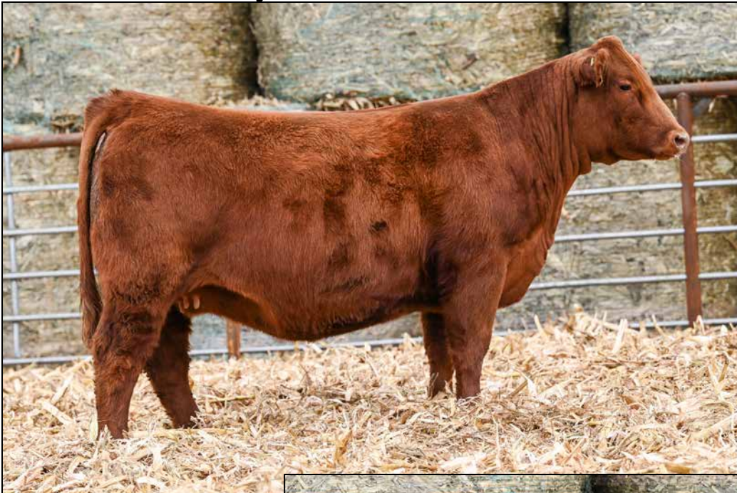
L573 Sells as Lot 36.