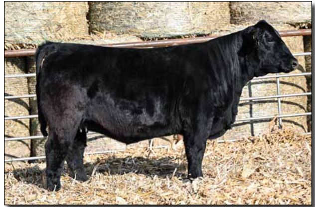
L070 Sells as Lot 56.

Bred to LF Laser (4350261). Safe to calve 4/8/2025. Level topped dream with style for days. 5/8 SimAngus