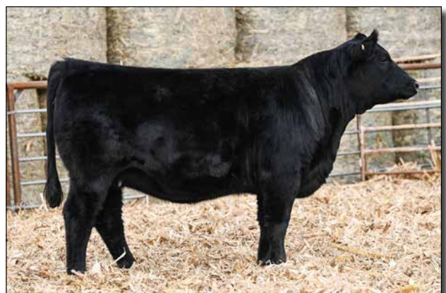
L079 Sells as Lot 41.

AI bred to KBHR Charger (4104220). Safe to calve 2/10/2025. Deep girl that goes back to the Bridle Bit donor cow 452. She's hetero black bred to the red AI stud Charger. Could be a home run calf out of a different pedigree. A 150 API too!