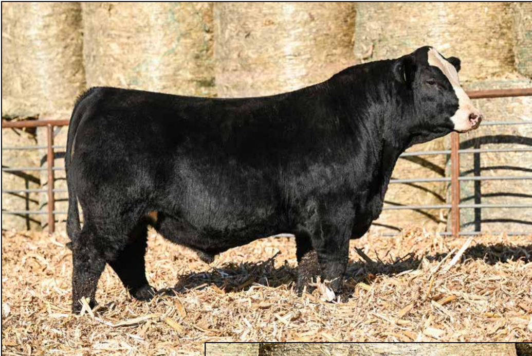
L721 Sells as Lot 1.