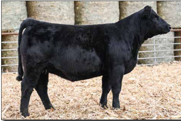
L7 Sells as Lot 43.