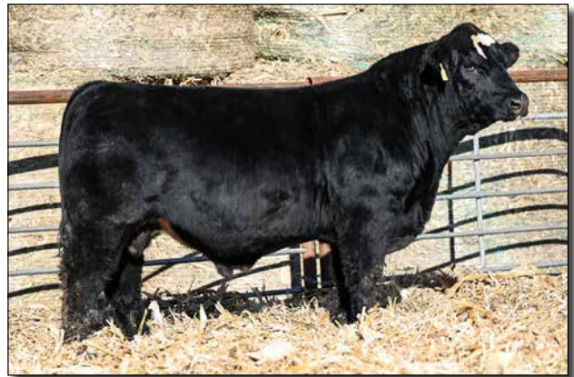
L020 Sells as Lot 33.

Baldy with impressive eye-appeal. Love his level top.