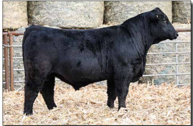
L746 Sells as Lot 22.

If you like 'em fancy, this guy needs your attention.