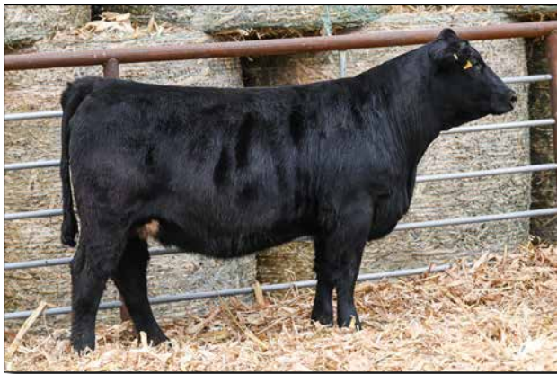
L3 Sells as Lot 45.