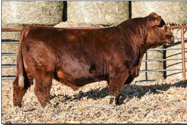
L51 Sells as Lot 26.

26 LF LANDMARK L51 XGGP Red || Homozygous Polled PB SM BD: 3/26/2023 Bull ASA# 4342014