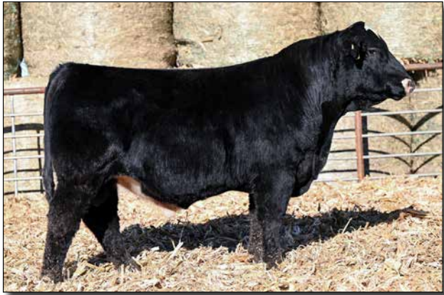
L702 Sells as Lot 19.

Cactus Jack sires moderate framed progeny that have tremendous thickness and sound structure. You're sure to find a Cactus Jack son to fit your program.