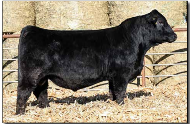
L1 Sells as Lot 14.

This bull is hetero black for coloring. I love the rib on this guy. He's the natural calf out of our donor cow and our red herd bull which was on purpose to make an outcross so he'll throw some red calves. Incredible EPDs.