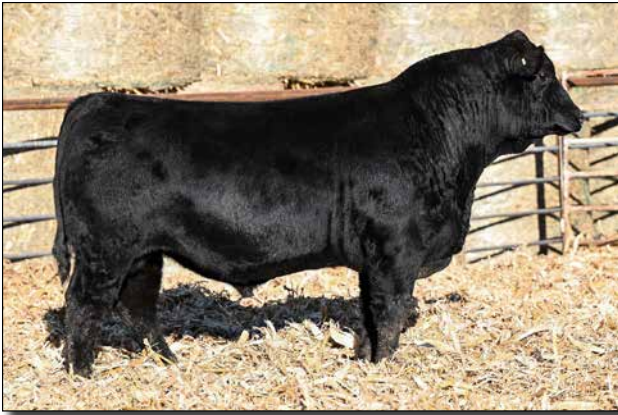
L159 Sells as Lot 7.

Very complete bull with how you want them to look. 3/4 SimAngus. A 154 API.