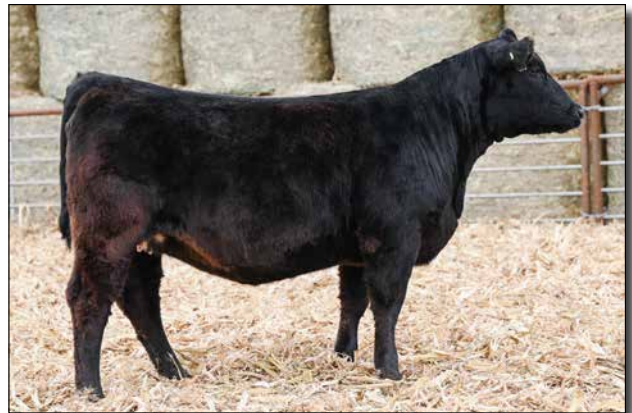
L74 Sells as Lot 48.

AI bred to JC Gold Rush (3870330). Safe to calve 3/13/2025. Pretty feminine, attractive heifer. Clean front. Should throw a great Gold Rush calf.