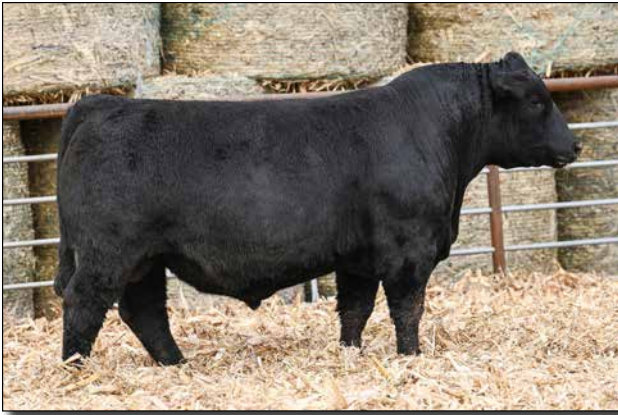
L191 Sells as Lot 5.