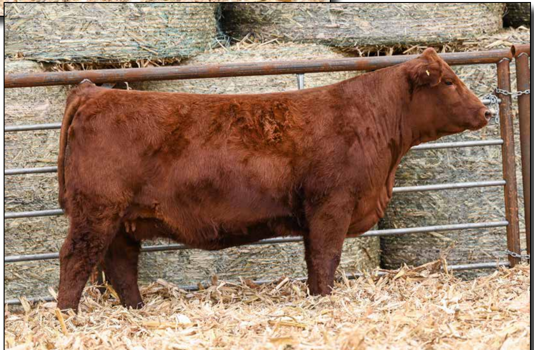
L665 Sells as Lot 37.