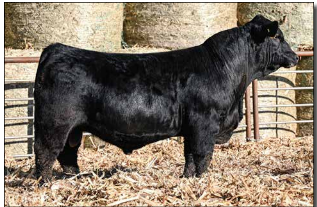
L52 Sells as Lot 24.

Circle this bull on your list. He's got eye-appeal. This is really a thick, deep bull. Hetero black so he could throw some reds. Outcross pedigree. Result of embryo transfer. Full brother to Lots 25, 26.