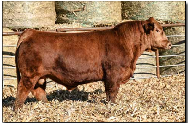
L39 Sells as Lot 15.

You want volume in your cattle? He's your bull. This guy would be an asset to any herd.