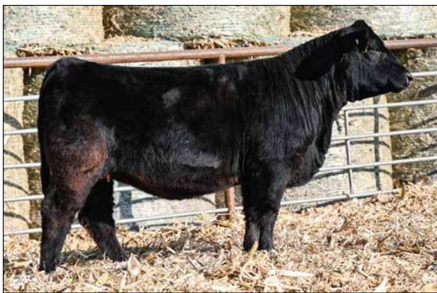
L62 Sells as Lot 63.

AI bred to LF Laser (4350261). Safe to calve 5/15/2025. Nice broody female bred to Laser.