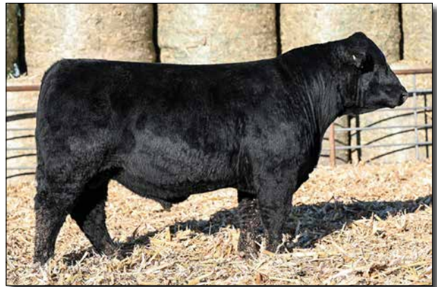
L126 Sells as Lot 10.

All black and a beef deluxe. Muscle and meat for days.