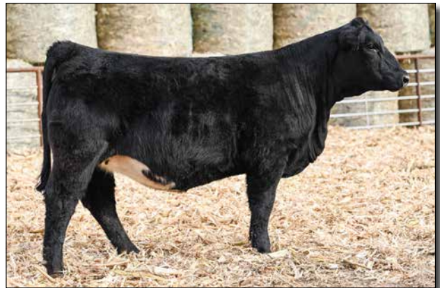
L36 Sells as Lot 47.

AI bred to JC Gold Rush (3870330). Safe to calve 3/20/2025. She's the kind that would fit any herd. Look at that front end! 1/2 blood bred to Gold Rush.