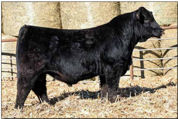
L209 Sells as Lot 21.

Depth of rib and with good structural balance. Tremendous depth and style. The right kind.