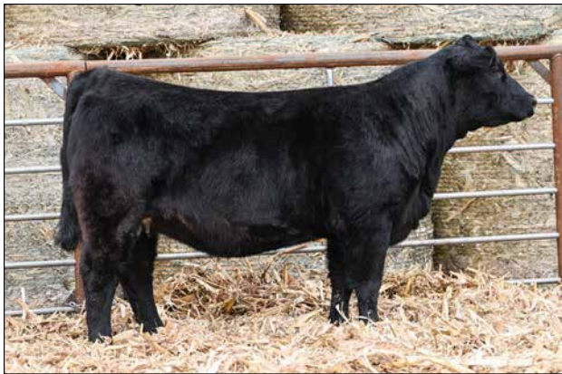
L010 Sells as Lot 53.