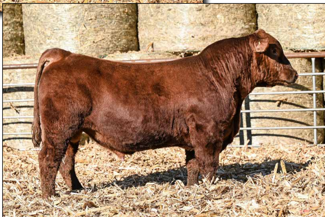
L61 Sells as Lot 4.