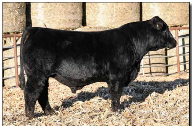
L188 Sells as Lot 17.

Here's a different pedigree for you. With a 157 API too! A cow man's bull.