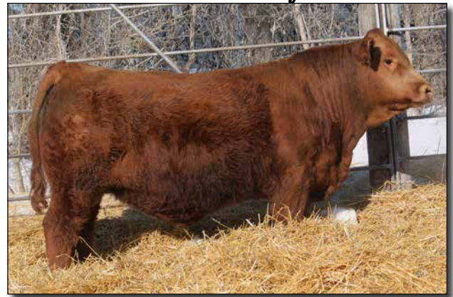
KBHR CHARGER K102