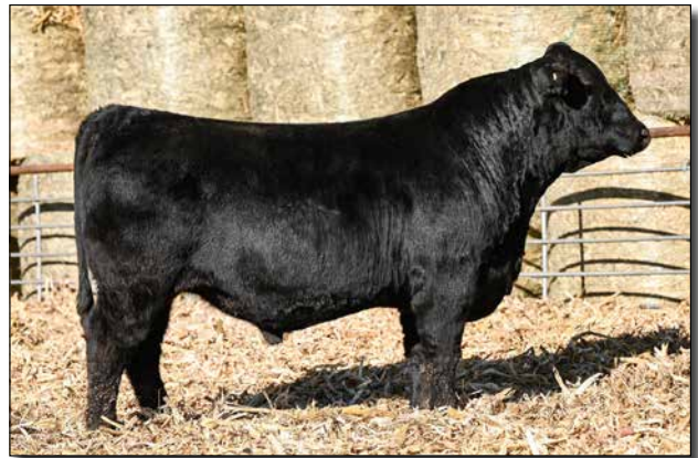
L44 Sells as Lot 32.