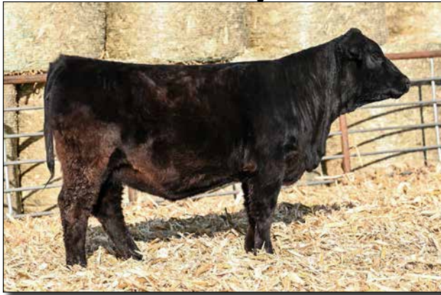
L713 Sells as Lot 59.

59 LF LEISHA L713 GGP Black || Homozygous Polled PB SM BD: 5/8/2023 Cow ASA# 4341994