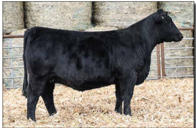
L027 Sells as Lot 39.

AI bred to JC Gold Rush (3870330). Safe to calve 3/8/2025. Good looking female with above average physical shape and body.