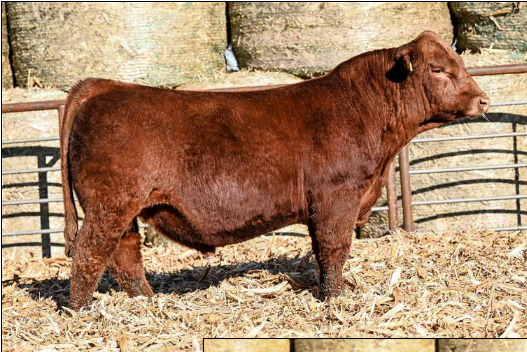
L11 Sells as Lot 12.