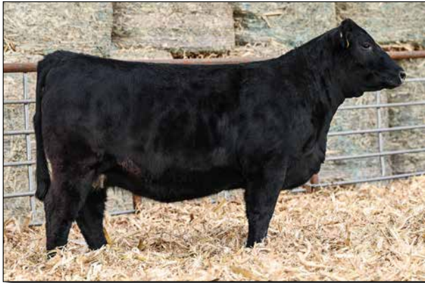
L26 Sells as Lot 44.