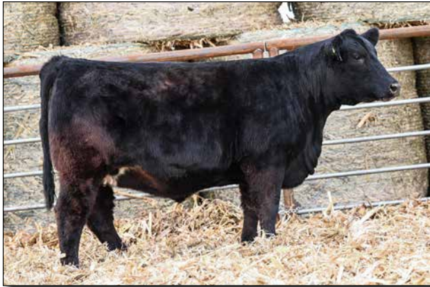
L180 Sells as Lot 52.

Al bred to Double Agent (3805354). Safe to calve 2/13/2025. Solid black heifer but carries the red gene. Well made heifer.