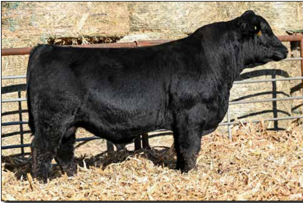
L141 Sells as Lot 6.

What a massive dude! Look at his depth, length and level top. But there's more, a 156 API!