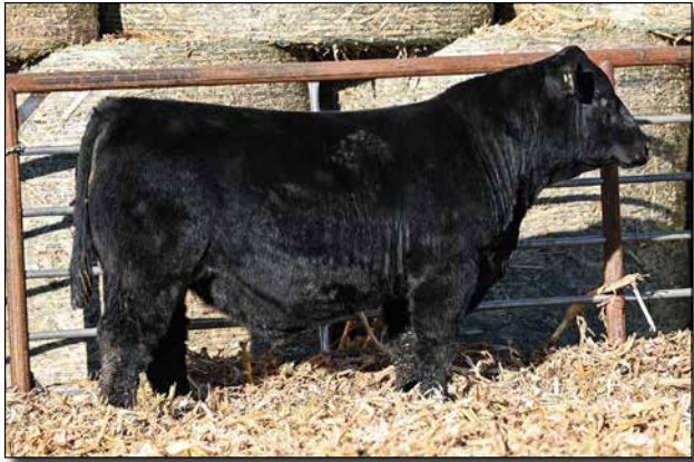
L78 Sells as Lot 20.

Baldy bull with that frame and length you'll like. He'll do what you want in a commercial herd.