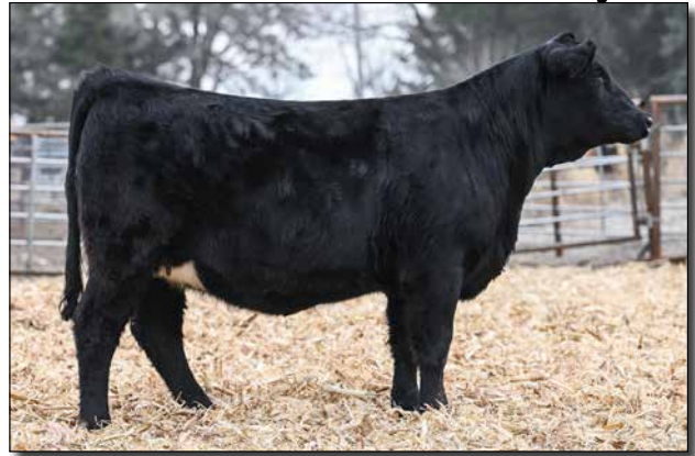
L129 Sells as Lot 55.

Bred to LF Laser (4350261). Safe to calve 3/19/2025. What a profile! Great depth of rib and square top. Could be a tremendous calf out of Laser.