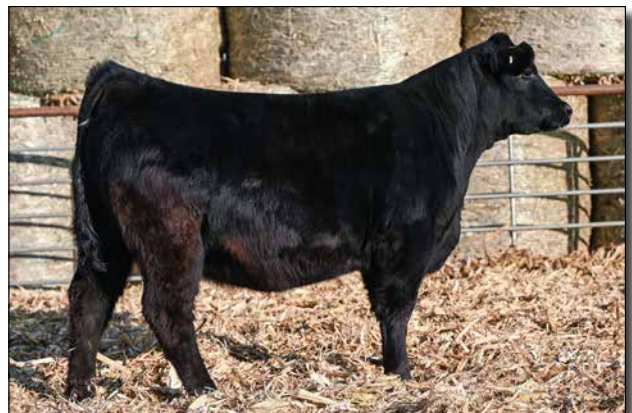
L069 Sells as Lot 40.

Bred to LF Laser (4350261). Safe to calve 3/19/2025. Oh wow is she broody! She'll have one of the first calves out of our bull Laser. Super feminine.