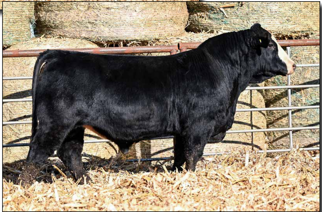
L2 Sells as Lot 2.