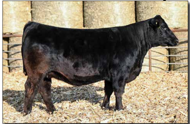
L121 Sells as Lot 38.

AI bred to KBHR Global (3943850). Safe to calve 2/4/2025. Super deep, attractive female. AI'd to Global. Excited to see what this calf looks like.