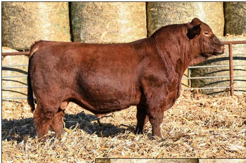
L131 Sells as Lot 3.