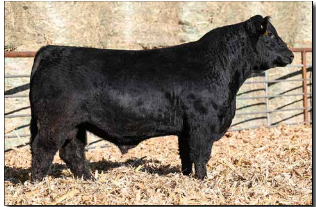
L149 Sells as Lot 9.

Don't miss out on this guy. He's got a style that you love to look at.