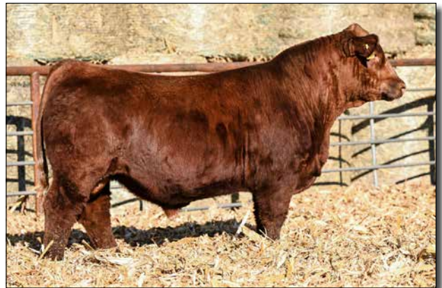
L170 Sells as Lot 16.

This is a natural calf out of our red donor cow. Very balanced set of EPDs along with great eye appeal. I wish they all looked like him.