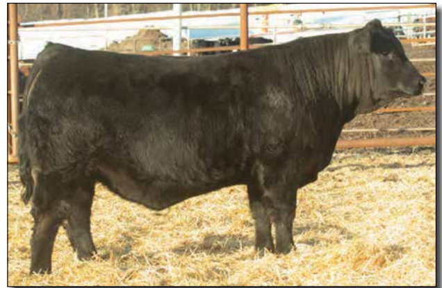
JC MR GOLD RUSH 994J