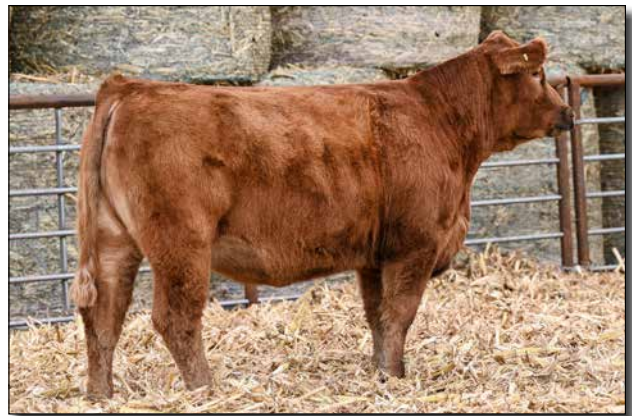
L165 Sells as Lot 58.

Bred to LF Laser (4350261). Safe to calve 4/13/2025. Red stylish female. Nice made, deep, and level top. Could be a great calf out of Laser.