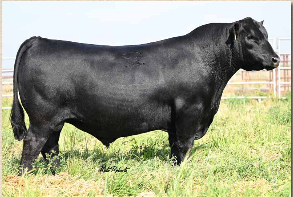
BASIN TRUE GRIT 1021 Sire of Lots 16-25.

We are always searching for the right Angus Bull to make the next generation of SimAngus bulls at the ranch. After seeing True Grit in stud, we felt like he was the right choice for an Angus bull and we are really pleased with the results. The cattle are complete and as fault free as they come. They supply ample calving ease, great growth and strong maternal and carcass traits. We feel the bulls are the “ranchers” kind who will move your program ahead on all fronts.