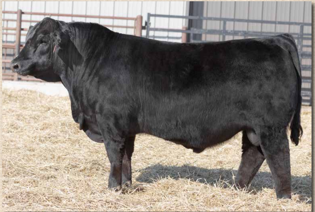
CLRS HERDBOOK 316H Sire of Lots 87-98.

Herdbook is one of the best bulls we have ever ran for handling the details. The cattle are superb for docility and truly impressive to study in the flesh. He covers all the traits you admire out of his famous sire Triple Crown while adding even more punch from a growth and muscle standpoint. We promise any cattlemen will admire the Herdbook sons.