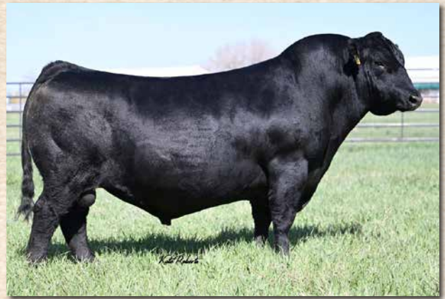
SOUTHERN FORTUNE TELLER Sire of Lots 145-149.

LOT 146 CCR SOUTHERN 1383L Homo Black II Homo Polled 1/2 SM 1/2 AN 8/23/2023 1383L ASA# 4338478 COLOR SC DISPOSITION CALVING EASE FRAME GGP G+ ATM Solid 34 1 ** 5.5 GGP G+ ATM