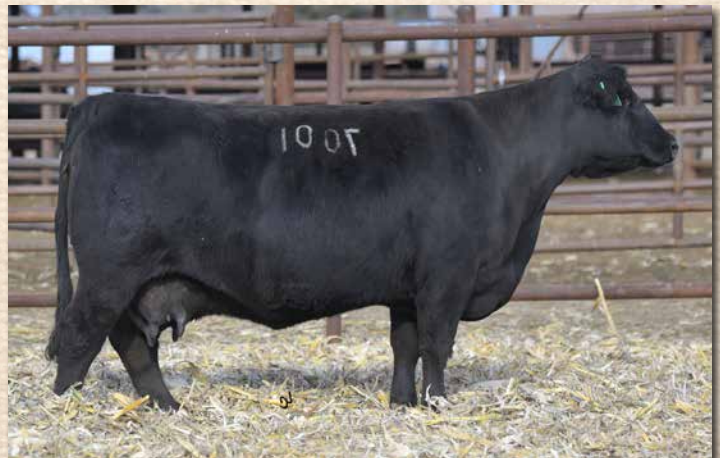
CCR MS BLUE PRINT 7001E dam of Lot 170.

A herd bull who checks all the boxes. Physically, this lead off two-year-old comes with an immense amount of body, structural soundness and quality. Genetically he will prove to be one of the best heifer bulls in the offering and provides unprecedented carcass and maternal value. He is backed by the wonderful 7001E donor.