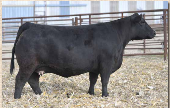
CCR MS COWBOY 7662E Grandam of Lot 1.

Cow Camp will retain 50% semen interest.