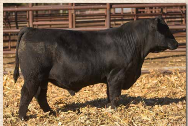
CCR ECLIPSE 1406L Sells as Lot 150.