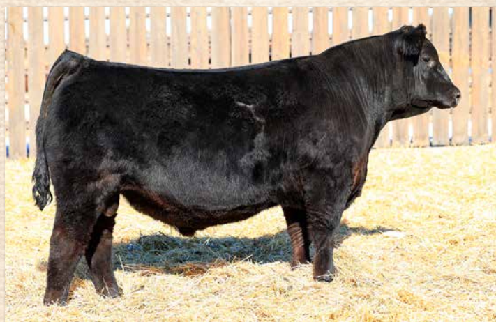
BRIDLE BIT BLACKOUT K249 Sire of Lot 184A.

BRIDLE BIT ECLIPSE E744 HOOK'S GALILEO 210G BRIDLE BIT BLACKOUT K249 CCR MS GALILEO 2649K BRIDLE BIT MISS F8111 CCR 2073 COWBOY 5051C