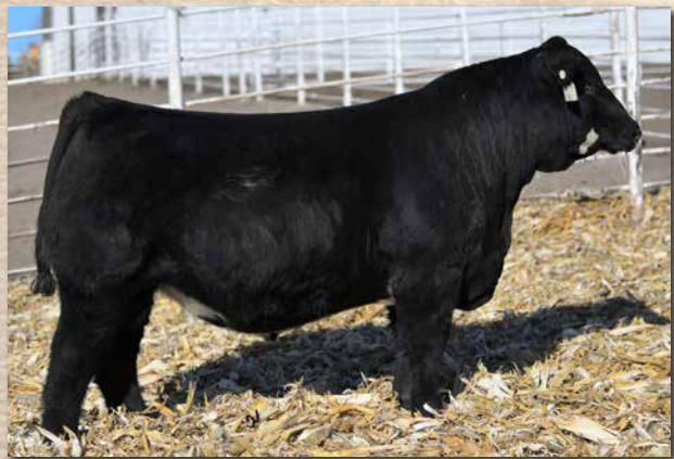
TJ WAR PAINT 759J Sire of Lots 141-144.

LOT 143 CCR WAR PAINT 0443L Homo Black || Homo Polled 5/8 SM 3/8 AN 9/6/2023 0443L ASA# 4338361