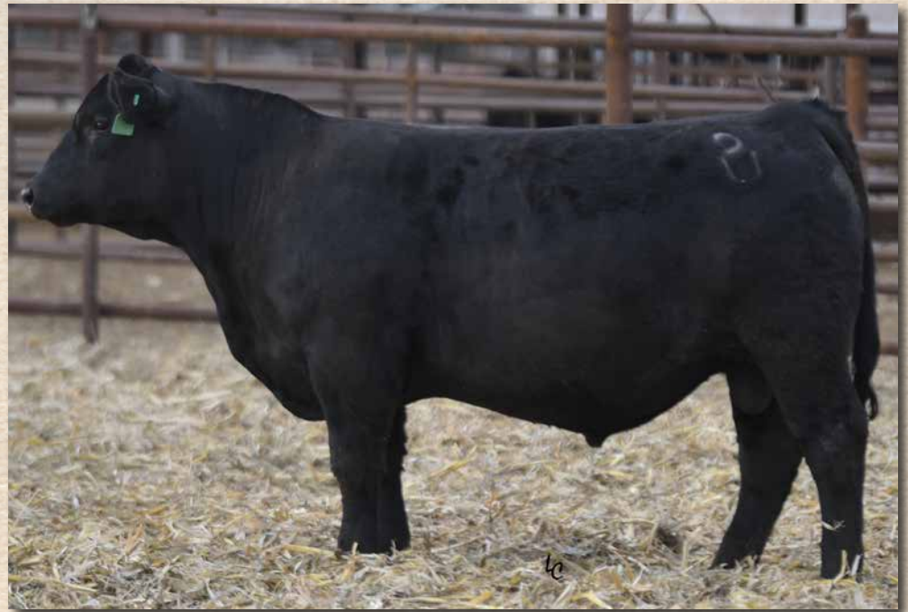
CCR BLACKFOOT 7098H Sire of Lots 118-125.

Blackfoot was the phenotypical choice from the 2020 bull offering. He is a Pounder son who combines top notch growth with incredible look and phenotype. The sons all study with top tier growth and will sire wonderful daughters and high valued steers.