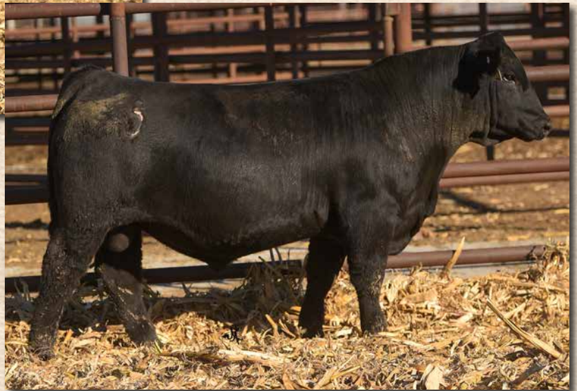
CCR 0411 HONOR 7638L Sells as Lot 56.