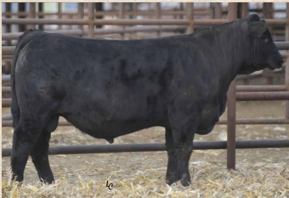
CCR COCHISE 4142H Sire of Lots 1-15.

The Cochise cattle study with balanced genetics across the board. Ample calving ease and growth, incredible maternal traits and strong carcass figures. The cattle are as balanced as they come physically as well. They are long bodied, massive and wonderful for structure.