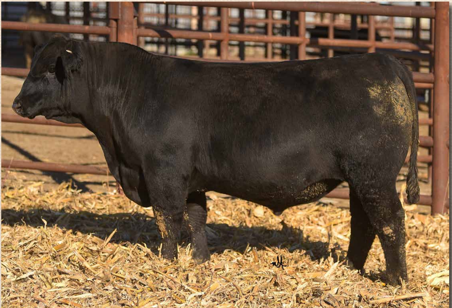
CCR 7001 RAWHIDE 6508L Sells as Lot 29.