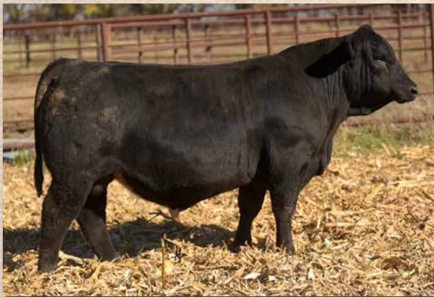
CCR KIOWA 9628L Sells as Lot 126.