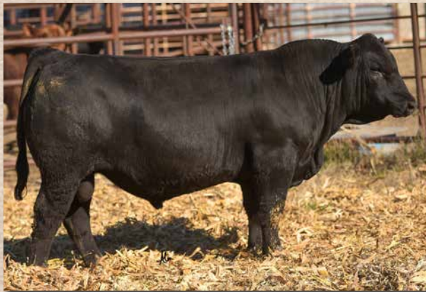
CCR RULER 1261L Sells as Lot 99.

LOT 100 CCR RULER 1407L Homo Black || Homo Polled PB SM 8/27/2023 1407L ASA# 4338486