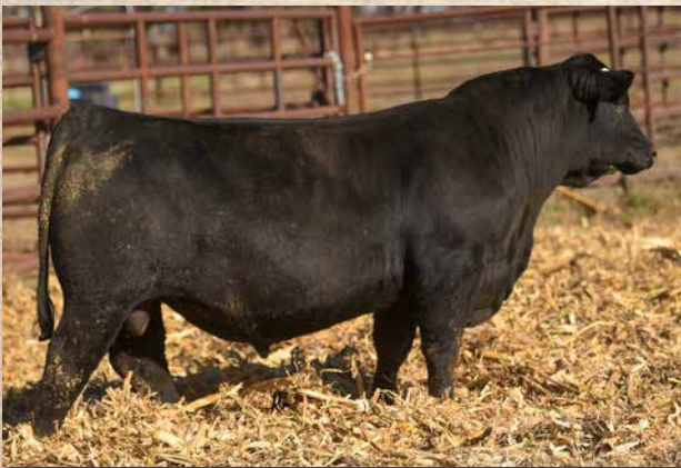
CCR TRUE GRIT 1461L Sells as Lot 19.