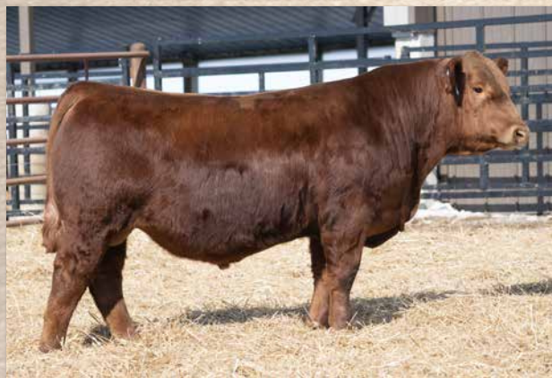
CLRS JEFFERSON 951J Sire of Lots 63-68.