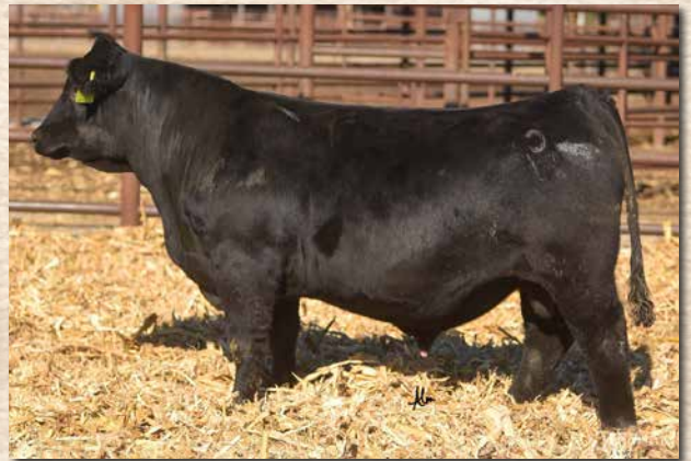
CCR TRIPLE CROWN 1294L Sells as Lot 162.

LOT 163 CCR TRIPLE CROWN 1434L Homo Black || Homo Polled 5/8 SM 3/8 AN 9/3/2023 1434L ASA# 4338499