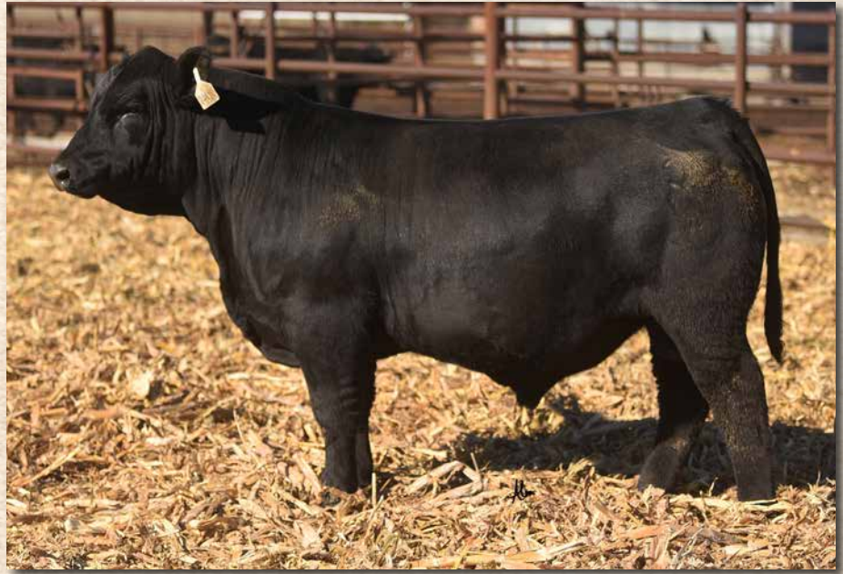
CCR GUNSMOKE 0411L Sells as Lot 44.

A highly maternal bull who comes with great calving ease, marbling and index figures. He comes from a highly productive Heisman dam and will be a great breeding piece for any operation. A purebred heifer bull with this type of quality is a rare find.