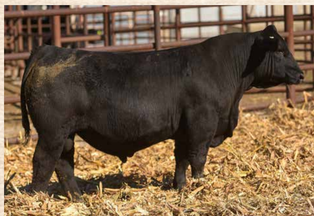
CCR HONOR 8625L Sells as Lot 57.