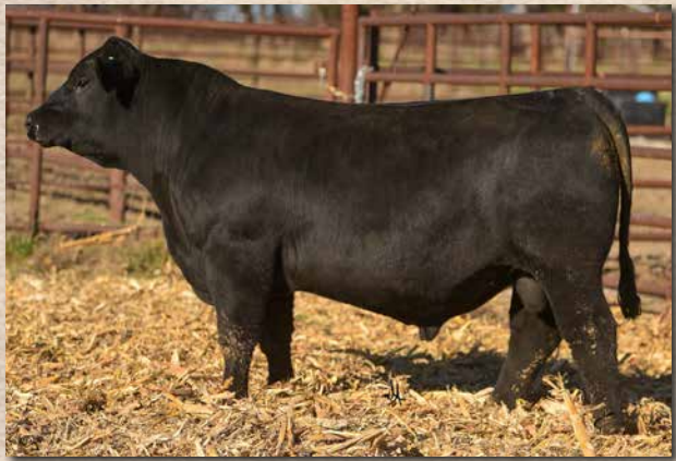
CCR BEDROCK 1325L Sells as Lot 154.

LOT 154 CCR BEDROCK 1325L Homo Black || Homo Polled 1/2 SM 1/2 AN 8/16/2023 1325L ASA# 4338449