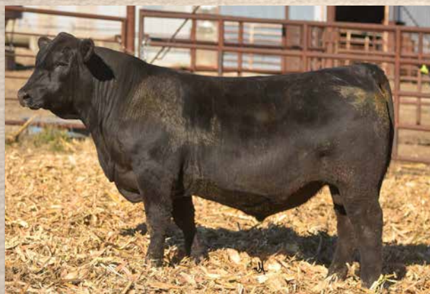
CCR BIG HORN 9789L Sells as Lot 71.