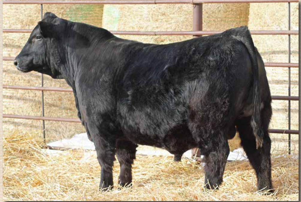
LRS CROSSFIT 4306J Sire of Lots 80-86.

Crossfit is a first generation SimAngus bull we purchased from the Lasse Simmental Ranch in Montanna. The Crossfit sons receive high marks for uniformity. The entire sire group will supply extra fleshing ability and added stoutness. The bulls are great for foot quality and will improve docility.