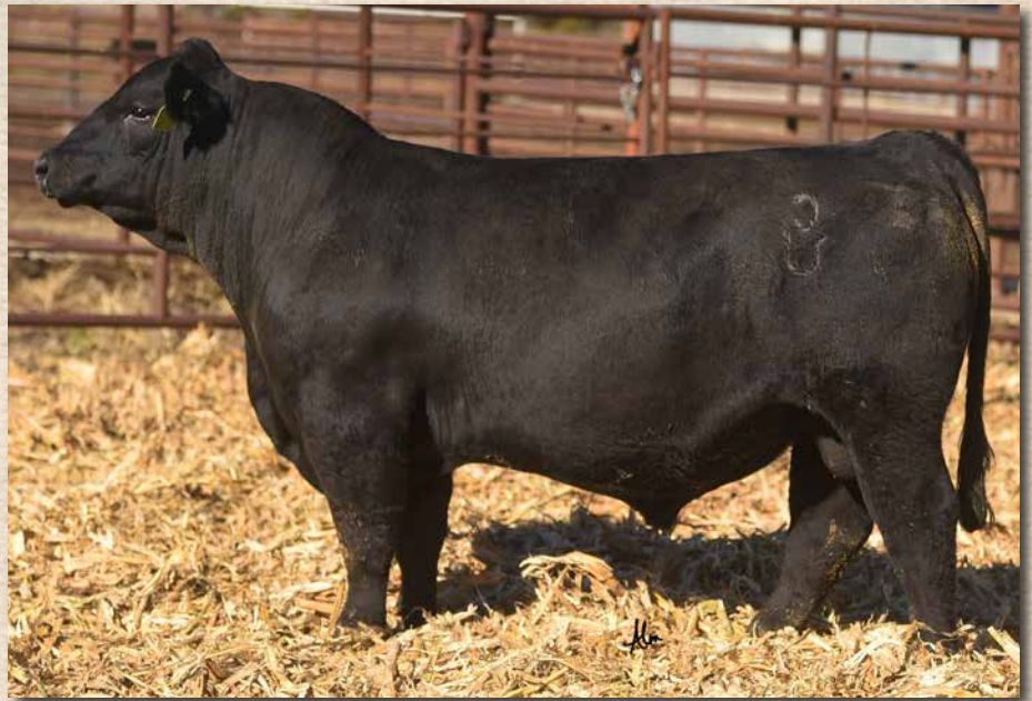
CCR RAWHIDE 9755L Sells as Lot 30.

An absolute highlight who reads with top tier growth, marbling and docility. His Encore dam comes from a large flush of sisters who have proven to be great producers and cattle for us. We feel this high indexing bull will be a crowd favorite sale day.