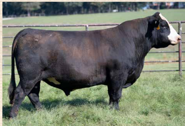
LCDR RESERVE 210J Sire of Lots 107-110.

LOT 108 CCR RESERVE 0402L Homo Black II Polled PB SM 9/9/2023 0402L ASA# 4338337