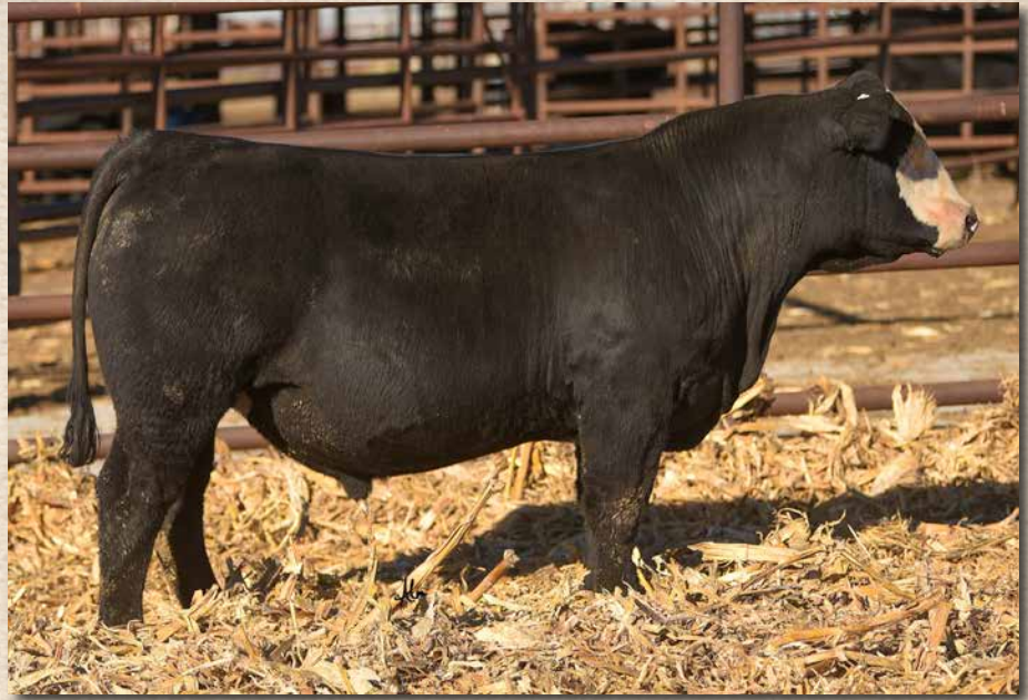
CCR 0346 RESERVE 4525L Sells as Lot 105.

A great pair of Reserve sons who results from the 0346H donor female. They offer balance from a genetic standpoint providing ample calving ease and growth while being outliers for marbling and maternal traits. The pedigree has proven to be consistent and high quality.