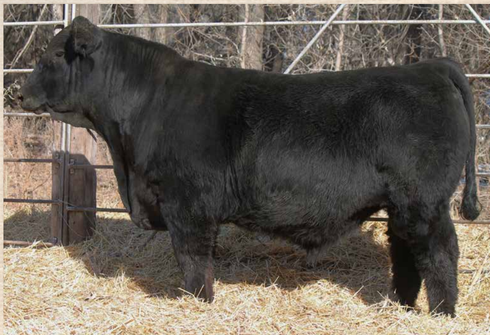
KBHR GUNSMOKE J131 Sire of Lots 46-53.

The Gunsmoke sons represent a new sire group of herd bulls in the 2025 offering. These higher percentage bulls will add power, stoutness and payweight to a set of cows. If you are in search for more payweight in a higher percentage package look no further.