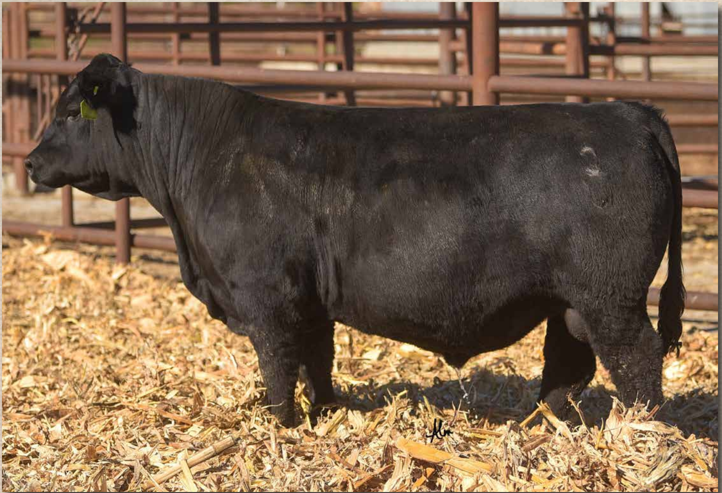
CCR TRUE GRIT 115L Sells as Lot 16.