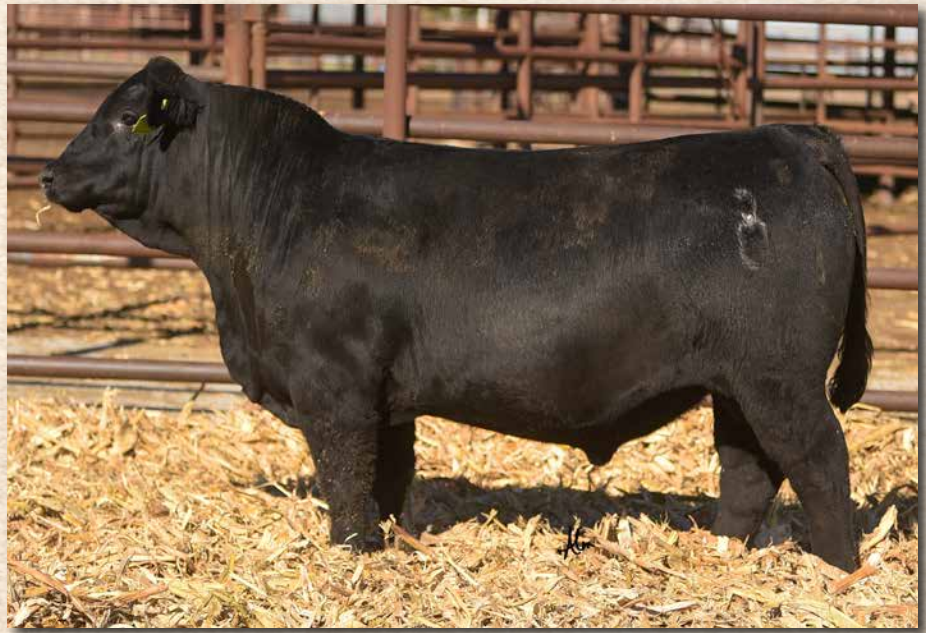
CCR TRUE GRIT 1318L Sells as Lot 17.

An absolute BRUTE of a herd bull. 1318L is massive middled, big topped and is as impressive as any in terms of muscle shape and power. He will sire progeny who weigh like lead come weaning and yearling time.