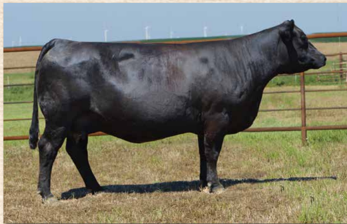
CCR MS 2073 COWBOY 5171C Full sister to the dam of Lot 184.

BRIDLE BIT ECLIPSE E744 CCR COWBOY CUT 5048Z HOOK'S GALILEO 210G CCR 2073 COWBOY 5051C HOOK'S EVITA 18E CCR MS E-Z-3 2073Z