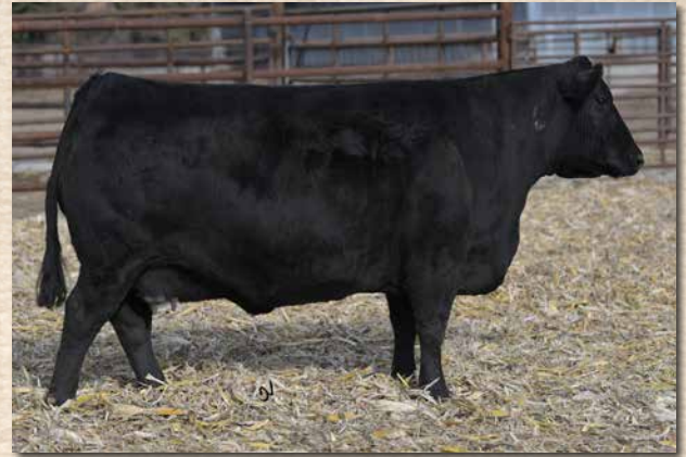
CCR MS 8012 COWBOY 4085B