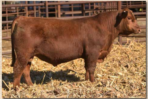
CCR JEFFERSON 9648L Sells as Lot 63.