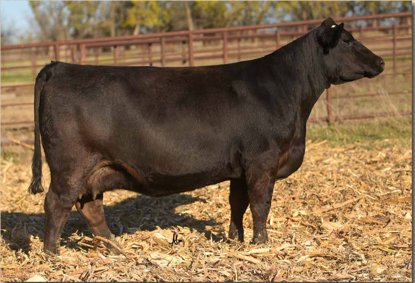
CCR MS GALILEO 2649K Sells as Lot 184.

Sells open and ready to flush in her entirety, with calf at side.