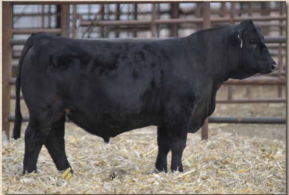
CCR KIOWA 5065H Sire of Lots 126-132.

Kiowa transmits as much width and mass to his progeny as any sire in the offering. The bulls are big topped and impressive as you step in behind them for stoutness. Many of his sons are higher percentage and would be wonderful candidates to use on English based cows.