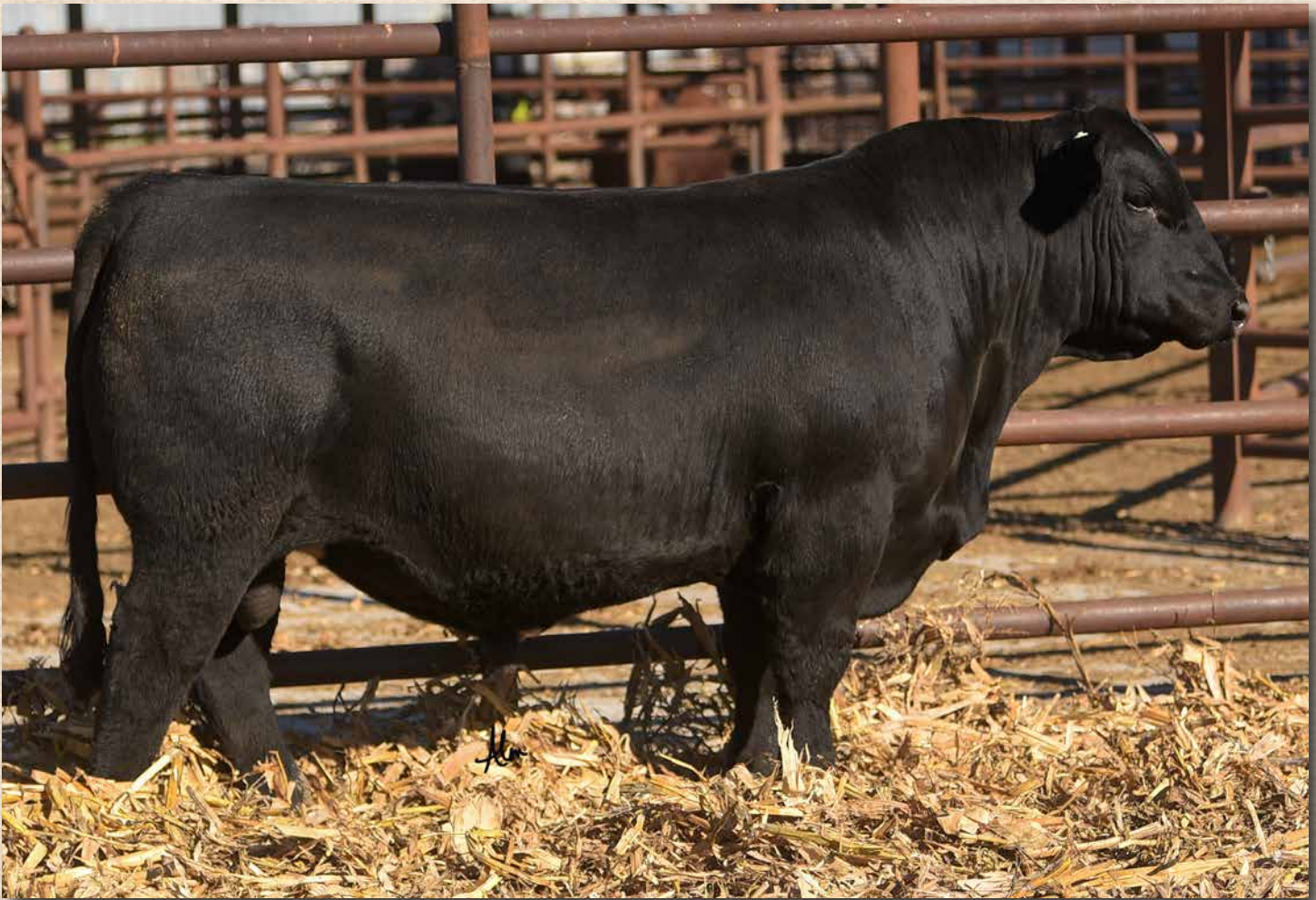
CCR 7001 GALILEO 301L Sells as Lot 170.

LOT 170 CCR 7001 GALILEO 301L Homo Black II Homo Polled 5/8 SM 3/8 AN 2/4/2023 301L ASA# 4193724