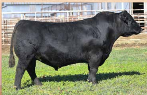
CCR COMMANDER 5135F Dam is full sib to dam of lot 184.