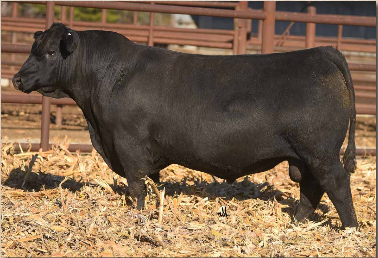
CCR BLACKFOOT 332L Sells as Lot 176.

LOT 176 CCR BLACKFOOT 332L Homo Black II Polled 1/2 SM 1/2 AN 2/5/2023 332L ASA# 4193789