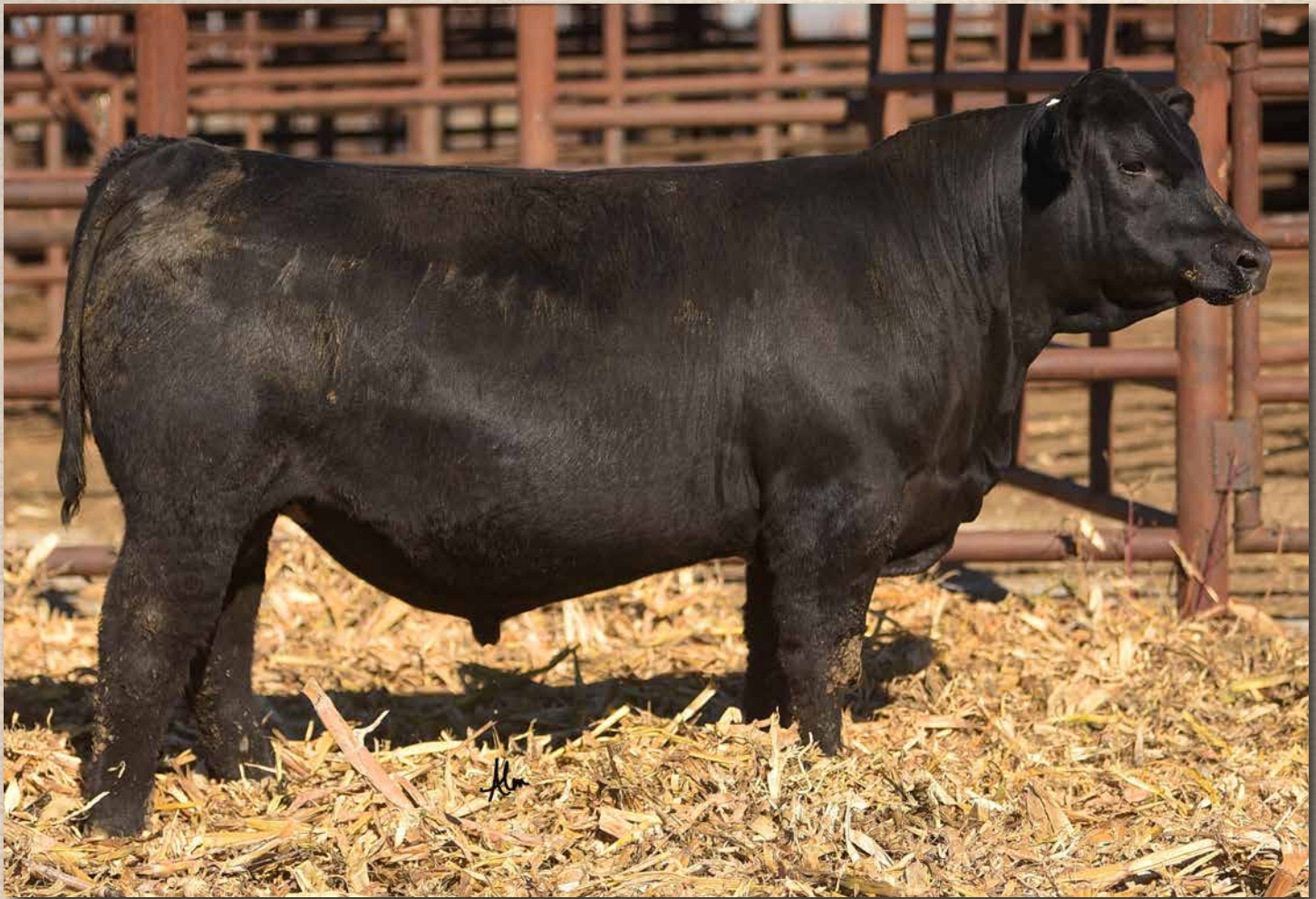
CCR COCHISE 1260L Sells as Lot 1.