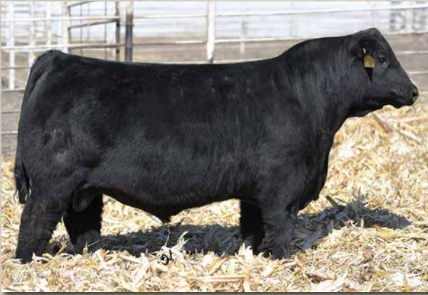
KBHR BOLD RULER H152 Sire of Lots 99-101.