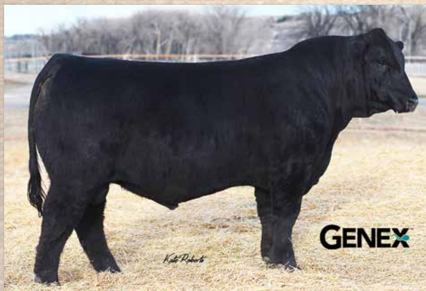
LBRB GENESIS G69 Sire of Lots 102-104.

Cow Camp will retain 50% semen interest.