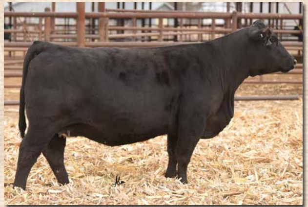
CCR MS JUSTIFIED 0517H Dam of Lots 174-175.