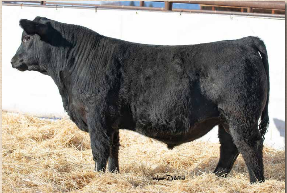
GW BIG HORN 491J Sire of Lots 70-79.

Excited in what we see in the first large group of Big Horn sons we are marketing. The sons of Big Horn are outliers for calving ease, marbling and are well above breed average for growth. We feel the genetic horsepower combined with no holes phenotype will make this a popular sire group come sale day.