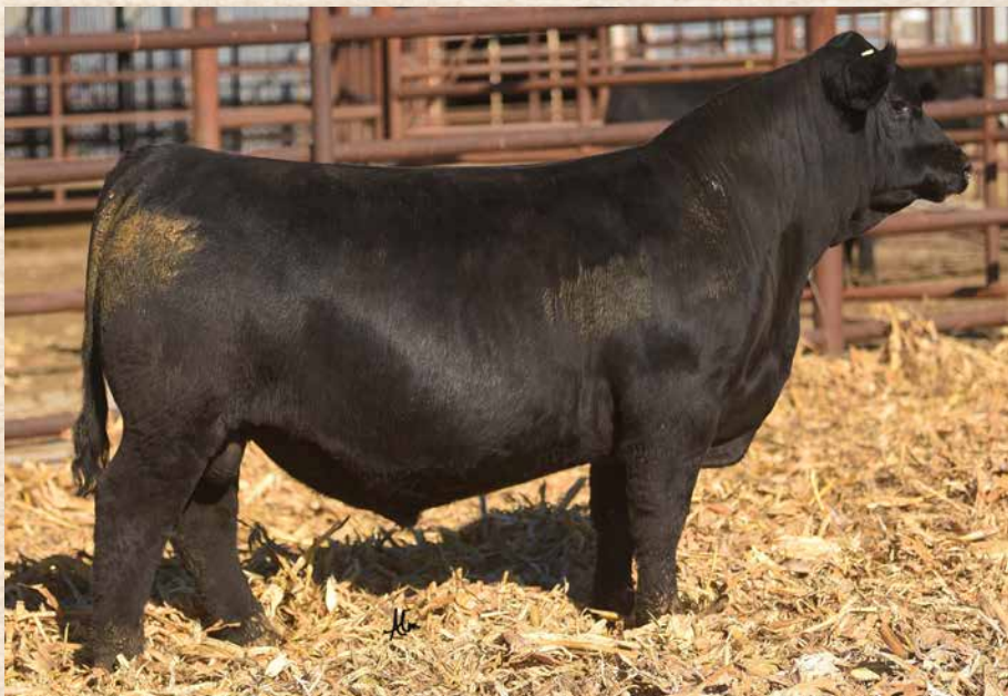
CCR COCHISE 8594L Sells as Lot 2.

Powerful herd bull prospect who excels at growth, maternal and carcass traits. If you are familiar with our program, you know the Command females have been some of our best producers and 8594F female is no exception.