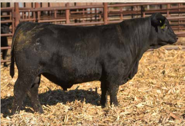
CCR TRUE GRIT 1491L Sells as Lot 20.