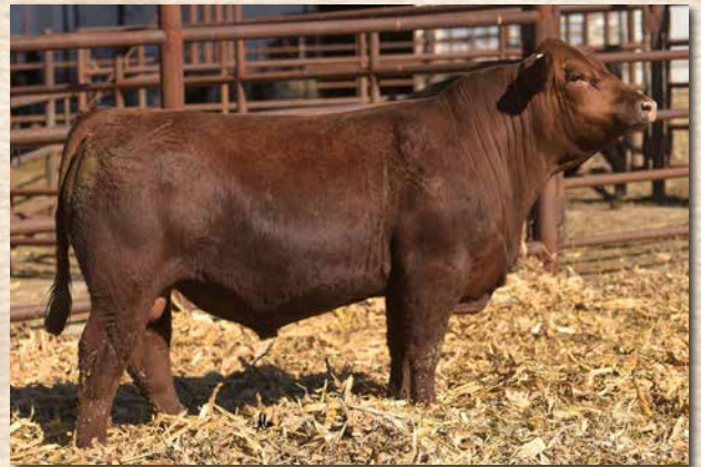
CCR HERCULES 8709L Sells as Lot 69.

Cow Camp Ranch A PROUD USPB SEEDSTOCK SUPPLIER