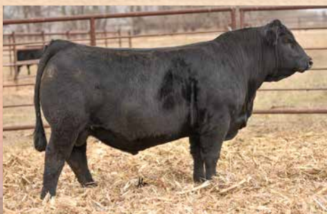
CCR BEDROCK 517J Dam is full sib to dam of lot 184.