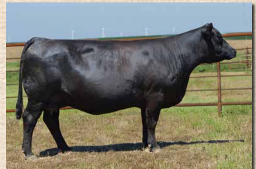
CCR MS 2073 COWBOY 5171C Maternal Grandam of Lots 105-106.