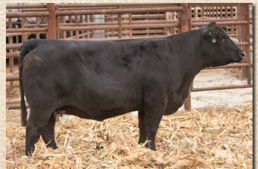
CCR 0222 WAR PAINT 304L Sells as Lot 172.

If you like him in his picture, you will like him even more in person. This War Paint son is stout and as good looking as they come. If you want added payweight and pounds here is the bull for you.