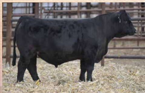
CCR KIOWA 5065H Dam is full sib to dam of lot 184.