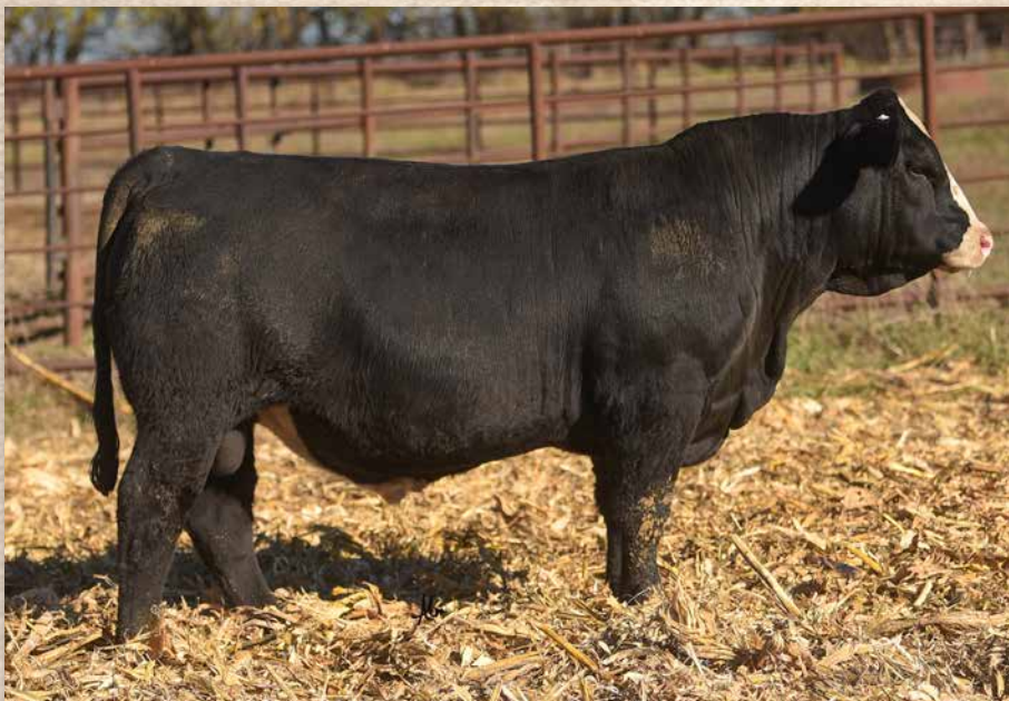
CCR 0346 RESERVE 4456L Sells as Lot 106.