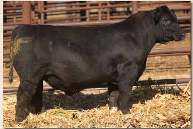
CCR TRUE GRIT 1215L Sells as Lot 21.