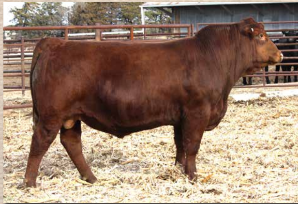
9648J Maternal brother of Lots 63..