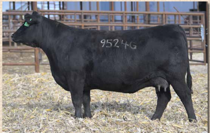
CCR MS RAINMAKER 9524G Dam of Lot 176.

Lot 176 is loaded with herd bull potential. An Ace calving ease sire with a high yearling weight EPD and packed with maternal and carcass traits. A smooth look, tremendous disposition and flawless structure will make lot 176 a sale day favorite. He hails from our great 9524G Rainmaker donor that was featured in our 2024 Production Sale and is now working for Thomas Collier and the Circle Ranch in California.