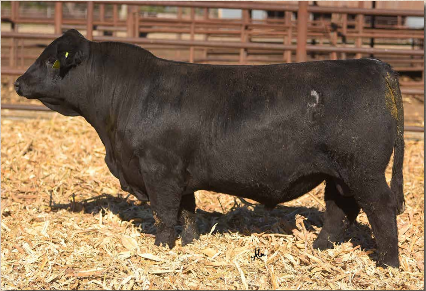
CCR 7001 RAWHIDE 5053L Sells as Lot 26.