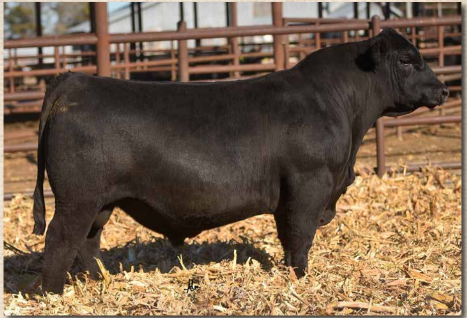
CCR MS JUSTIFIED 0517H Dam of Lot 171.