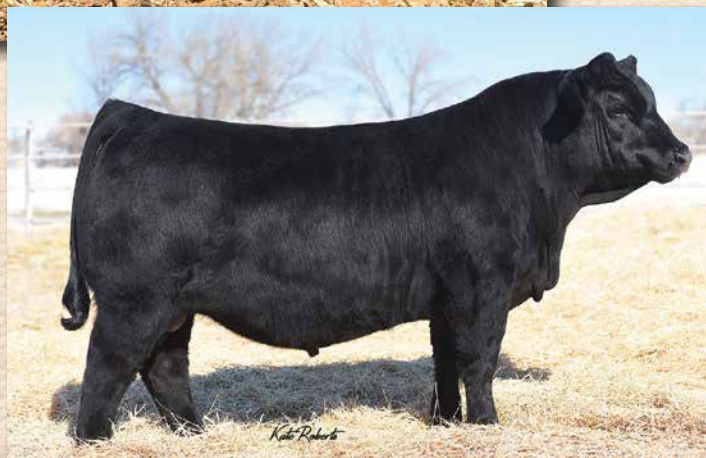
HOOK'S EAGLE 6E Sire of Los 133-134.

The 0306H donor female left us with a great pair of Eagle sons. They are truly the cattlemen's kind and will provide added fleshing ability, muscle shape, and value to their progeny.