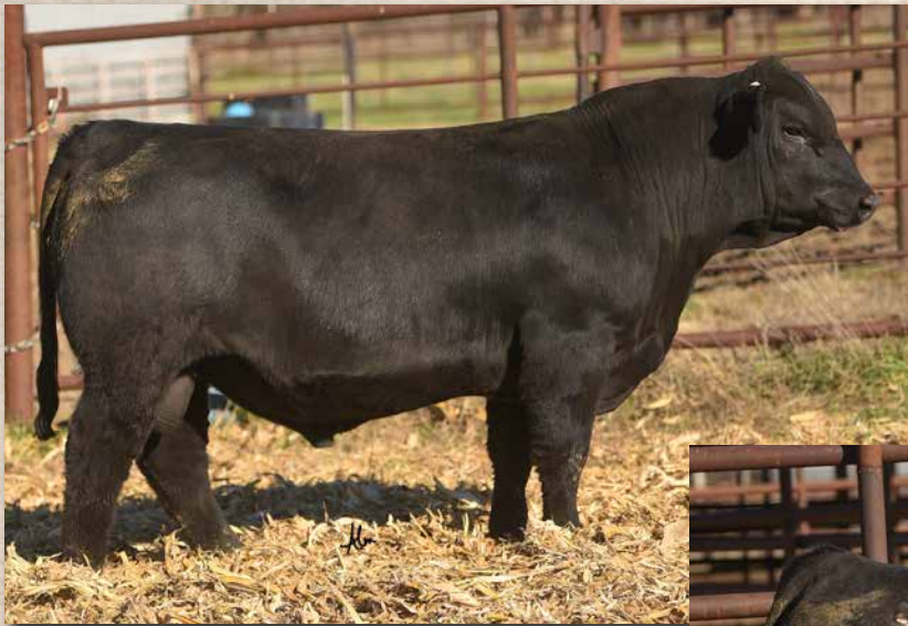
CCR 0411 HONOR 5440L Sells as Lot 54.