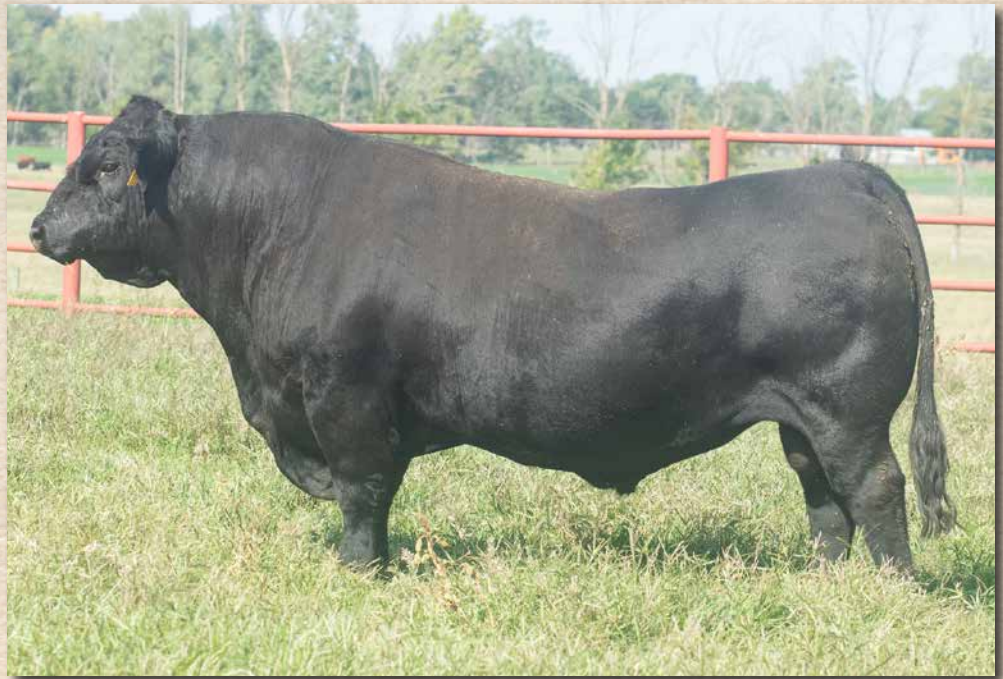
JC MR HURON 7262G Sire of Lots 111-117.

The Huron cattle have been well received the last few years with their added length mass and stoutness. The cattle are incredible growth and carcass quality and will improve ranchers bottomline at marketing time.