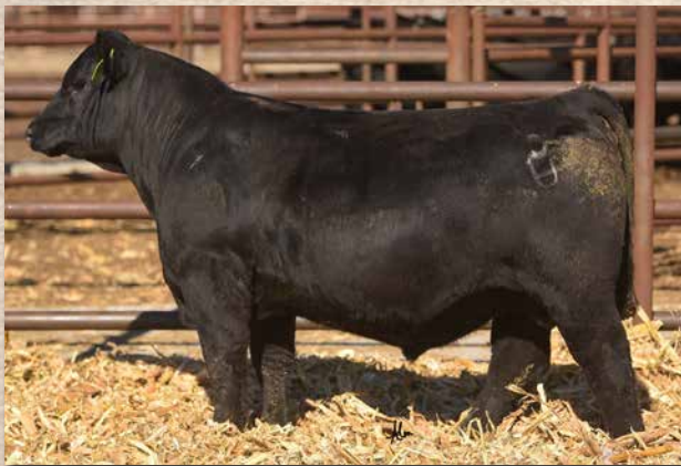
CCR BIG HORN 6065L Sells as Lot 70.