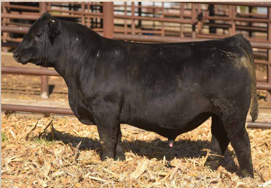
CCR RAWHIDE 8648L Sells as Lot 31.

A great Rawhide who has head turning type and balance. The bottom side of his pedigree is filled with some of the Maternal greats in our program in Paydirt and Graduate.