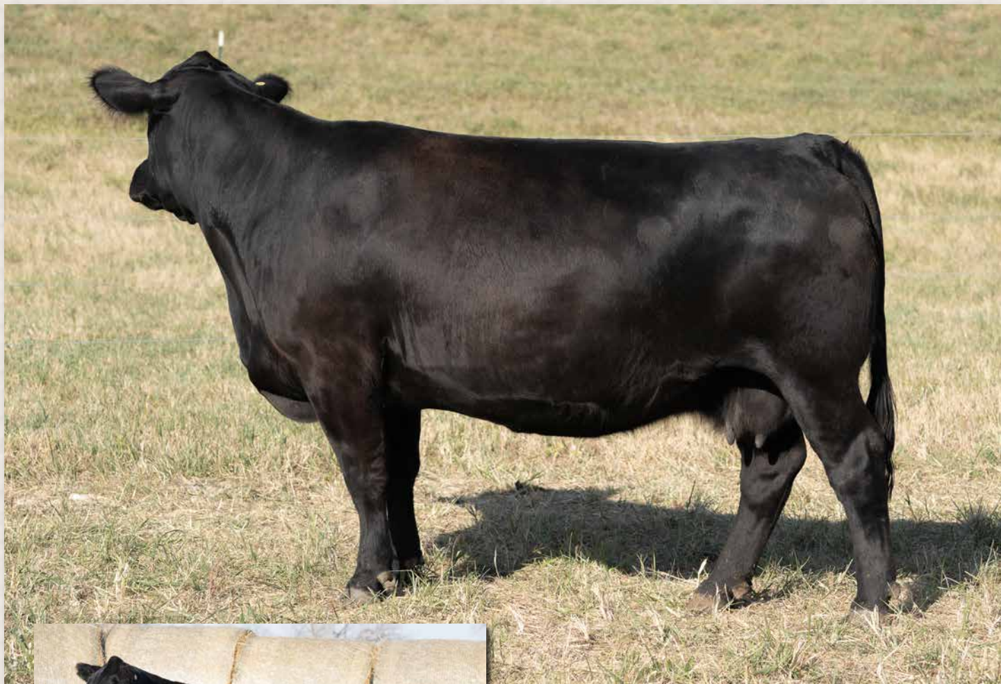
CLRS ELLIS ISLAND 715E || SELLS AS LOT 92.