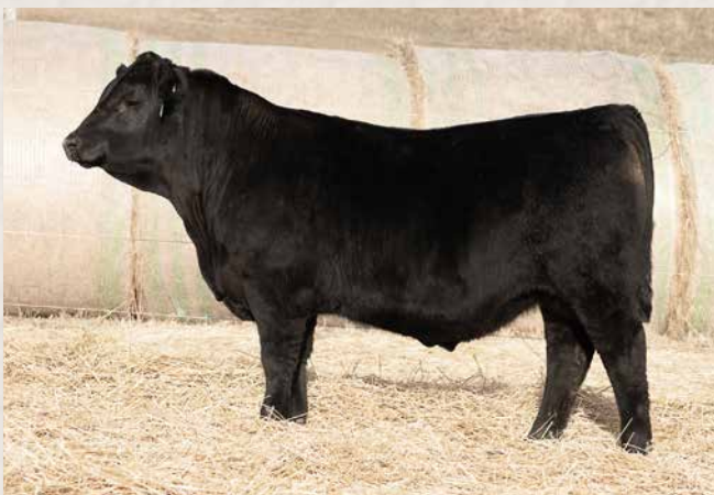
CLRS 8086L || SON OF LOT 81.