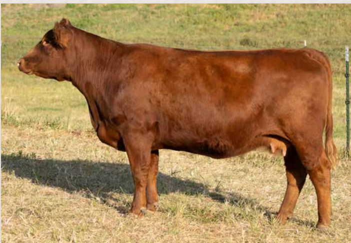
CLRS HEZINNIA 063H || SELLS AS LOT 71.