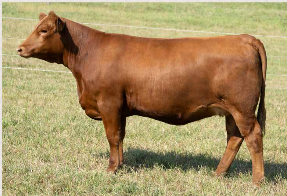
CLRS LEMON DROP 320L || SELLS AS LOT 61.

Bred to KBHR CHARGER K102 (4104220). Estimated calving date 1/20/2025.