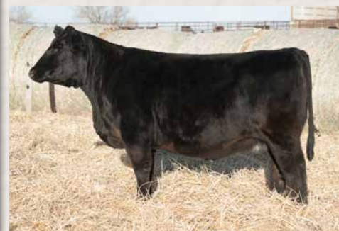
CLRS 088H || DAUGHTER OF LOT 83.