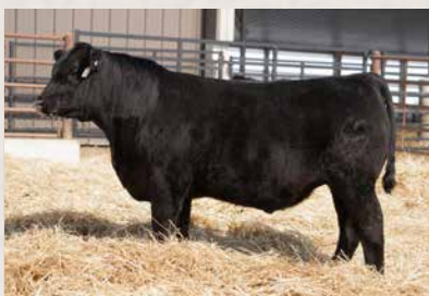
KBHR KEYNOTE K229