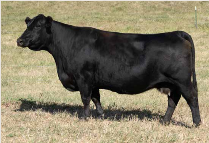
K M J MS SFORCE E324 || SELLS AS LOT 98.