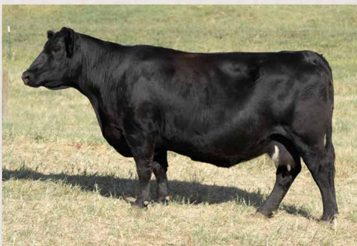
K M J MS RUBICON E372 || SELLS AS LOT 100.