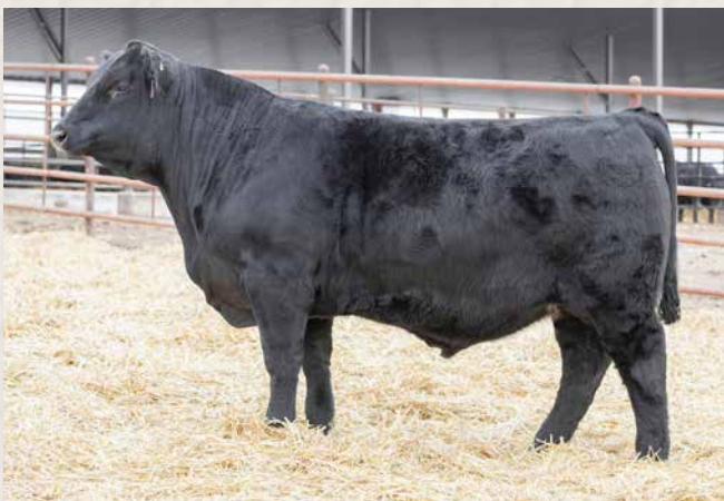
HOOK'S 43F || SON OF LOT 110.