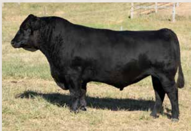
CLRS JAY LENO 957J