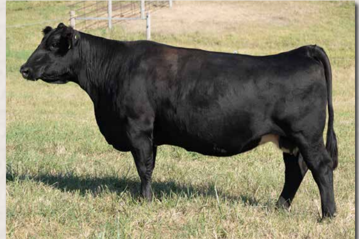
HOOK'S CARMEN14C || SELLS AS LOT 106.