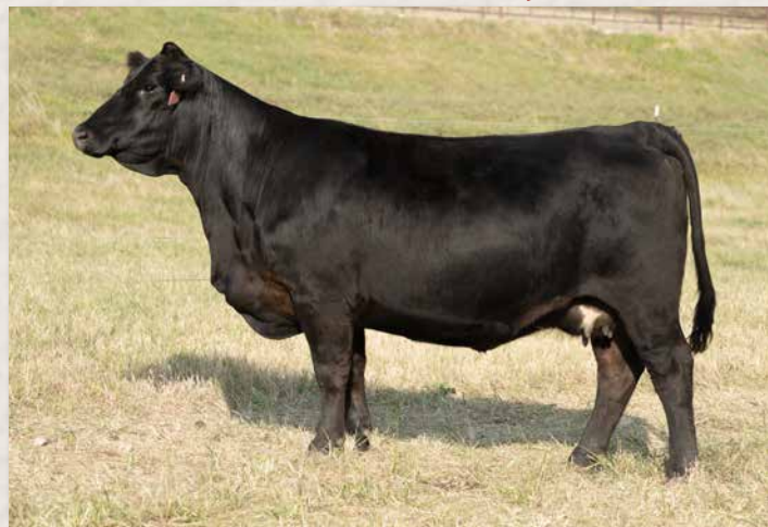
CLRS J C PENNY 167J || SELLS AS LOT 49.

Homozygous Black Homozygous Polled 5/8 SM 3/8 AN Cow ASA #3874449 CLRS 167J BD: 2/10/2021