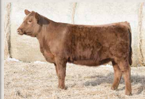
CLRS FELICITY 826F || SELLS AS LOT 65.