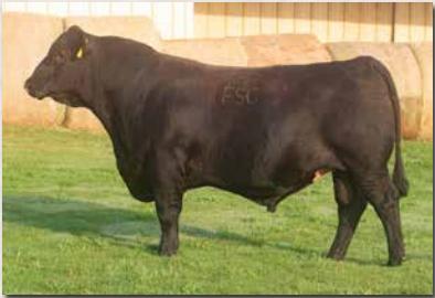
FSCR K048 FREELANCE