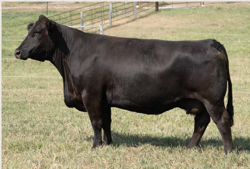
CLRS FAIRY TALE 829F || SELLS AS LOT 82.