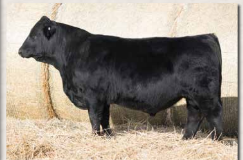
CLRS 015K || SON OF LOT 22.