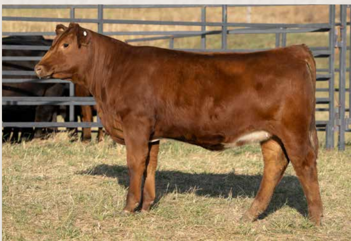
CLRS MARIGOLD 462M || SELLS AS LOT 76.