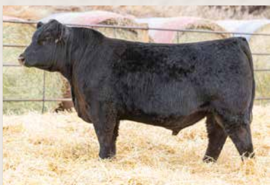
BSUM SUMMIT 303L