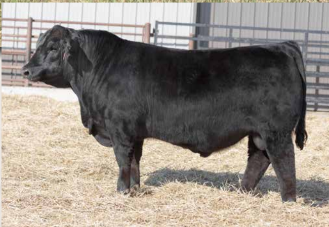
CLRS HERDBOOK 316H || FULL BROTHER TO LOT 23.