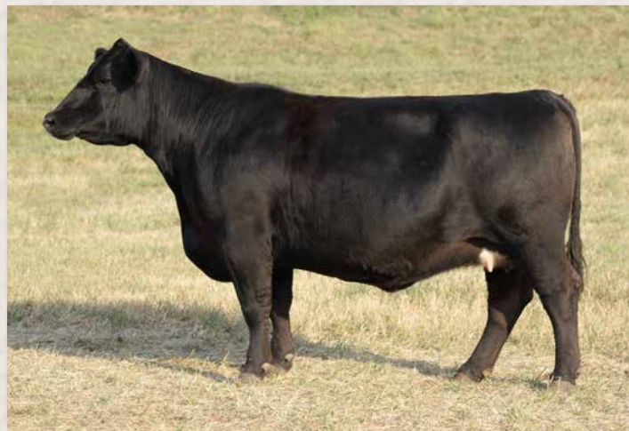
CLRS HOPE 012H || SELLS AS LOT 39.

Homozygous Black Homozygous Polled 1/2 SM 1/2 AN Cow ASA #3709061 CLRS 012H BD: 1/18/2020