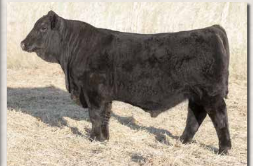
CLRS 3034H || SON OF LOT 109.