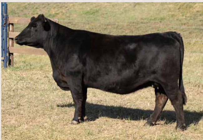
CLRS KORDOVA 248K || DAUGHTER OF LOT 1.