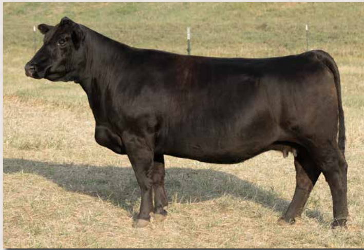
CLRS GAMBIA 970G || SELLS AS LOT 12.