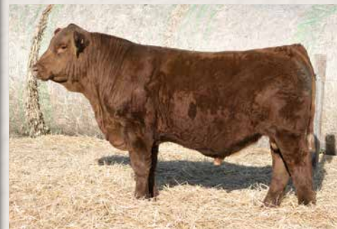
CLRS 3071J || SON OF LOT 73.