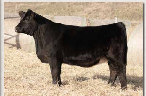
CLRS 323L || DAUGHTER OF LOT 48.