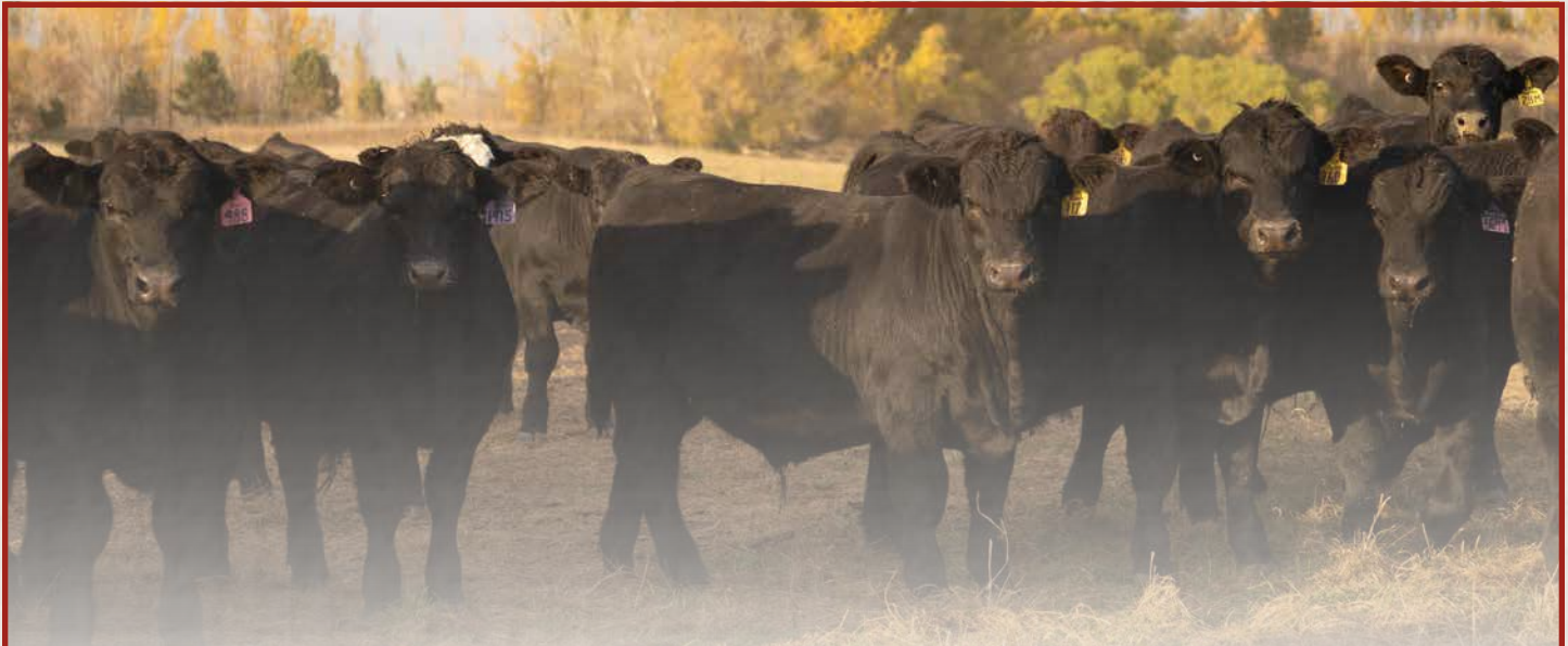
CLRS MALLORY 4116M || SELLS AS LOT 80.