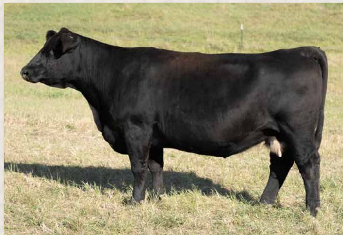
CLRS HARINA 033H || SELLS AS LOT 33.