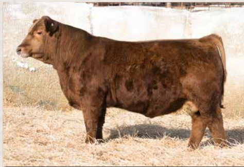
CLRS 915K || SON OF LOT 64.