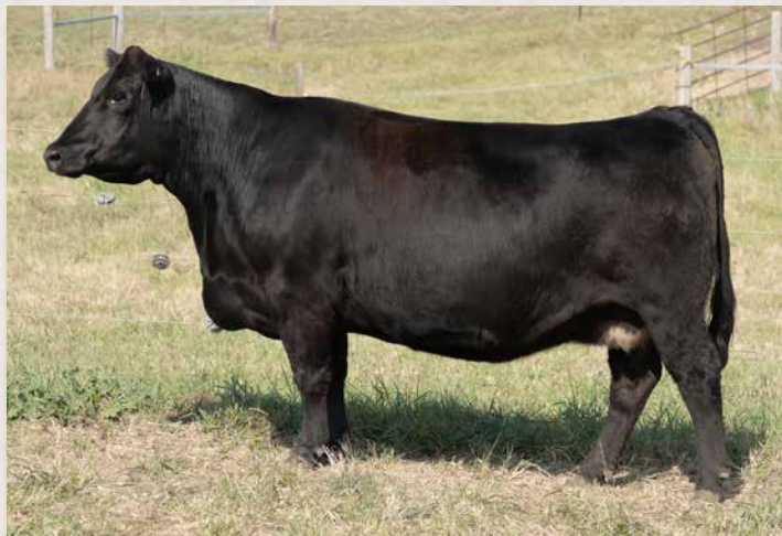
CLRS GRACIOUS 906G || SELLS AS LOT 13.