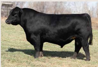
HA AMPLITUDE 9J