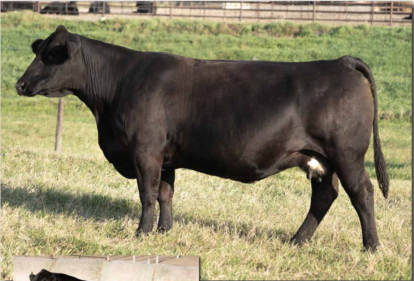
CLRS GRANDIOUS 967G || SELLS AS LOT 2.