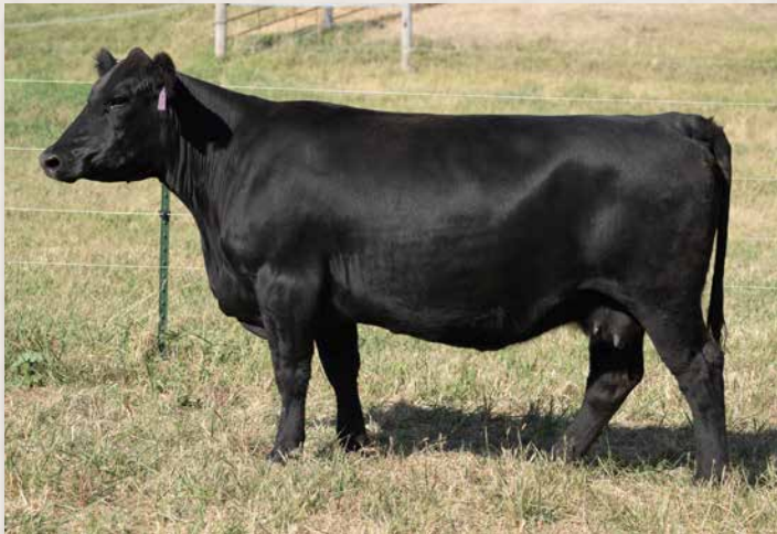
CLRS HEADPIECE 024H || SELLS AS LOT 25.