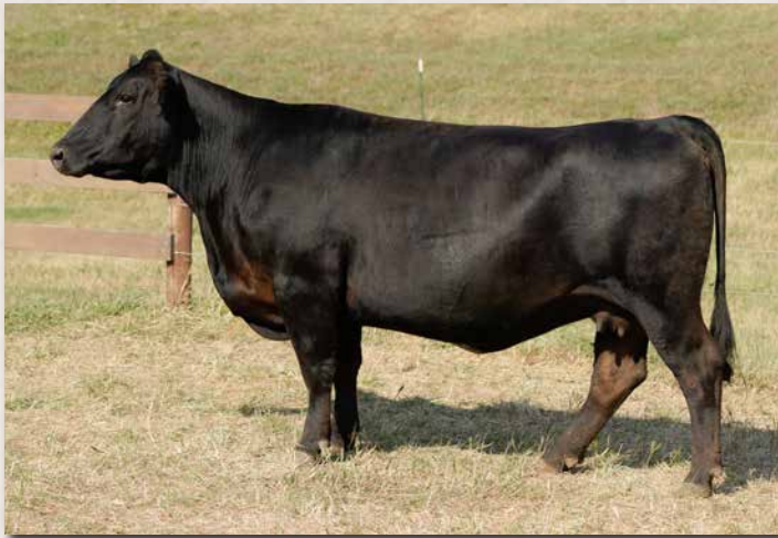
CLRS HAWAIIAN 0101H || SELLS AS LOT 36.