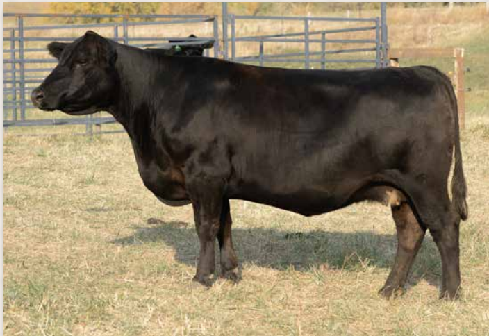
CLRS HELPHI 098H || SELLS AS LOT 37.