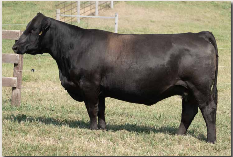
CLRS HONORED 079H || SELLS AS LOT 17.