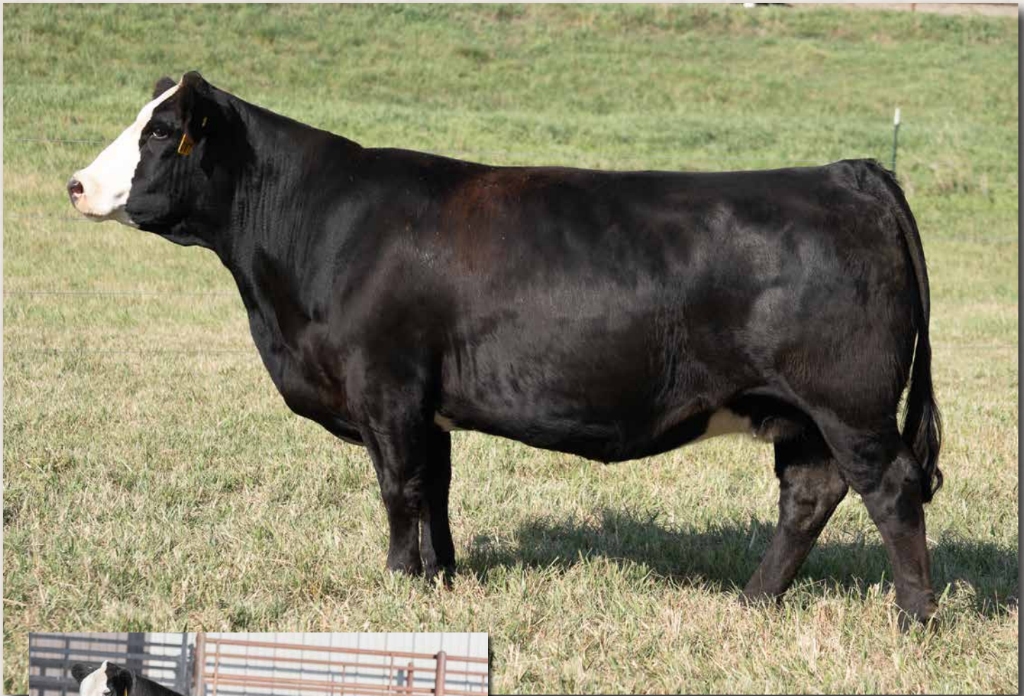
CLRS HESI 0117H || SELLS AS LOT 19.