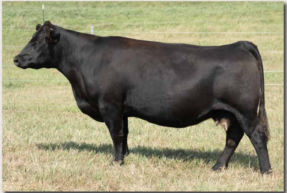
CLRS HIROSHIMA 0111H || SELLS AS LOT 15.