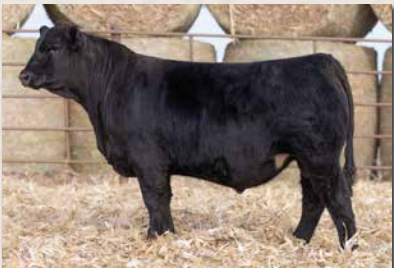
SCHOOLEY LIMITLESS 344L