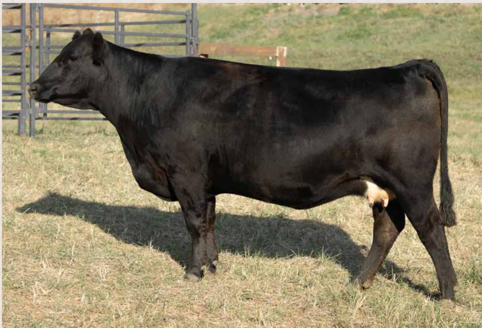
CLRS HALLMARK 018H || SELLS AS LOT 18.

Bred to KBHR GUNSMOKE J131 (3943843). Estimated calving date 3/3/2025.