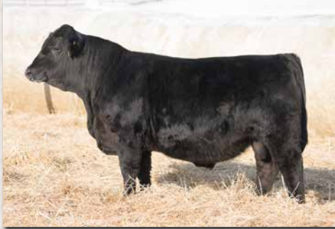
CLRS 939K || SON OF LOT 5.