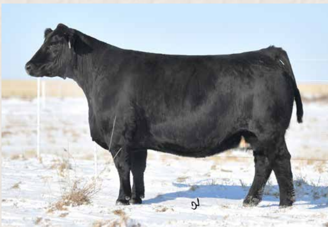
CLRS 316A || DAM OF LOT 23.