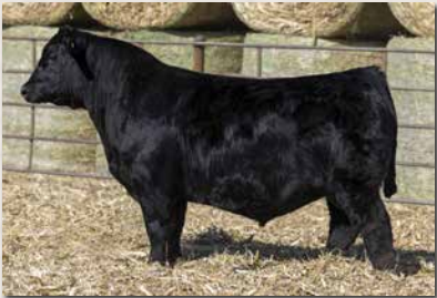
TERS KODIAK 206K