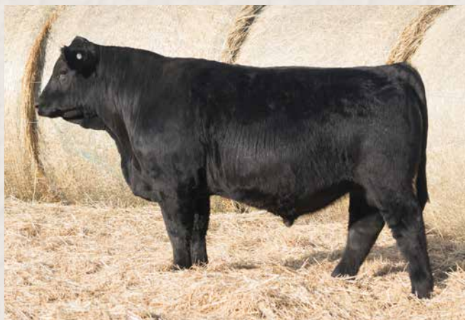
CLRS 715K || SON OF LOT 92.