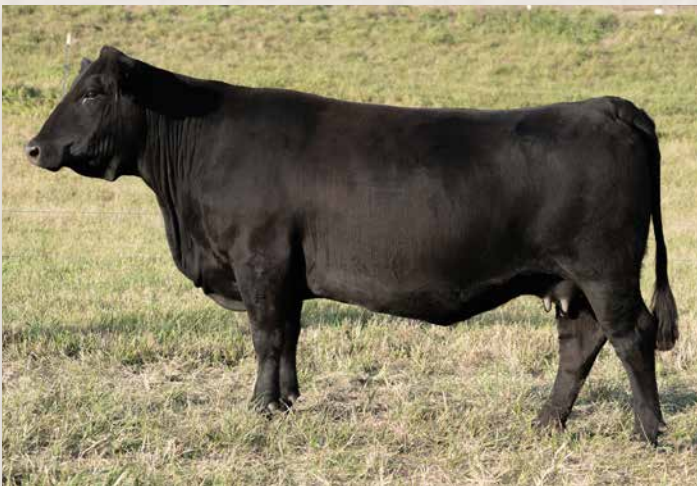
CLRS GRACE 941G || SELLS AS LOT 8.