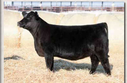
CLRS GRACIE 944G || SELLS AS LOT 6.