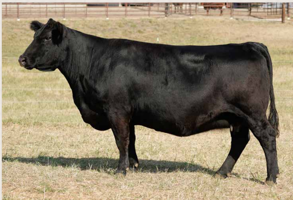
HOOK'S ELLA 89E || SELLS AS LOT 94.

Bred to SCHOOLEY LAZARUS 430L (4256894). Estimated calving date 1/28/2025.