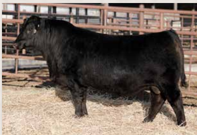
TERS LEOPOLD 316L