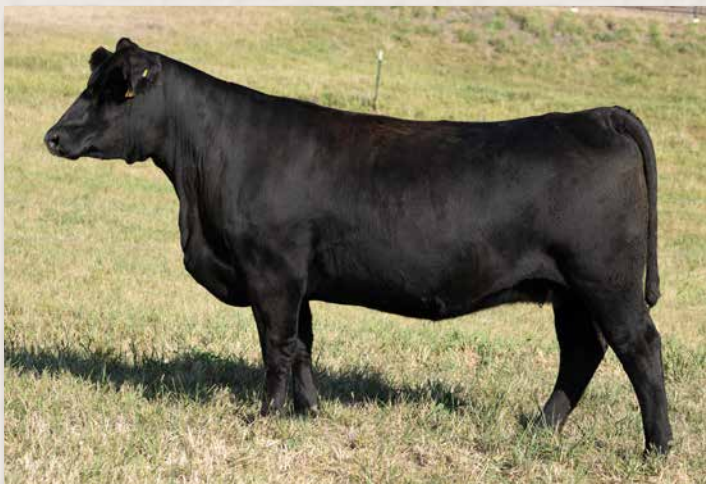
CLRS KASSANDRA 2118K || SELLS AS LOT 58.