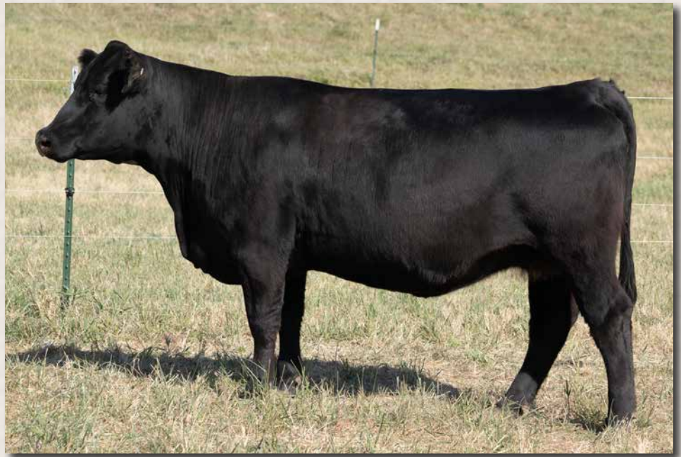
FSCR K048 FREELANCE || SERVICE SIRE OF LOT 52.