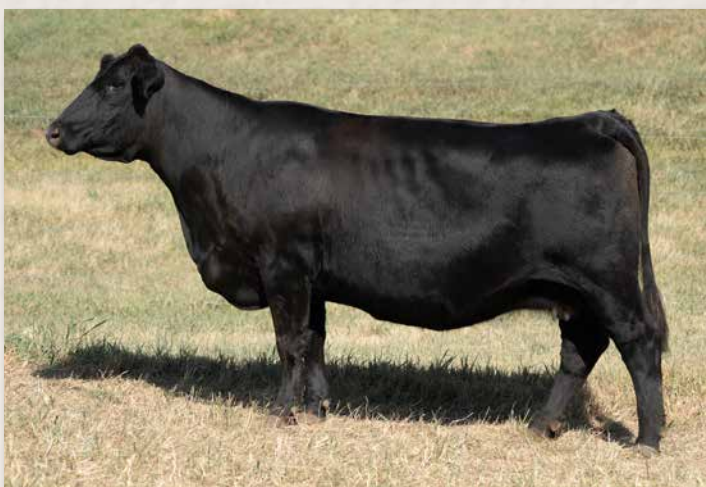
HOOK'S FORTUNATE 90F || SELLS AS LOT 91.