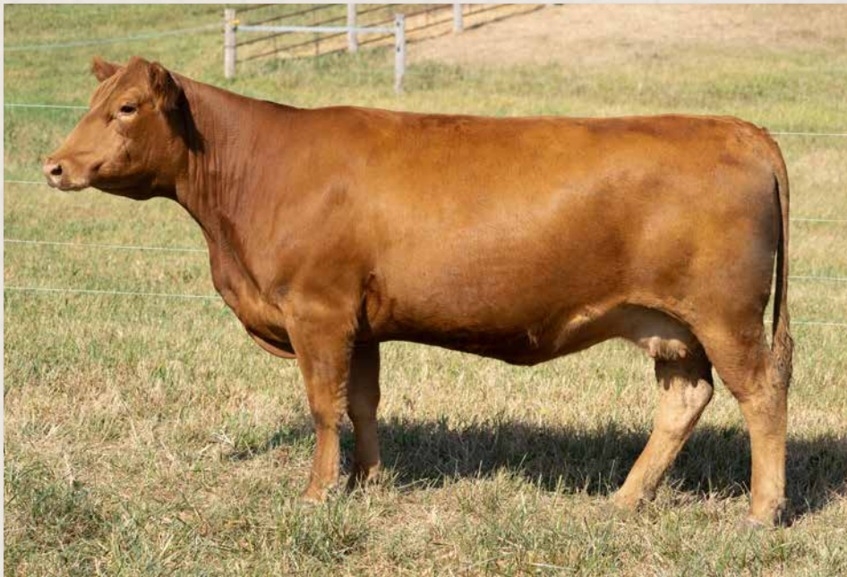
CLRS ENCHANTMENT 714E || SELLS AS LOT 67.

Bred to GW MAJOR MOVE 590E (3242835). Estimated calving date 1/27/2025.