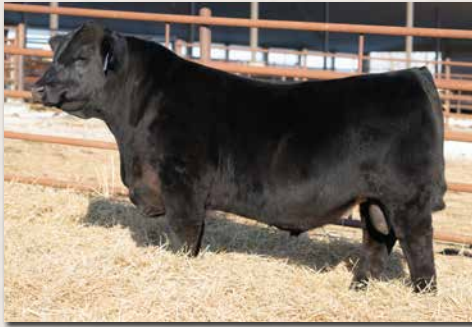
CLRS JERICO 336J || FULL BROTHER TO LOT 47.