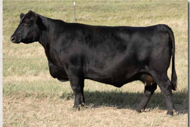
K M J MS SFORCE E314 || SELLS AS LOT 96.