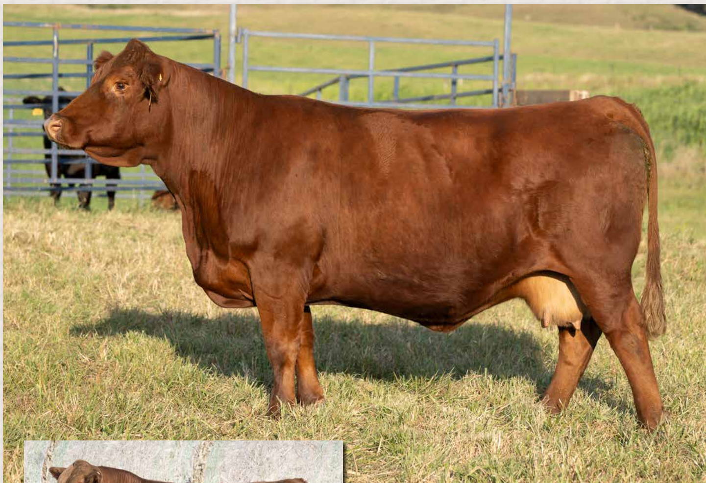
CLRS EZINNIA 733E || SELLS AS LOT 68.