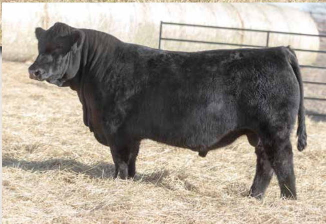
CLRS 8018H || SON OF LOT 86.