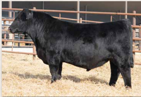
CLRS JET BLACK 706J || SON OF LOT 93.