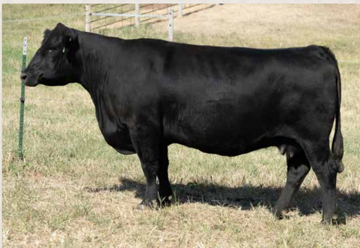
K M J MS C20 E364 || SELLS AS LOT 99.