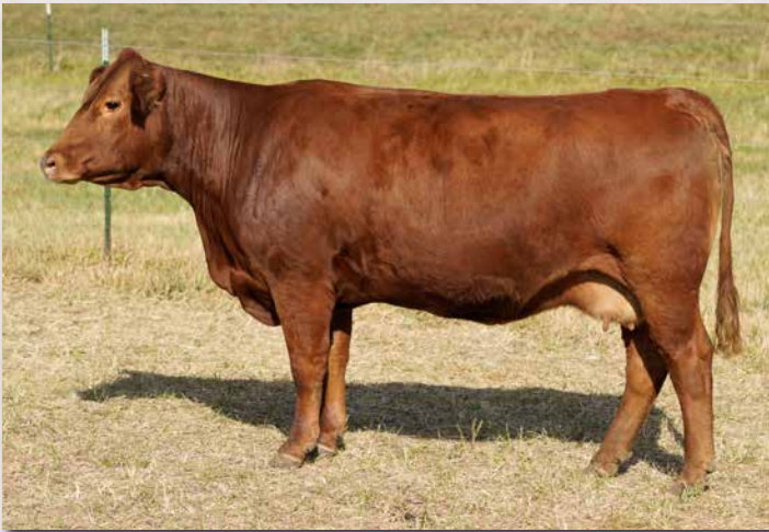
CLRS HEFFIE 094H || SELLS AS LOT 70.