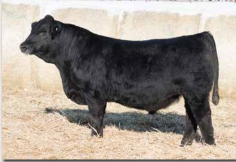
CLRS 981K || SON OF LOT 3.