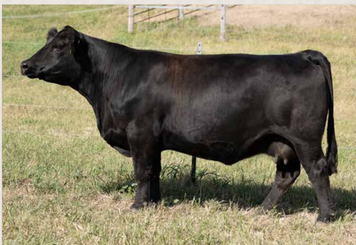
CLRS HABANERO 0115H || SELLS AS LOT 32.