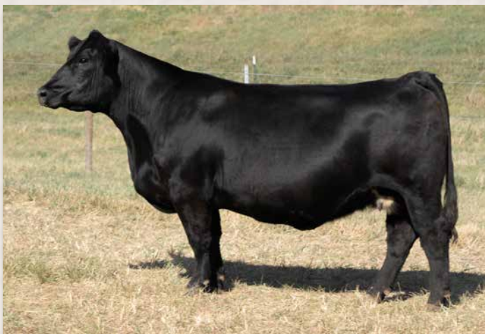
CLRS HONEYBEE 0106H || SELLS AS LOT 31.