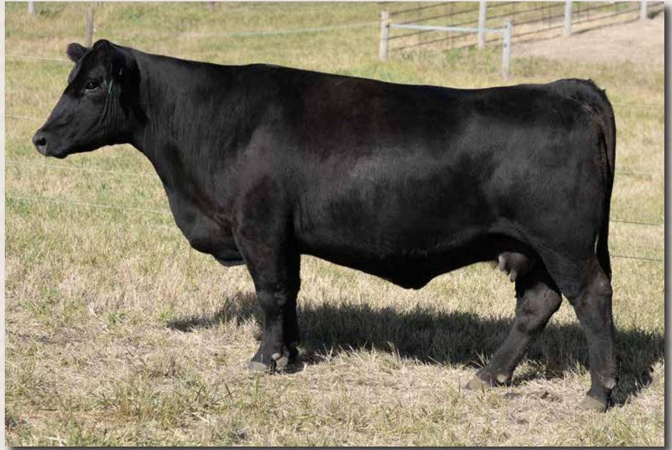
CLRS HEKKEN 060H || SELLS AS LOT 21.