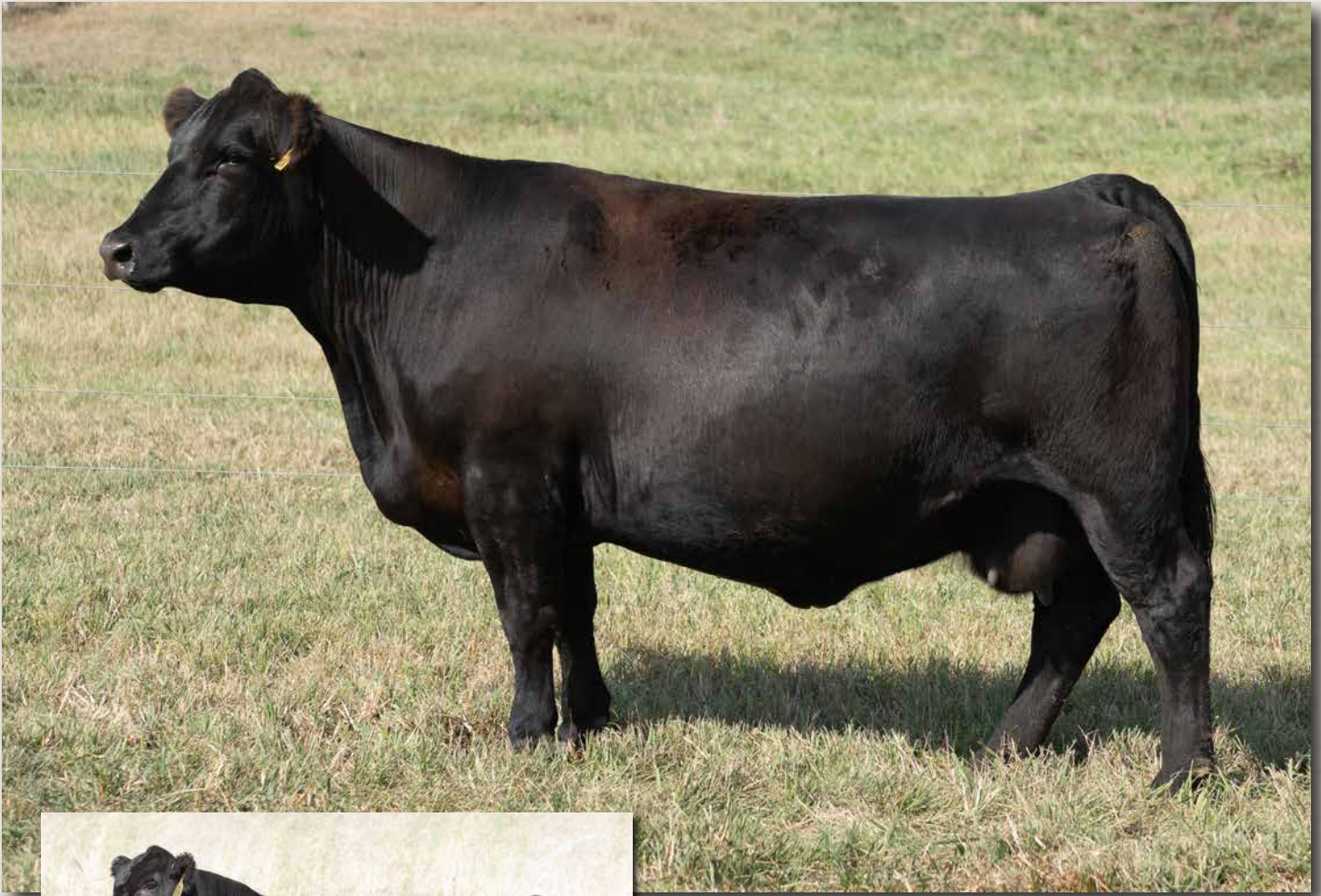
HOOK'S FLOURISH 86F || SELLS AS LOT 81.