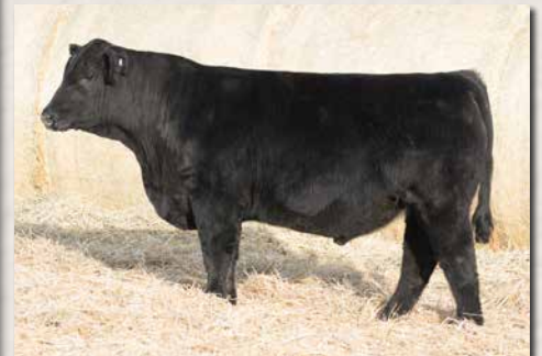
HOOK'S EBONY 206E || SELLS AS LOT 102.