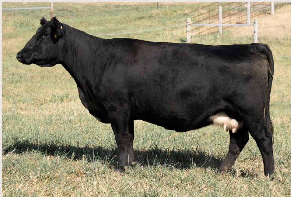
CLRS EMBRIA 706E || SELLS AS LOT 93.