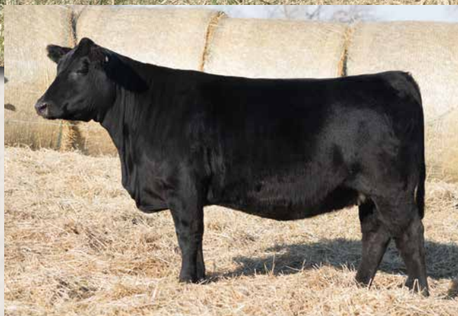
CLRS JEMIMA 144J || DAUGHTER OF LOT 92.