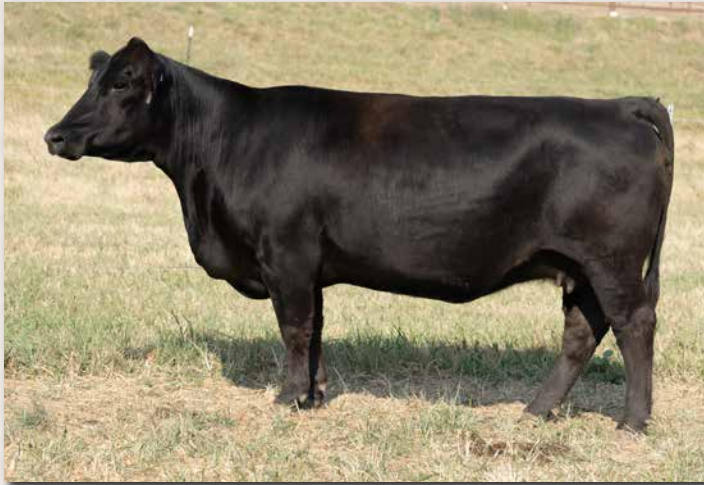
CLRS HEAD START 010H || SELLS AS LOT 24.