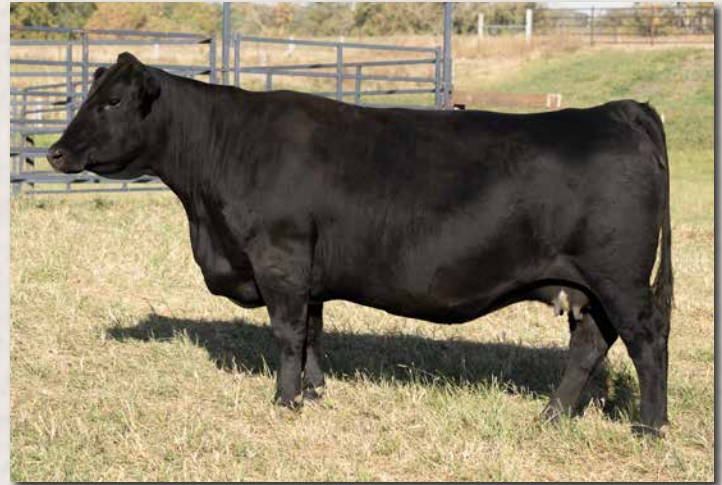
K M J MS SFORCE E347 || SELLS AS LOT 95.