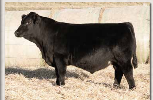
CLRS 834L || SON OF LOT 88.