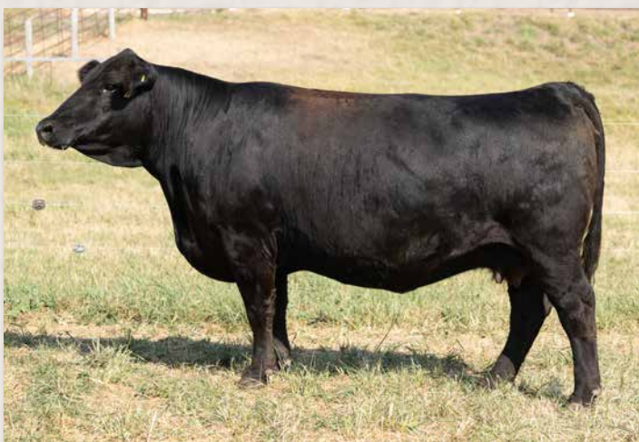
CLRS HONNIA 093H || SELLS AS LOT 38.