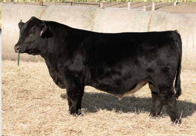
CLRS 967L || SON OF LOT 2.