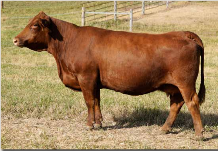
HOOK'S ESTHER 28E || SELLS AS LOT 69.