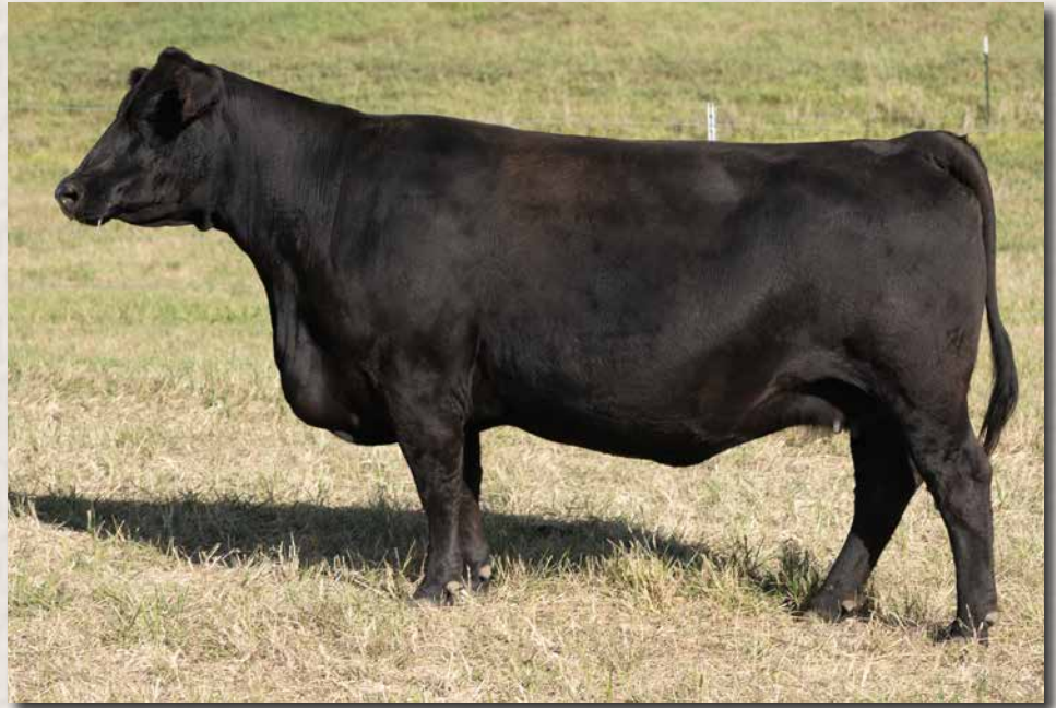
CLRS FIRST PLACE 832F || SELLS AS LOT 87.