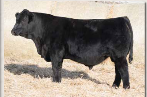
CLRS 018K || SON OF LOT 18.