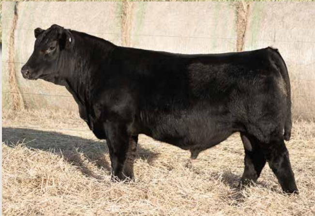
CLRS 978L || SON OF LOT 1.