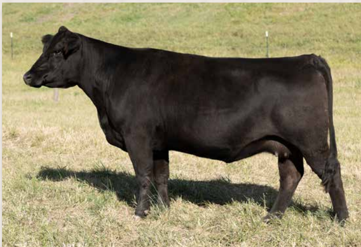
CLRS HELAN 0127H || SELLS AS LOT 43.