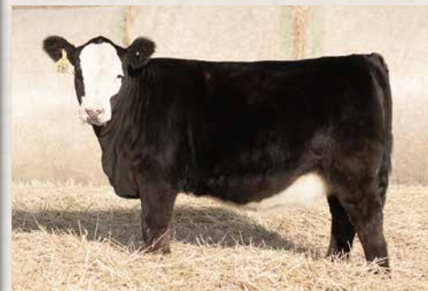
CLRS 387L || DAUGHTER OF LOT 94.