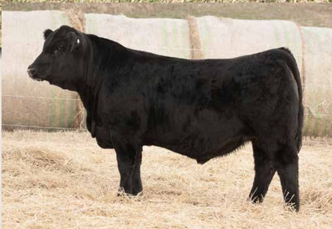
CLRS 096L || SON OF LOT 20.