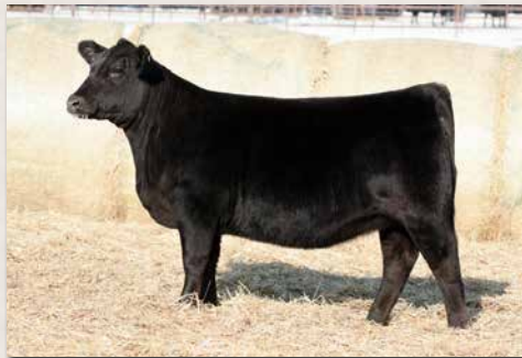
CLRS 251K || DAUGHTER OF LOT 82.