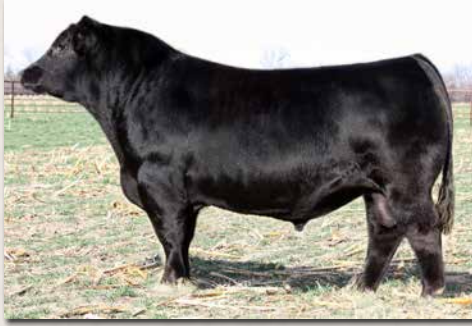
CLRS DIVIDEND 405D || SON OF LOT 108.