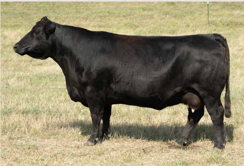
CLRS GLAMOR 956G || SELLS AS LOT 11.