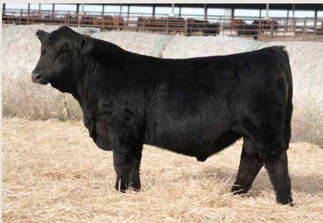
CLRS 8018J || SON OF LOT 86.