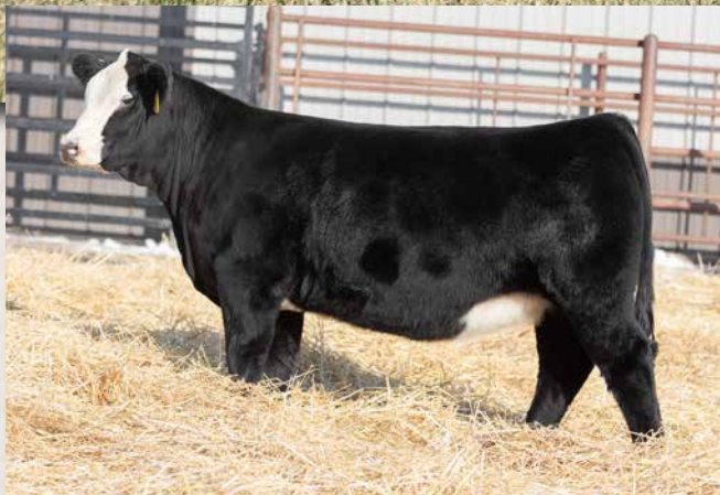
HOOK'S GINGER 87G || FULL SISTER TO LOT 19.