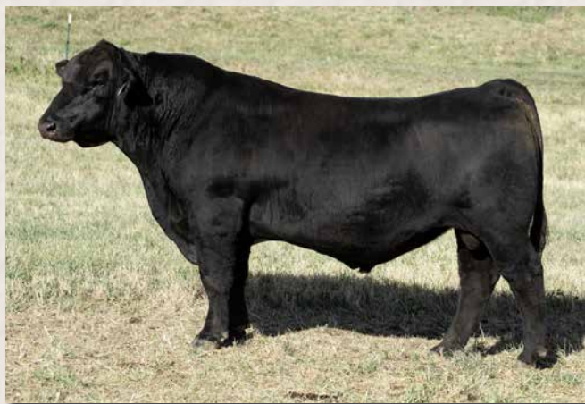
CLRS KOBRA 0510K || SON OF LOT 14.