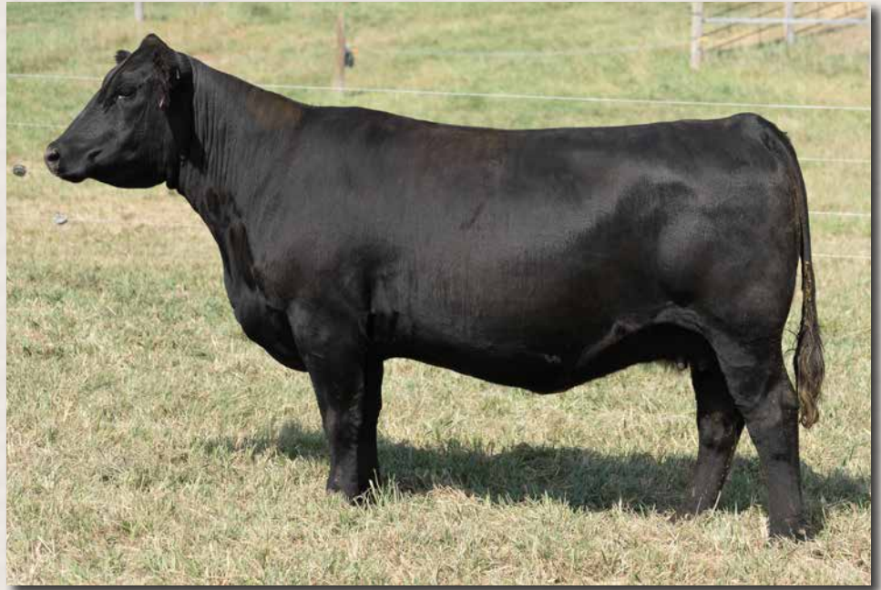
CLRS JUNO 1115J || SELLS AS LOT 47.

Bred to CLRS KOBRA 0510K (4032011). Estimated calving date 3/24/2025.