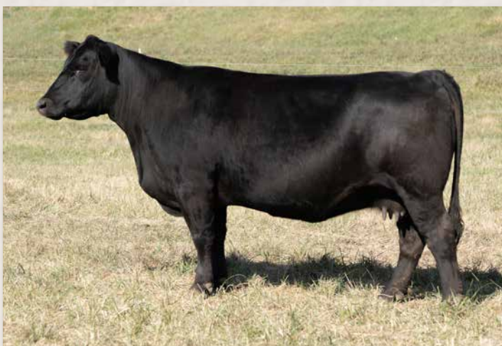
CLRS HEVON 0120H || SELLS AS LOT 44.