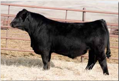
CLRS LINCOLN 0107L