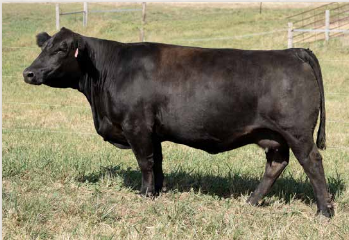
CLRS HORSERADISH 0113H || SELLS AS LOT 42.