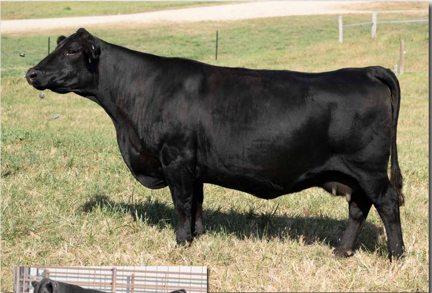
HOOKS ZURICH 18Z || SELLS AS LOT 110.