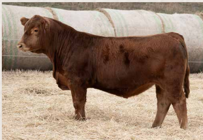
CLRS 733L || SON OF LOT 68.