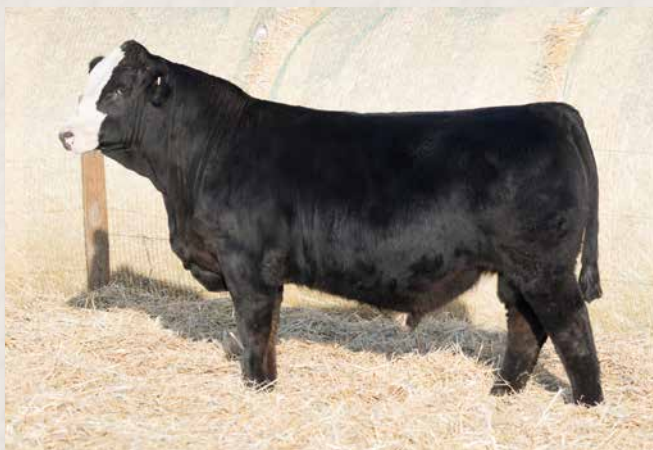
CLRS 0217K || SON OF LOT 19.