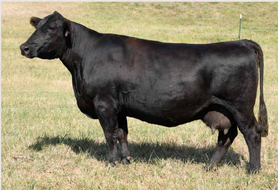
HOOKS ANNAKA 34A || SELLS AS LOT 109.

Bred to KBHR KEYNOTE K229 (4104347). Estimated calving date 1/29/2025.