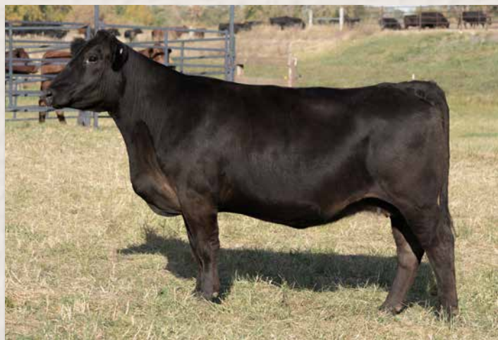
CLRS KRISTINA 2135K || SELLS AS LOT 55.