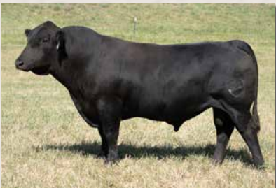
KBHR GUNSMOKE J131