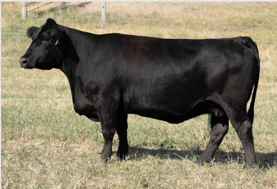
CLRS JINGLE BELLS 1103J || SELLS AS LOT 48.

Bred to SCHOOLEY LAZARUS 430L (4256894). Estimated calving date 4/29/2025.