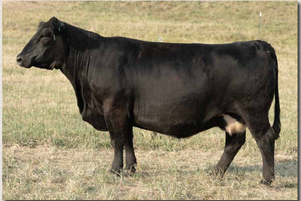
HOOK'S FANNY 223F || SELLS AS LOT 84.