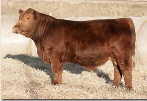
CLRS 858L || SON OF LOT 66.