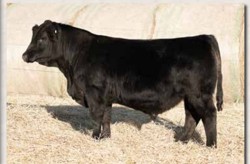
CLRS 902L || SON OF LOT 4.