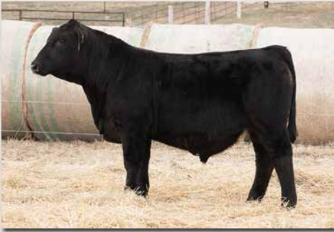
CLRS 8223L || SON OF LOT 84.