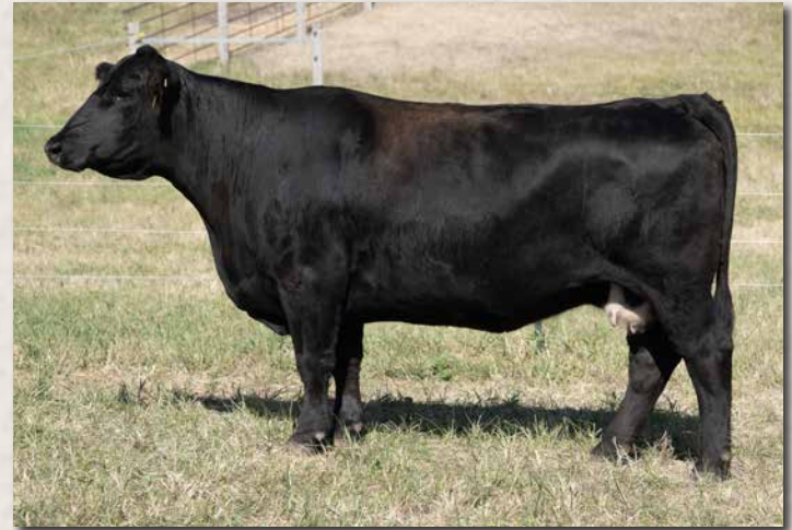
HOOK'S DIANA 37D || SELLS AS LOT 105.