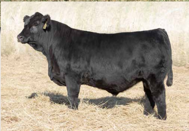
CLRS 8086H || SON OF LOT 81.