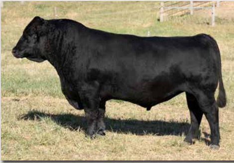
CLRS JAY LENO 957J || SON OF LOT 10.