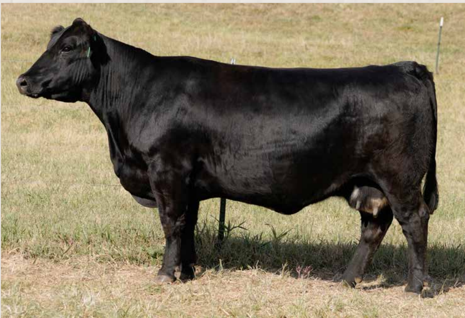
CLRS FASHIONISTA 818F || SELLS AS LOT 85.

Bred to KBHR KEYNOTE K229 (4104347). Estimated calving date 1/26/2025.