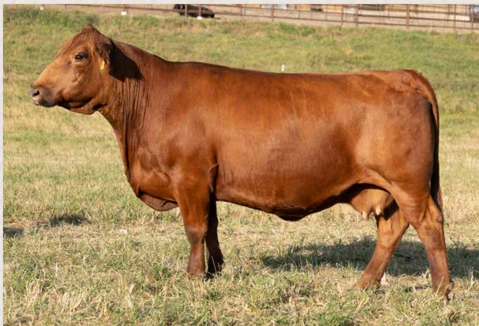
HOOKS ALLISON 71A || SELLS AS LOT 73.

Bred to CLRS JAY LENO 9571 (3874303). Estimated calving date 3/2/2025.