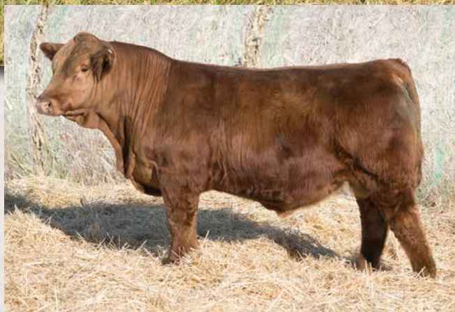
CLRS 733J || SON OF LOT 68.