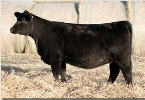
CLRS 222K || DAUGHTER OF LOT 15.