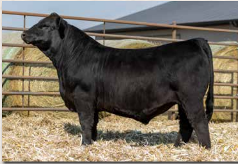
SCHOOLEY HAGGARD A411H || SERVICE SIRE OF LOT 17.