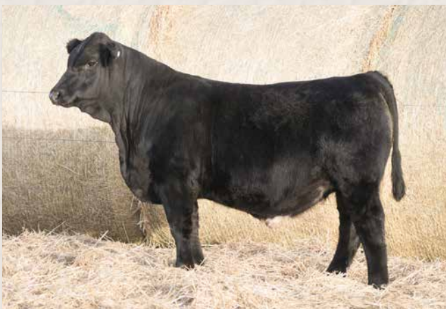
CLRS 096K || SON OF LOT 20.