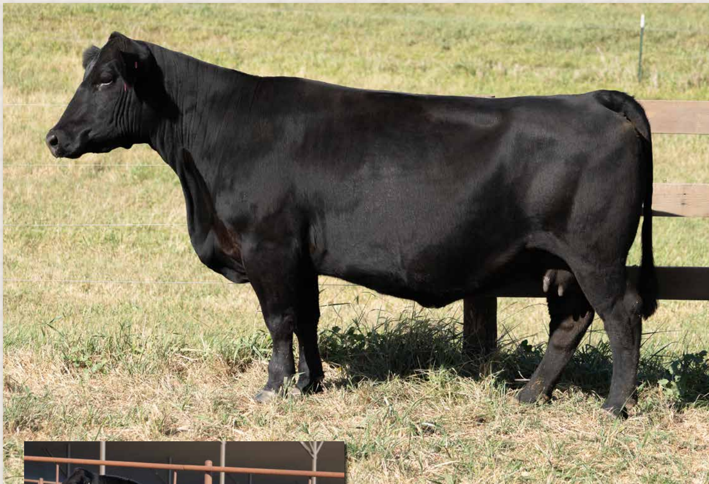
CLRS HANOI 0110H || SELLS AS LOT 14.