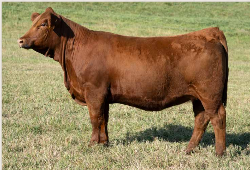
CLRS LENORA 324L || SELLS AS LOT 63.

Bred to CDI/NF HONOR GUARD 267H (3801515). Estimated calving date 1/18/2025.