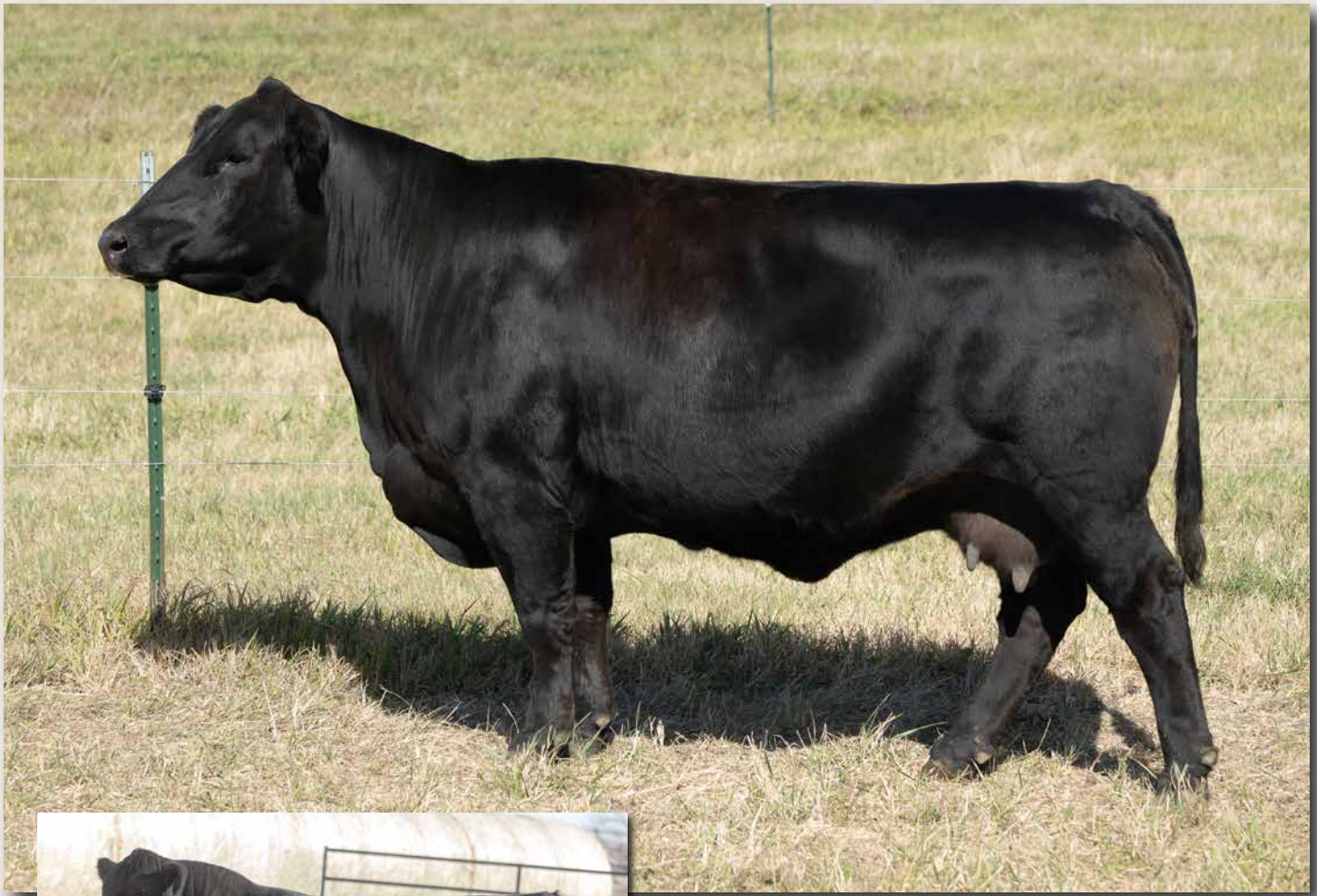
HOOK'S FREDERICA 18F || SELLS AS LOT 86.