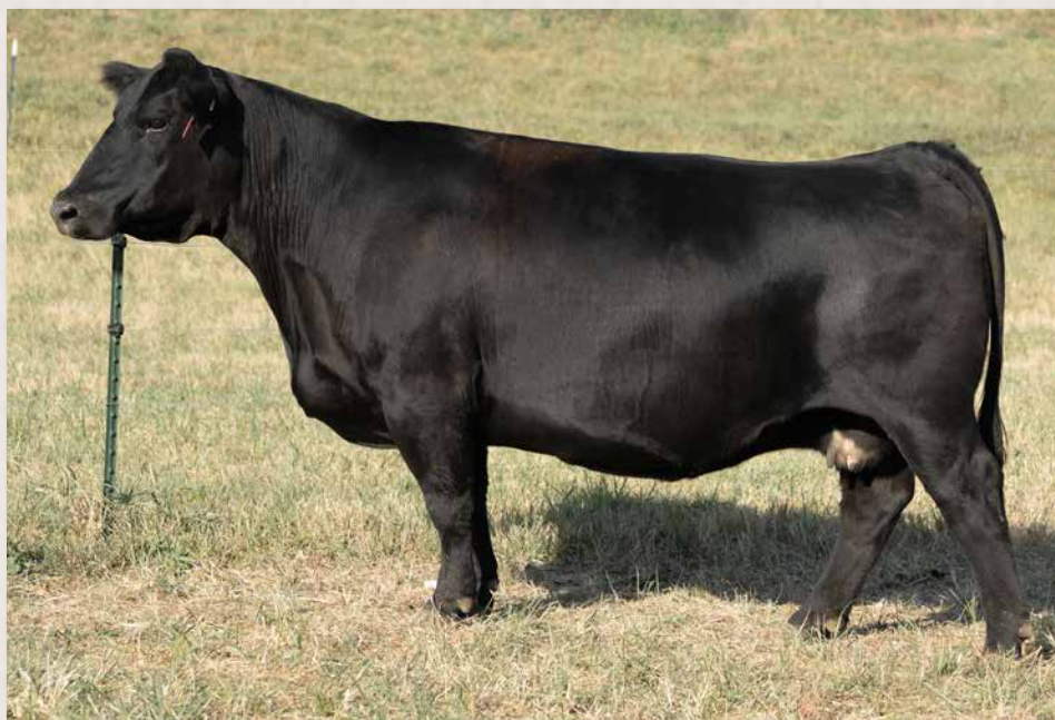
CLRS FLOWER GIRL 867F || SELLS AS LOT 83.

Bred to KBHR GUNSMOKE J131 (3943843). Estimated calving date 2/1/2025.