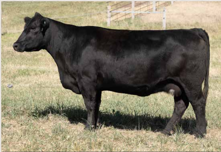
CLRS HAPPY GIRL 037H || SELLS AS LOT 30.