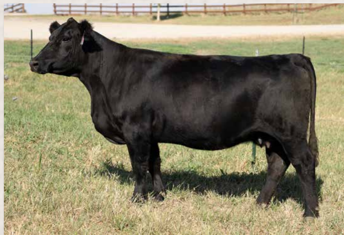
CLRS JULIANNA 100J || SELLS AS LOT 50.

Homozygous Black Homozygous Polled 3/4 SM 1/4 AN Cow ASA #3874383 CLRS 100J BD: 1/10/2021