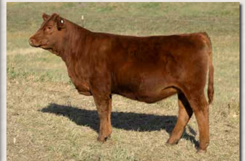
CLRS 486M || DAUGHTER OF LOT 67.