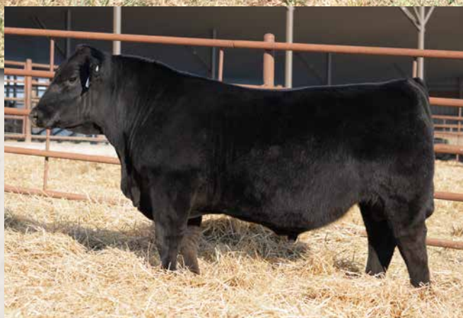
CLRS INSPIRED 0110K || SON OF LOT 14.