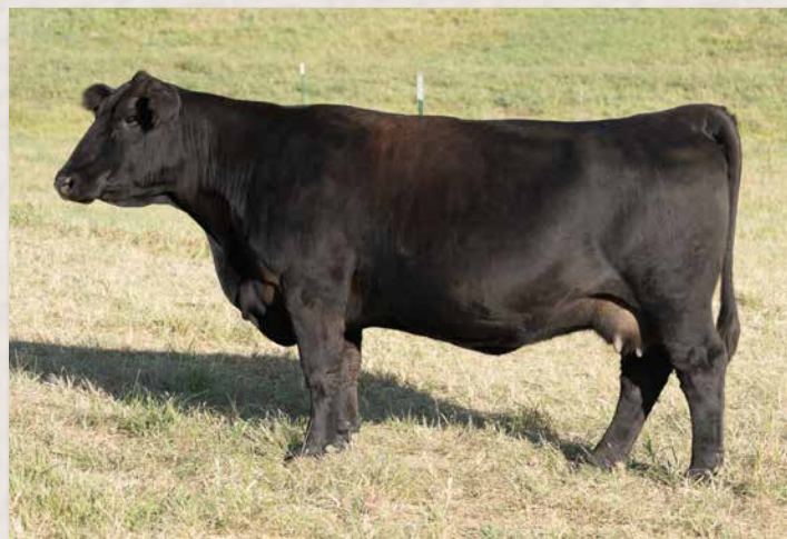
CLRS HOLLAND 056H || SELLS AS LOT 35.