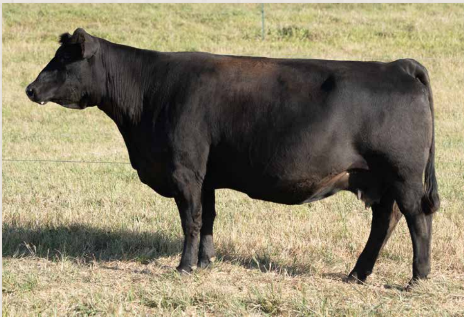
CLRS FRUITFUL 834F || SELLS AS LOT 88.

Bred to KBHR SCREENSHOT K167 (4104285). Estimated calving date 2/17/2025.