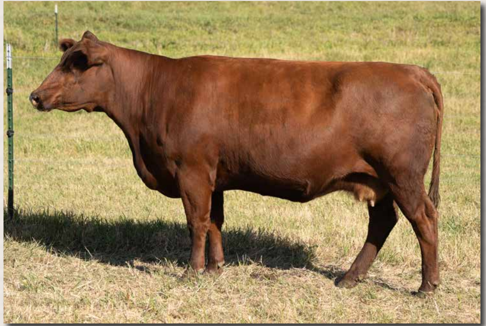
CLRS FIREFLY 858F || SELLS AS LOT 66.