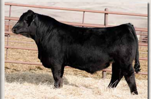
CLRS LINCOLN 0107L || SON OF LOT 16.