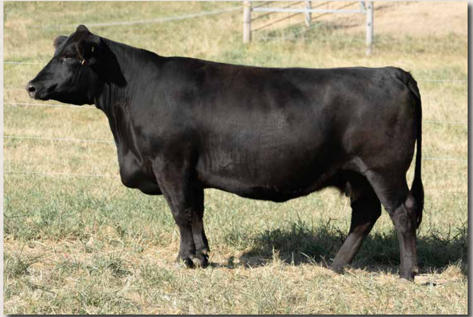
CLRS GYPSUM 981G || SELLS AS LOT 3.