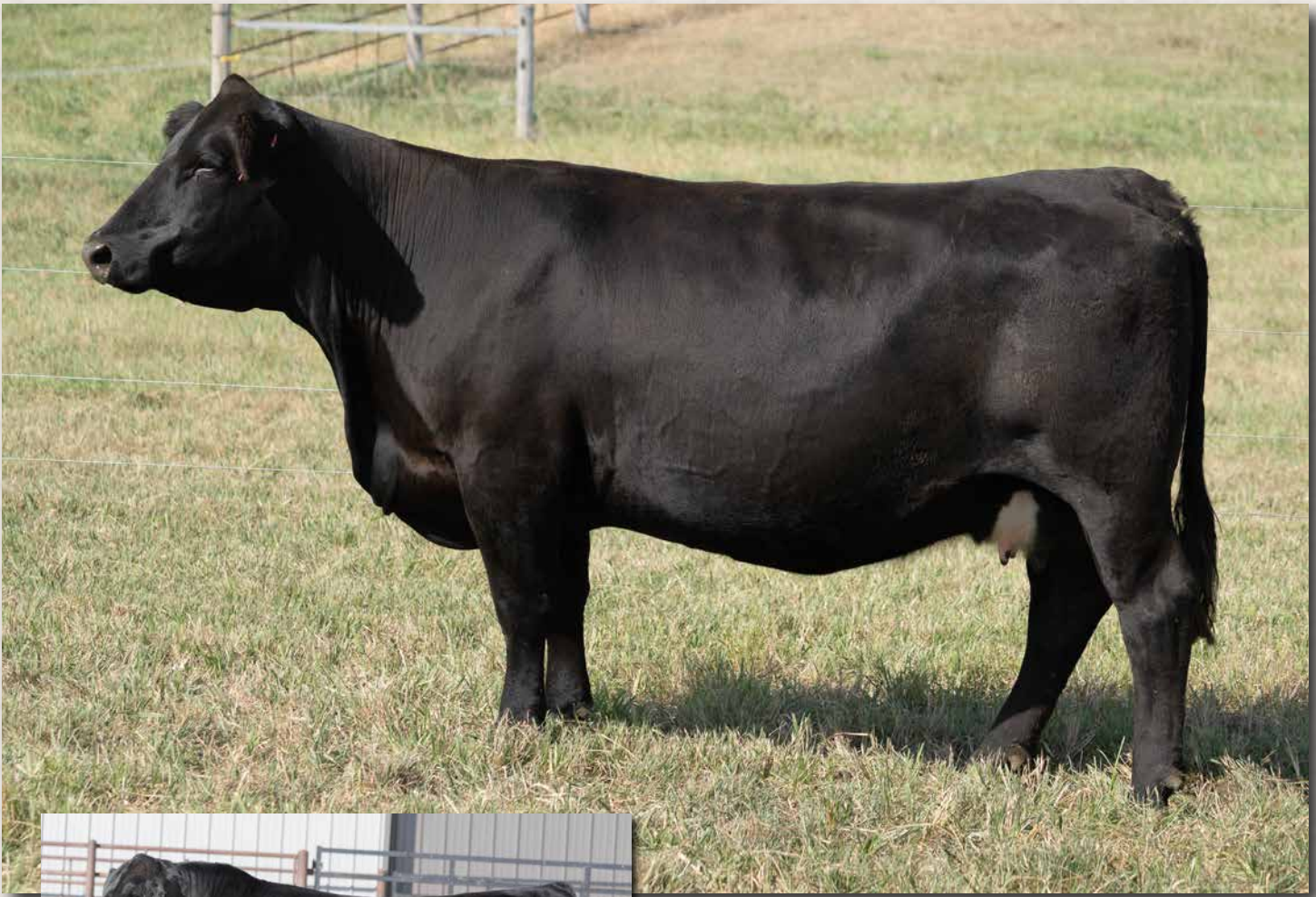
CLRS HUMMUS 0129H || SELLS AS LOT 23.