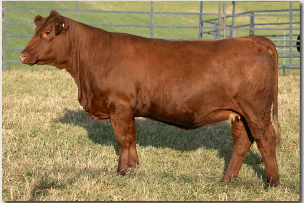
CLRS LYNELLE 3314L || SELLS AS LOT 62.