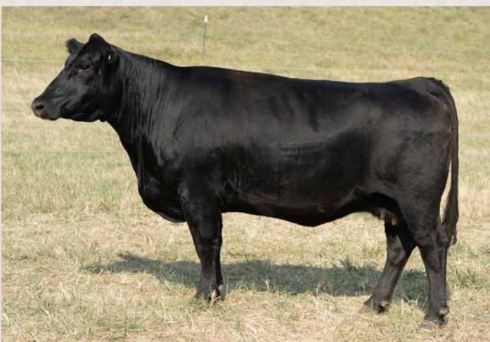
CLRS GEHENNA 936G || SELLS AS LOT 9.