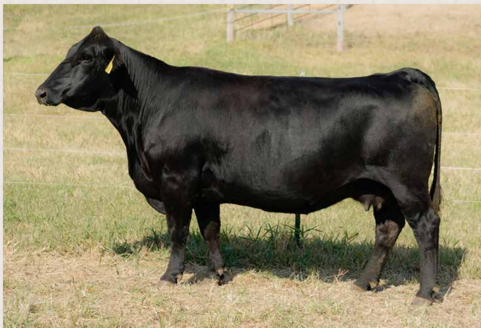
CLRS GLORIOUS 902G || SELLS AS LOT 4.