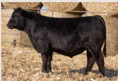
SCHOOLEY LAZARUS 430L