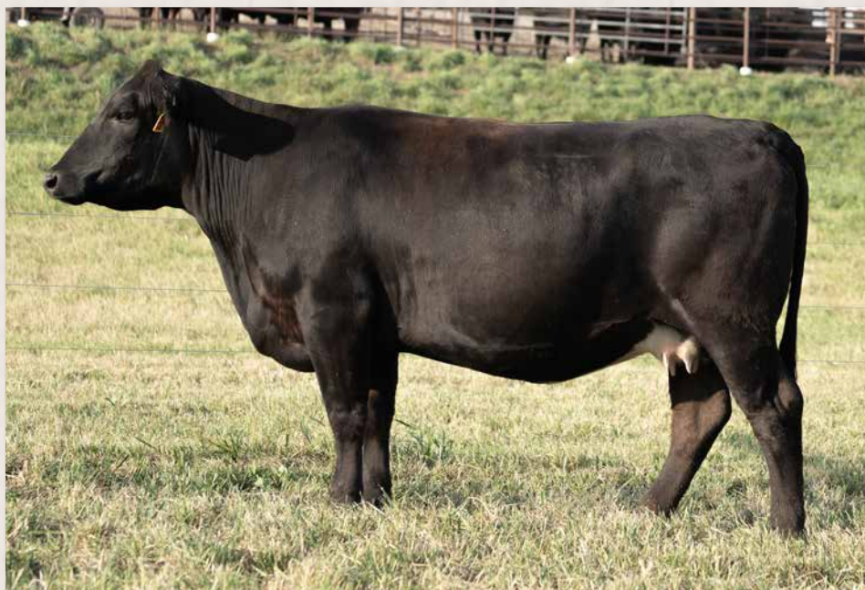
CLRS KAZUMI 267K || SELLS AS LOT 53.

Bred to SCHOOLEY LAZARUS 430L (4256894). Estimated calving date 3/18/2025.