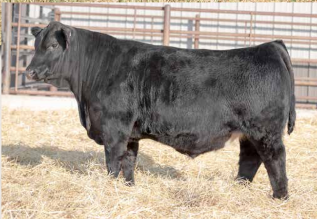
HOOK'S 21G || SON OF LOT 110.