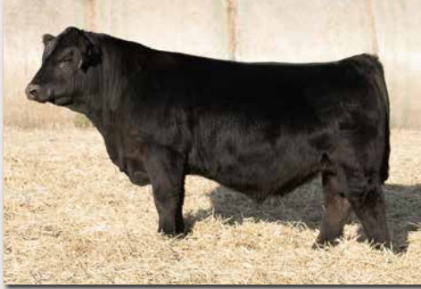
CLRS 060L || SON OF LOT 21.