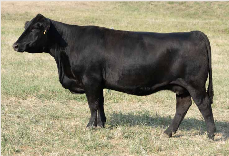
CLRS HEADDRESS 0107H || SELLS AS LOT 16.

Bred to HA AMPLITUDE 9J (3875162). Estimated calving date 3/1/2025.