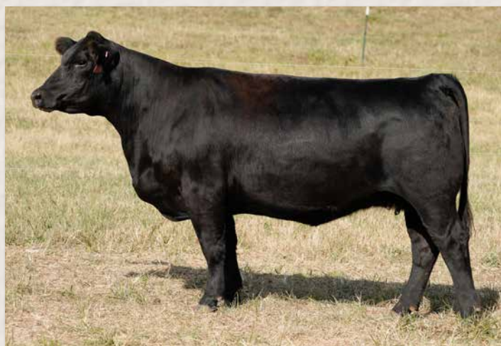
CLRS KAPRI 2111K || SELLS AS LOT 56.