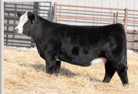
HOOK'S DESI 80D || SELLS AS LOT 104.