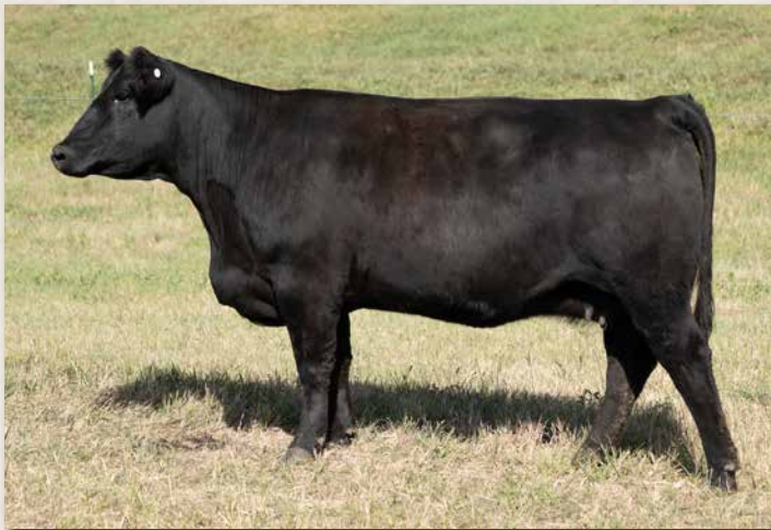
CLRS KABANA 256K || SELLS AS LOT 57.