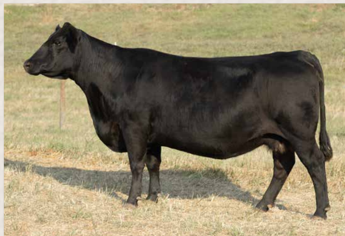
CLRS HALLELUJAH 038H || SELLS AS LOT 41.

Homozygous Black Homozygous Polled 1/2 SM 1/2 AN Cow ASA #3709085 CLRS 038H BD: 2/2/2020