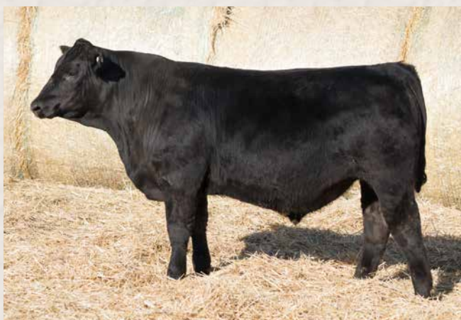
CLRS 937K || SON OF LOT 2.