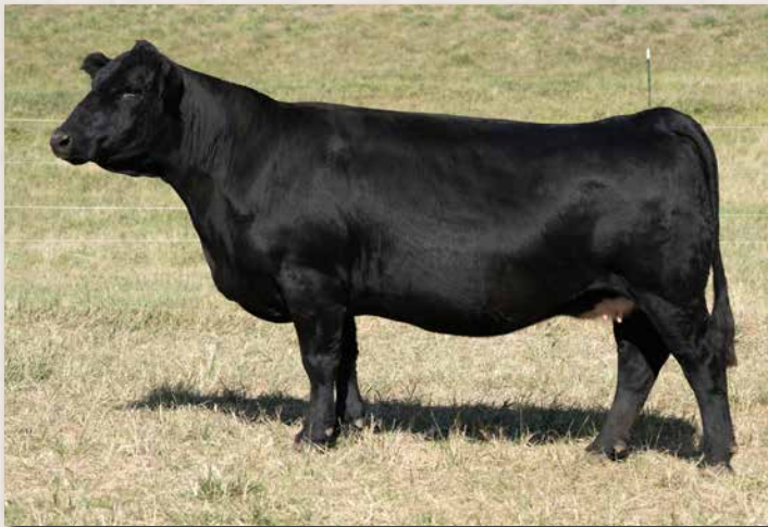
HOOK'S FORETELL 33F || SELLS AS LOT 89.