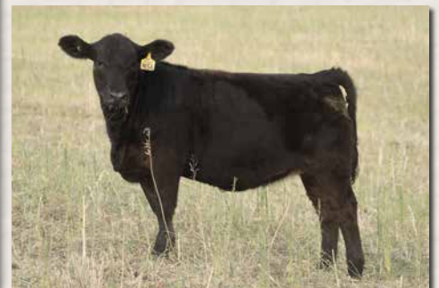
CLRS 456M || DAUGHTER OF LOT 53.