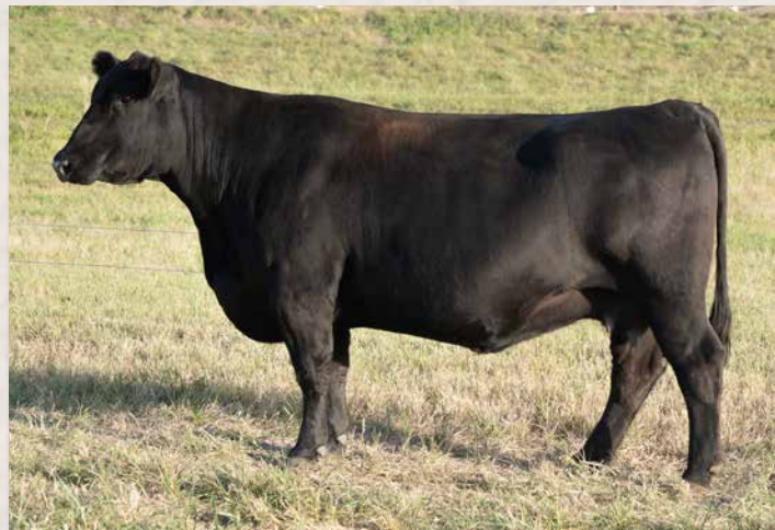
CLRS HEROINE 0121H || SELLS AS LOT 34.