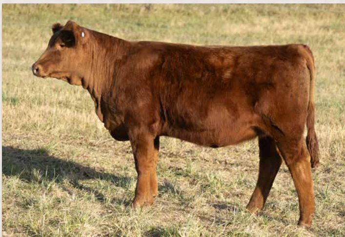
CLRS MELANIE 4101M || SELLS AS LOT 75.