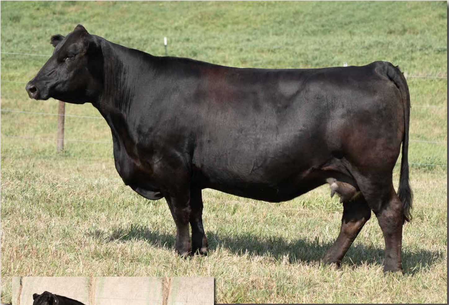
CLRS GOODWILL 978G || SELLS AS LOT 1.