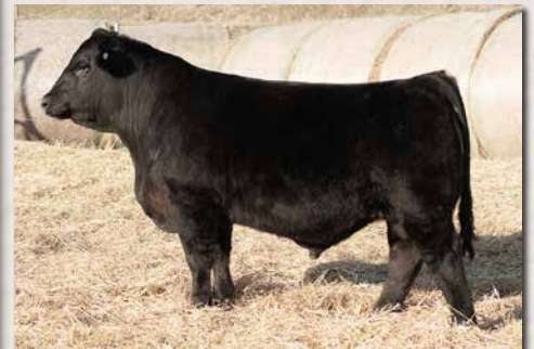
CLRS 818L || SON OF LOT 85.