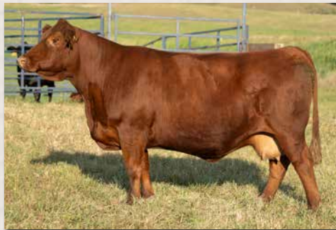
CLRS 733E || DAUGHTER OF LOT 72.