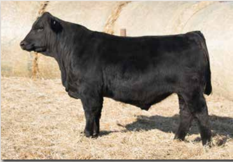
CLRS 7369K || SON OF LOT 101.