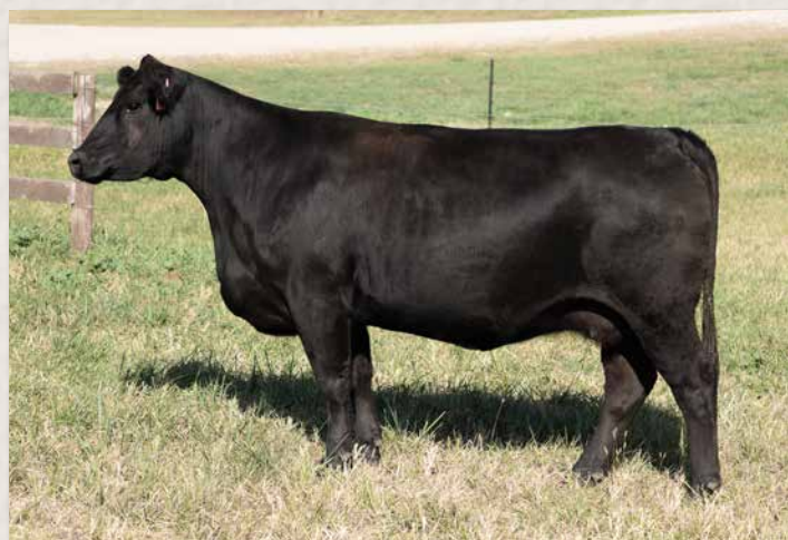
CLRS JUNE 1111J || SELLS AS LOT 51.

Homozygous Black Homozygous Polled 5/8 SM 3/8 AN Cow ASA #3874493 CLRS1111J BD: 2/23/2021