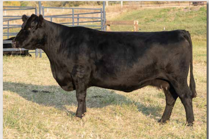
K M J MS SFORCE E317 || SELLS AS LOT 97.