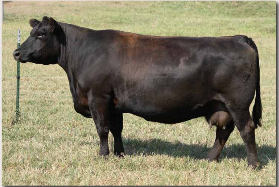
CLRS BONNIA 405 B || SELLS AS LOT 108.