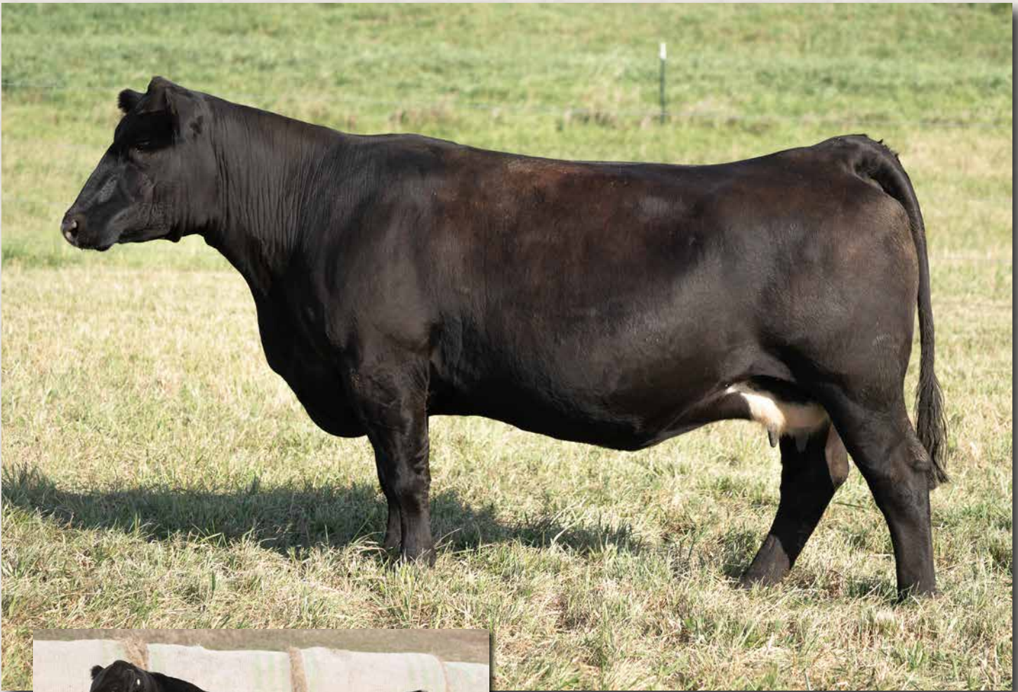
CLRS HEBREW 096H || SELLS AS LOT 20.