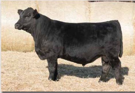
CLRS 832K || SON OF LOT 87.