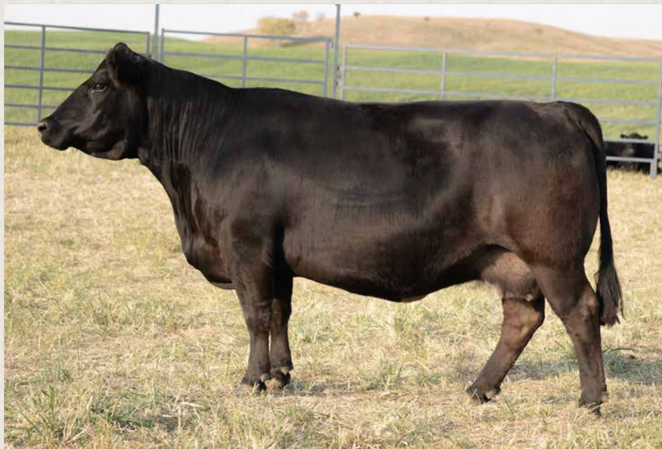
CLRS 6029H || SON OF LOT 103.