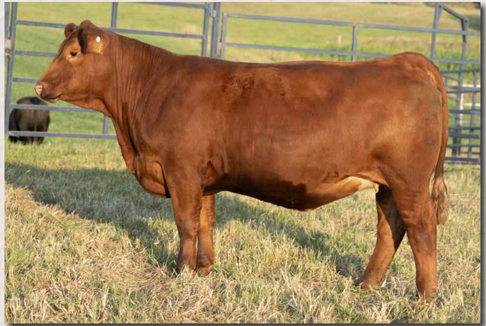
CLRS LADY LUCK 3158L || SELLS AS LOT 60.