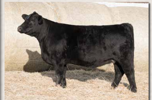
CLRS 121J || DAUGHTER OF LOT 11.