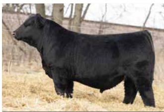
5 Star Jackson

Black hided, ranch raised females who were AI bred and then cleaned up with Lucas Cattle Company Bulls. Females will be sorted into groups of like kind and estimated calving dates. AI bred females will begin calving 1/24 and the natural service females will calf from 2/4 to 4/2. Look for more information on this great set of females closer to the sale.