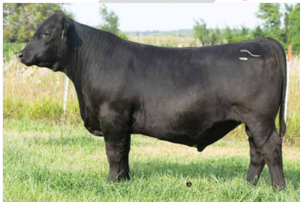
IR ORIGINAL H341 Sire of Lots 25-29.