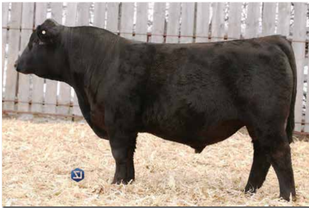
KBHR GLOBAL J138 Sire of Lots 63, 64.

LOT 64 LUCAS LAUCH CODE 302L Homo Black || Homo Polled 3/4 SM 7/32 AN 1/32 MX 9/10/2023 302L ASA# 4297960