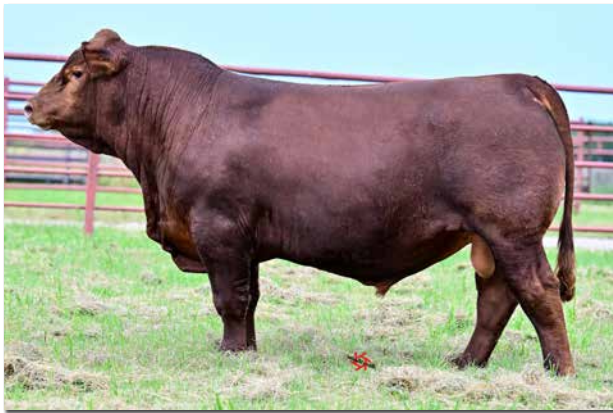
LUCAS LUCCHESI 703L Sells as Lot 108.