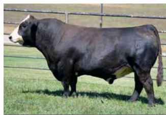
TJ Stone Cold