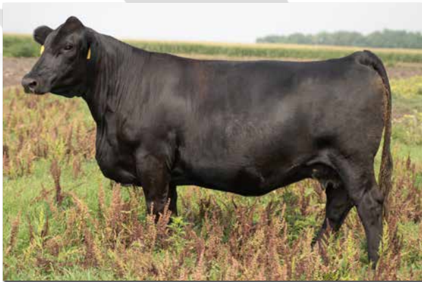
HOOK'S EVITA 18E Dam of Lot 72.