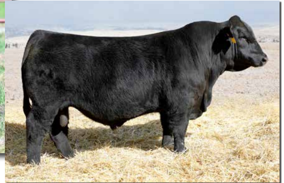
KBHR HONOR H060 Sire of Lots 3, 4.

The Honor by the 505B Angus donor flush resulted in a pair of SimAngus bulls who are destined to increase the genetic horsepower of your cowherd. Genetically the bulls check all the boxes excelling at a magnitude of different traits across the board. No matter if you are looking to increase terminal traits or add maternal to your herd the Honor sons will answer the call.