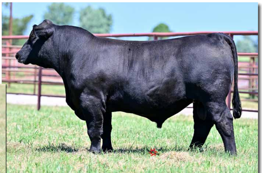
LUCAS LOOKOUT 706L Sells as Lot 4.