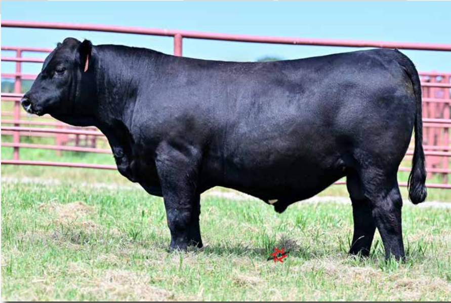
LUCAS LOCOMOTION 713L Sells as Lot 8.