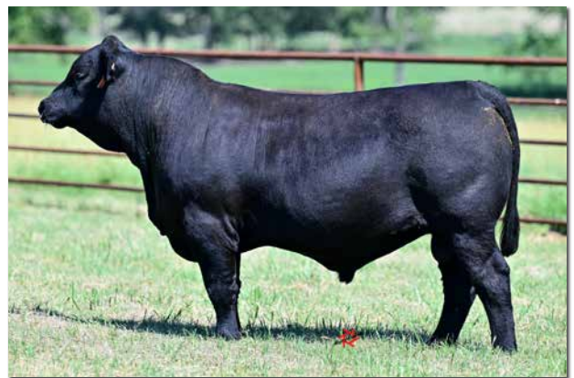
LUCAS LOYALTY 18L Sells as Lot 79.