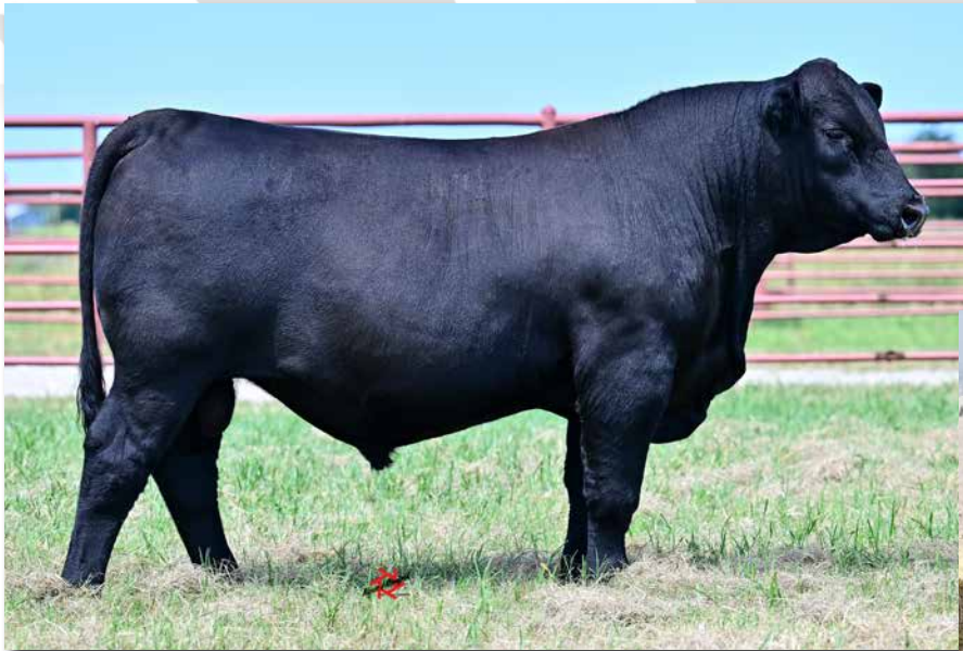
LUCAS LEAN ON ME 716L Sells as Lot 3.

The Honor by the 505B Angus donor flush resulted in a pair of SimAngus bulls who are destined to increase the genetic horsepower of your cowherd. Genetically the bulls check all the boxes excelling at a magnitude of different traits across the board. No matter if you are looking to increase terminal traits or add maternal to your herd the Honor sons will answer the call.