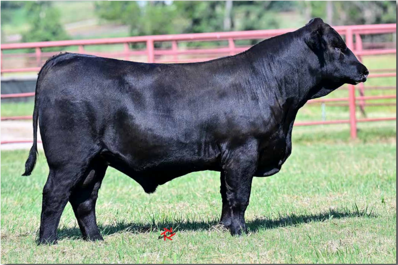
LUCAS LOW-KEYED 364L Sells as Lot 57.