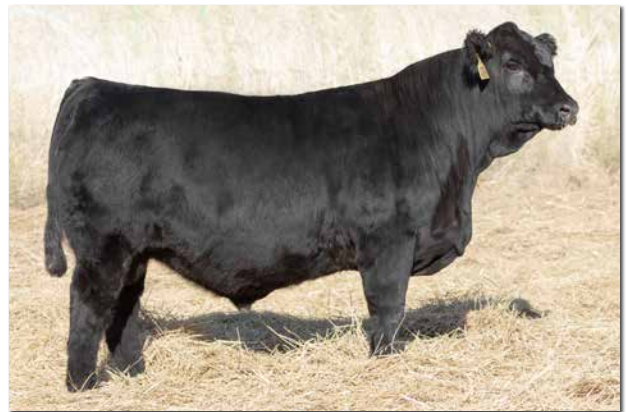
CLRS HERO 8086H Sire of Lot 57.

The lone CLRS Hero son in the sale is backed by the 41Z donor who is the dam of Hook's Beacon. 364L offers impeccable phenotype and a balanced genetic profile across the board. We view this bull as a wonderful female maker based on his type and genetic profile. If retaining females is at the top of your list this bull would be a great candidate.