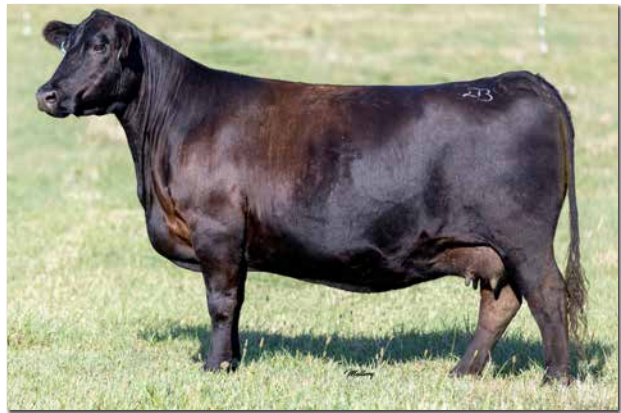
BROWN MS QUANAH 505B Dam of Lot 37.