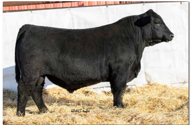
GW JAILBREAK Maternal brother to Lot 60.