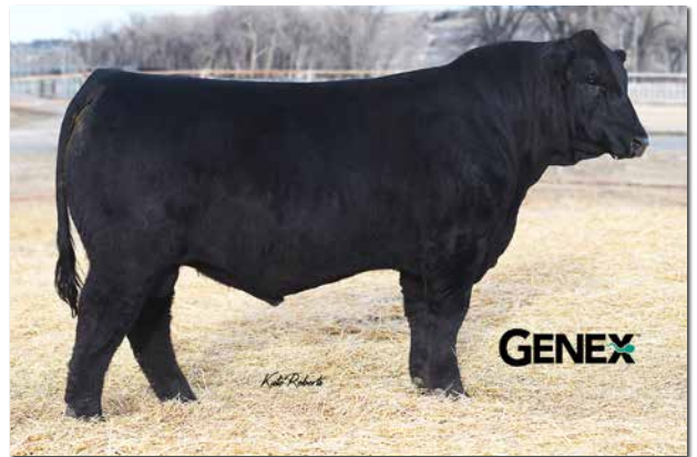
LBR GENESIS G69 Sire of Lots 1, 2.