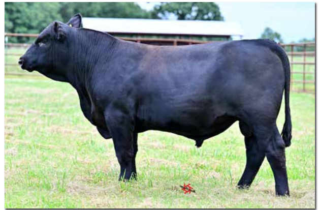
LUCAS LISTEN UP 223L Sells as Lot 78.