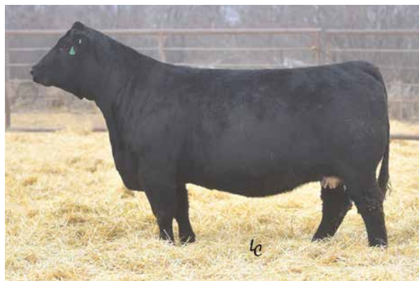
WS MISS SUGAR C4