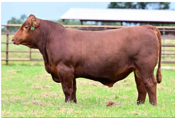
LUCAS LUMBERJACK 715L Sells as Lot 110.