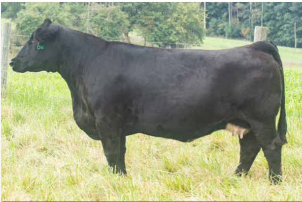
HOOK'S FANTASIA 94F Dam of Lots 54-56.