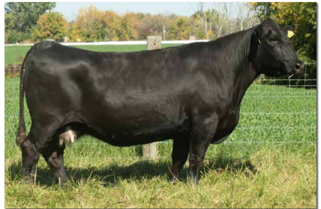
HOOKS ZAFIRAH 41Z Dam of Lot 57.