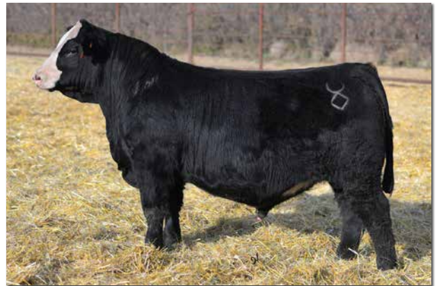
LCDR RESERVE 210J Sire of Lots 54-56.