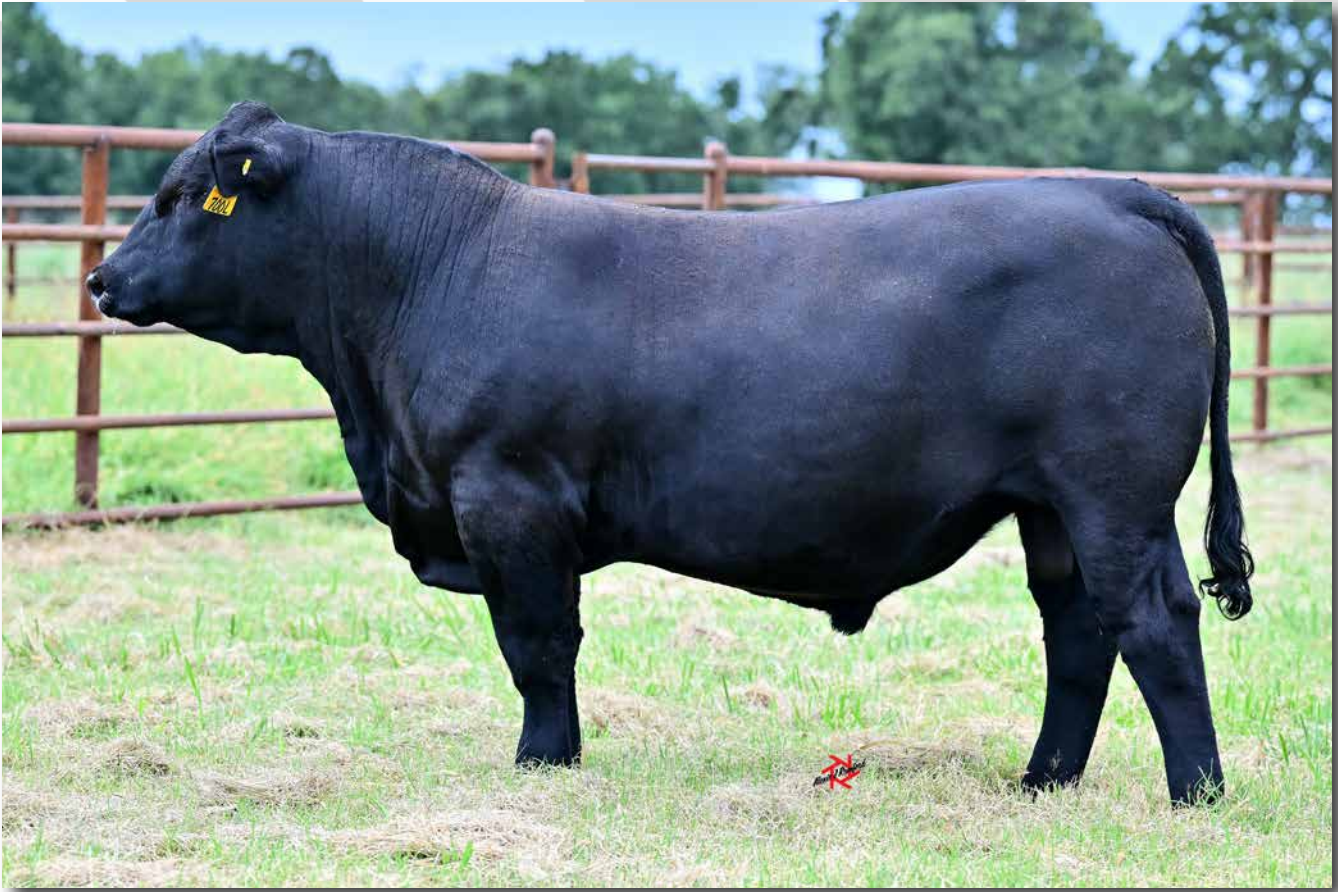
LUCAS LIMITLESS 700L Sells as Lot 54.