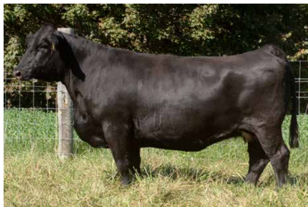
HOOK'S EVITA 18E