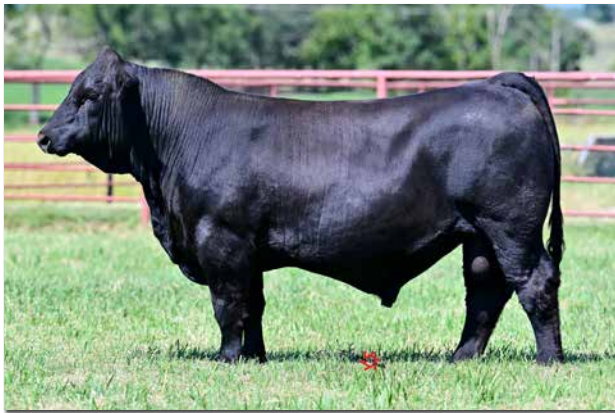
LUCAS LEVELLER 29L Sells as Lot 74.