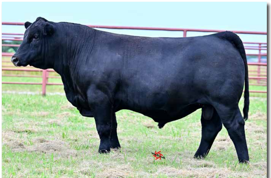
LUCAS LAW DAWG 718L Sells as Lot 9.