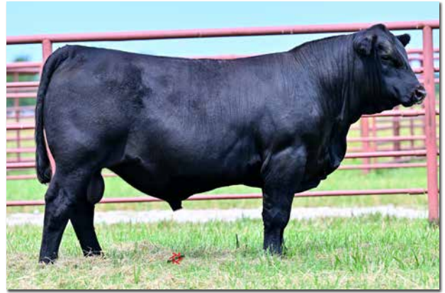
LUCAS LOOSEN UP 218L Sells as Lot 19.