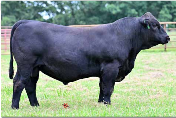
LUCAS LIV'N IT UP 5L Sells as Lot 14.