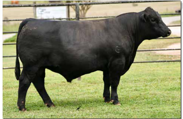
GIBBS 9114G ESSENTIAL Sire of Lot 58.