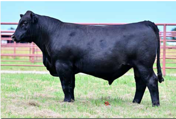
LUCAS LONGSHOT 244L Sells as Lot 25.