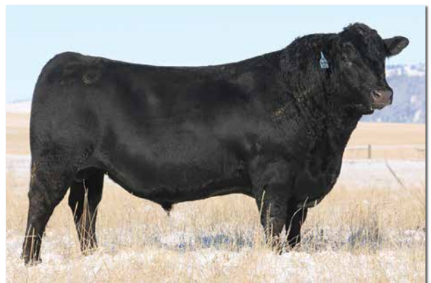
GW BREAKTHRU Maternal brother to Lot 61.