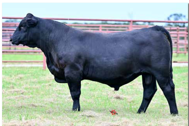
LUCAS LOGIC BOMB 231L Sells as Lot 39.