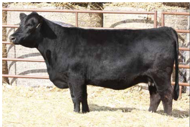
ADV MS GENESIS J1017