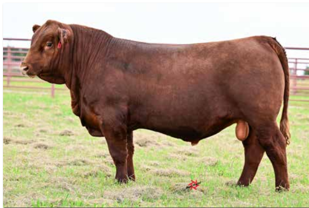
LUCAS LOWDOWN 705L Sells as Lot 105.