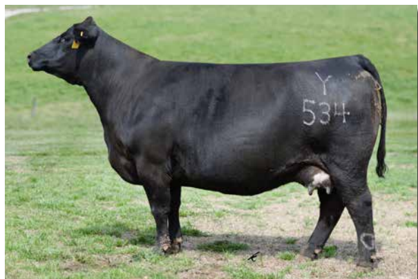
SSF BLK LOUISE Y534

Look for progeny out of these impressive donors.