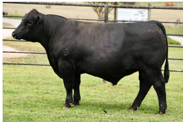
GIBBS 9114G ESSENTIAL Sire of Lots 5, 6.