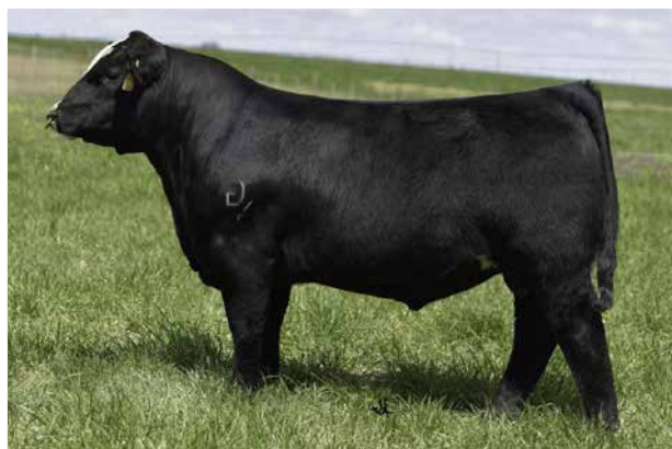
SFG COWBOY LOGIC D627 Sire of Lots 68, 69.