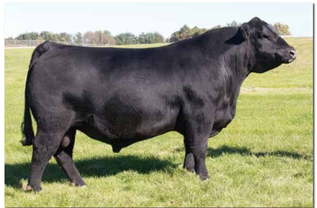
B A R DYNAMIC Sire of Lots 20, 21.