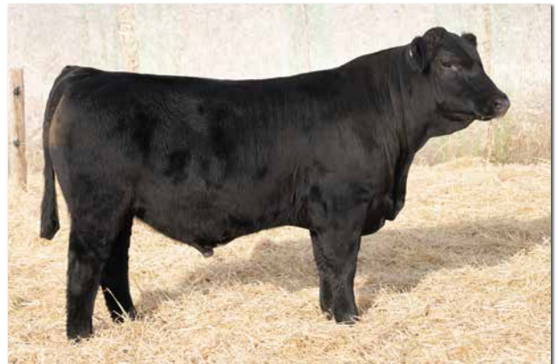
HA JUSTICE 30J Sire of Lot 59.