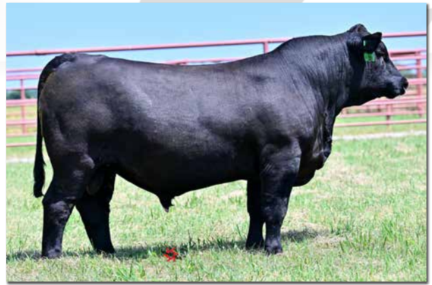
LUCAS LANCELOT 1L Sells as Lot 10.