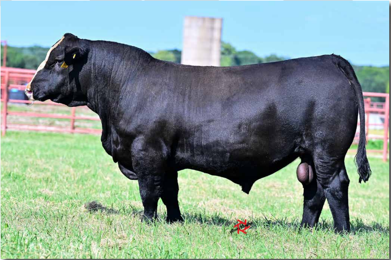
LUCAS LOBBYIST 721L Sells as Lot 55.