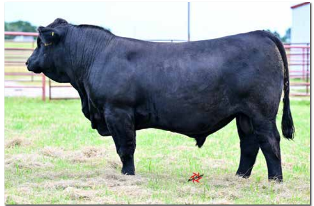
LUCAS LEROUX 228L Sells as Lot 77.