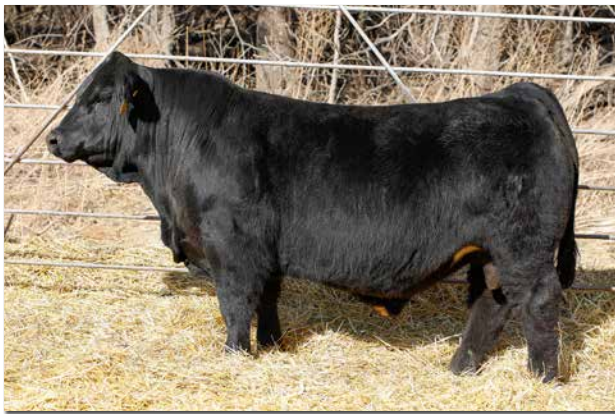
KBHR HANDYMAN H124 Sire of Lots 73-76.