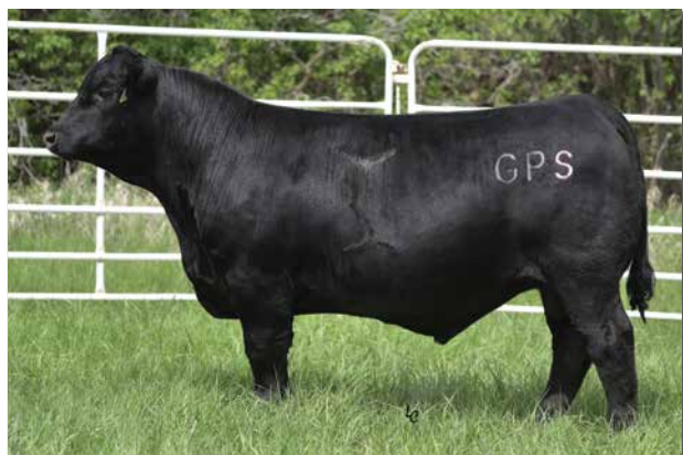
BRIDLE BIT GPS H078 Sire of Lots 83-86.

LOT 84 LUCAS LAKESIDE 44L Homo Black || Polled PB SM 9/3/2023 44L ASA# 4297797