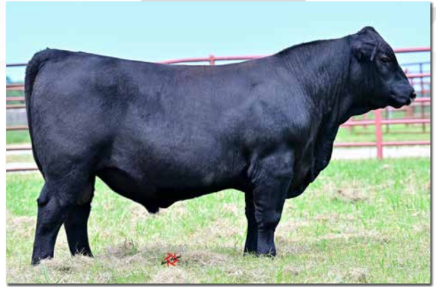
LUCAS LIBATION 210L Sells as Lot 18.