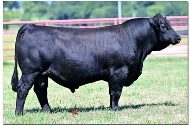
LUCAS LIGHT BAR 28L Sells as Lot 11.