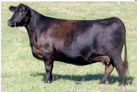
BROWN MS QUANAH 505B Dam of Lots 3, 4.