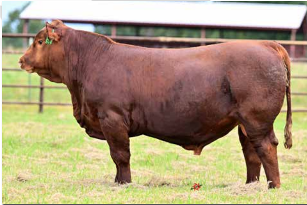
LUCAS LONGBED 723L Sells as Lot 107.