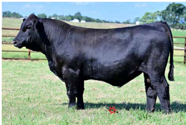
LUCAS LOW CASH 252L Sells as Lot 104.