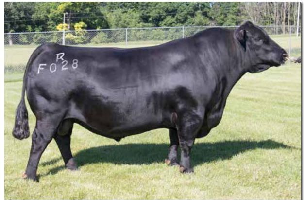
TEHAMA PATRIARCH F028 Sire of Lots 10-14.