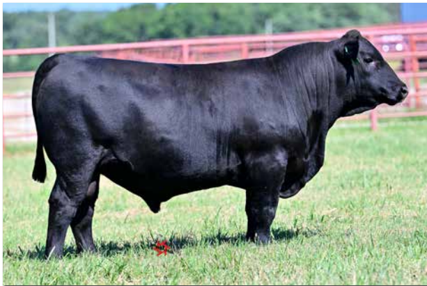
LUCAS LOMBARDI 230L Sells as Lot 16.