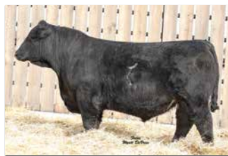
Bridle Bit Resource