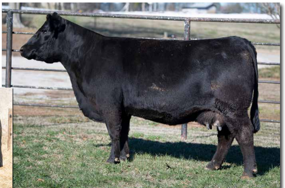
JC MS MAYHAYLEY 109J Dam of Lots 7-9.