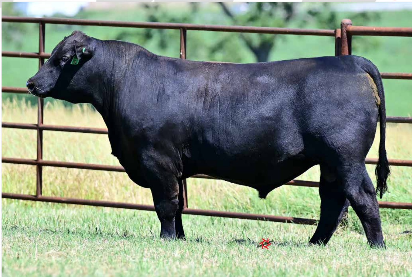
LUCAS LUNCHBOX 711L Sells as Lot 5.