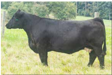
HOOK'S FANTASIA 94F