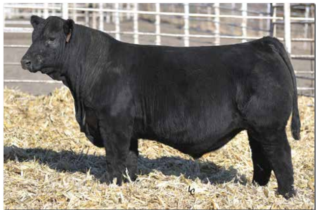
TJ BLACK ICE 451H Sire of Lot 38.