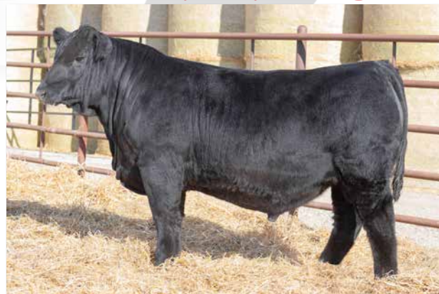
HOOK'S FULL FIGURES 11F Sire of Lot 87.