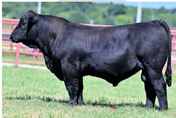
LUCAS LOADMASTER 334L Sells as Lot 67.