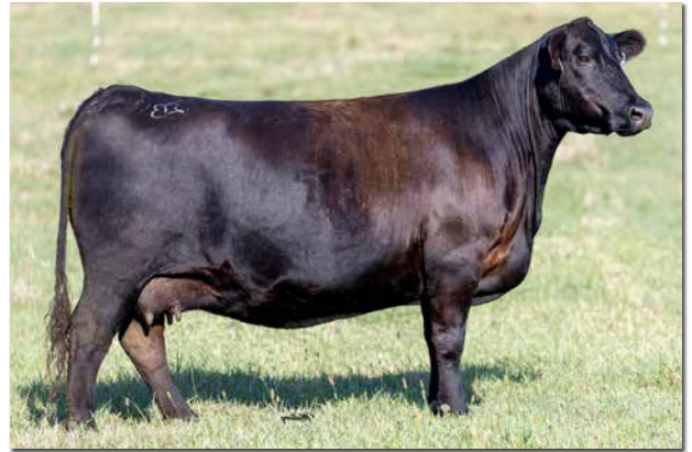
BROWN MS QUANAH 505B Dam of Lots 1, 2.