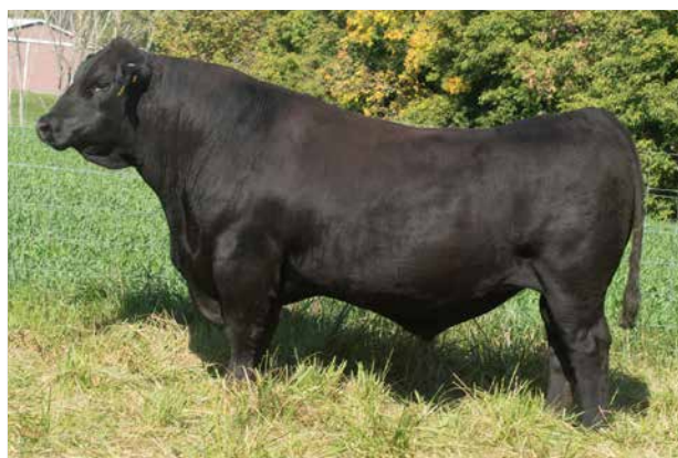
JC HURON 7262G Sire of Lots 66, 70, 71.