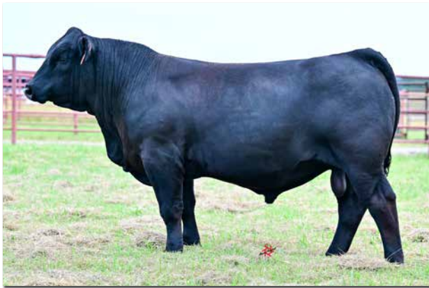
LUCAS LUSTRIUS 258L Sells as Lot 73.