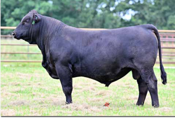
LUCAS LIQUIDATION 245L Sells as Lot 22.