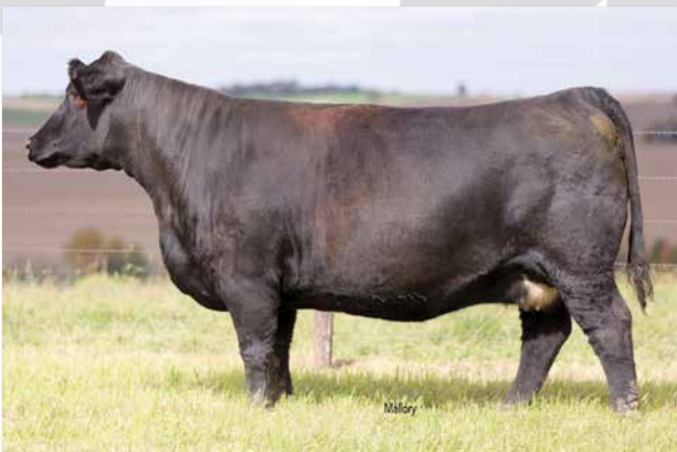
TJ MISS 29B Dam of Lot 41.