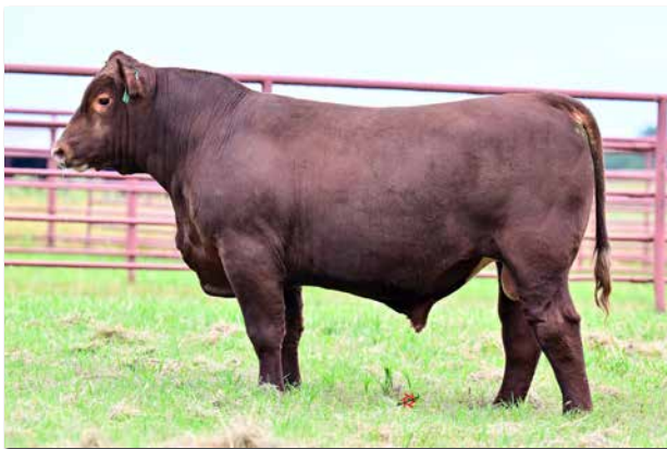
LUCAS LOW GEAR 712L Sells as Lot 109.