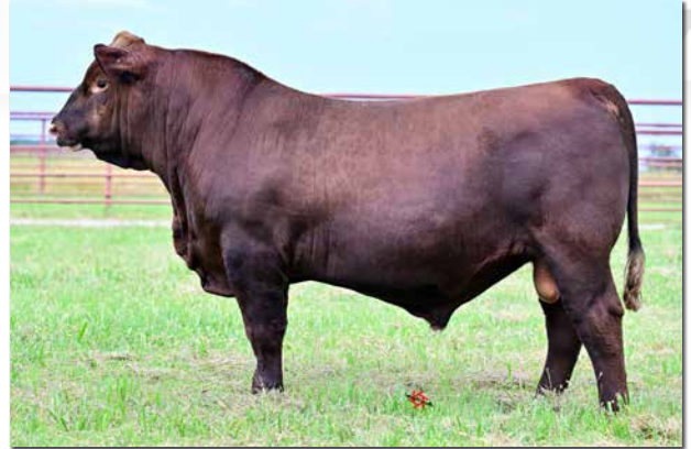
LUCAS LASER BEAM 724L Sells as Lot 111.