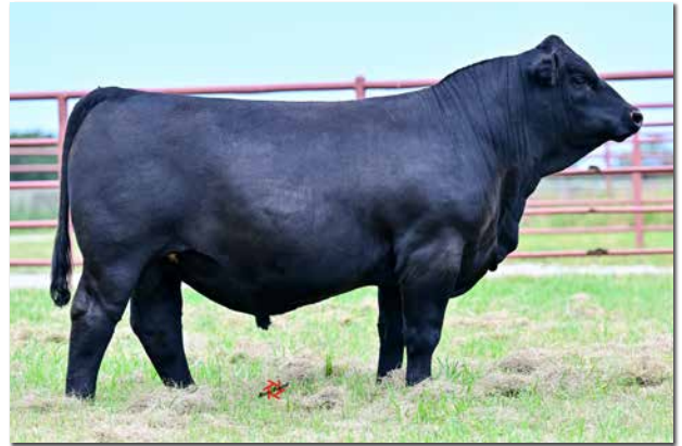
LUCAS LAUDABLE 03L Sells as Lot 20.