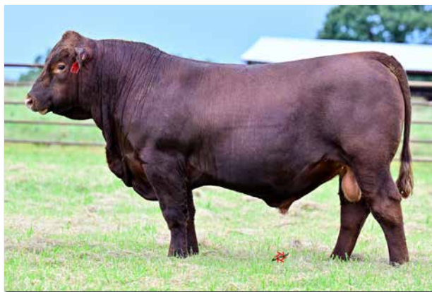
LUCAS LOUDER 707L Sells as Lot 106.