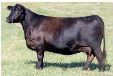
BROWN MS QUANAH 505B

Be on the lookout for important and impactful changes to the genetic program at Lucas Cattle Company! No, the basics won't change. Sustainable genetics based on regional, fescue resources and a commitment to making cattle easier to raise and profit from will always be the charge at Lucas Cattle, but new commitments to genetic and reproductive technologies are in place for the future.