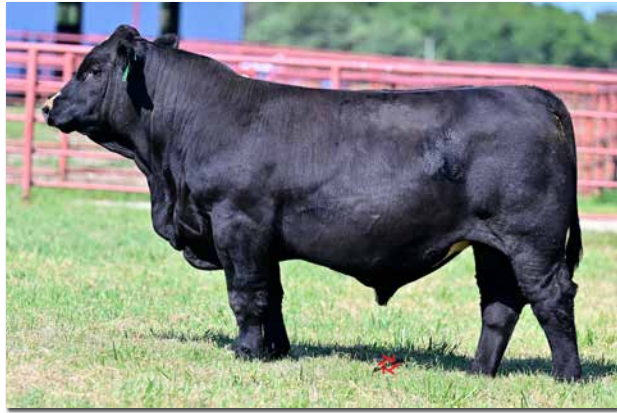
LUCAS NO LETDOWN 65L Sells as Lot 49.