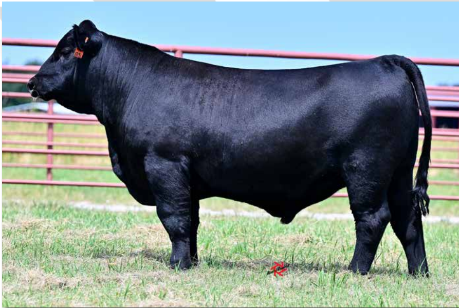
LUCAS LAWSUIT 1719L Sells as Lot 7.

We were excited to get some embryos purchased from the Mayhaley donor. She is surfacing as one of the best SimAngus donors across the country. The trio of Justice sons in the 2024 fall sale surfaces to the top from a genetic standpoint. The brothers offer a potent genetic profile and are the highest bulls for API in the sale. Physically they offer a no hole phenotype package and will without a doubt improve docility.