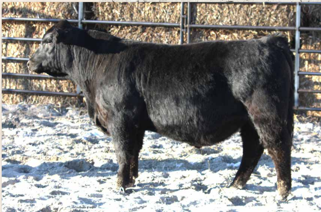
LYMANS EAGLE L80 Sells as Lot 4.

LOT 3 LYMANS WESTERN BRUTE ♂GGP 1/2 SM 1/2 AN L58 ASA# 4304226 BLACK, POLLED 1/7/2023