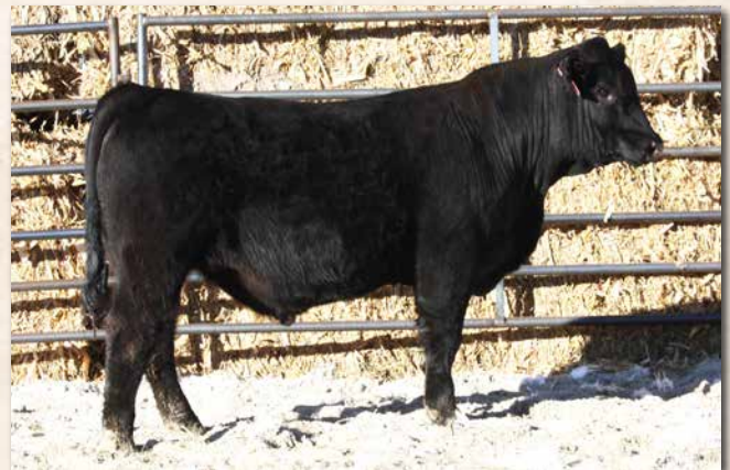
LYMANS EAGLE L256 Sells as Lot 22.