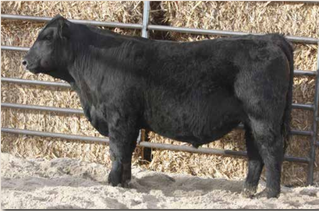
LYMANS JENKINS L209 Sells as Lot 70.