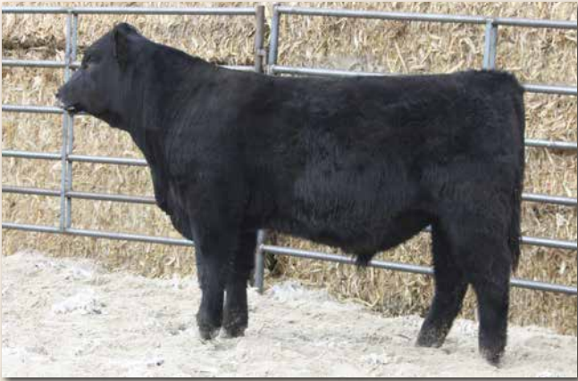
LYMANS BLACKHAWK L246 Sells as Lot 42.