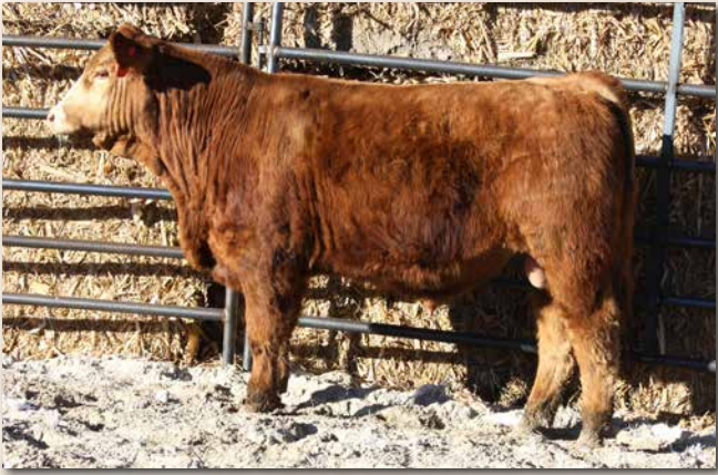
LYMANS BLUEPRINT L236 Sells as Lot 99.