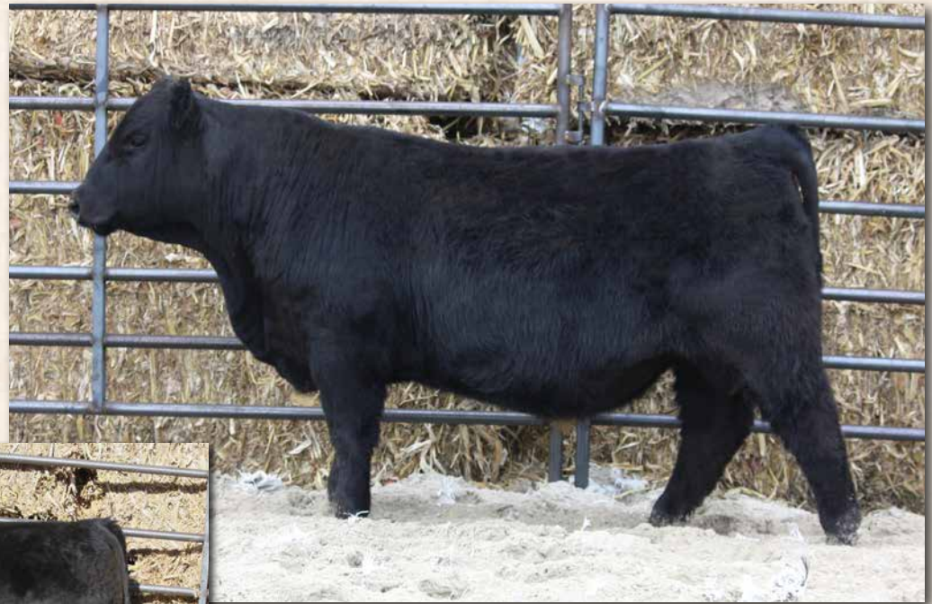
LYMANS EAGLE L226 Sells as Lot 5.