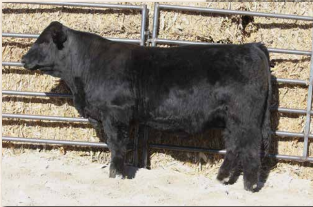
LYMANS GALILEO L45 Sells as Lot 6.

LOT 5 LYMANS EAGLE L226 ♂GGP 3/8 SM 3/8 AN 1/4 VV L226 ASA# 4304302 BLACK, POLLED 1/31/2023 BW 81 WW 704 PAP 31