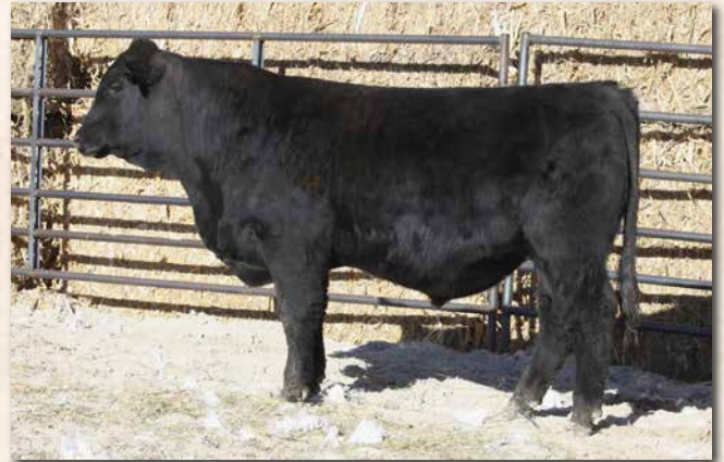
LYMANS GREAT WESTERN L34 Sells as Lot 46.

LOT 47 LYMANS GREAT WESTERN L30 ♂GGP 5/8 SM 3/8 AN L30 ASA# 4304199 BLACK, POLLED 1/4/2023