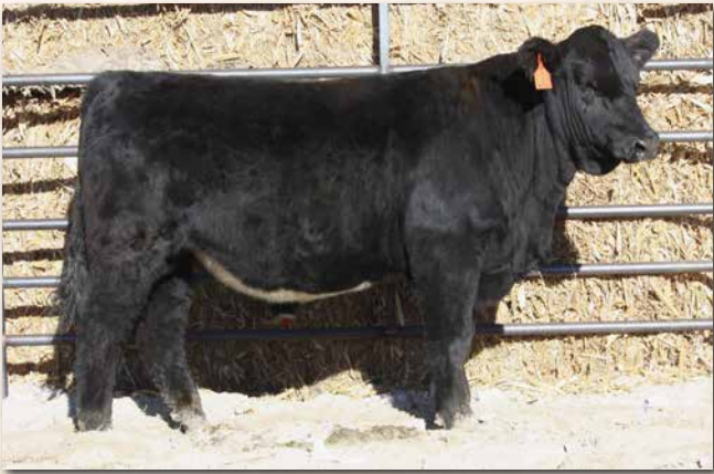
LYMANS GALILEO L23 Sells as Lot 67.

LOT 67 LYMANS GALILEO L23 ♂GGP PB SM L23 ASA# 4304191 BLACK, POLLED 1/4/2023 BW 85 WW 655 PAP 32