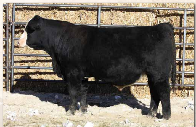
LYMANS OUTLAW L66 Sells as Lot 24.