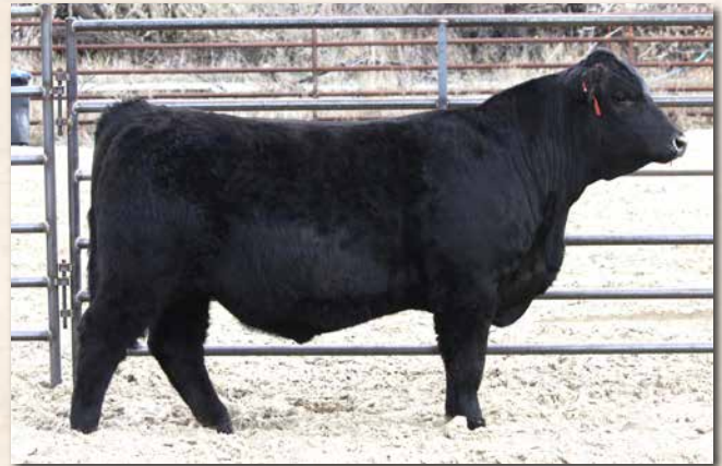
LYMANS TRIPLE CROWN L102 Sells as Lot 15.