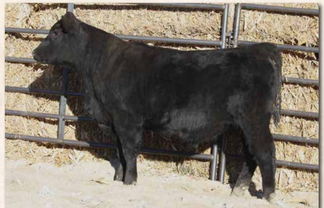
LYMANS GUS L227 Sells as Lot 108.