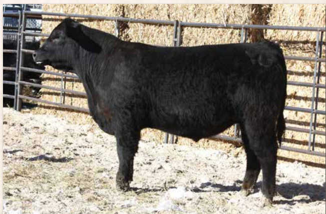
LYMANS ZINSER L252 Sells as Lot 93.