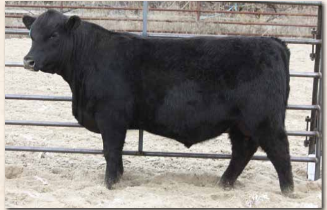
LYMANS ACCOMPLISHMENT L90 Sells as Lot 107.