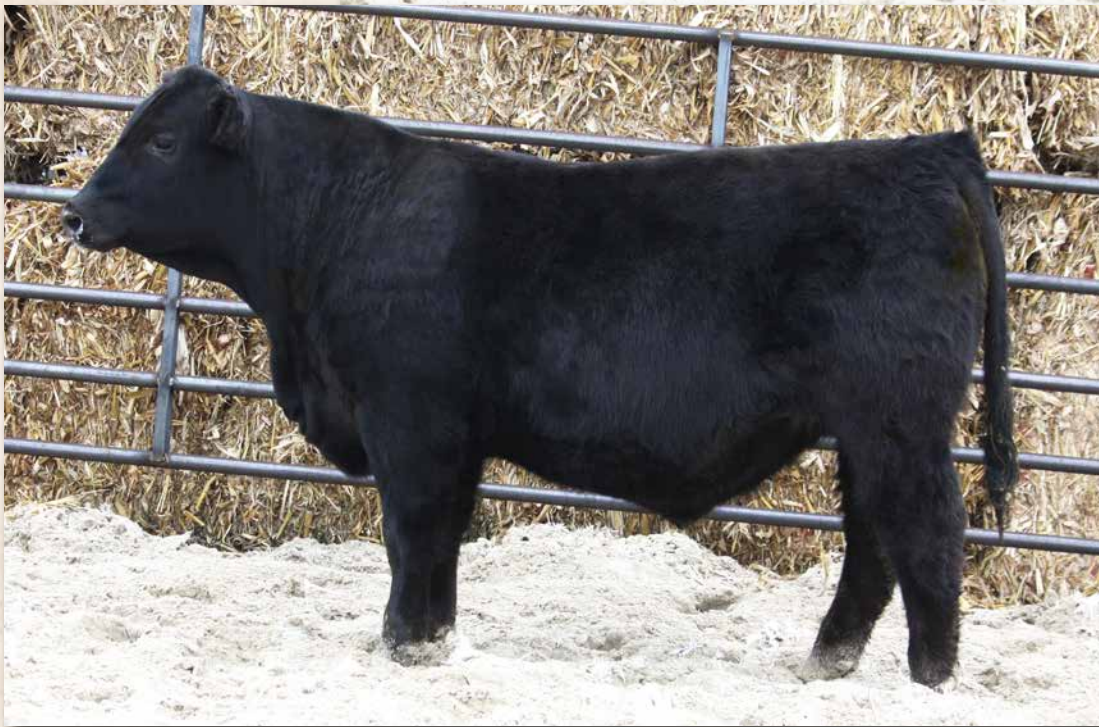
LYMANS GALILEO L19 Sells as Lot 2.

LOT 1 LYMANS GALILEO L42 ♂GGP 5/8 SM 3/8 AN L42 ASA# 4304211 BLACK, POLLED 1/5/2023