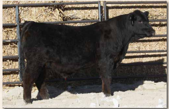
LYMANS COWBOY CUT L206 ET Sells as Lot 65.