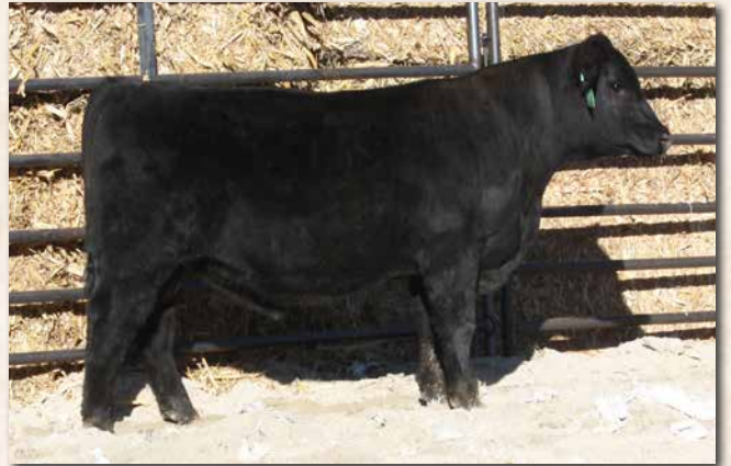
LYMANS FINAL ANSWER L268 Sells as Lot 92.