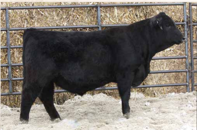
LYMANS BLACK HAWK L117 Sells as Lot 45.