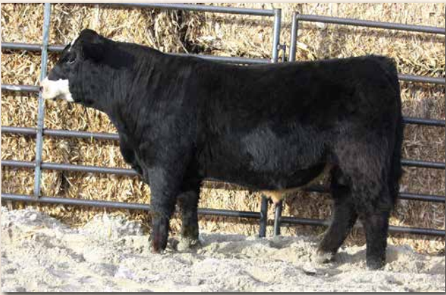
LYMANS GREAT WESTERN L35 Sells as Lot 13.