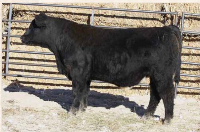
LYMANS AM PROUD L65 Sells as Lot 18.