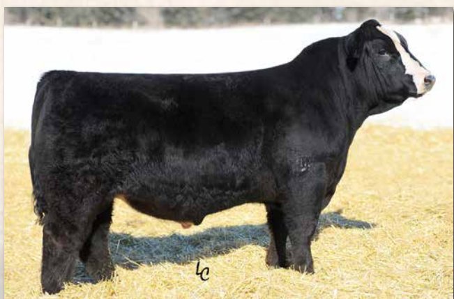
HPF OPTIMIZER A512 Sire of Lot 95.