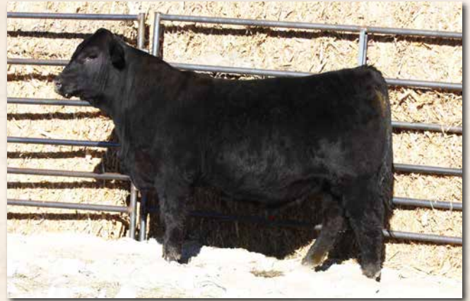
LYMANS UNITED L218 Sells as Lot 28.