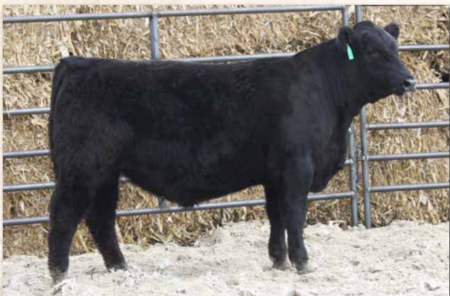
LYMAN'S BLACK HAWK L254 Sells as Lot 87.

LOT 84 LYMAN'S COWBOY CUT L248 ♂GGP PB SM L248 ASA# 4305262 BLACK, HOMO POLLED 2/17/2023 BW 87 WW 676 PAP 30