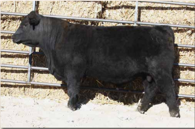
LYMANS JENKINS L110 Sells as Lot 11.