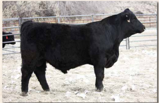
LYMANS TRIPLE CROWN L219 Sells as Lot 21.