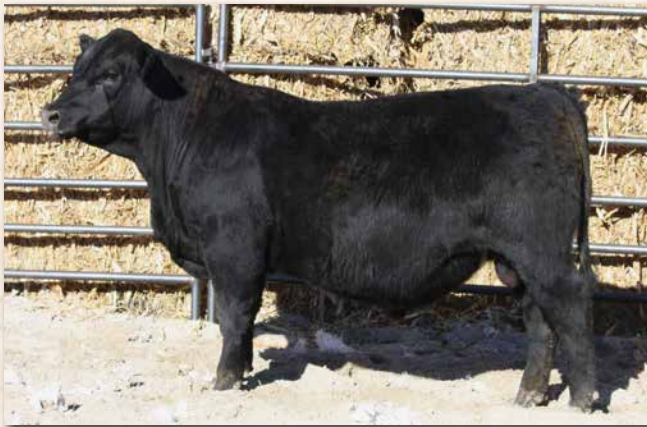
LYMANS ACCOMPLISHMENT L91 Sells as Lot 105.