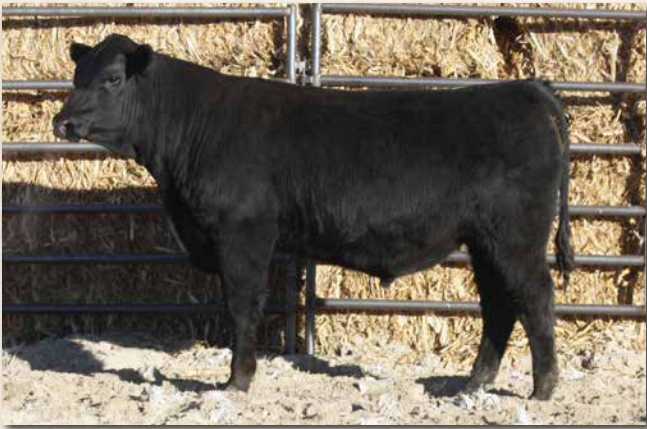
LYMAN'S SPARTAN L264 Sells as Lot 59.