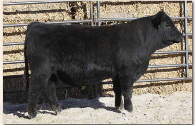
LYMANS EAGLE L27 Sells as Lot 37.