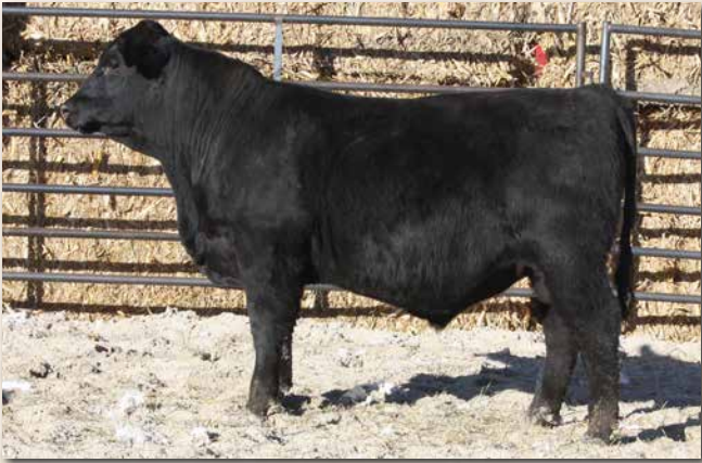
LYMANS ACCOMPLISHMENT L98 Sells as Lot 109.