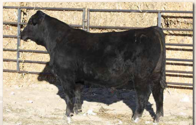
LYMANS CHERRY CREEK L69 Sells as Lot 48.