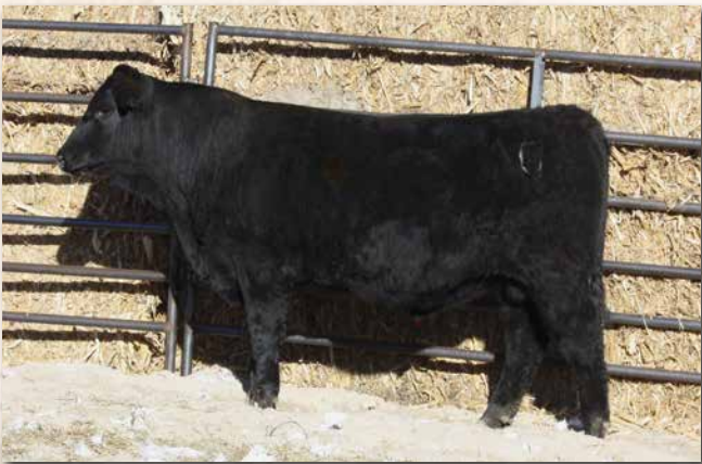
LYMANS AM PROUD L43 Sells as Lot 14.