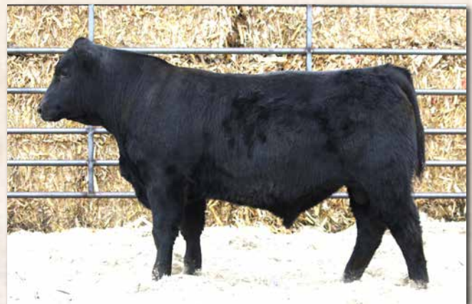
LYMANS CHERRY CREEK L74 Sells as Lot 17.