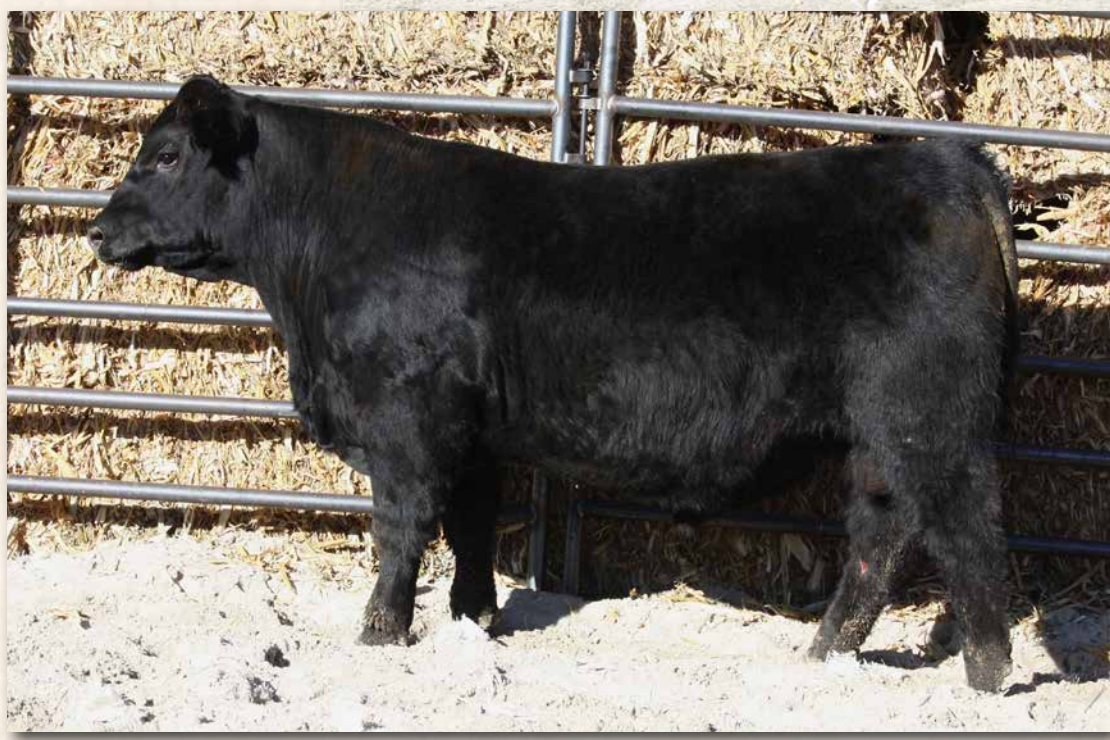
LYMANS ACCOMPLISHMENT L221 Sells as Lot 103.

LOT 102 LYMANS GUS L38 PB AN L38 AAA 20836317 HOMO BLACK, HOMO POLLED 1/5/2023