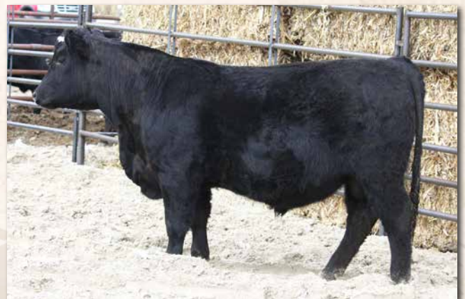
LYMANS BLACKHAWK L224 Sells as Lot 41.