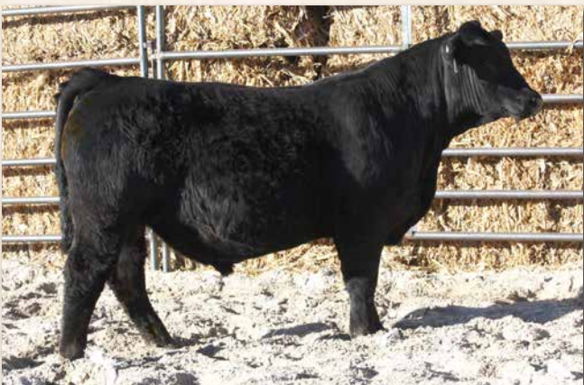
LYMANS HIGHLIFE L230K Sells as Lot 44.