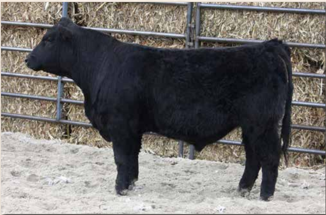
LYMANS REST EASY L32 Sells as Lot 68.

BRIDLE BIT ECLIPSE E744 MR SR HIGHLIFE G1609 HOOK'S GALILEO 210G MISS HIGHLIFE J140 HOOK'S EVITA 18E LADY LY ALL AROUND C119 CE BW WW YW MCE MILK MWW EPD 16.9 1.5 89.6 144.4 10.3 30.8 75.5 RANK 4% 55% 15% 10% 3% 10% 5% STAY DOC CW MARB REA $API $TI EPD 18.5 9.5 35.9 0.69 1.07 181.1 102.3 RANK 20% 75% 25% 2% 15% 2% 2%