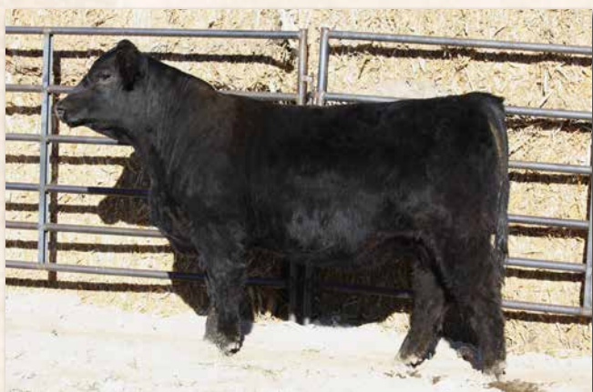
LYMANS OUTLAW L105 Sells as Lot 25.

LOT 25 LYMANS OUTLAW L105 ♂GGP 1/2 SM 1/2 AN L105 ASA# 4304261 BLACK, POLLED 1/31/2023