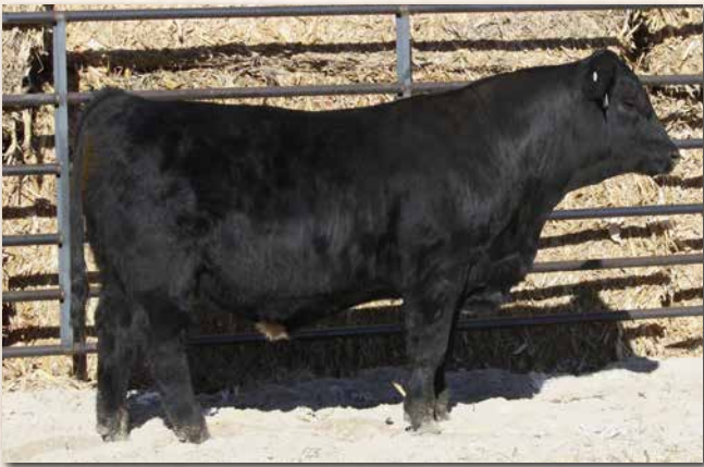
LYMAN'S AM PROUD L253 Sells as Lot 60.