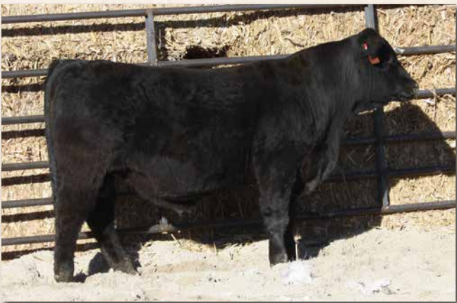
LYMANS TRIPLE CROWN L111 Sells as Lot 50.