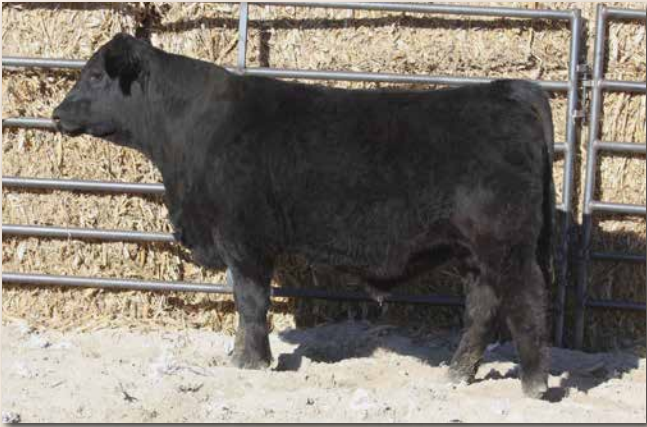
LYMANS UNITED L214 Sells as Lot 33.