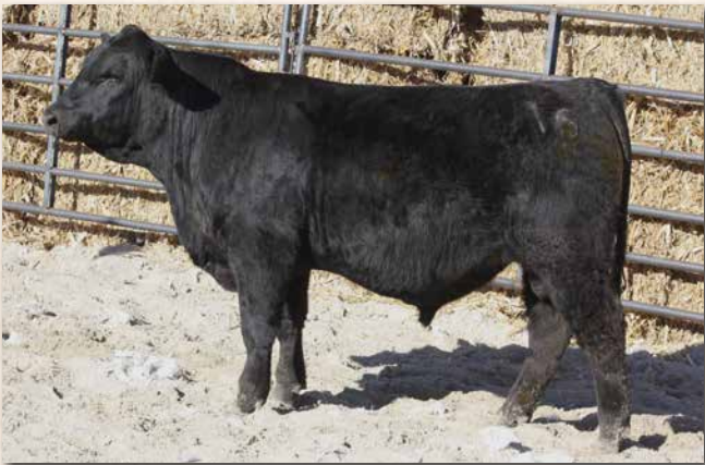
LYMANS JENKINS L242 Sells as Lot 35.