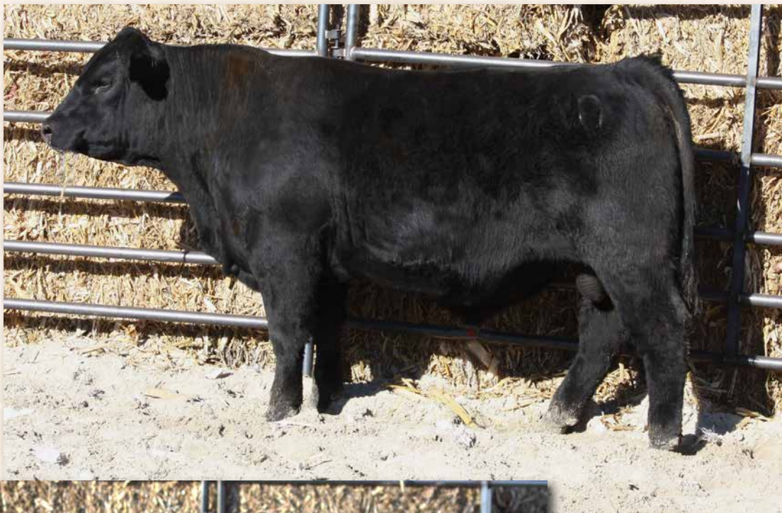
LYMANS WESTERN BRUTE Sells as Lot 3.