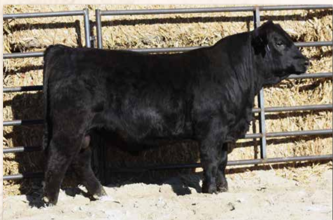
LYMANS NIGHTRIDE L16 Sells as Lot 20.

LOT 18 LYMANS AM PROUD L65 ♂GGP PB SM BLACK, POLLED L65 ASA# 4304232 1/8/2023 BW 87 WW 691 PAP 36