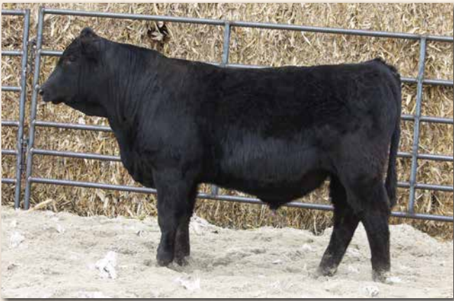
LYMANS HIGHLIFE L240 Sells as Lot 76.