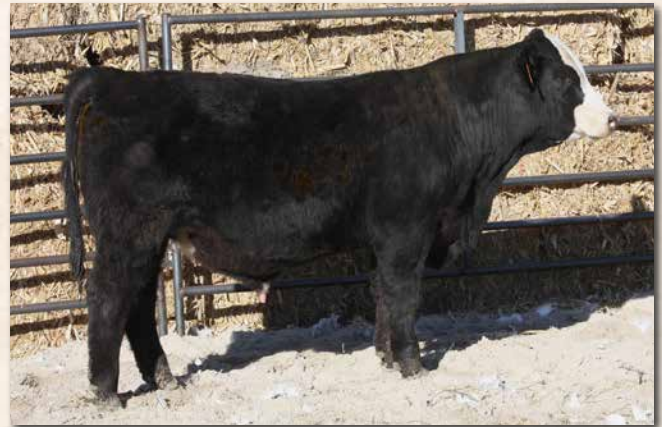
LYMANS BLK POWDER L204 Sells as Lot 16.