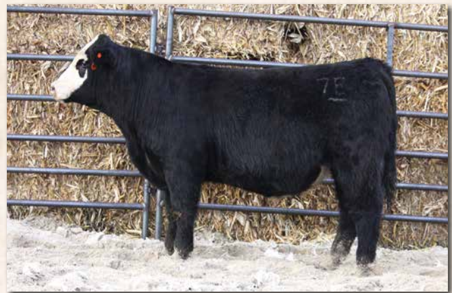
LYMANS BLK POWDER L233K Sells as Lot 97.