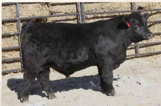
LYMANS CHERRY CREEK L71 Sells as Lot 10.