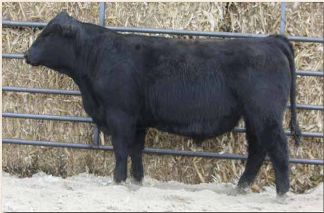
LYMAN'S ZINSER L265 Sells as Lot 85.