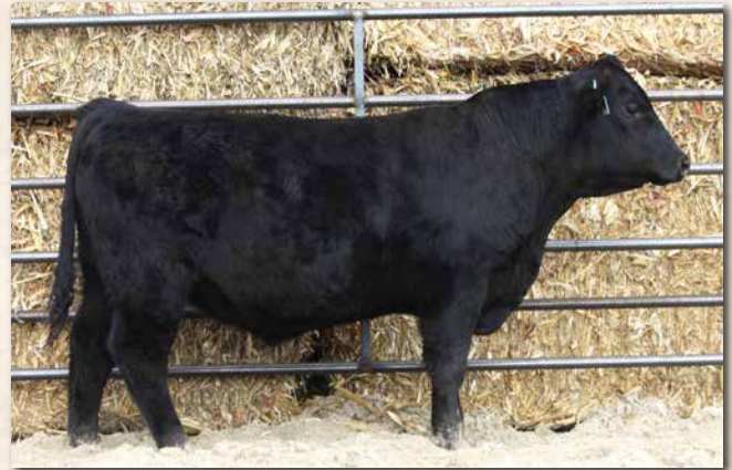
LYMANS ECLIPSE L29 Sells as Lot 78.