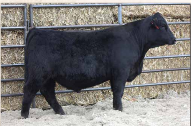
LYMANS TRIPLE CROWN L94 Sells as Lot 51.