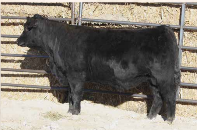
LYMANS ACCOMPLISHMENT L18 Sells as Lot 112.