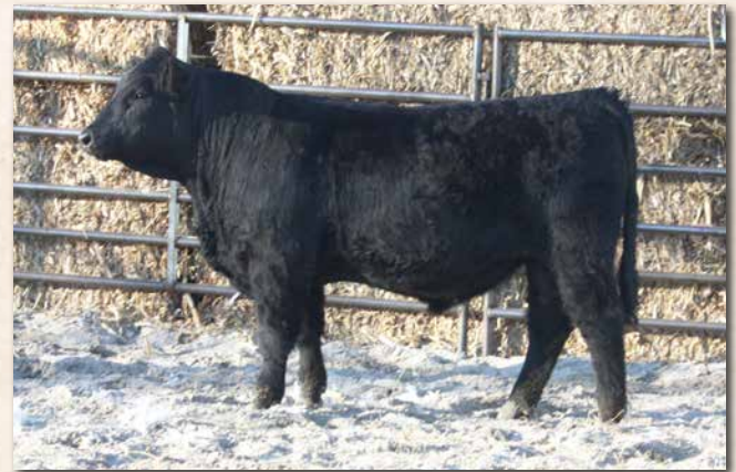
LYMANS PROUD L89 Sells as Lot 54.