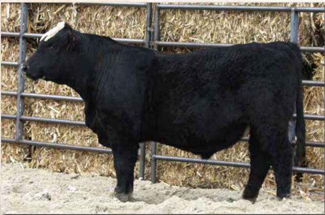
LYMANS BANCHOR L237 Sells as Lot 77.

LOT 74 LYMANS UNITED L24I ♂GGP 3/4 SM 1/4 AN L24I ASA# 4304306 BLACK, POLLED 3/24/2023 BW 79 WW 756 PAP 30