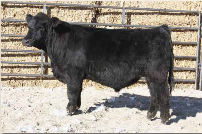
LYMANS EAGLE L28 Sells as Lot 12.