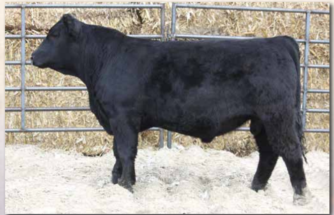
BRIDLE BIT ECLIPSE E744 Sire of Lot 66.