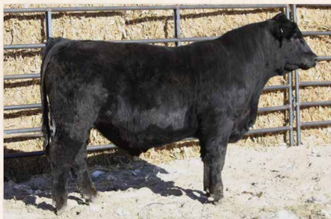
LYMANS UNITED LI27 Sells as Lot 9.