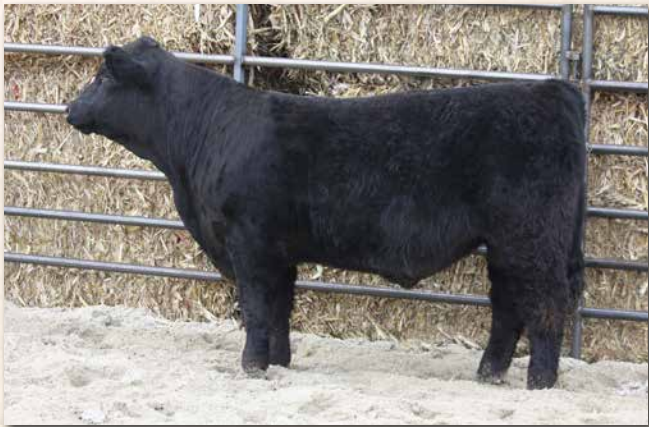
LYMAN'S COWBOY CUT L248 Sells as Lot 84.