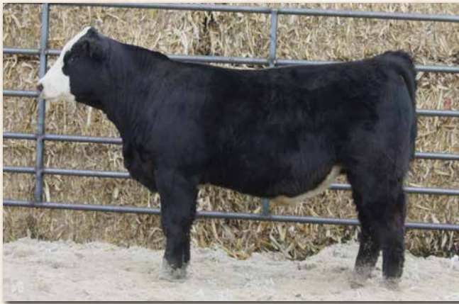
LYMANS OUTLAW L243 Sells as Lot 90.