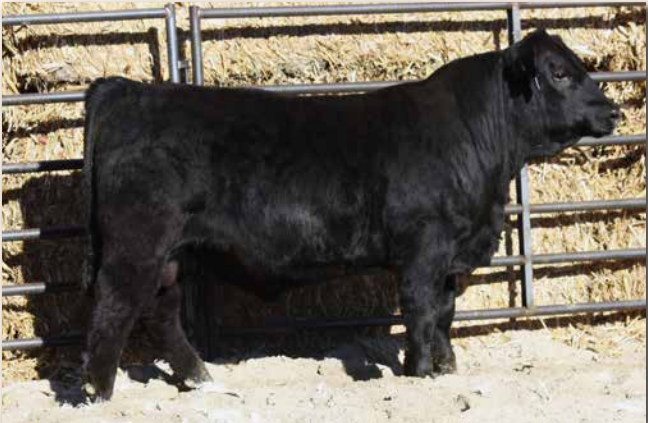
LYMANS REST EASY L16 Sells as Lot 49.