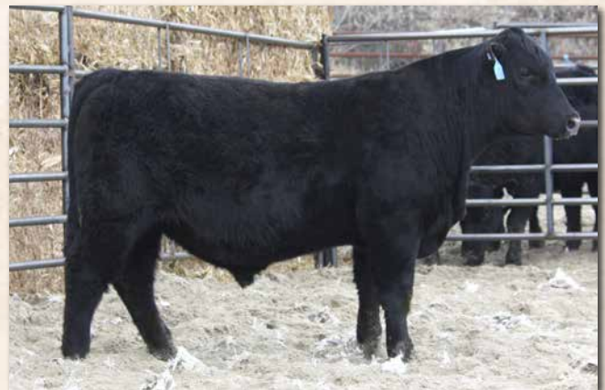
LYMANS CHERRY L106 Sells as Lot 79.