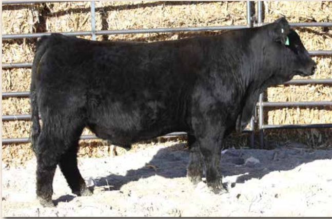
LYMANS ACCOMPLISHMENT L207 Sells as Lot 104.