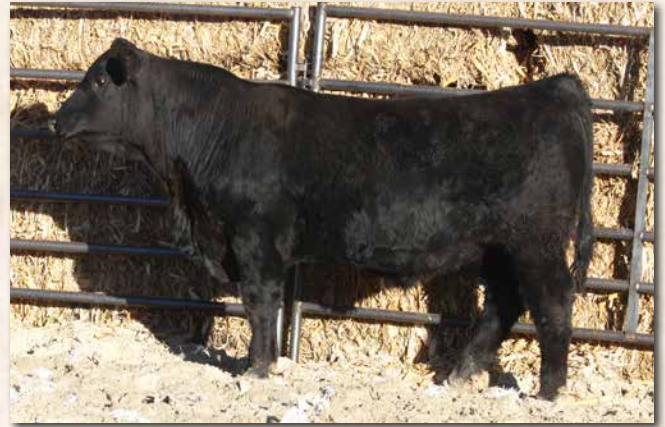
LYMANS REST EASY L21 Sells as Lot 30.