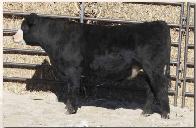
LYMANS RAPID FIRE L235K Sells as Lot 98.