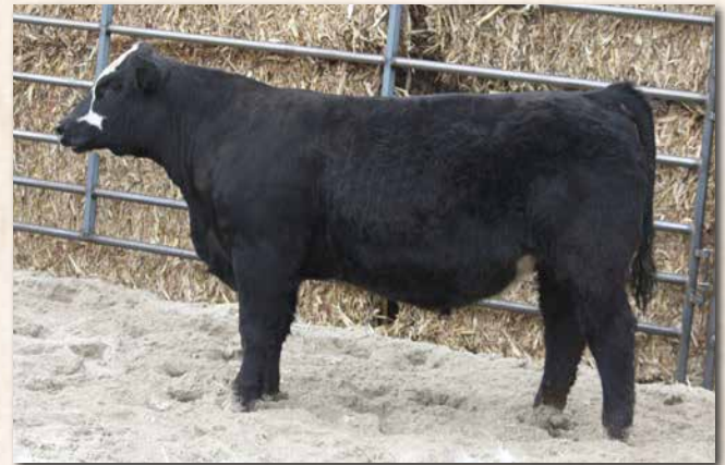
LYMANS OUTLAW L51 Sells as Lot 55.