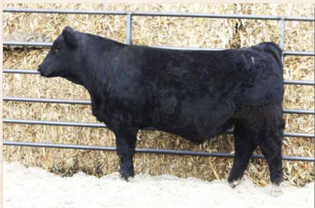
LYMANS AM PROUD L39 Sells as Lot 19.