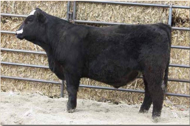
LYMAN'S ZINSER L220 Sells as Lot 58.