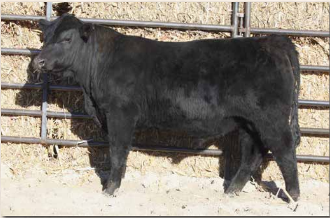
LYMANS CHERRY L113 Sells as Lot 75.