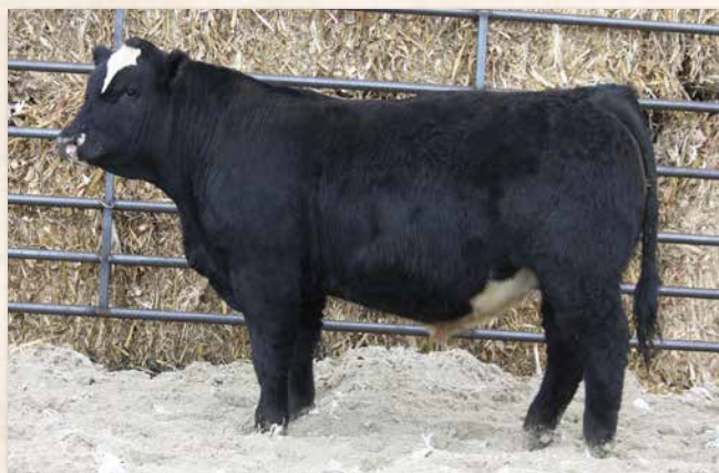
LYMANS GALILEO L5 Sells as Lot 7.