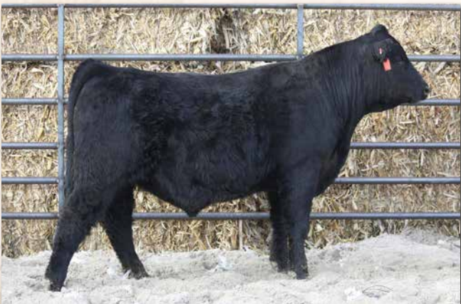
LYMANS TRIPLE CROWN L244 Sells as Lot 36.