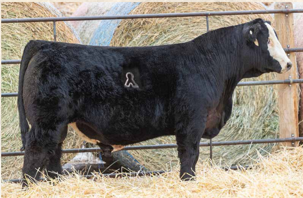
BSUM 338L Sells as Lot 3.

Where cattle that perform get the ribbon.