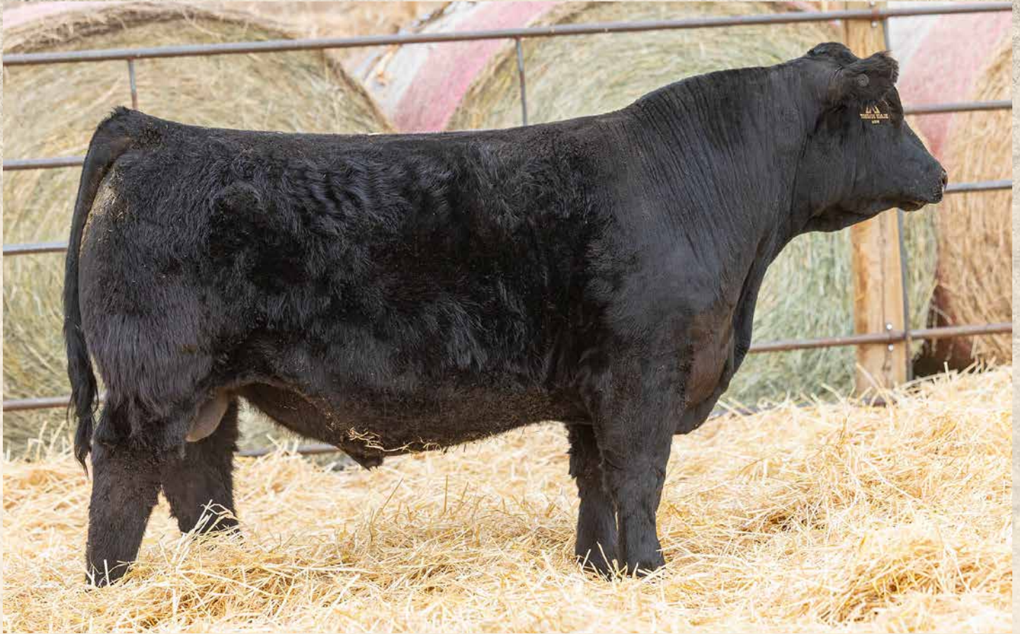
BSUM 385L Sells as Lot 64.