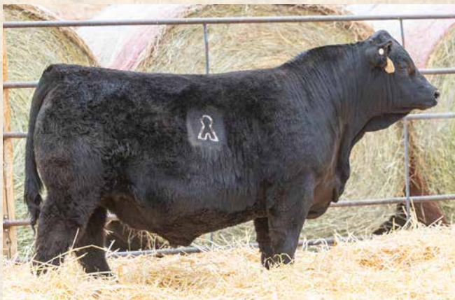
BSUM 356L Sells as Lot 48.