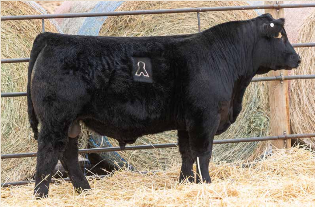
BSUM 360L Sells as Lot 2.