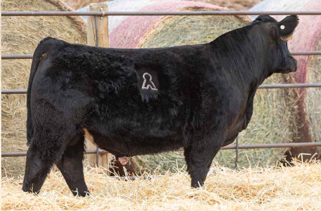
BSUM 3152L Sells as Lot 32.