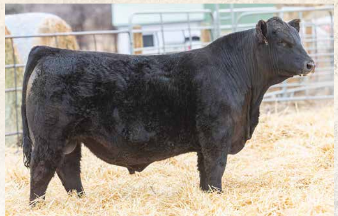
BSUM 369L Sells as Lot 10.