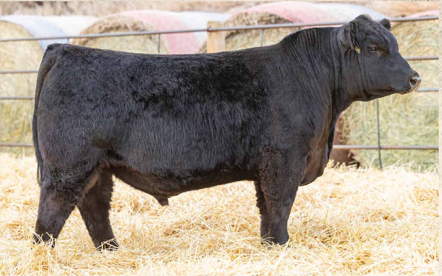
BSUM APPLIED SCIENCE 303L Sells as Lot 31.