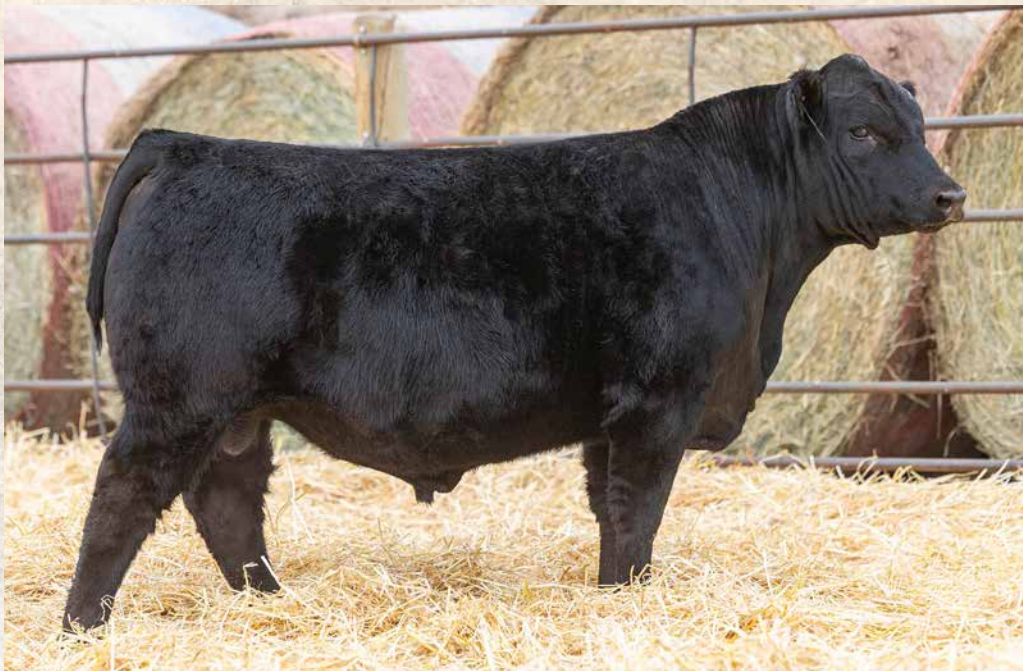
BSUM 337L Sells as Lot 33.