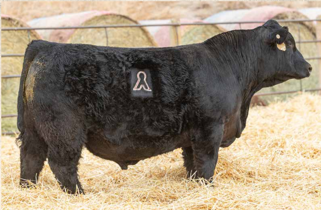
BSUM 325L Sells as Lot 39.