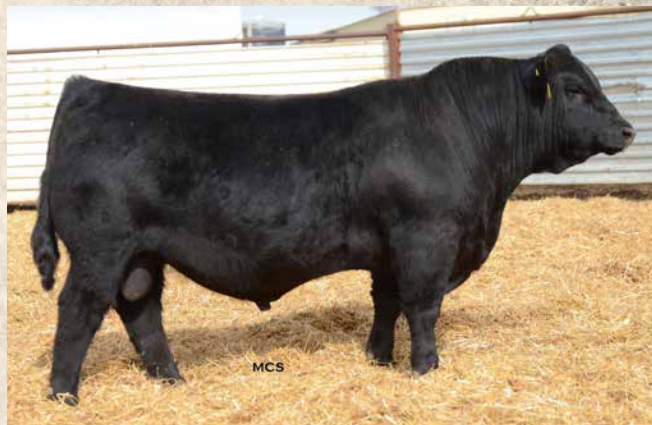
TUEL COWMAKER A3032 Sire of Lot 80.