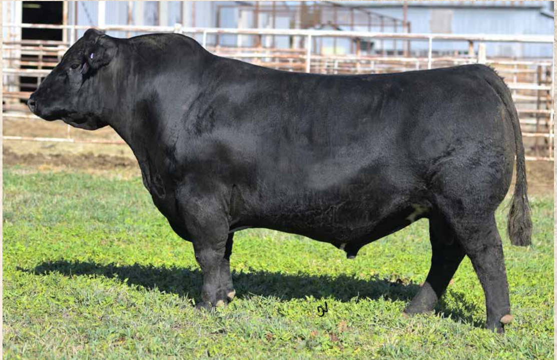
CCR COMMANDER 5135F Paternal grandsire of Lots 64-69.

We purchased 4404 from Cow camp Ranch in Kansas. We bought him for his impeccable foot quality and great structure. We used him to cleanup heifers. Being a G+ ACE for his calving ease and maternal quality, we're excited about the calves we have. Unfortunately, we lost him last summer so this will be his only calf crop. If you run in Big Country and like calving ease cattle with average growth, moderate frame and are great footed, look at the Commander sire group.