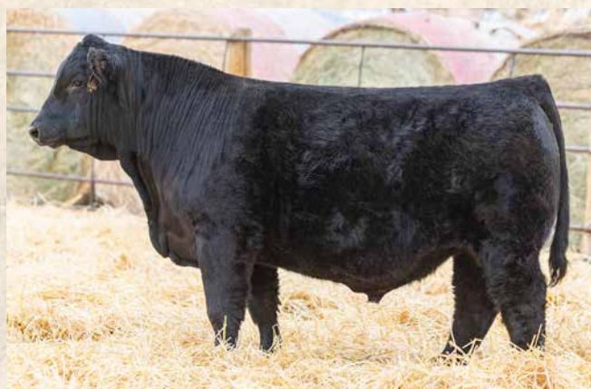
BSUM 3100L Sells as Lot 71.