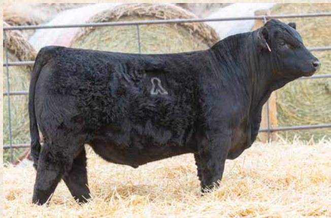
BSUM 380L Sells as Lot 78.