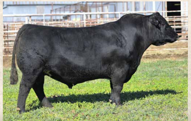
CCR COMMANDER 5135F Paternal grandsire of Lots 64-69.