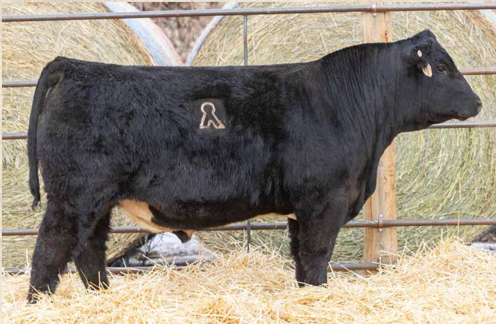
BSUM 333L Sells as Lot 65.