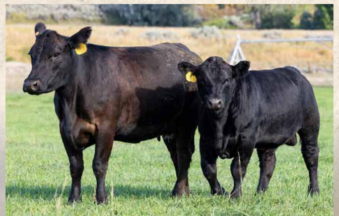
Applied Science at the side of his dam in late August.