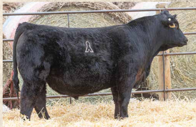
BSUM 355L Sells as Lot 41.