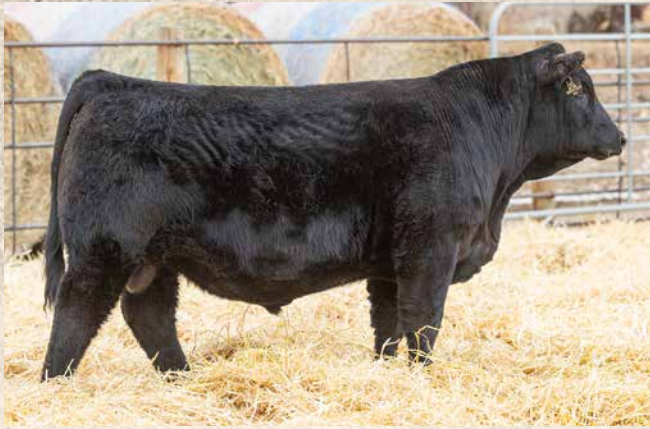
BSUM 352L Sells as Lot 75.