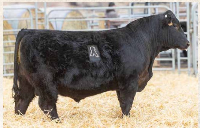
BSUM 304L Sells as Lot 36.

Where cattle that perform get the ribbon.