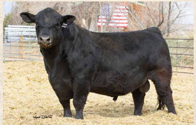
CLRS HOMELAND 327H Sire of Lots 1-28.