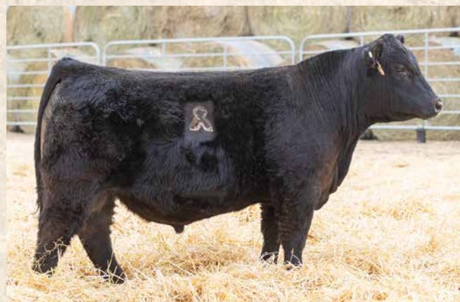
BSUM 307L Sells as Lot 53.