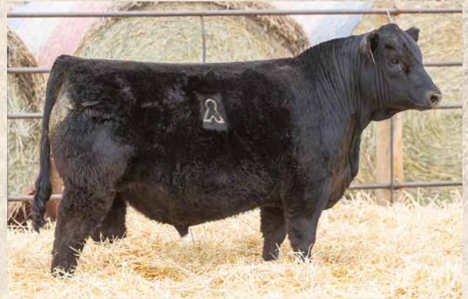
BSUM 359L Sells as Lot 7.