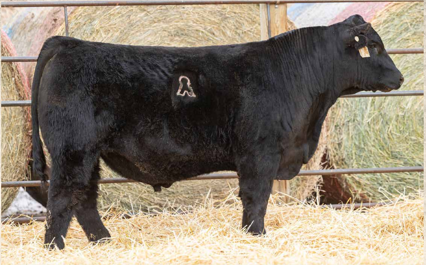
BSUM 3131L Sells as Lot 1.