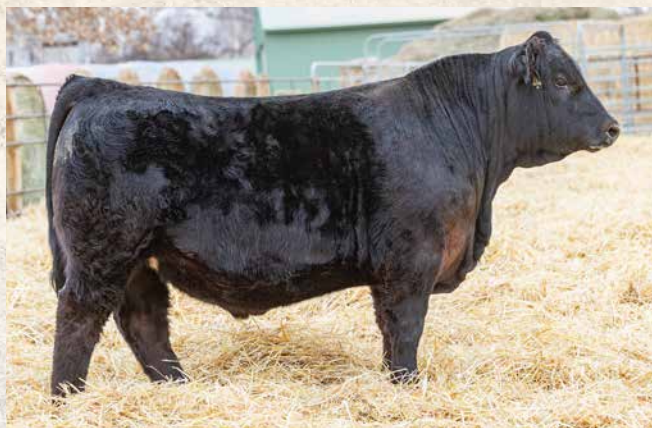
BSUM 381L Sells as Lot 79.