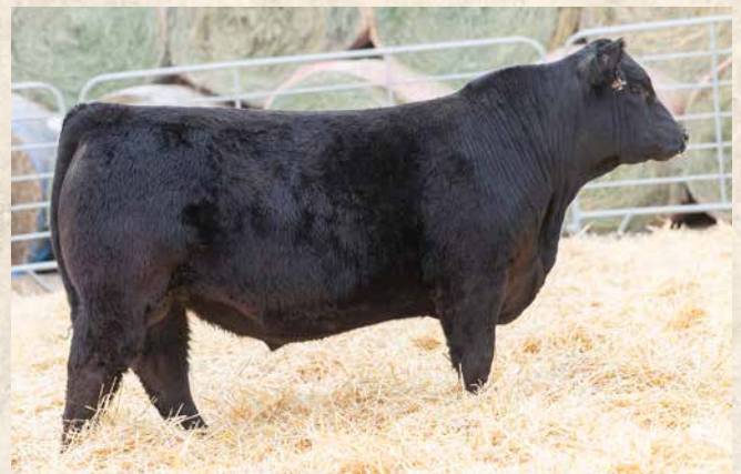
BSUM 366L Sells as Lot 9.