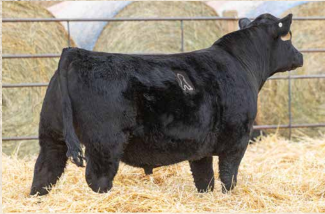
BSUM 379L Sells as Lot 24.