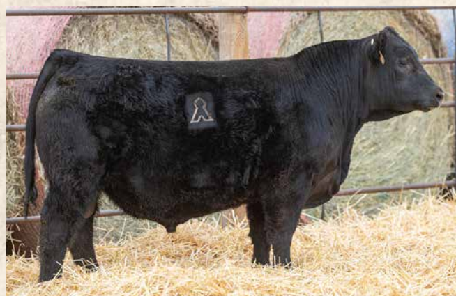
BSUM 399L Sells as Lot 44.