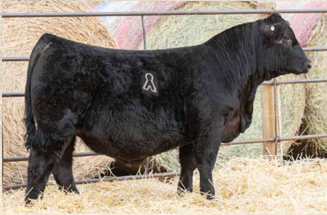
BSUM 3136L Sells as Lot 46.