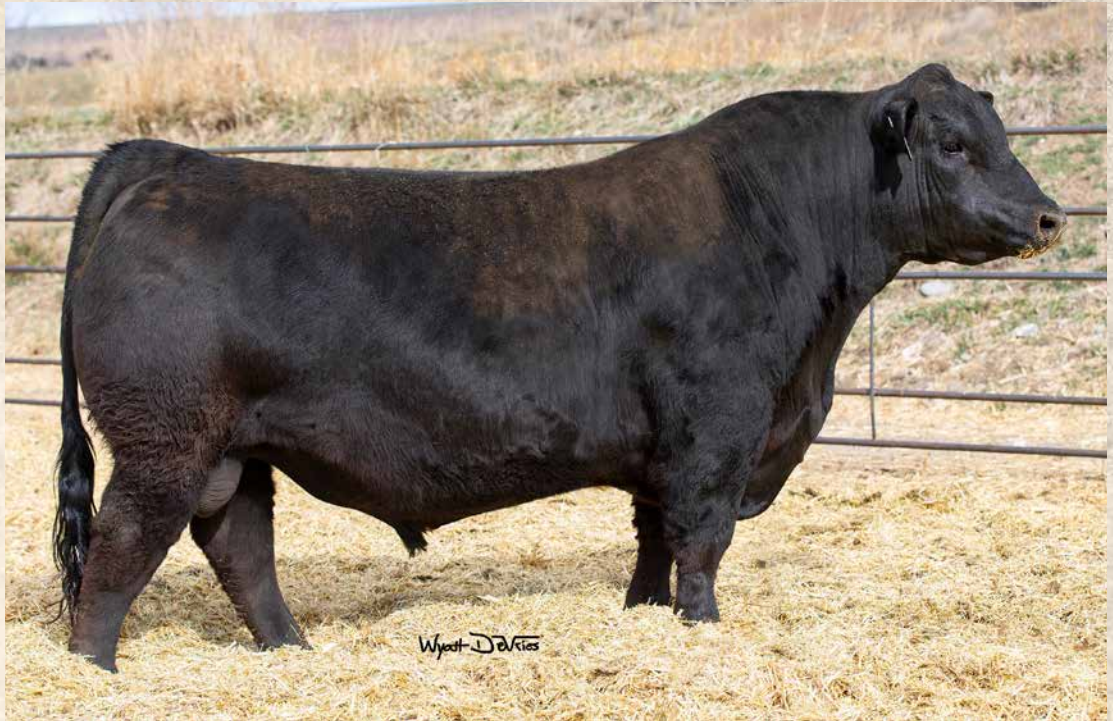
CLRS HOMELAND 327H Sire of Lots 1-28.

When we bought Homeland we were on a mission to find a bull that would not only move our numbers into an elite category but that had enough look as not to sacrifice years of selection for high quality females. He hasn't disappointed us. The Homeland calves across the country have found their way to the front of sale catalogs and sale orders consistently. His sons are stout, good footed, sound cattle with moderate birth, above breed average growth and top tier carcass numbers. Maybe the biggest surprise has been his daughters. They have matured into moderate, deep side, soft flanked cows that are bold ribbed and impeccable in their build. Couple all this with top tier stay ability and udder quality and needless to say we're pretty excited about having a bunch of them. Owned with ABS, All Beef, LLC and Clear Springs, MN.