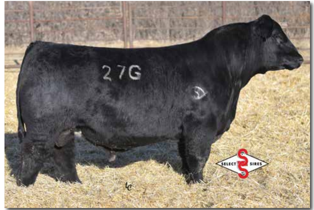
SCHOOLEY STANDOUT 27G Sire of Lots 45-47.

A great bull to use on young cows, with maternal going back to the 353 cow.