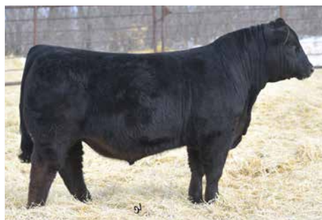
LCDR FAVOR 149F