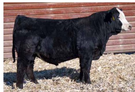
R&R TESTAMENT J155