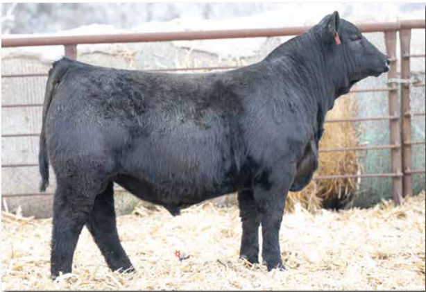
CABLES BLACK ICE 361L Sells as Lot 43.