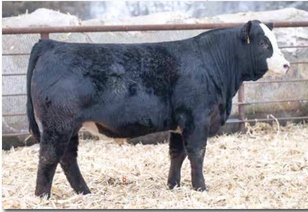
R&R TESTAMENT L358 Sells as Lot 20.