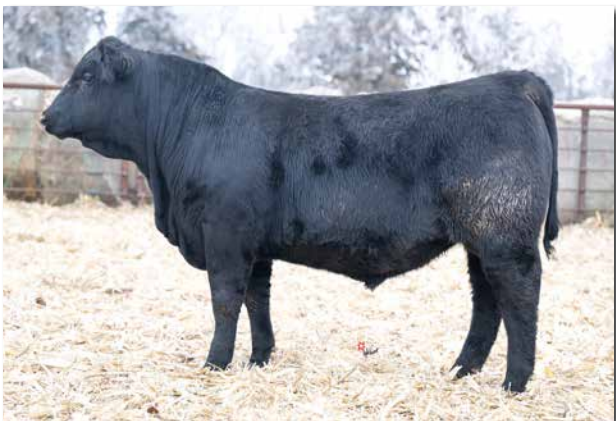
R&R TRUE NORTH L32 Sells as Lot 3.