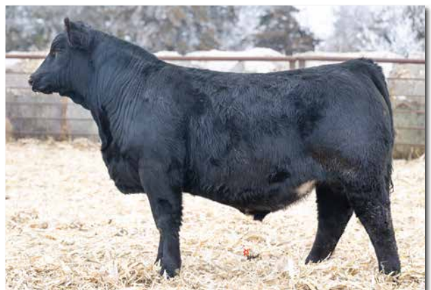
R&R TESTAMENT L349 Sells as Lot 18.

L349 is a homo black and polled powerhouse out of an excellent FHEN Halftime daughter.