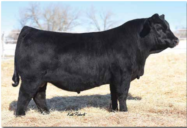
HOOK'S EAGLE 6E Sire of Lots 8-14.