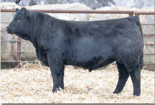
CABLES EAGLE L156 Sells as Lot 42.