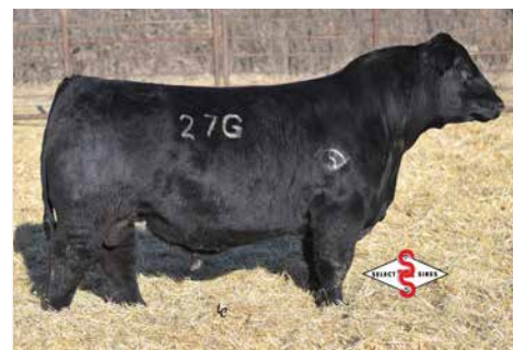
SCHOOLEY STANDOUT 27G