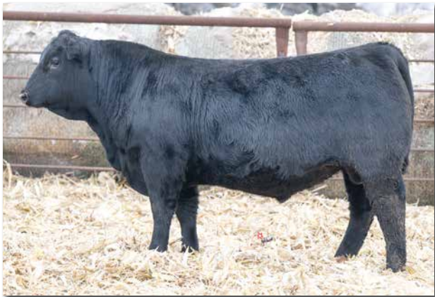
R&R TRUE NORTH L39 Sells as Lot 2.