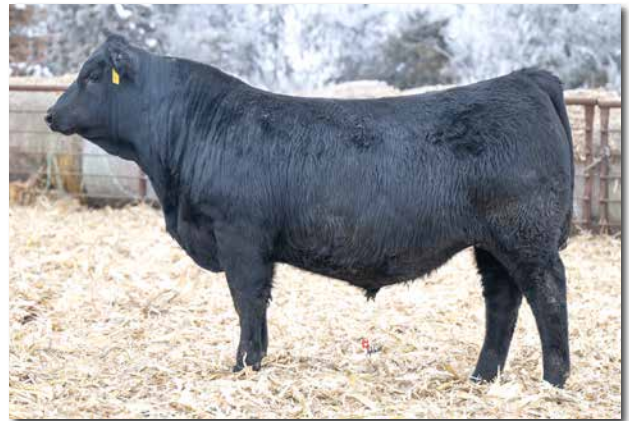
R&R FINAL PRODUCT L36 Sells as Lot 7.

This Final Product son is one of the real standouts of the offering, combining performance and calving ease with proven genetics.