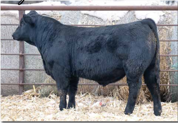
R&R EAGLE L304 Sells as Lot 11.