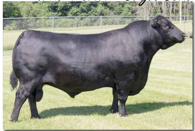
SQUARE B TRUE NORTH 8052 Sire of Lots 1-6.

Balanced calving ease with strong growth potential for weaning and yearling numerical values.