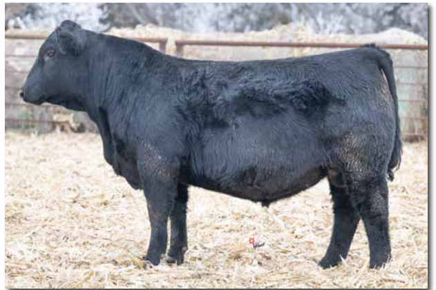
R&R SHERIFF L315 Sells as Lot 30.

Strong numerical values, homo black and homo polled genetic package.