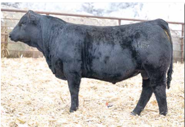
CABLES FAVOR 662L Sells as Lot 34.