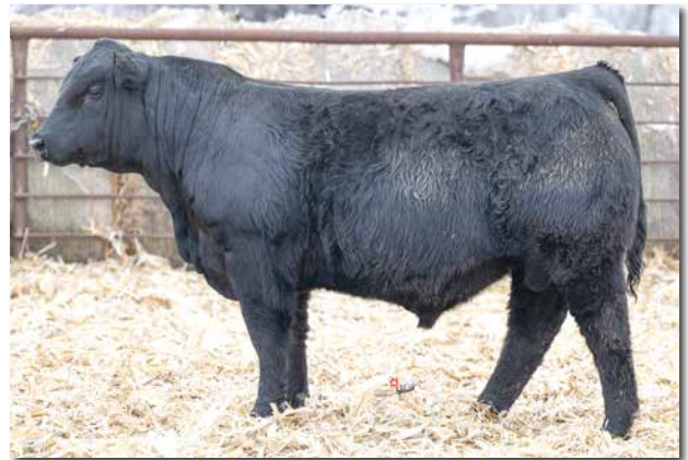
CABLES STUNNER 946L Sells as Lot 48.

946L and his dam had footrot this summer, he weaned off a bit light, but is catching up now. A 1/2 blood with a lot of style and muscle in sound moving herd bull.