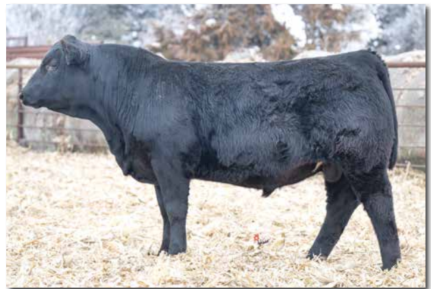
R&R TESTAMENT L352 Sells as Lot 17.

The second heaviest weaning Testament son in the offering. Be sure to look him up sale day. He is one of the really good bulls in the offering.