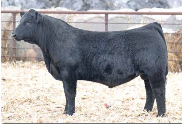
CABLES HIGHWAY 088L Sells as Lot 53.