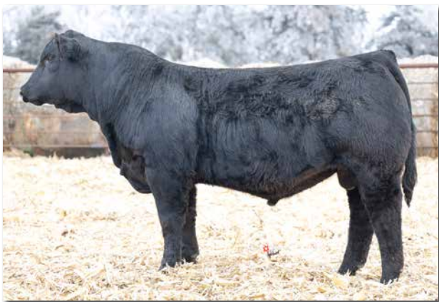
CABLES FAVOR 76L Sells as Lot 35.