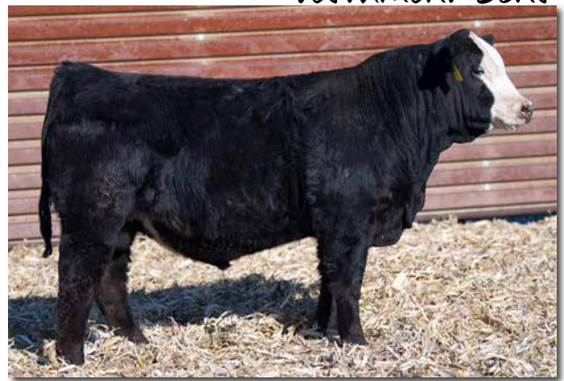
R&R TESTAMENT J155 Sire of Lots 15-20.

L348 is a nicely balanced homo polled Testament out of a strong cow family.