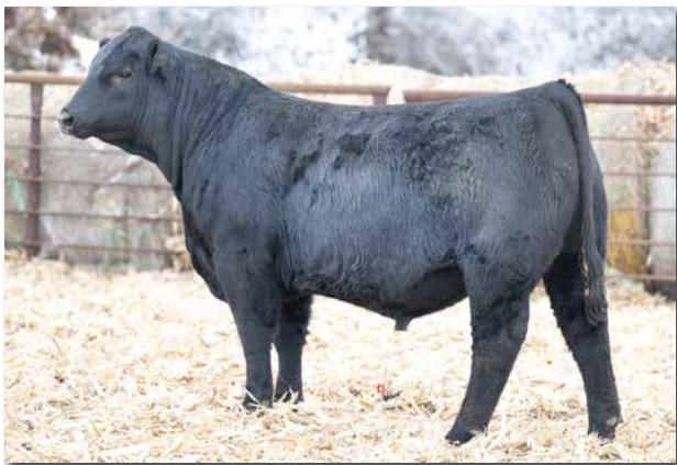
CABLES SUGAR RAY L018 Sells as Lot 50.