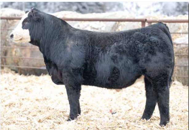
CABLES STANDOPUT L850 Sells as Lot 45.