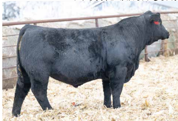
CABLES PROCLAMATION 901L Sells as Lot 36

LOT 36 CABLES PROCLAMATION 901L Homo Black || Homo Polled 5/8 SM 3/8 AN 3/21/2023 Bull ASA# 4266382 BW: 82 Adj. WW: 849