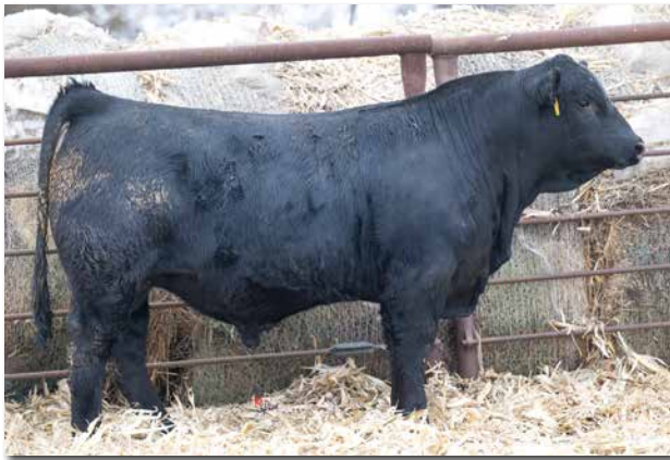
R&R FALCON L317 Sells as Lot 21.