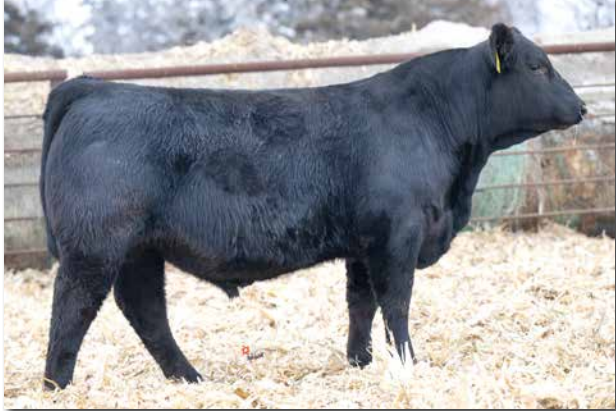
R&R HOMELAND L354 Sells as Lot 32.