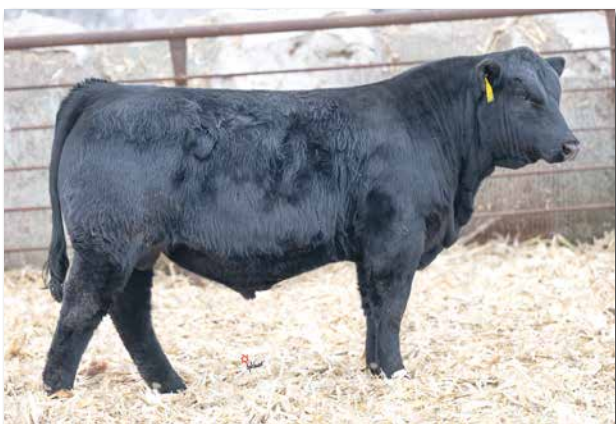
R&R TESTAMENT L321 Sells as Lot 15.

The highest weaning Eagle son who is a true powerhouse; homo black and homo polled.