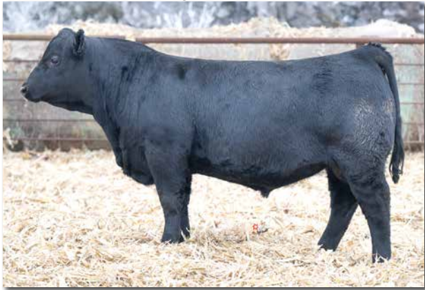
R&R TRUE NORTH L30 Sells as Lot 1.