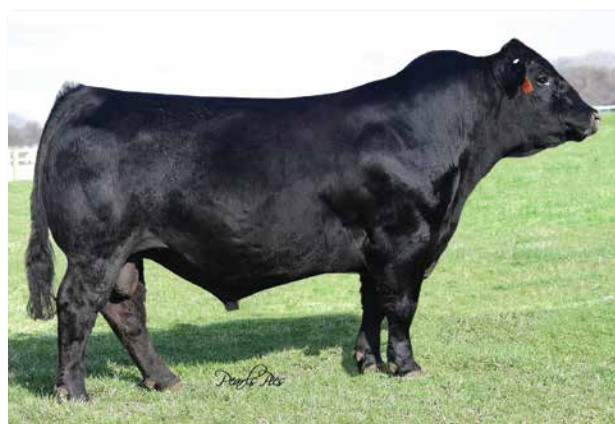
WS PROCLAMATION E202 Sire of Lots 36-41.

L882 has really come on. A complete, sound moving muscular bull.