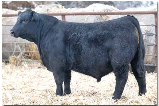
R&R EAGLE L353 Sells as Lot 8.

Eagle sons have topped sales all over the country. This son is one of the phenotype standouts of the offering. Not to mention he weaned at over 700 lbs.