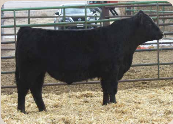
BCC BARKER RB L4049 Sells as Lot 72.