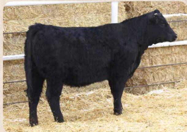
BSR MS BARKER BOBCAT L14P Sells as Lot 122.