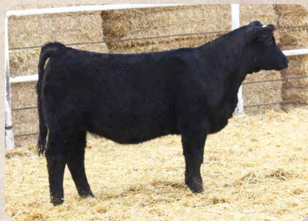
BSR MS BARKER GREAT WEST LE259 Sells as Lot 125.