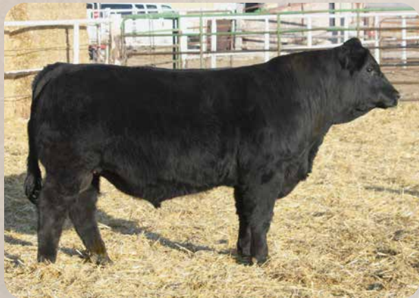
BSR BARKER WACO LJ364 Sells as Lot 58.