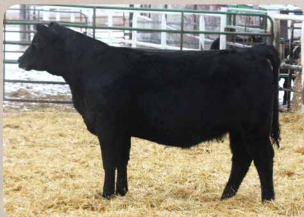
BCC MS BARKER RB LH4013 Sells as Lot 104.