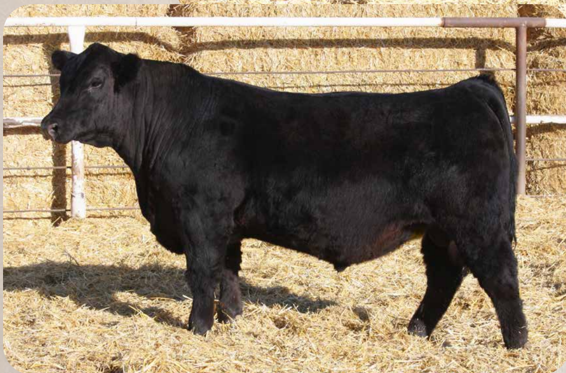
BSR BARKER ECLIPSE LJ235 Sells as Lot 2.