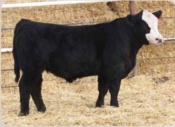
BSR BARKER BALD EAGLE LY221 Sells as Lot 42.