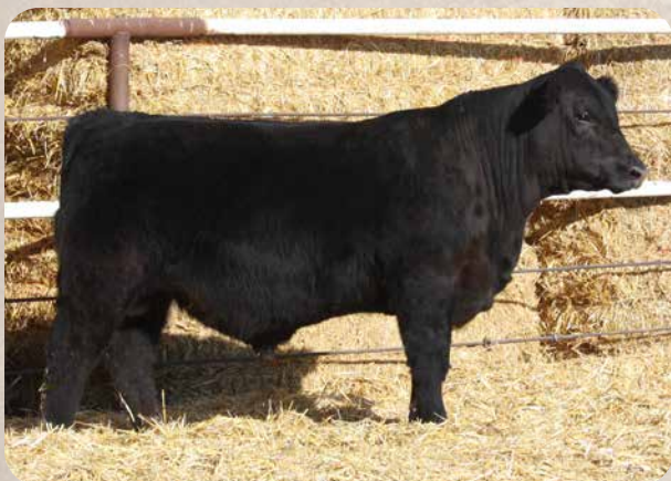
BCC BARKER OUTSIDER L4G Sells as Lot 73.

These Growth Fund sons have been very well received by commercial cattlemen the past couple of years and when you look at this bull you can see why. He is big and powerful to go along with great growth EPDs.