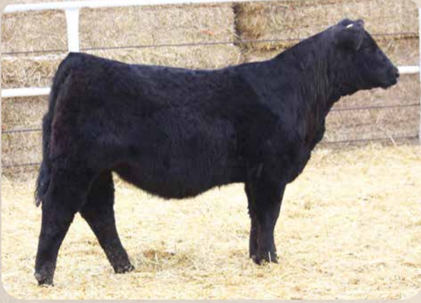
BSR MS BARKER GREAT WEST LF933 Sells as Lot 127.