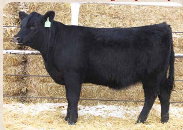
BCC MS BARKER RB L20G Sells as Lot 105.