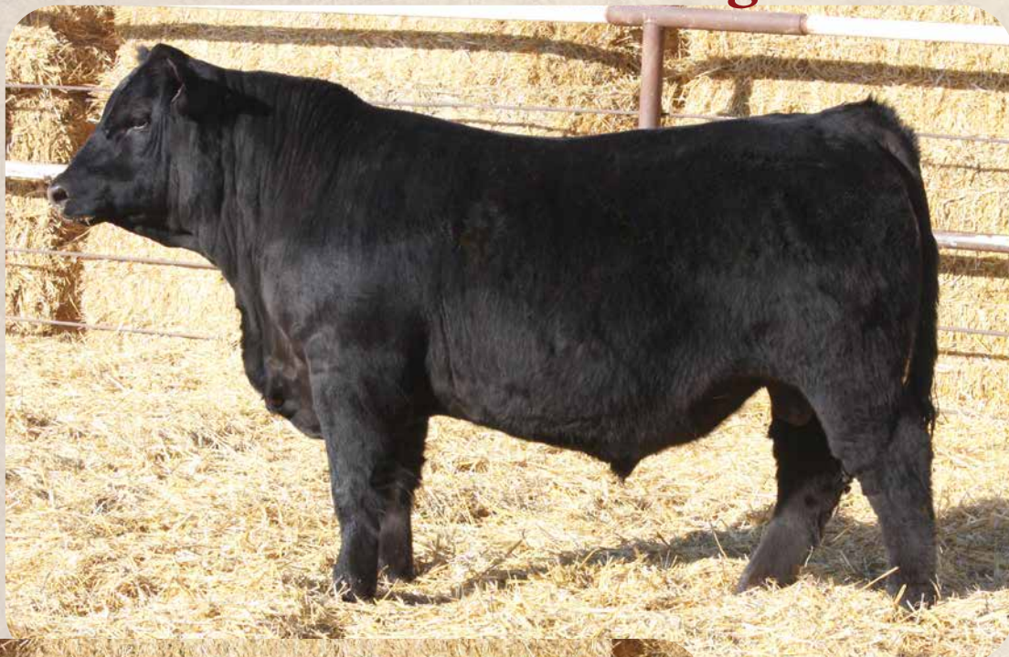
BSR BARKER ECLIPSE LJ437 Sells as Lot 1.