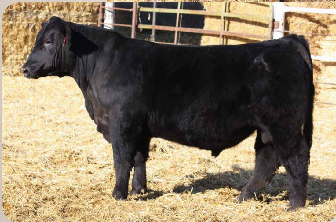
BSR BARKER HOMELAND LC52 Sells as Lot 6.