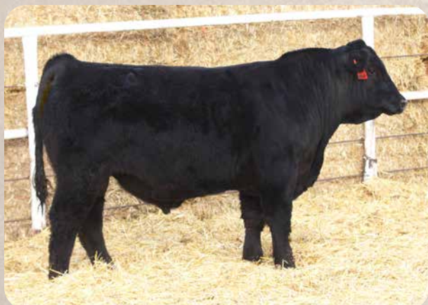
BSR BARKER HEISMAN LG601 Sells as Lot 16.