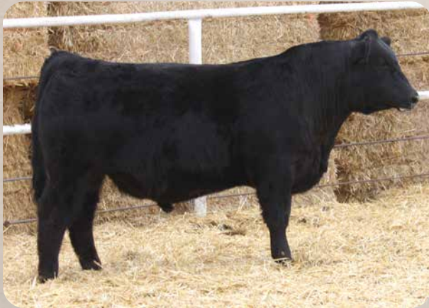
BSR BARKER HOMELAND LEC40 Sells as Lot 34.