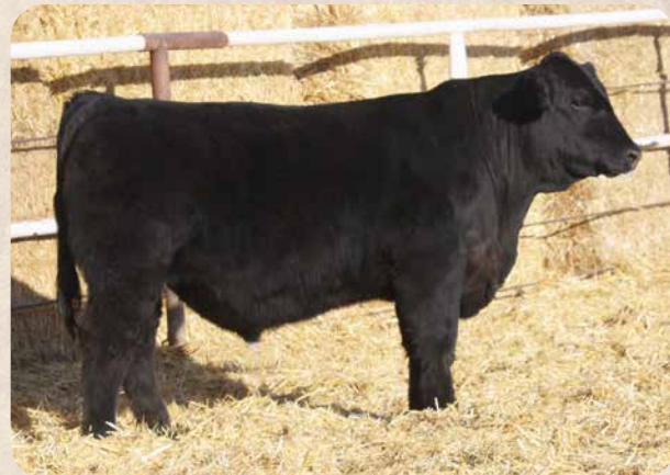
BSR BARKER GREAT WEST LF90 Sells as Lot 19.