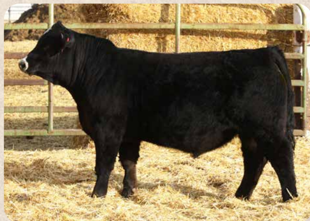
BSR BARKER ECLIPSE LC77 Sells as Lot 12.

This strip faced son of Eclipse is combines calving ease and growth with balanced carcass EPD.