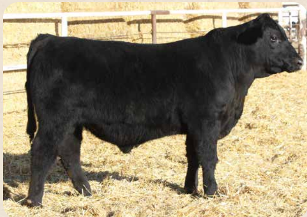
BSR BARKER RB LF478 Sells as Lot 62.