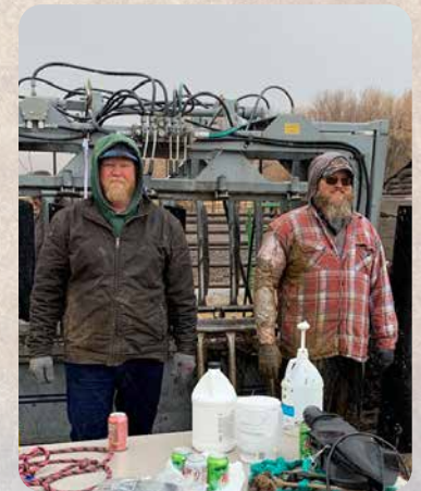
to Bear River Animal Hospital who always help take care of our veterinary needs.