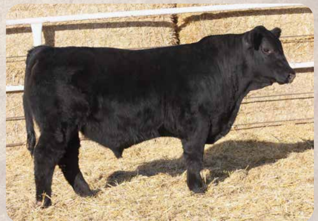
BSR BARKER HAWK LG69 Sells as Lot 31.