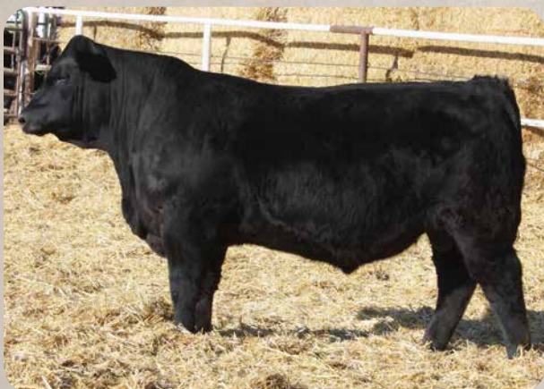
BSR BARKER ECLIPSE LA208 Sells as Lot 10.

Another great Eclipse son who is big bodied and stout. He is the kind of bull to leave a beautiful set of replacement females.