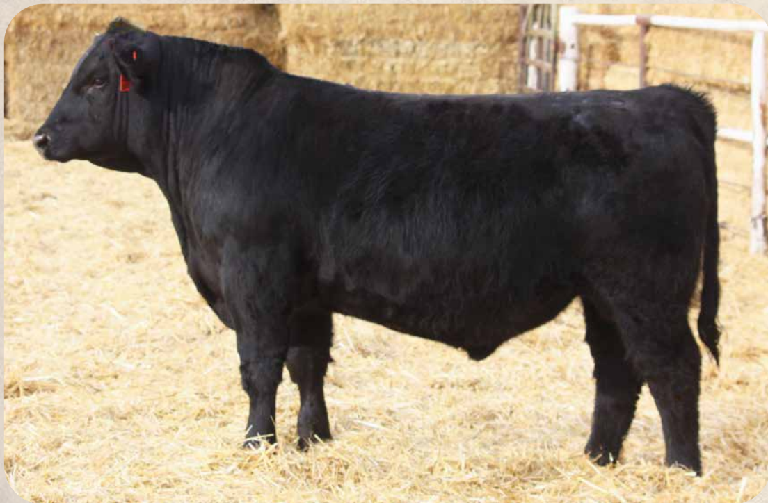
BSR BARKER GUARDIAN LA207 Sells as Lot 9.