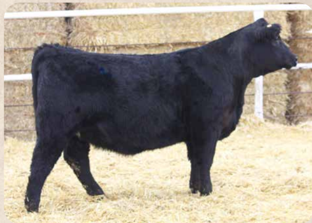
BARKER COMMERCIAL L743 Sells as Lot 130.