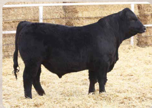
BCC BARKER ASHLAND LJ702 Sells as Lot 82.