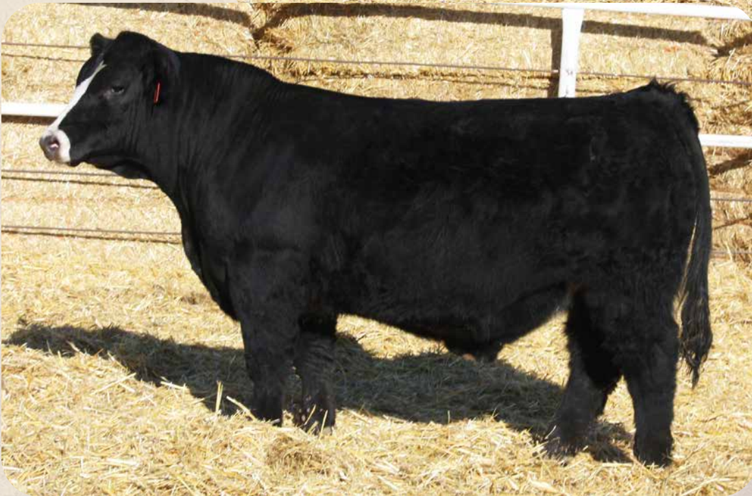
BSR BARKER MTN LJ423 Sells as Lot 8.