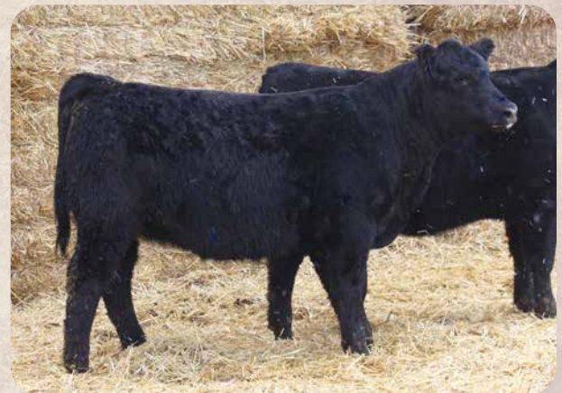
BARKER COMMERCIAL LG57 Sells as Lot 143.