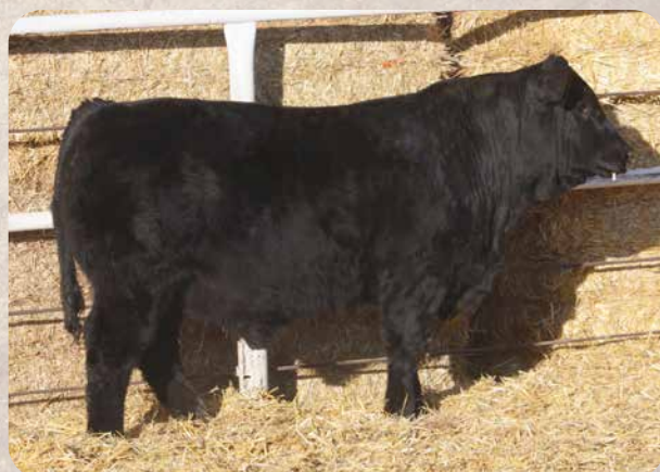
BSR BARKER HAWK LG280 Sells as Lot 41.