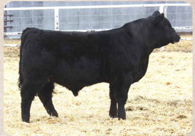
BSR BARKER MTN LF278 Sells as Lot 30.