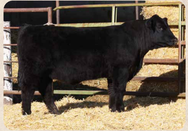
BSR BARKER MTN LF43 Sells as Lot 28.