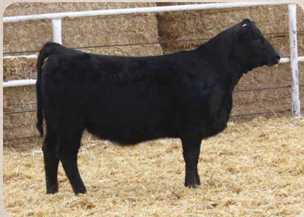
BSR MS BARKER BOBCAT L667 Sells as Lot 118.