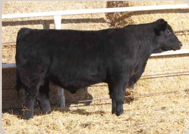
BSR BARKER WACO LG210 Sells as Lot 57.