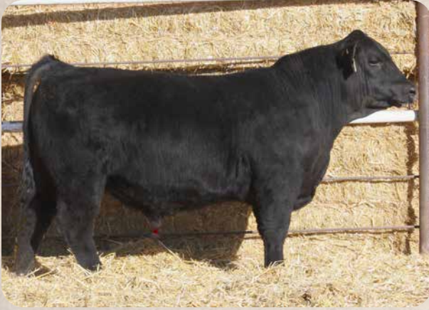
BARKER COMMERCIAL L010 Sells as Lot 83.