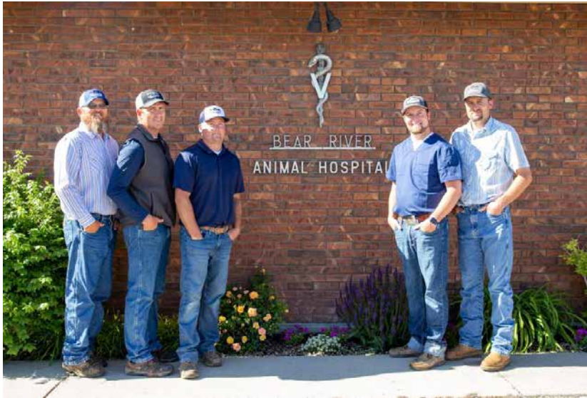
Bear River Animal Hospital