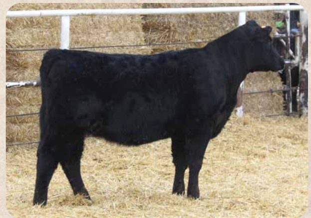
BARKER COMMERCIAL LJ219 Sells as Lot 142.