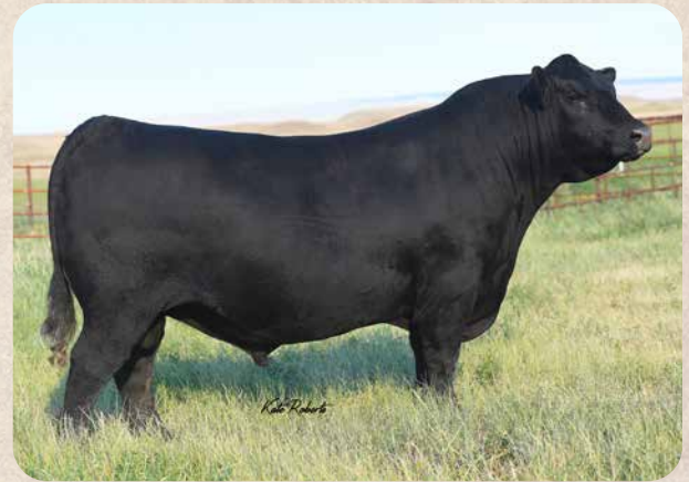
EXAR STALLION 7986 Sire of Lot 117.