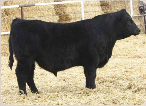
BSR BARKER COUNTRY LE8037 Sells as Lot 23.