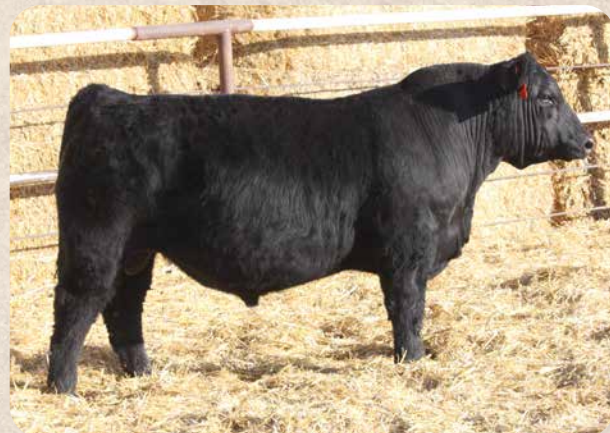
BSR BARKER HOMELAND LF8037 Sells as Lot 20.