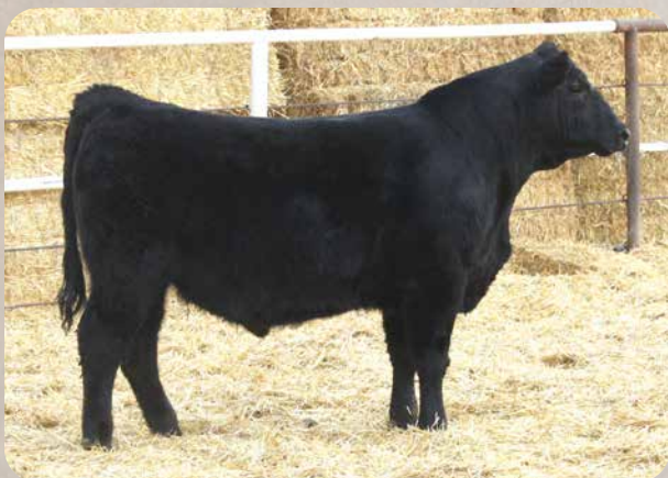
BCC BARKER RB LA654 Sells as Lot 75.

Another stout made Growth Fund that has a high marbling EPD. A real no miss bull here.