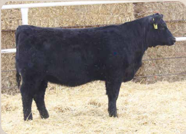
BARKER COMMERCIAL LD515 Sells as Lot 145.