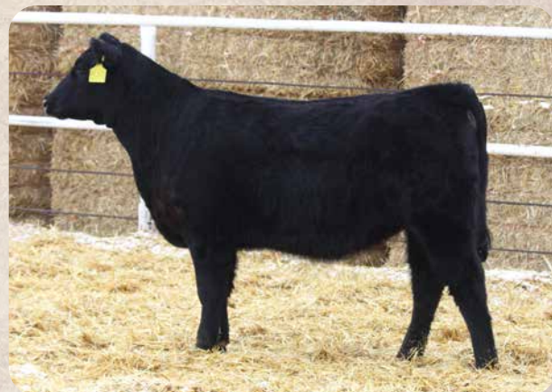
BCC MS BARKER RB LH5 Sells as Lot 108.