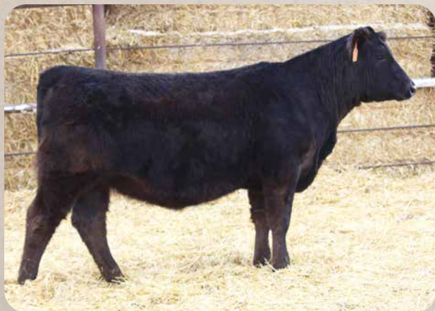
BARKER COMMERCIAL LH238 Sells as Lot 139.