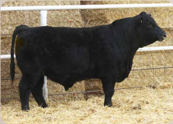
BARKER COMMERCIAL L666 Sells as Lot 86.