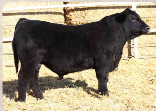
BSR BARKER LH423 Sells as Lot 22.