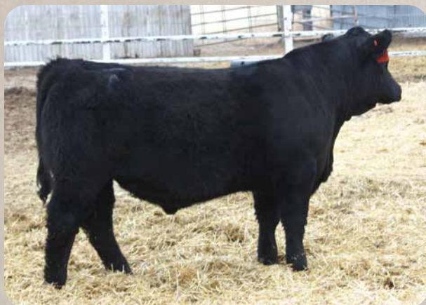
BSR BARKER COUNTRY LH57 Sells as Lot 47.