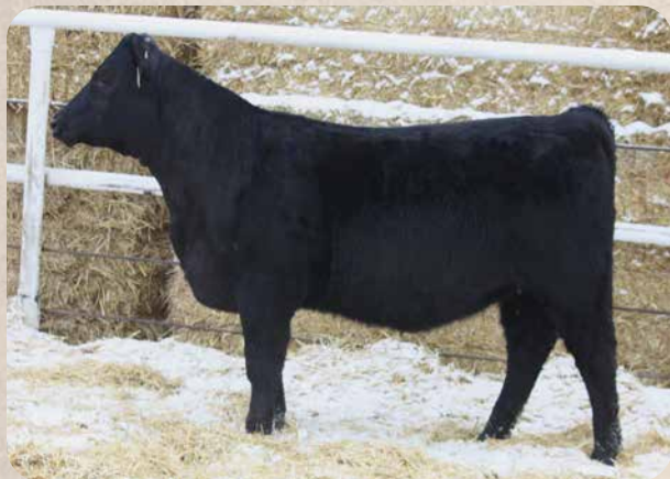
BCC MS BARKER JAIL BREAK LG3 Sells as Lot 100.