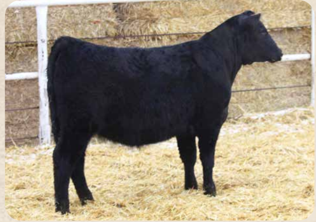
BCC MS BARKER STALLION L21G Sells as Lot 111.