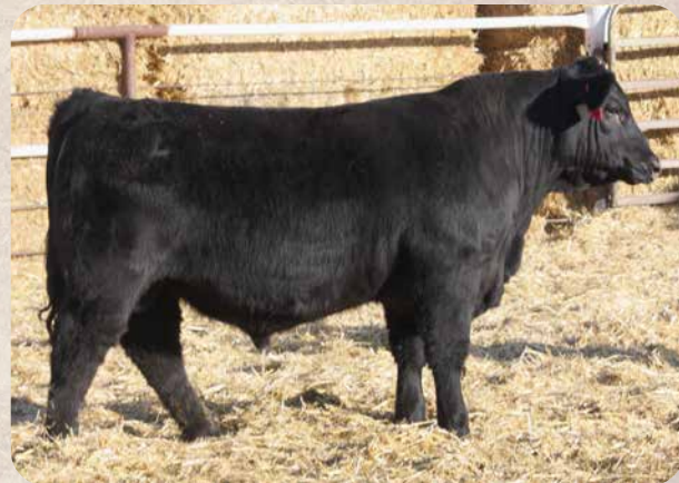
BSR BARKER COUNTRY LZ028 Sells as Lot 21.