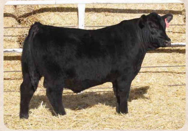
BARKER COMMERCIAL LF23G Sells as Lot 88.