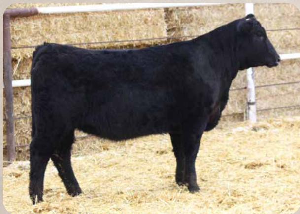
BSR MS BARKER BOBCAT L670 Sells as Lot 120.