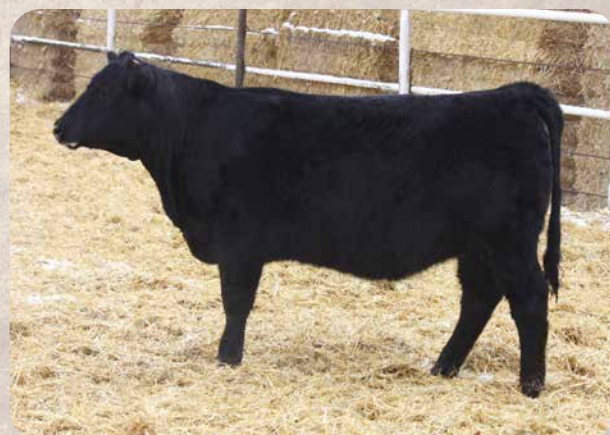
BCC MS BARKER RB LE5 Sells as Lot 109.