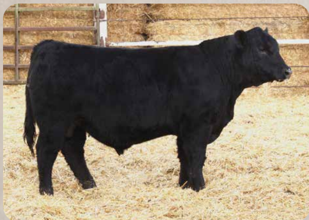
BSR BARKER GREAT WEST LF264 Sells as Lot 18.