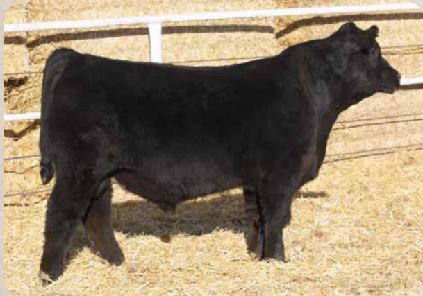
BSR BARKER COUNTRY LD321 Sells as Lot 15.