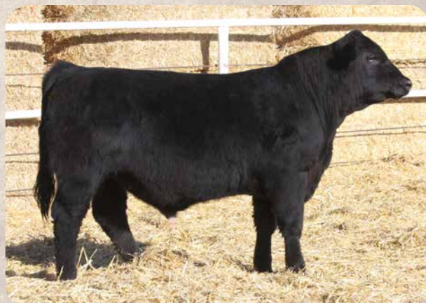
BSR BARKER GREAT WEST LJ360 Sells as Lot 54.