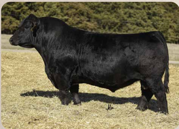
CLRS GUARDIAN 317G Sire of Lot 9.

The Guardian sons have topped sales across the land and this bull has the potential to be the top on sale day. He is one of the real powerful bulls in the pen with the herd bull look, not to mention his combination of calving ease and growth.