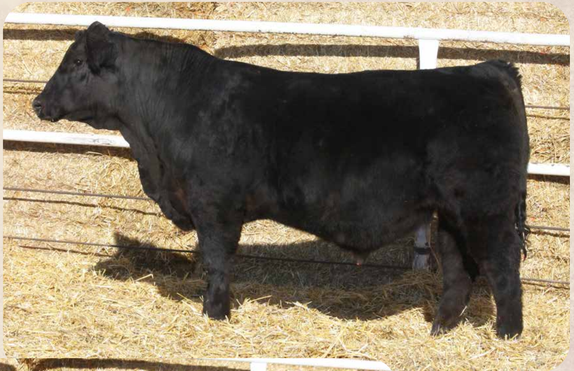
BSR BARKER AMERICAN LF7G Sells as Lot 7.