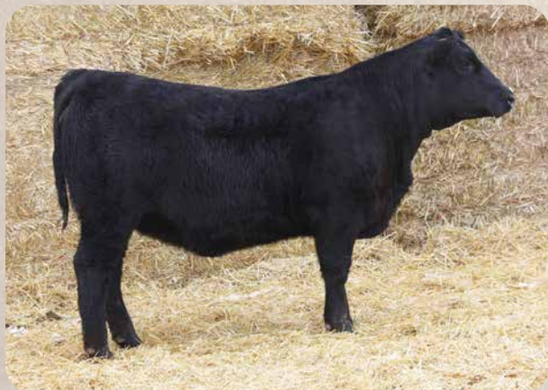
BSR MS BARKER COUNTRY L016 Sells as Lot 119.