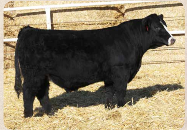
BSR BARKER MTN LB57 Sells as Lot 29.