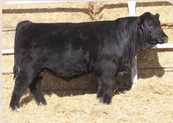
BSR BARKER HAWK LF207 Sells as Lot 37.