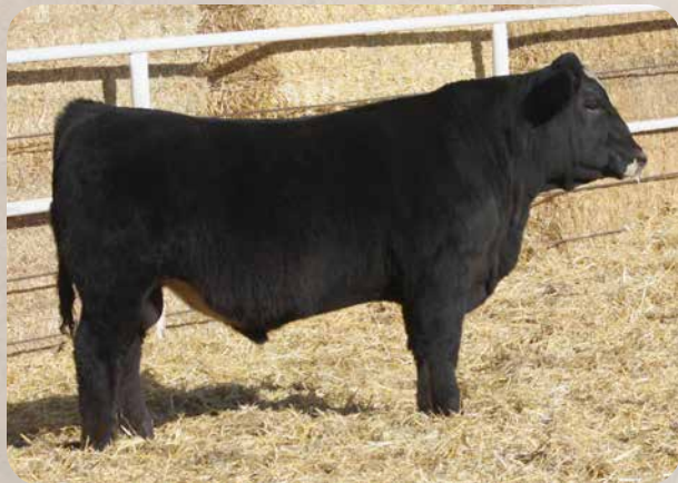
BSR BARKER BALD EAGLE LC78 Sells as Lot 17.