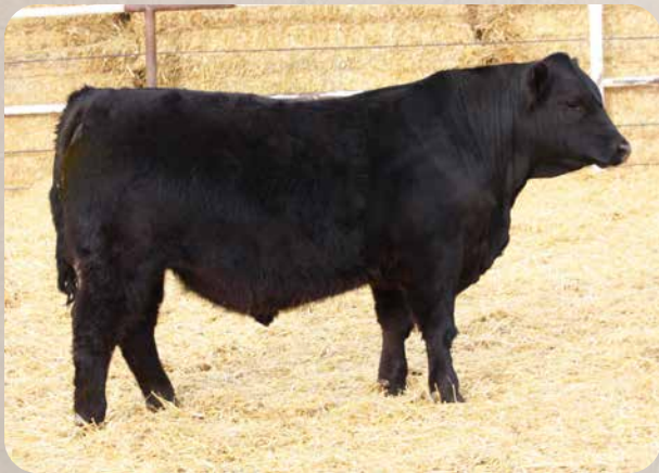
BSR BARKER COUNTRY LJ700 Sells as Lot 25.