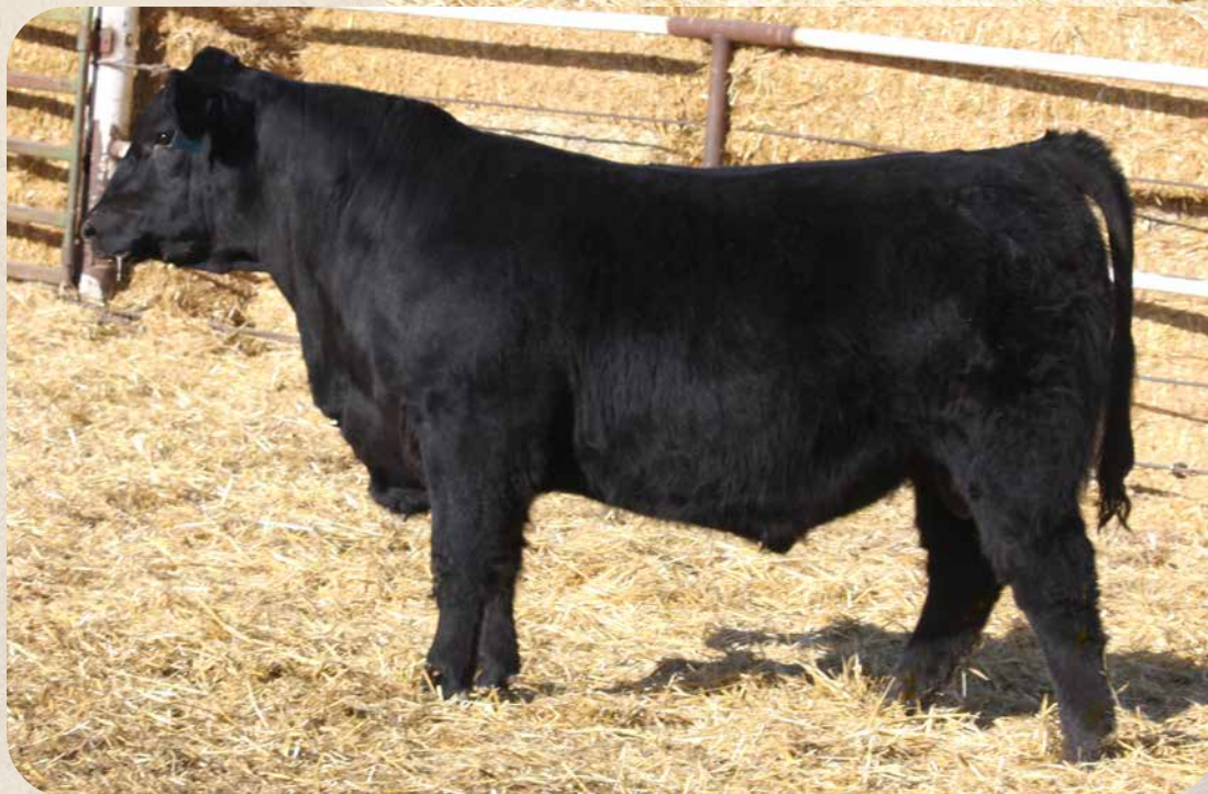
BCC BARKER COWBOY LOGIC LE21 Sells as Lot 71.