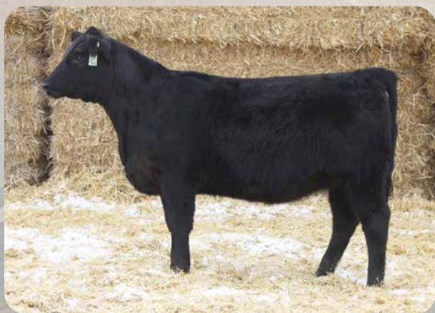
BARKER COMMERCIAL LX07 Sells as Lot 148.