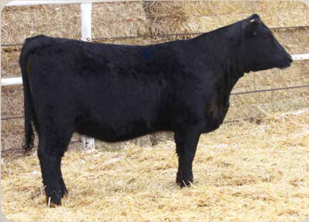
BSR MS BARKER BOBCAT L671 Sells as Lot 128.