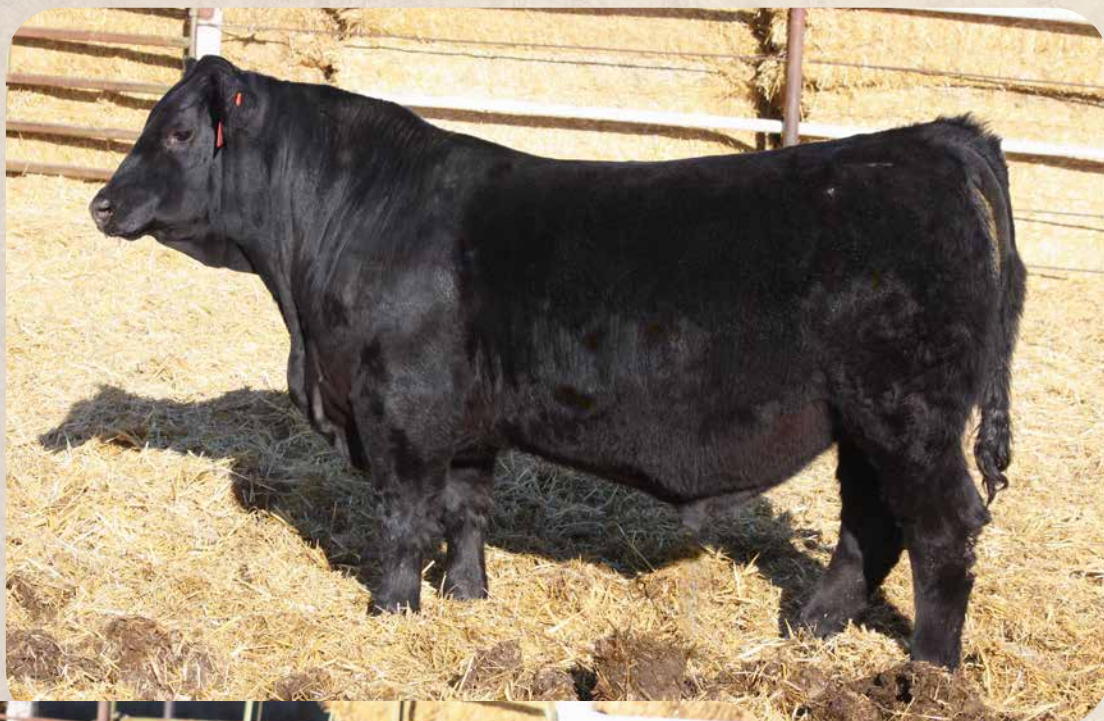
BSR BARKER COUNTRY LG200 Sells as Lot 5.