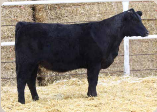
BCC MS BARKER ASHLAND LC212 Sells as Lot 112.