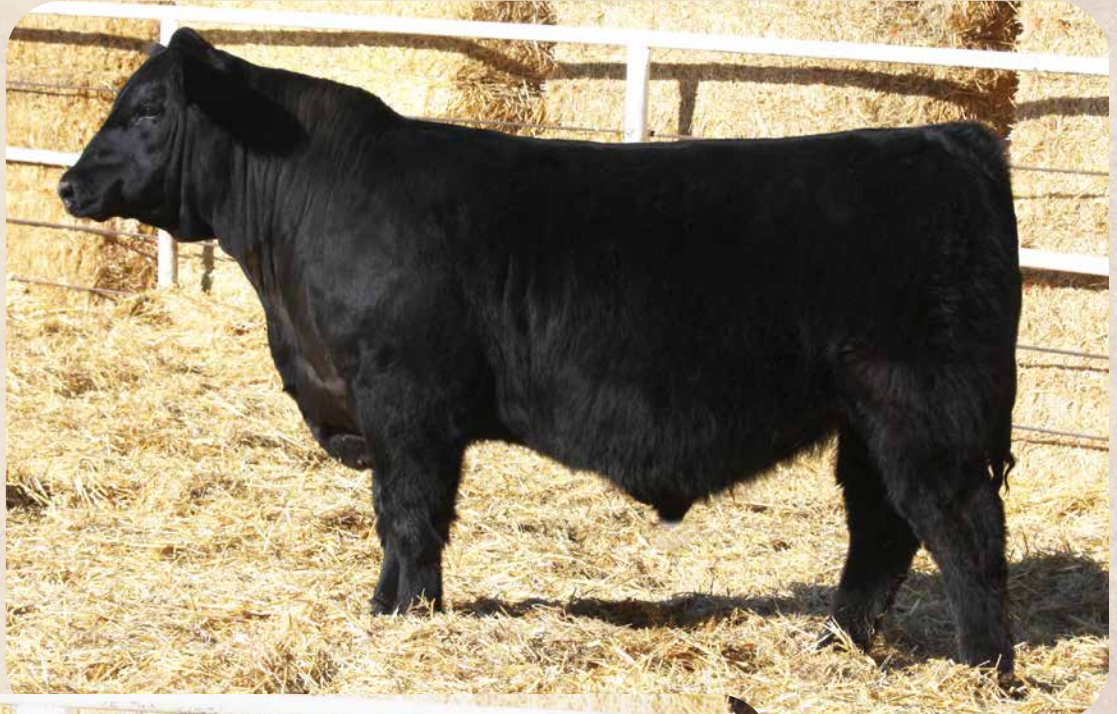
BSR BARKER TJ GOLD LG07 Sells as Lot 3.