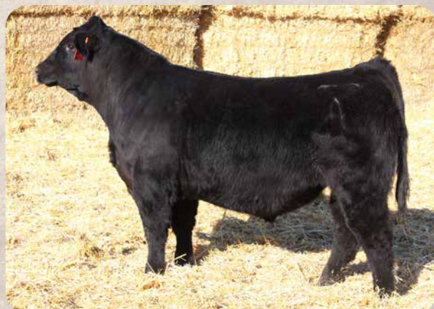
BSR BARKER COUNTRY LH232 Sells as Lot 14.

Calving ease Country Boy son with tons of power and growth.