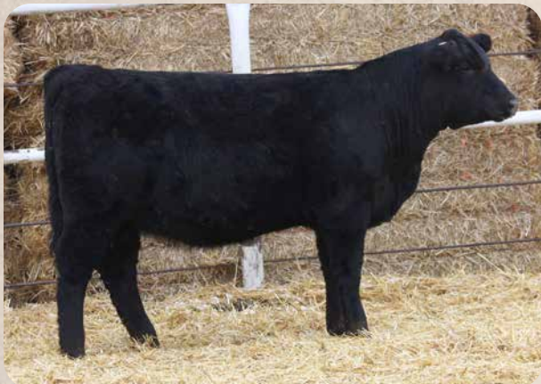
BARKER COMMERCIAL LF817 Sells as Lot 136.