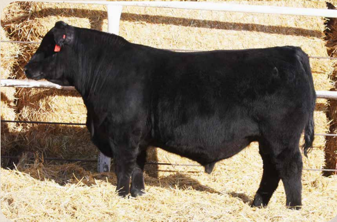
BSR BARKER COUNTRY LJ8181 Sells as Lot 4.