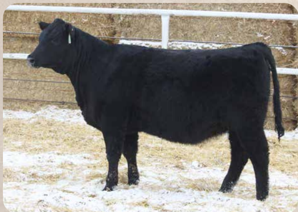
BCC MS BARKER JBREAK LG440 Sells as Lot 101.