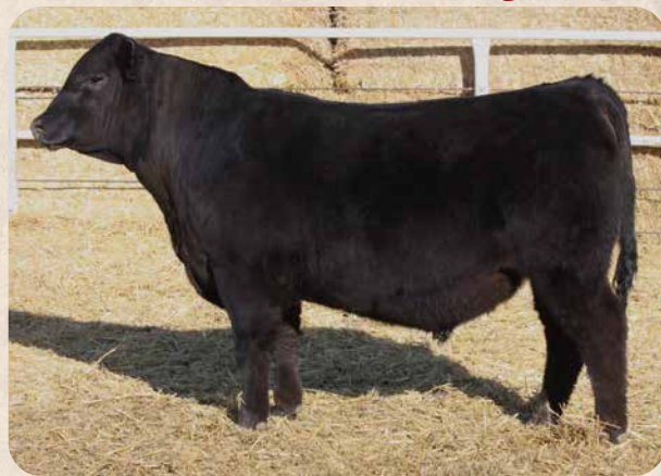
LJ16G Sells as Lot 11.

One of the real phenotype standouts of the offering. He has the balance, rib and muscle to make him a crowd favorite on sale day.