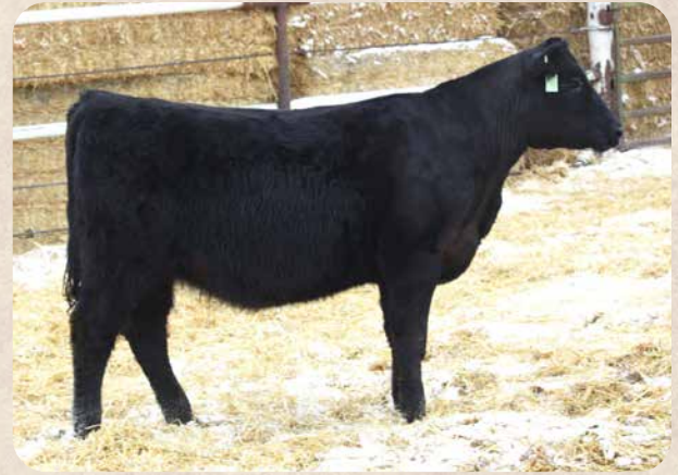
BCC MS BARKER RB LJ4049 Sells as Lot 116.