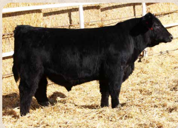
BSR BARKER FRONT LINE LG933 Sells as Lot 64.