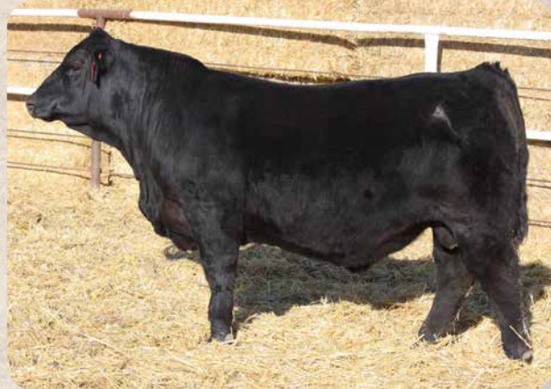
BSR BARKER COUNTRY LF391 Sells as Lot 13.

Here is one of the real growthy, stout made Country Boy's in the offering.