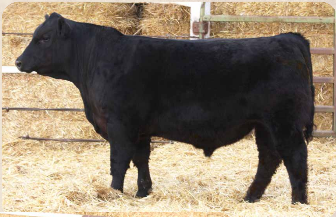
BCC BARKER ASHLAND LJ028 Sells as Lot 70.