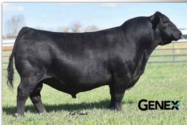
KG JUSTIFIED 3023 Sire of Lot 59.

PE to KOCH BE JUST COWBOY 16J (4006393). Confirmed bred to PE and due 4/10/2024.