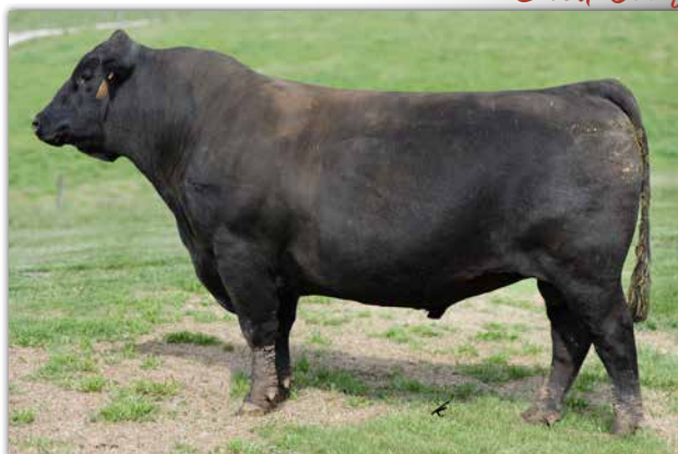
LRS ICONIC 303C Sire of Lot 58.

PE to KOCH BE JUST COWBOY 16J (4006393). Confirmed bred to PE and due 4/9/2024.