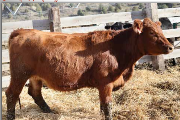
TRCR MISS REBEL H54 Sells as Lot 17.