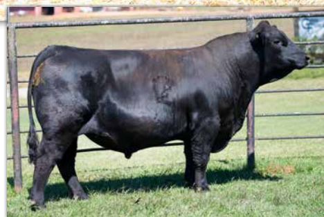
LRS RARITY Brother to Lot 3.