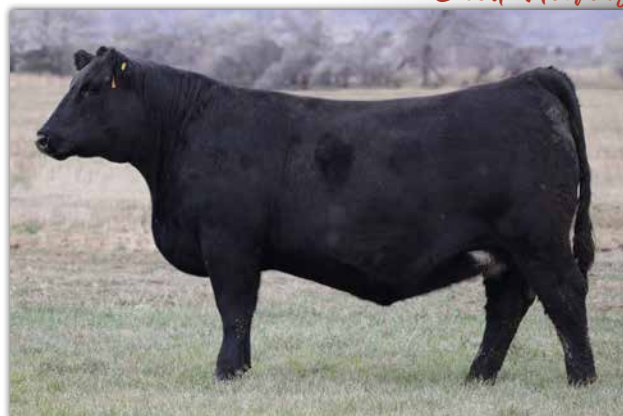
CFAS MISS EAGLE 040 Sells as Lot 13.