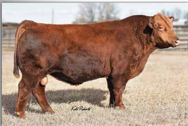
WS ALL ABOARD B80 Sire of Lot 48.