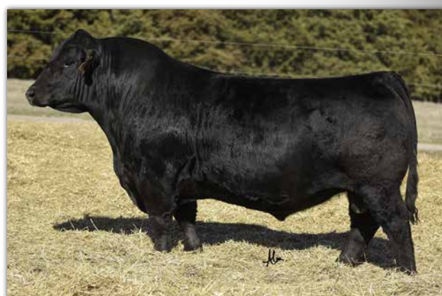
CLRS GUARDIAN 317G Sire of Lot 16.

PE to KBHR MR GOLD (3943854). Confirmed bred to PE and due 5/8/2024.