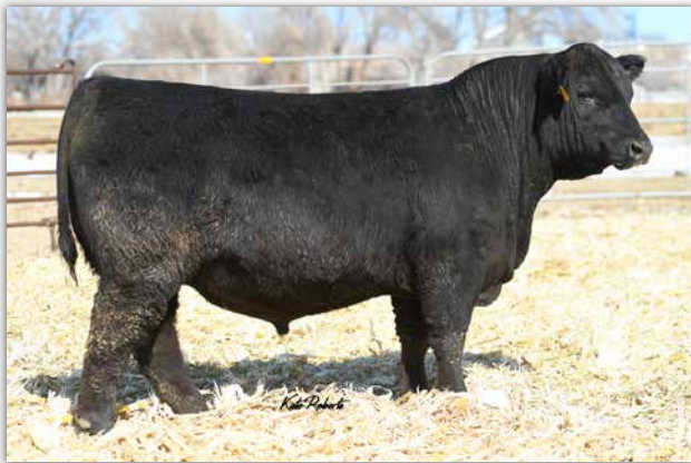
BSUM COUNTRY BOY Sire of Lot 1 Pick Heifers.