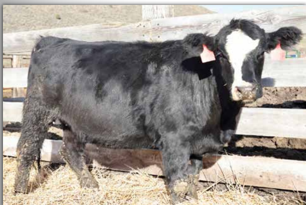
RYMO SHEZ TROPHY GRADE Y49K Sells as Lot 19.