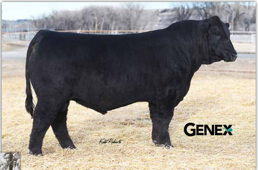
LBRS GENESIS G69 Sire of the Donation Heifer.

Raffle tickets to win the donation heifer will be auctioned off at the start of the sale on Saturday. $10/ticket.