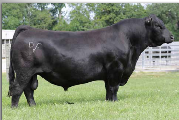
DEER VALLEY GROWTH FUND Sire of Lot 18.