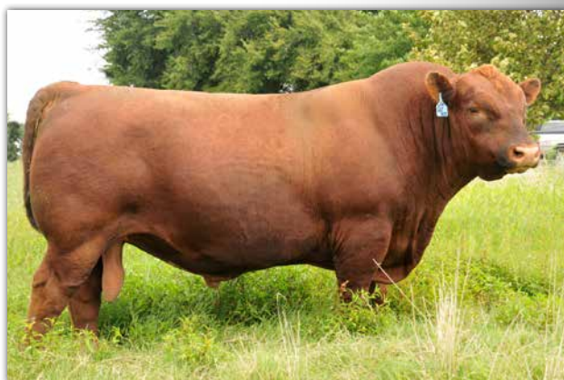
VGW OLY 903 Sire of Lot 61.

PE to 917G (3854235), 6D36 (3133195), 273K (4173242), 268K (4173240). Confirmed bred to PE and due 4/30/2024.