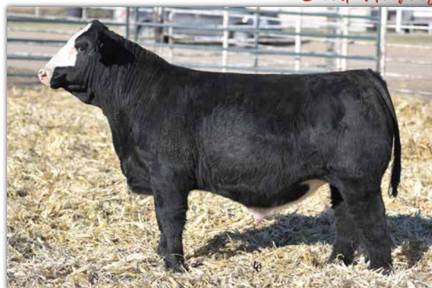
TJ BALD EAGLE 957H Sire of Lot 33.

AI bred to KOCH BE JUST COWBOY 16J (4006393). PE to KOCH BE JUST COWBOY 16J (4006393). Confirmed bred to PE and due 3/10/2024.