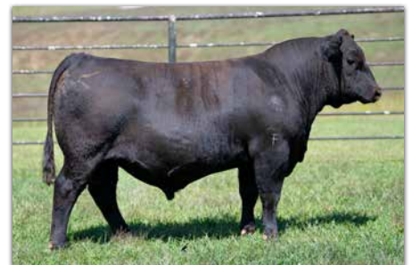
GIBBS FAST TRACK Service sire of Lot 1 Pick.