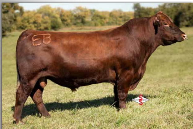
GW HILGER ONE Service sire of Lot 54.