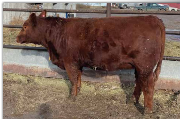
MFSR XPECTATION 050K Sells as Lot 7.

AI bred to HOOKS HERCULES 209H (3715245). PE to BULLET (3604252).