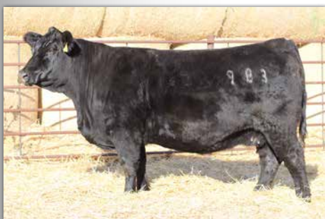
LRS MS EAGLE 983G Dam of Lot 3.