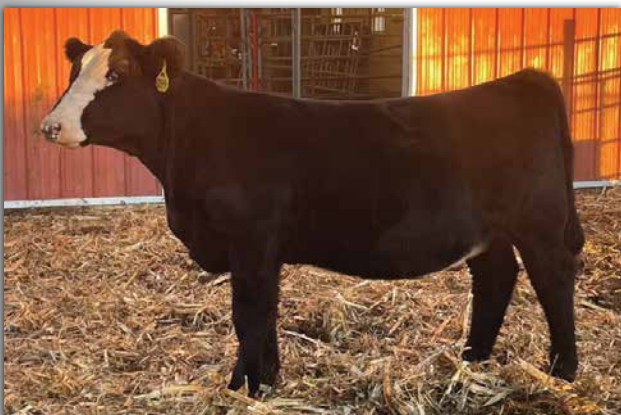
LIBERTY L14 GB Sells as Lot 37.