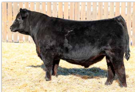
BRIDLE BIT BLACK OUT Service sire of Lot 1 Pick.