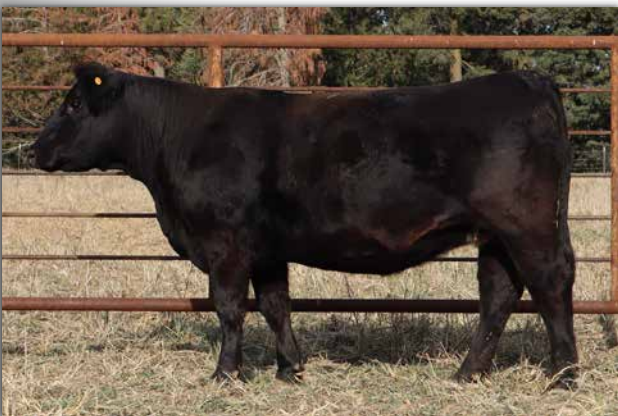
RYMO SHEZA HIGH FORTUNE H08K Sells as Lot 12.