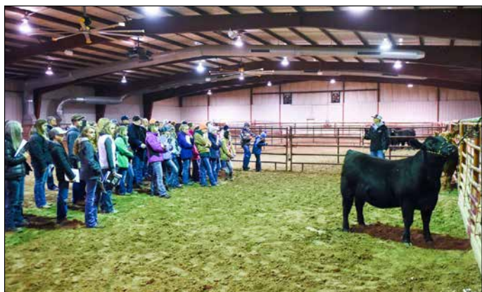
Judging photo courtesy of Cate Doubet.

8:00 AM REGISTRATION - 9:00 AM CONTEST BEGINS