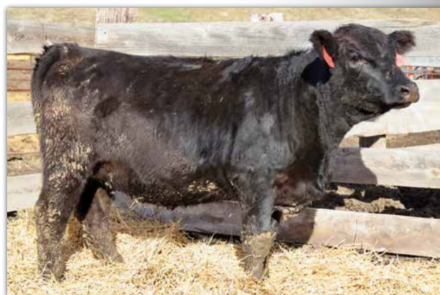
RYMO EXCELLENT TROPHY Y50K Sells as Lot 22.

AI bred to HOOKS BEACON (2854180). PE to TRCR CLEARWATER (4197046). Confirmed bred to AI and due 2/1/2024. AI bred to Hooks Beacon (2854180) on 4/25/2023 Pasture exposed to TRCR Clearwater (4197046) Vet confirmed AI bred to Hooks Beacon for a 2/1/2024 calving date. A feminine very well built solid black heifer sired by TJ Heisman, developed on national forest all these heifers have passed the test and can be run anywhere!