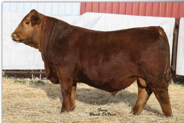
GW MAJOR MOVE 590E Sire of Lot 60.

PE to 258K (4258677), 059H (3855420). Confirmed bred to PE and due 3/28/2024.