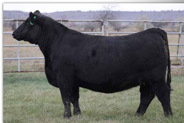
TDP SHEZA 203K Sells as Lot 14.

AI bred to ROCKING P PRIVATE STOCK H010 (3775641). Confirmed bred to AI and due 12/26/2023.