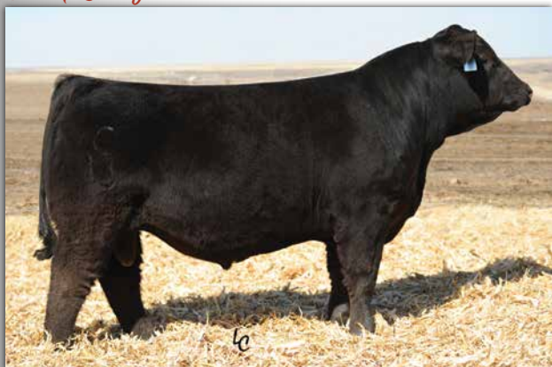
CCR COWBOY CUT 5048Z Sire of Lot 45.