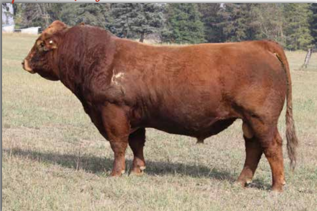
HSF CARDINAL 133G Sire of Lot 35.