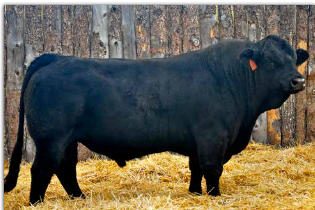
DKSR MR OLIE X4 Sire of Lot 41.

PE to KBHR MR GOLD (3943854). Confirmed bred to PE and due 5/13/2024.