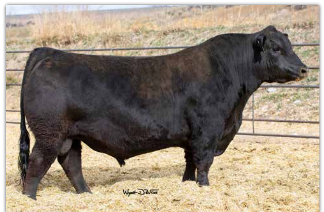
CLRS HOMELAND Sire of Lot 1 Pick Heifers.