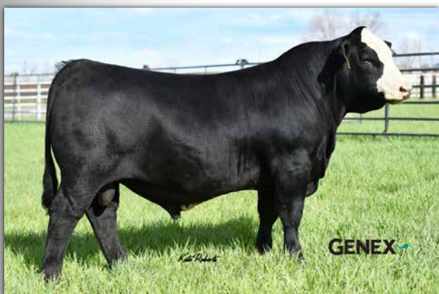
LCDR RESERVE Service sire of Lot 57.

AI bred to HOOKS EAGLE 6E (3253742). PE to KOCH EAGLE 378 017H (3855418). Confirmed bred to AI and due 2/22/2024.