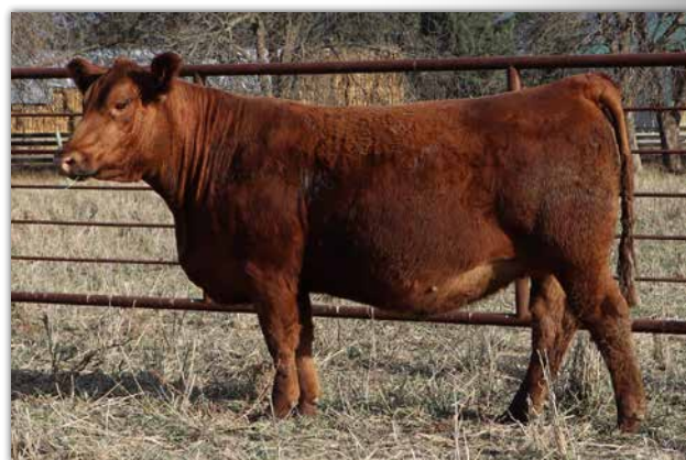
RYMO AMERICAN COMMITMENT E76K Sells as Lot 8.

AI bred to RED HILL BURLEY 99J (3953952). PE to WS JULIUS 26J (3912032). There was much debate about this one and she really shouldn't leave the ranch. Big hip, extra deep, extra wide makes this All American on the special side. She will be a bull making machine coming from a very long line of favorite cows. She ranks in the top 15% for TI along with excellent Milk, MWW, Doc, WW, YW and YG.