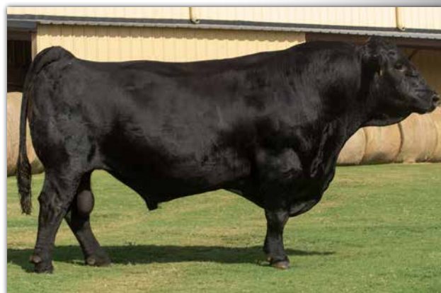
HOOK'S FREEDOM Service sire of Lot 51.

AI bred to FREEDOM. PE to 258K (4258677), 059H (3855420). Confirmed bred to AI and due 2/22/2024.