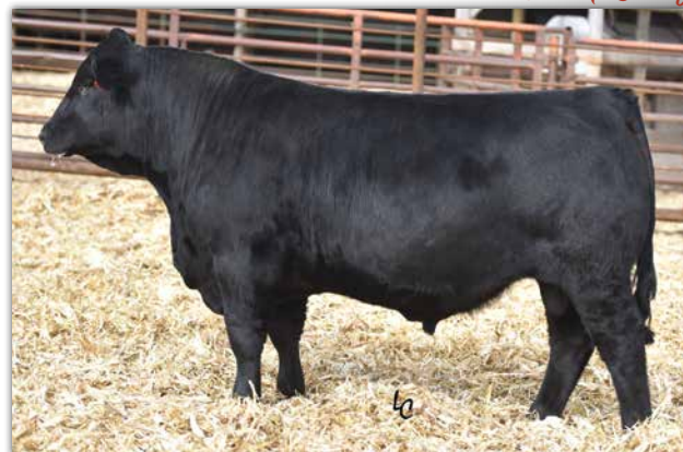
HOOK'S BEACON 56B Sire of Lot 40.

PE to TABLE ROCK H12 (3746178). Confirmed bred to PE and due 3/15/2024. A 2019 model 3/4 Blood cow pasture bred to TABLE ROCK H12 (3746178) with an estimated 3/15/2024 vet confirmed calving date. Grand sire SAV Brilliance.