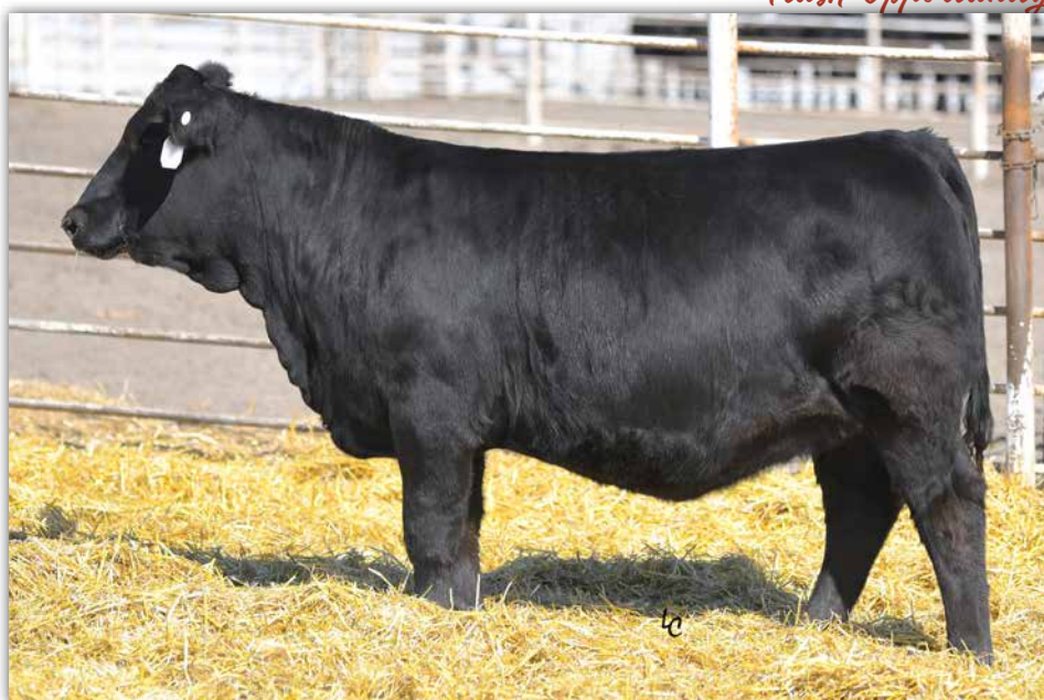
TJ 14J Donor dam of Lot 2 Flush and Lots 2A and 2B.

Homozygous Black, Homozygous Polled BD: 1/23/2021 Tattoo: 14J