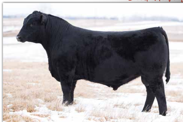
HOOK'S ENCORE 65E Sire of Lot 5.

AI bred to KBHR GLOBAL J138 (3943850). PE to ECLIPTIC (3292186).