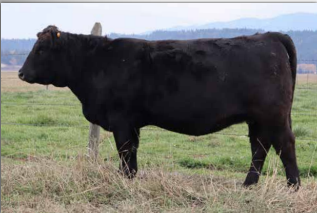
RYMO GENESIS POWER 953K Sells as Lot 11.