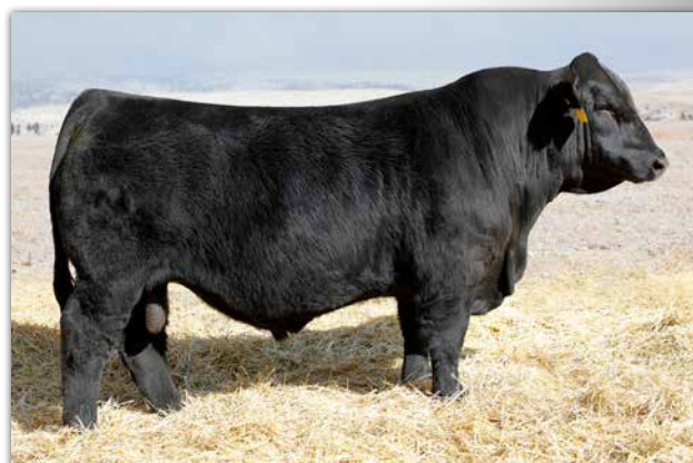
KBHR HONOR H060 Service sire of Lot 6.

AI bred to KBHR HONOR H060 (3789447). PE to ECLIPTIC (3292186). Confirmed bred to and due.