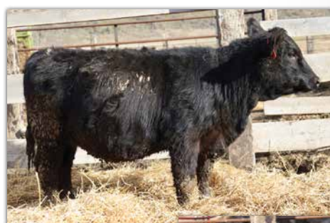
TRCR MISS 14J X BROAD RANGE L7 Sells as Lot 2A.

We purchased TJ 14J as an open weaned heifer for $7,000 at the Triangle J Harvest Select Female sale in the fall of 2021. We quickly realized she would go straight into our embryo program as a donor. She was flushed as a true open heifer and has not let us down since. She has averaged 14.6 embryos per flush to this point and shows no signs of slowing down. She represents a true power female and speaks for herself in every facet. Her first group of female progeny recently sold private treaty giving her an early total of $30,800 of progeny production in the first year with the bull side of her progeny yet to sell as yearlings in the spring of 2024. 14J earns a living on our forest service pasture permit at 6,000ft elevation when she's not being flushed. This is not a pampered donor cow and what you see is what you get! TJ 14J will be on display at the Montana Western Choice sale for viewing as we offer the first flush outside of Table Rock Ranch and Simmentals own flush work. She will also have two weaned open flush mate heifers offered directly following the sale of her flush! Selling a flush to the bull of your choice. Guarantee a minimum of 3 transferable embryos from the flush with one pregnancy if implanted by a certified embryologist. All eggs produced in the flush go to the buyer.