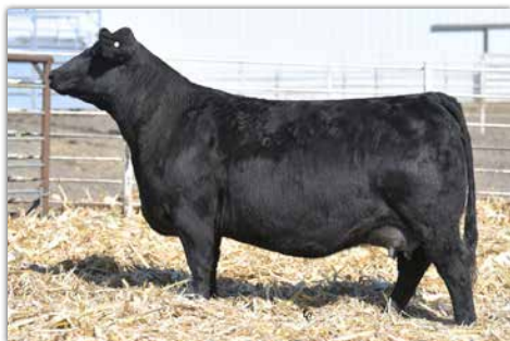
TJ 6C Dam of Lot 2.