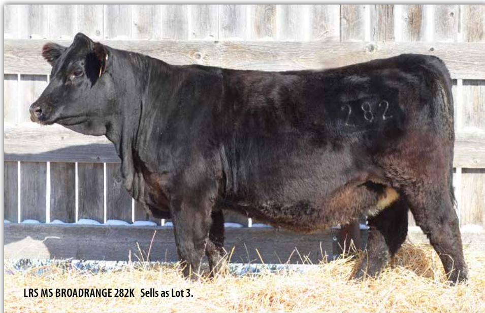
LRS MS BROADRANGE 282K Sells as Lot 3.