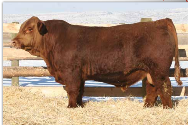
RYMO POWER SURGE G39D Sire of Lot 49.

PE to MFSR EXCELLENCE (4038926). Confirmed bred to PE and due 3/31/2024.