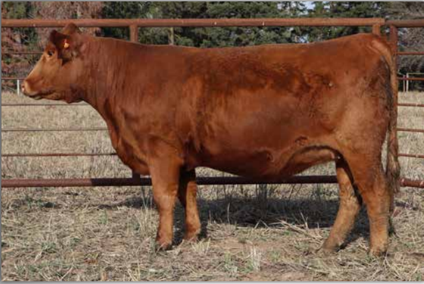
DMS CARDINAL ACE D50K Sells as Lot 9.