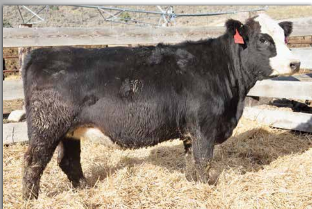
DANIELS POCAHONTAS 206 Sells as Lot 20.