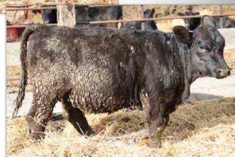
TRCR MISS 14J X BROAD RANGE L13 Sells as Lot 2B.

Homozygous Black, Homozygous Polled BD: 2/11/2023 Tattoo: L7