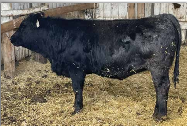
MFSR GENESIS 853L Sells as Lot 36.