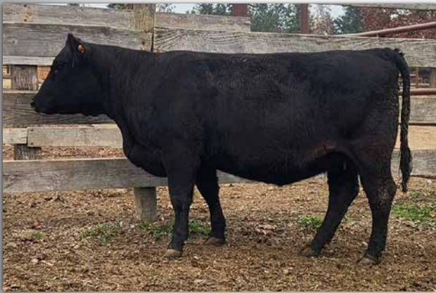
DMS DOMINANT BOSS 730K Sells as Lot 10.