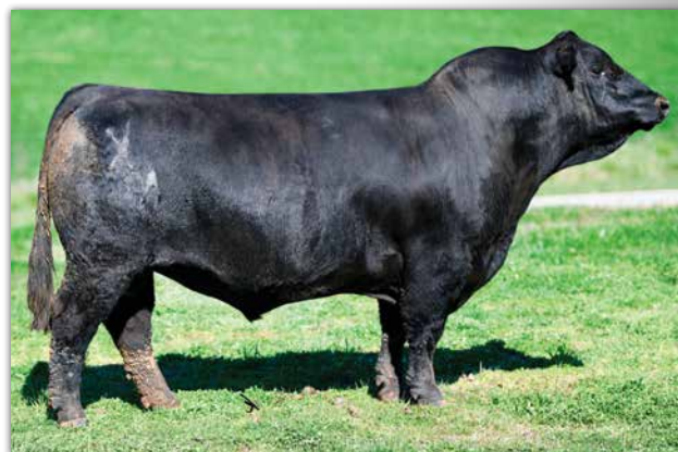
KOCH BIG TIMBER 685D Sire of Lot 34.

AI bred to KOCH BE JUST COWBOY 16J (4006393). PE to KOCH BE JUST COWBOY 16J (4006393). Confirmed bred to PE and due 4/9/2024.