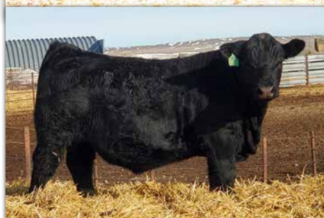
LRS DUTTON Brother to Lot 3.