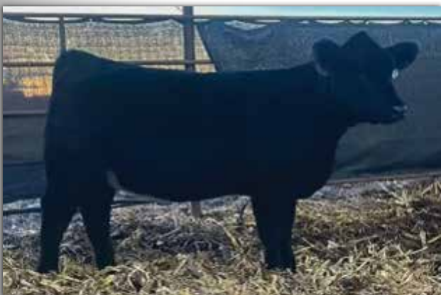
LONDON L13 BB Sells as Lot 38.