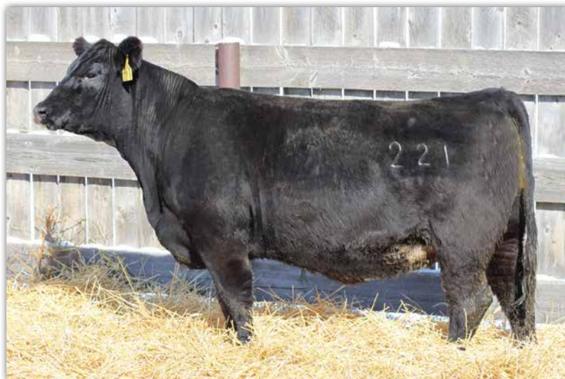
LRS MS FLAT IRON 221K Sells as Lot 4.

AI bred to HA CONVENANT 30K (4040505). Confirmed bred and due 2/27/2024. Confirmed bull calf. When we sorted replacement heifers, we kept this heifer even though she has some white, with the plan to sell her in this sale as a bred heifer. A TJ Flat Iron heifer out of an Eagle Daughter who traces back to the old 559R cow. She ratioed 102 at weaning and kept on going to ratio 109 at yearling time. You will appreciate her for her genetic make up and endless mating opportunities, but also when you evaluate her for her soundness with plenty of shape and brood cow look. Another heifer who would not be leaving the herd if she was solid black. She is AI Bred and carrying a Bull calf sired by HA Covenant 30K reg # 4040505 with a planned mating set of EPD's that are at the top of the breed. Her bull calf could pay for her in the first year. We rarely sell bred females out of our operation, and here is another great opportunity to get into the LRS program. Please visit www.lassleranchsimmentals.com for a video of this heifer.