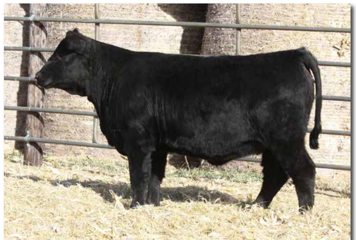
ADV MS TALON L3001 >> Sells as Lot 131.

The JC Talon daughters are so consistent. They represent highly efficient cattle, that are moderate framed, sound structured with industry leading dispositions. Look up L3001's dam, she is special.