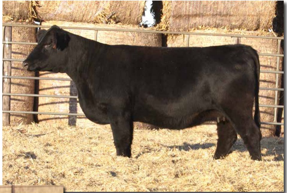
ADV MS FIRESTEEL J1040 >> Sells as Lot 19.