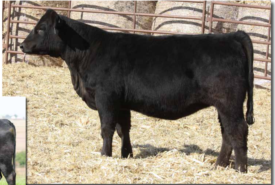
ADV MS HOMELAND L3010 >> Sells as Lot 127.

A direct daughter of A384 and Homeland. If you do your homework and want to see how impressive this heifer can be next summer, look up her full sister in the bred heifer pen. Elite genetics in this lot. If we had the opportunity to manage these females going forward she might end up in the donor pen.