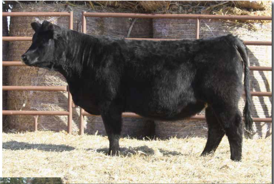
ADV MS EAGLE K2512 >> Sells as Lot 228.