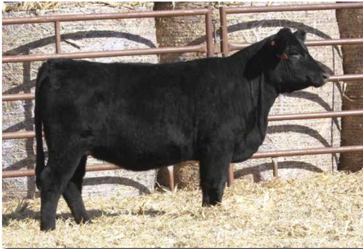
ADV MS TALON K2501 >> Sells as Lot 231.

AI bred 11/11/2023 to C-3 Next Up NS B220 J939 (4038066). PE 11/20-Present to KM CLARIFIED 214 (4263232, AAA 20322913). K2505 is a direct daughter of Brown Ms. Quanah 505B. This mating has produced some sought after bull calves in the RAB Bull Sale the past couple years. Here is a heifer ranking in the top 10% of the breed for both API and TI.