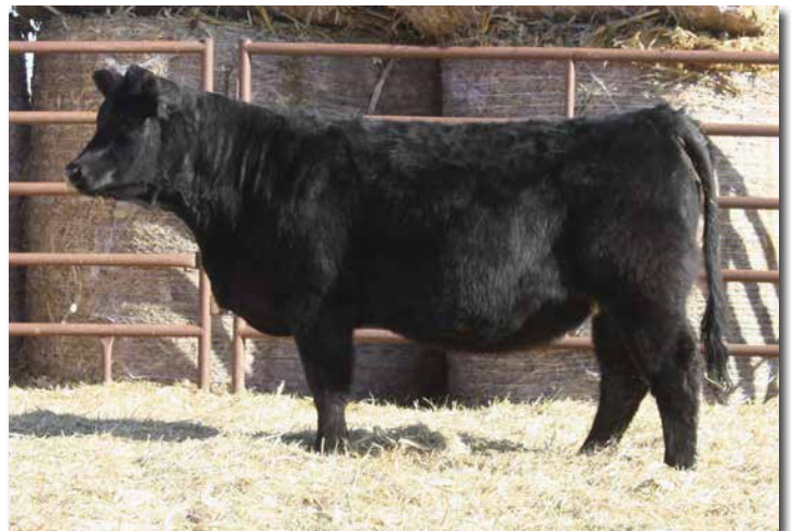
K2512 >> Daughter of Lot 100. Sells as Lot 228.