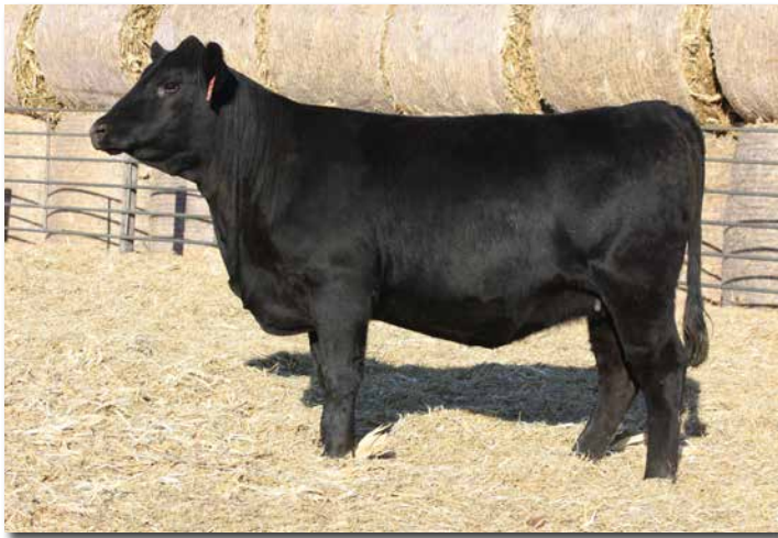
ADV MS AUTHORITY K2040 >> Sells as Lot 39.

K2008 is a JC Talon daughter that is out of a Frontline x 505B dam. That cow has an awesome Eagle sired heifer calf in the group of opens. I like this mating to KM Clarified 214 and the consistency of the cow family.