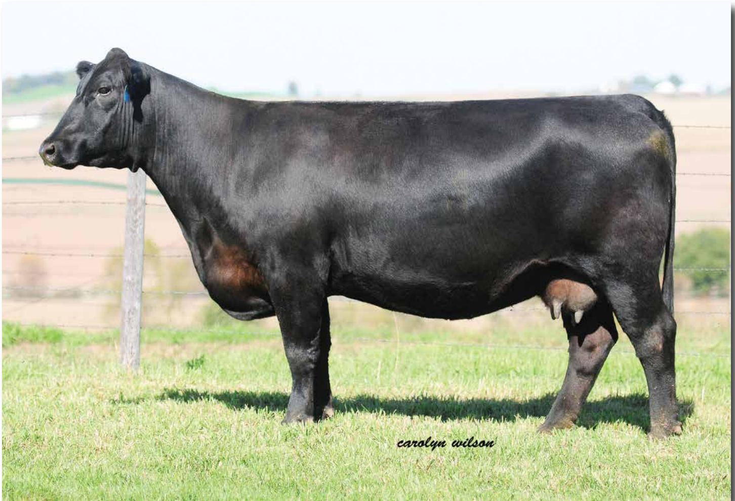
TRPH MS CATALYST A384 >> Sells as Lot 99.