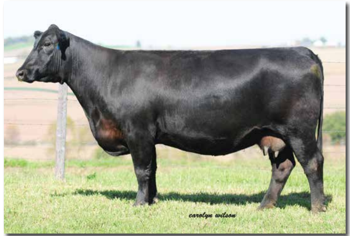
TRPH MS CATALYST A384 >> Dam of Lot 92.