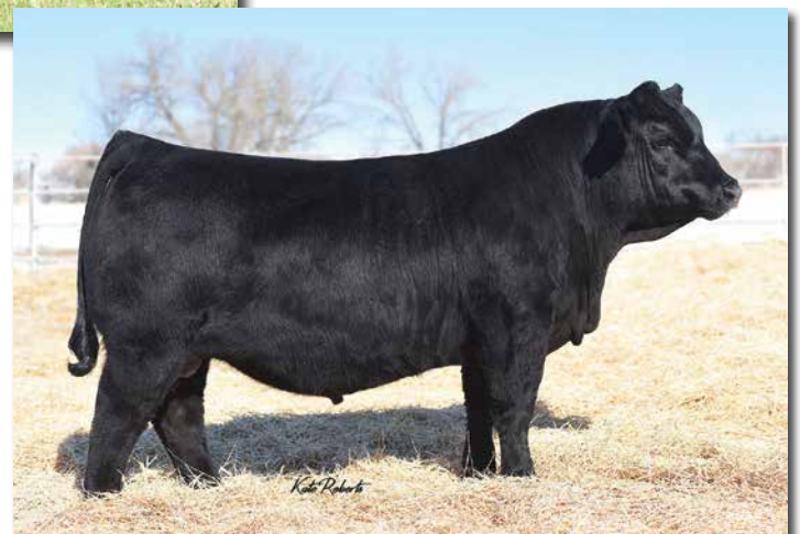
HOOK'S EAGLE 6E >> Sire of Lots 14-18.