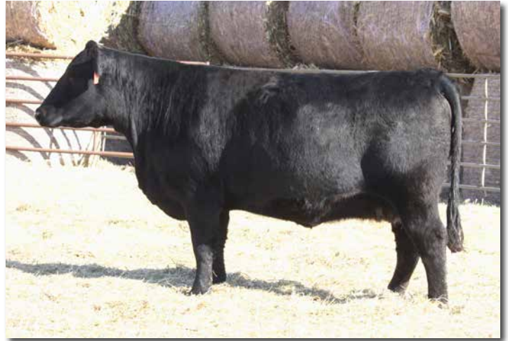
ADV MS TALON J1013 >> Sells as Lot 3.

Homozygous Black Cow ASA #3911801 Homozygous Polled J1013 5/8 SM 3/8 AN BD: 2/27/2021