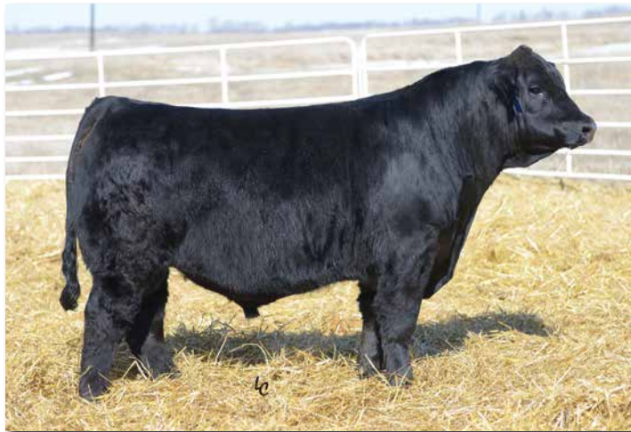
KBHR HIGH ROAD E283 >> Sire of Lot 170.