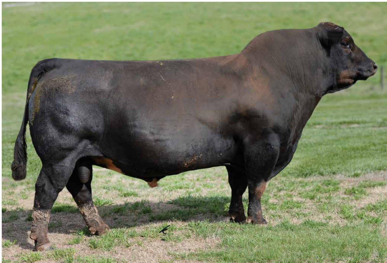
HOOKS ADMIRAL 33A >> Full brother to Lots 220, 221.