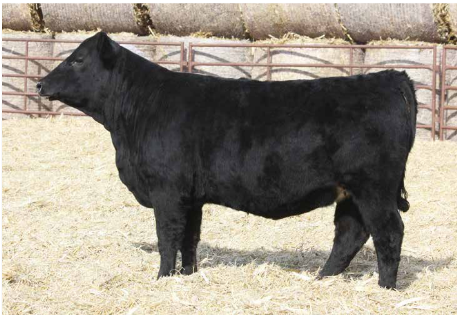
ADV MS TALON L3003 >> Sells as Lot 128.