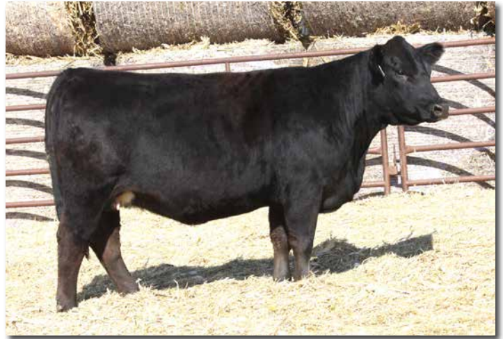
ADV MS GENESIS J1039 >> Sells as Lot 2.

Homozygous Black Cow ASA #3911787 Homozygous Polled J1039 PB SM BD: 3/15/2021