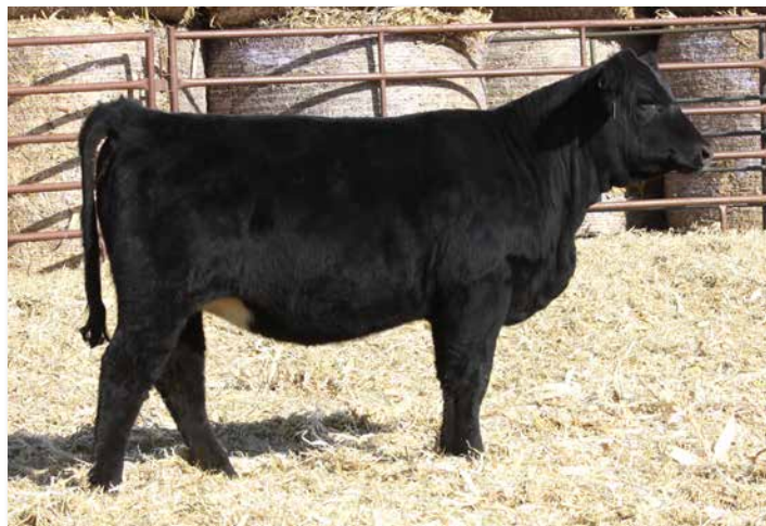
ADV MS GALILEO L3017 >> Sells as Lot 123.

Huge genetic gain awaits the new owner of L3017. You just can not find 3/4 females with this much genetic lead time built in. A384 is part of this heifers pedigree as well.