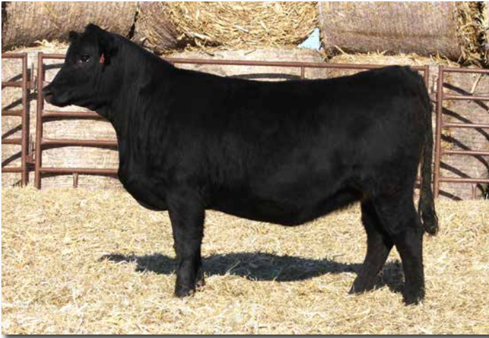
ADV MS AUTHORITY K2043 >> Sells as Lot 43.