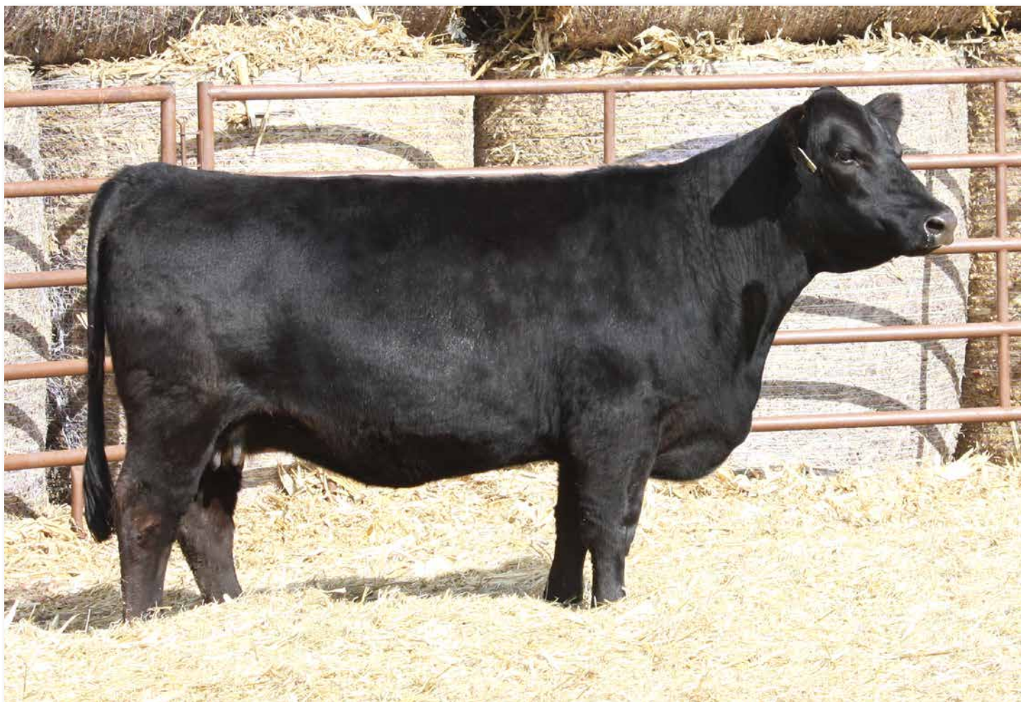
ADV MS GENESIS J1017 >> Sells as Lot 1.