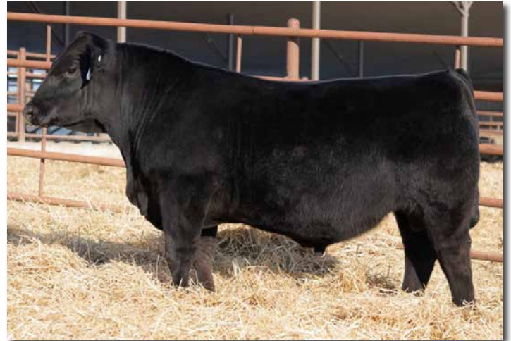
CLRS INSPIRED 0110K >> Pasture exposed sire of Lots 19-24.

Homozygous Black Homozygous Polled 5/8 SM 3/8 AN Cow ASA #3911788 J1014 BD: 2/27/2021