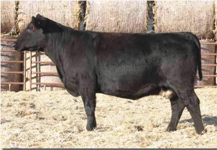
ADV MS DIPLOMAT F8001 >> Sells as Lot 89.

PE 5/23/23 TO 9/12/23 to GIBBS 9446G AUTHORITY (3716523). Confirmed safe to PE. Due 3/14/2024.