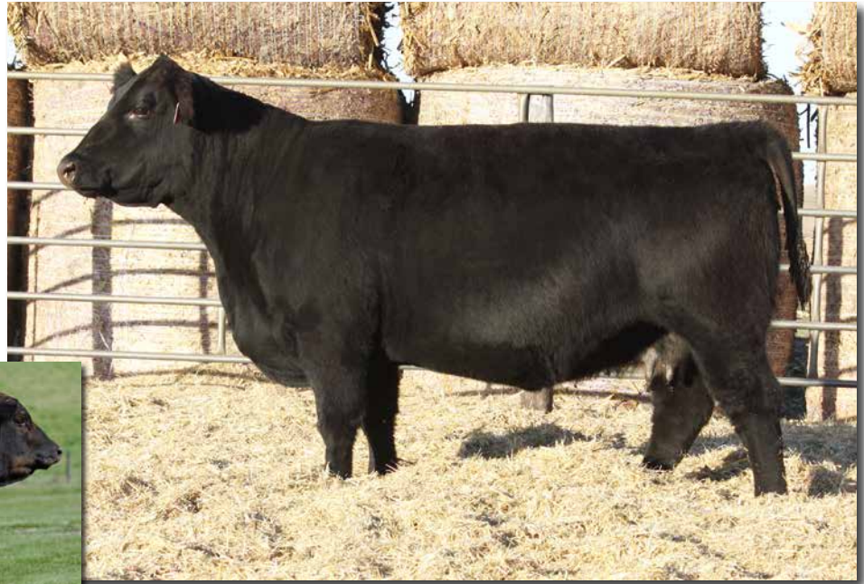
HRM MS ADMIRAL D679 >> Sells as Lot 104.