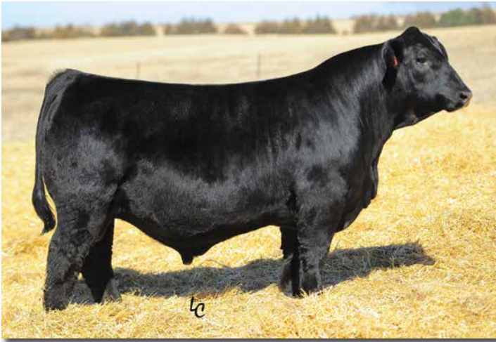
CCR WIDE RANGE 9005A >> Sire of Lots 91, 92.