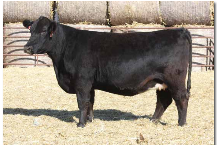
ADV MS DIPLOMAT J1044 >> Sells as Lot 24.

Homozygous Black Homozygous Polled 3/8 SM 5/8 AN Cow ASA #3911771 J1044 BD: 3/22/2021