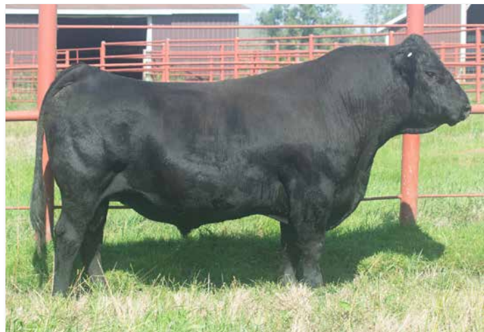
ADV MS TALON J1504 >> Sells as Lot 172.