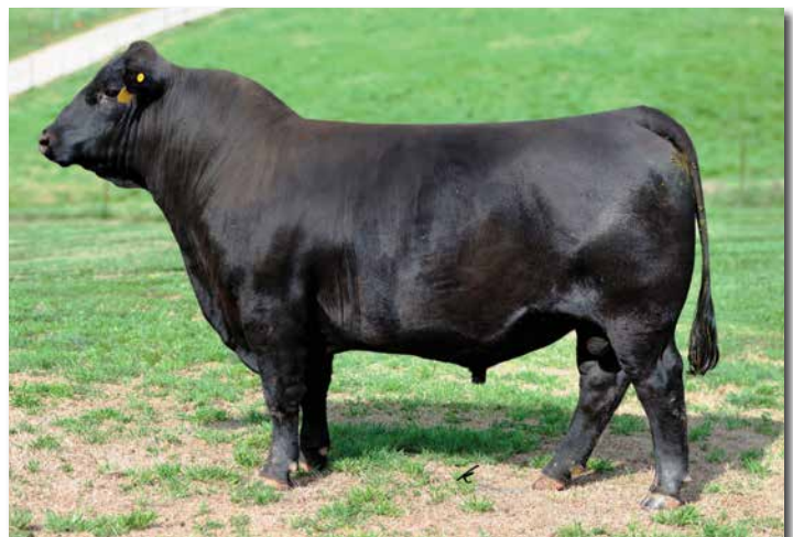
TJ DIPLOMAT 294D >> Sire of Lots 89, 90.

PE 5/23/23 TO 9/12/23 to GIBBS 9446G AUTHORITY (3716523). Confirmed safe to PE. Due 3/9/2024.