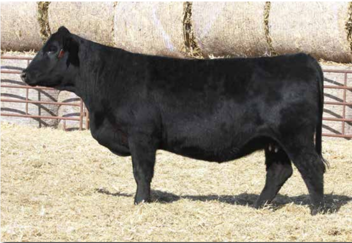
J1021 >> Daughter of Lot 99. Sells as Lot 14.