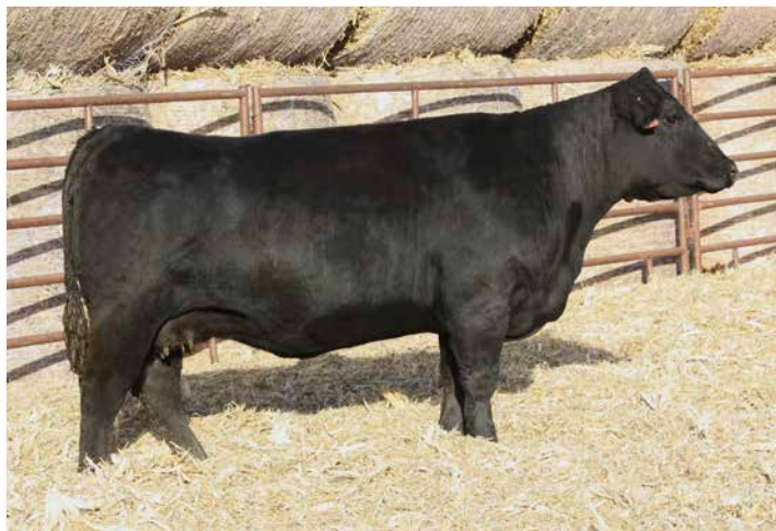
ADV MS SURE FIRE F8504 >> Sells as Lot 203.