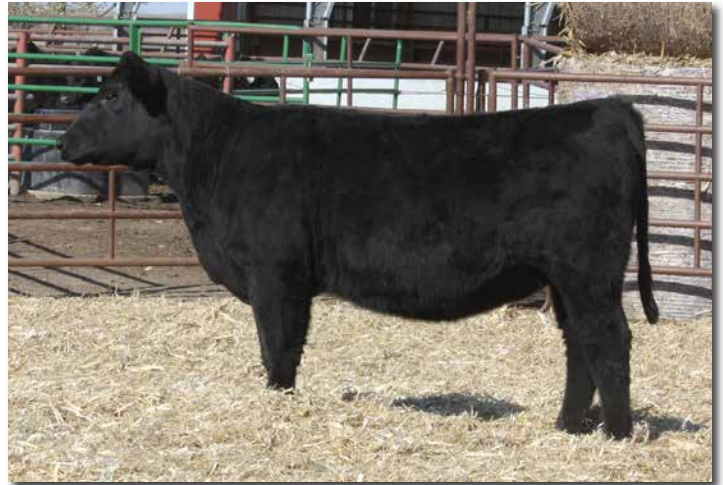
K2507 >> Daughter of Lot 100. Sells as Lot 224.