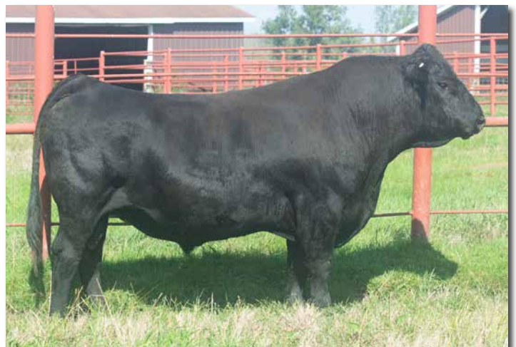
JC MR TALON 403G >> Sire of Lots 156-159.

Huge genomic value in this Talon daughter. Her dam is a unique GAR Sure Fire daughter. Superior genetic value.