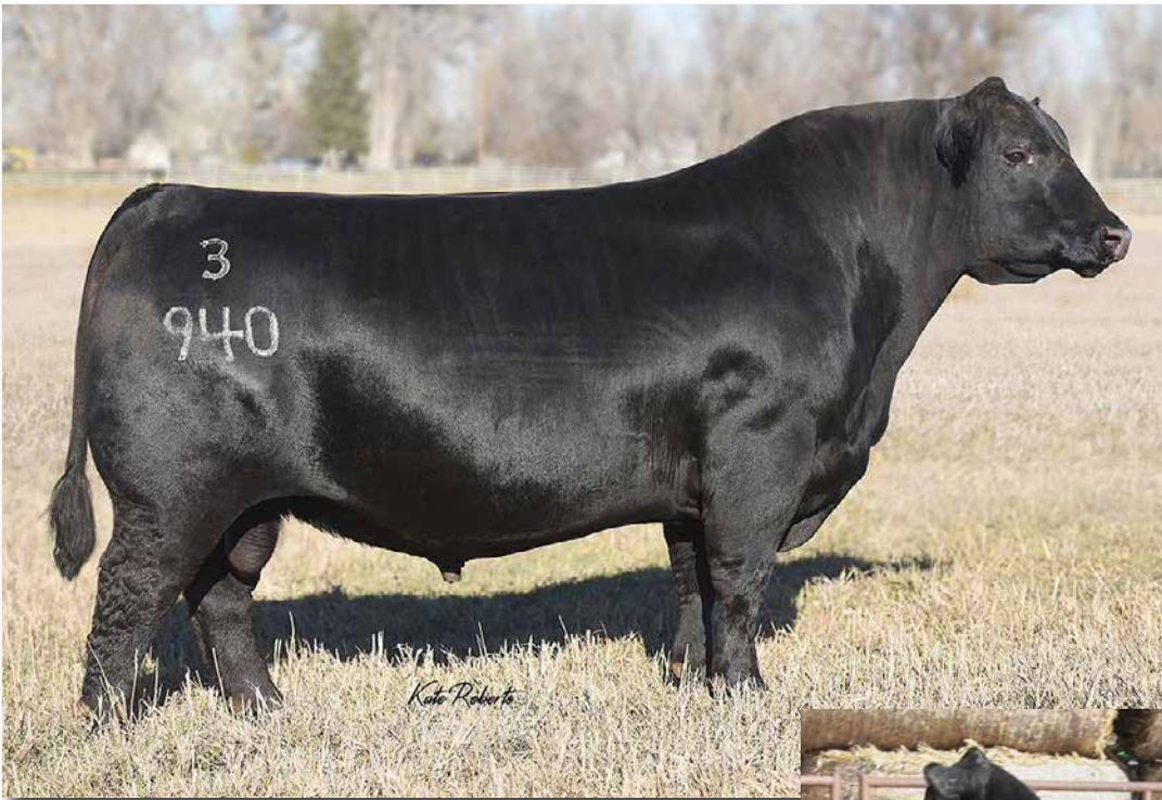
CONNELY CONFIDENCE PLUS >> Sire of Lots 236-240.