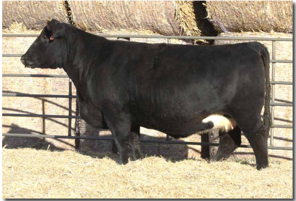
ADV MS ADMIRAL E7034 >> Sells as Lot 102.

A picture is worth a thousand words. E7034 is one of the cows that when you go check cows you always want to find. She is a creature that just puts so many things together. Massive at every angle, huge feet, absolutely beautiful udder. Her Emblem calf should be really good.