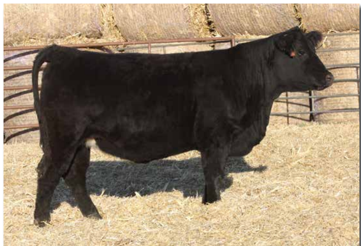
ADV MS ADMIRAL K2038 >> Sells as Lot 58.