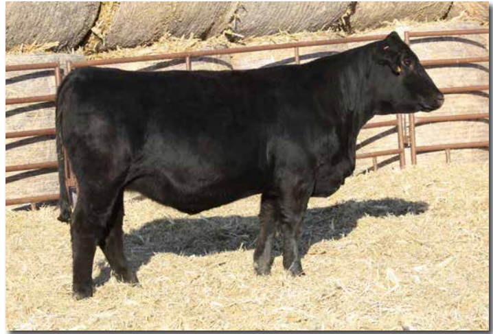
ADV MS GUARDIAN K2025 >> Sells as Lot 46.

Homozygous Black Homozygous Polled 3/4 SM 1/4 AN Cow ASA #4096149 K2025 BD: 3/7/2022