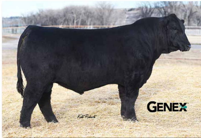
LBR GENESIS G69 >> Sire of Lot 171.