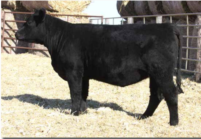
ADV MS EAGLE K2505 >> Sells as Lot 230.