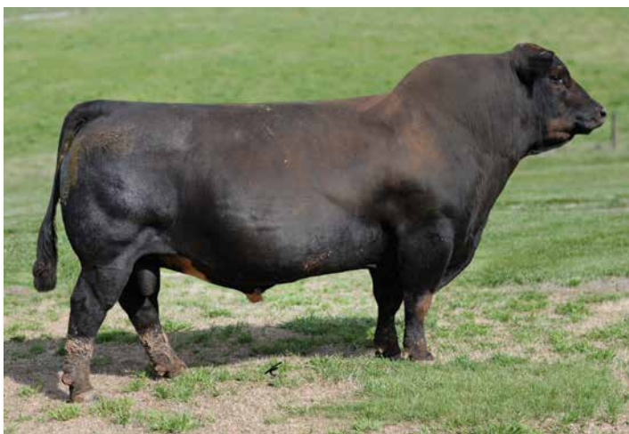
HOOKS ADMIRAL 33A >> Service sire of Lot 99.