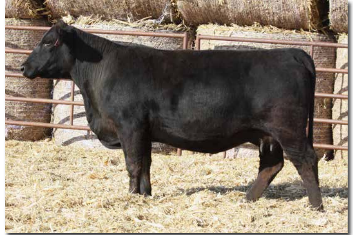
ADV MS GENESIS J1525 >> Sells as Lot 162.