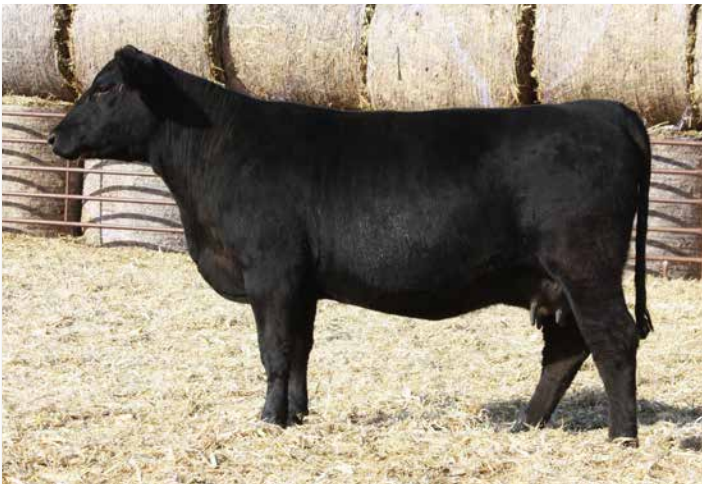
J1520 >> Daughter of Lot 160. Sells as Lot 161.