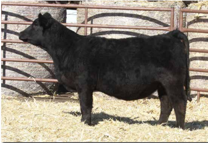
K2513 >> Daughter of Lot 100. Sells as Lot 226.