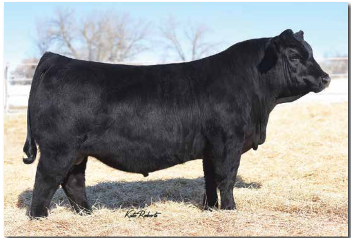
HOOK'S EAGLE 6E >> Sire of Lots 47-50.

Homozygous Black Polled 5/8 SM 3/8 AN Cow ASA #4096185 K2018 BD: 3/4/2022