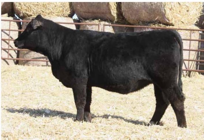
ADV MS TALON K2525 >> Sells as Lot 232.

AI bred 11/11/2023 to C-3 Next Up NS B220 J939 (4038066). PE 11/20-Present to KM CLARIFIED 214 (4263232, AAA 20322913). Another elite fall heifer calf sired by JC Talon. She ranks in the top 3% of the breed for API. By now you know how valuable we believe these Talon sired cattle are. The mating to 3-C Next Up could be special.