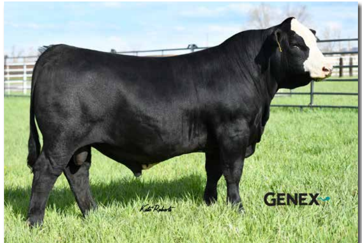
LCDR RESERVE 210J >> Sire of Lots 111A, 113A.

PE 5/23/23 TO 9/12/23 to GIBBS 9446G AUTHORITY (3716523). Confirmed safe to PE. Due 3/14/2024.