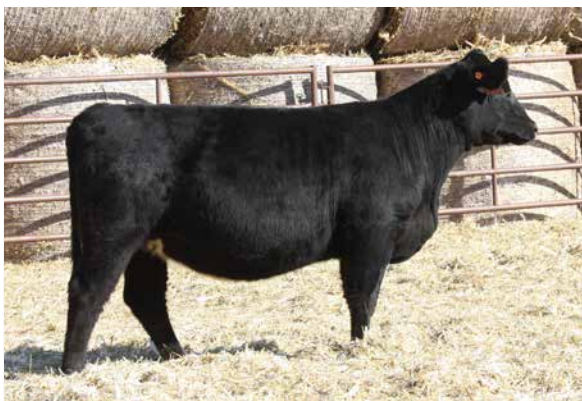
K2508 >> Daughter of Lot 101. Sells as Lot 238.

C560 is a great Wide Range daughter that traces to the great TNT Miss R77, Dual Focus's dam. Look up her Connealy Confidence Plus flush daughters in the group of fall bred. They are so unique for structure and outcross to much of the population of SimAngus cattle.