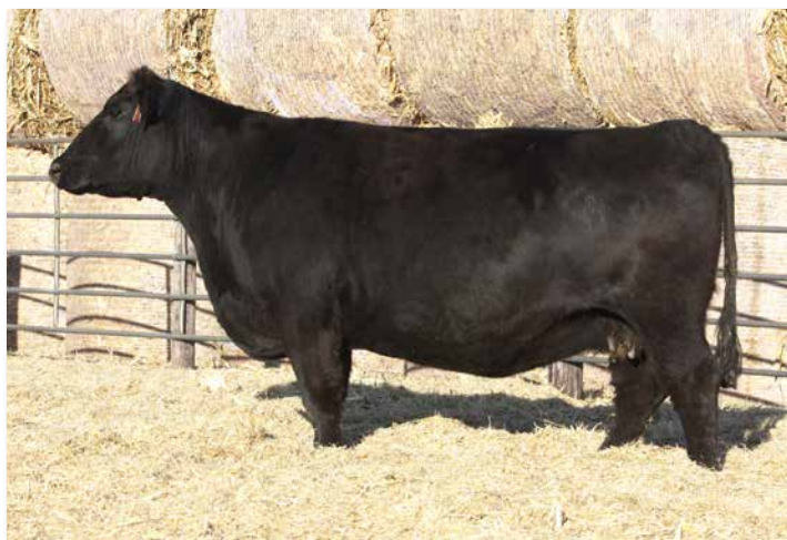
GIBBS 7011E BOL 5418C >> Sells as Lot 207.