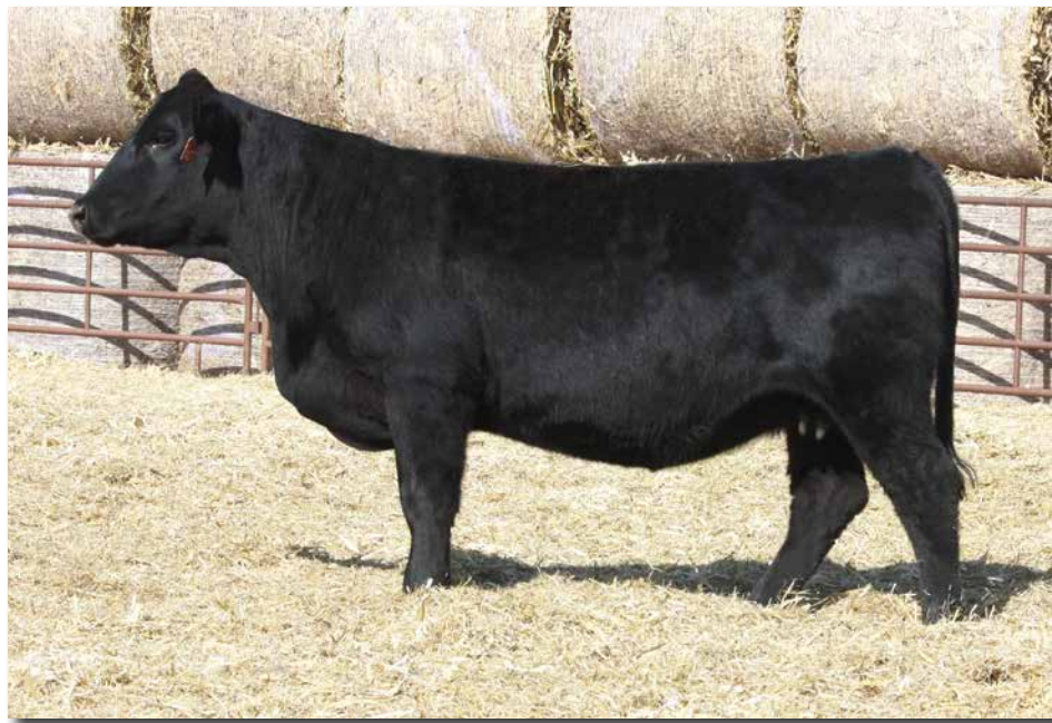
ADV MS EAGLE J1021 >> Sells as Lot 14.

J1021 is one of the many Eagle daughters out of the A384 donor dam. These females absolute powerhouse production females. Make sure you find this females heifer calf in the group of opens, she is elite.