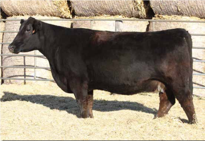
H0025 >> Daughter of Lot 160. Sells as Lot 59.