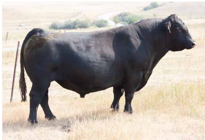
SOUTHERN FORTUNE TELLER >> Sire of Lots 185, 186.