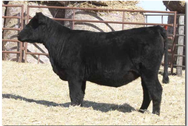
ADV MS TALON K2522 >> Sells as Lot 158.