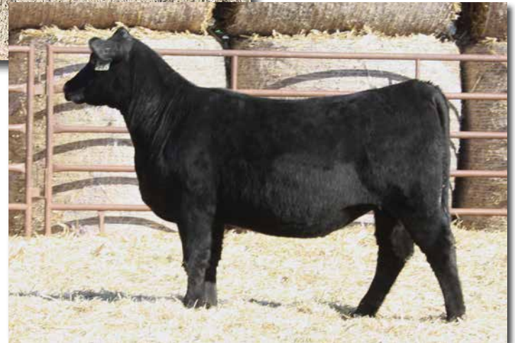
ADV MS CONFIDENCE PLUS K2515 >> Sells as Lot 40.