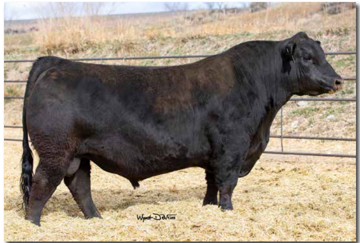
CLRS HOMELAND 327H >> Sire of Lots 28-33.

Homozygous Black Cow ASA #4096198 Homozygous Polled K2033 5/8 SM 3/8 AN BD: 3/12/2022