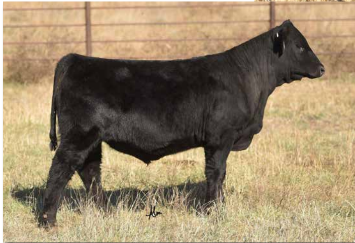
L4799 >> 2023 son of Lot 19 by Hook's Galileo 210G with a $API of 198 and $TI of 103.