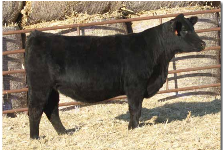
ADV MS HOMELAND K2023 >> Sells as Lot 33.

Homozygous Black Cow ASA #4096218 Homozygous Polled K2023 5/8 SM 3/8 AN BD: 3/6/2022