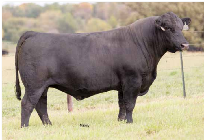
NIGHTVISION ADV 04371 >> Sire of Lot 204.