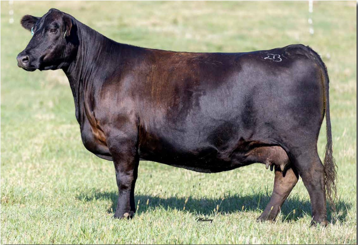
BROWN MS QUANAH 505B >> Sells as Lot 160.