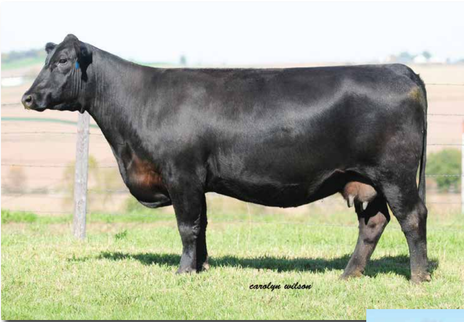
TRPH MS CATALYST A384 >> Dam of Lots 14, 15, 17.