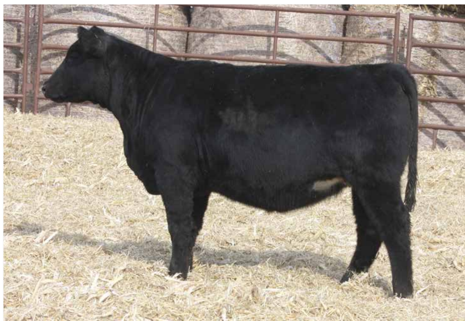
ADV MS GALILEO L3002 >> Sells as Lot 119.