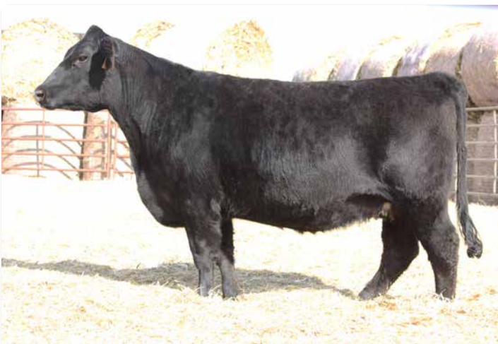
ADV MS CAPITALIST J1005 >> Sells as Lot 8.

We have had the opportunity to see the genetic value of these cows in 2 different genetic evaluations. If you know anything about the $Profit system these Capitalist females are elite for $P and $R. The resulting CLRS Homeland calf she is carrying will pay for this female.