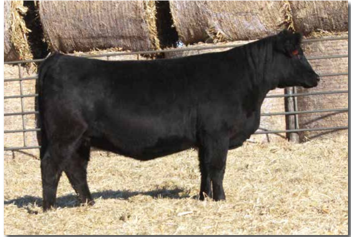
ADV MS EAGLE K2017 >> Sells as Lot 47.

Homozygous Black Homozygous Polled 5/8 SM 3/8 AN Cow ASA #4096165 K2017 BD: 3/3/2022