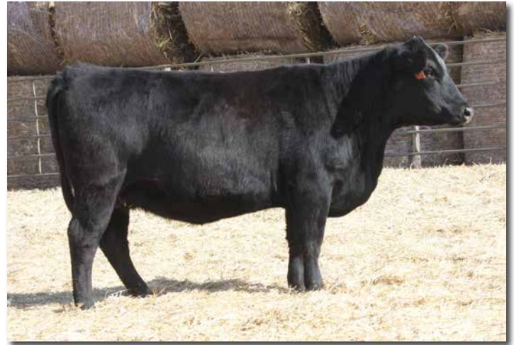
ADV MS TALON J1011 >> Sells as Lot 22.

Homozygous Black Homozygous Polled 5/8 SM 3/8 AN Cow ASA #3911811 J1011 BD: 2/24/2021