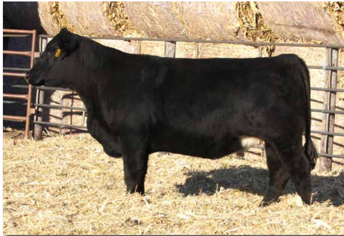
ADV MS GUARDIAN K2006 >> Sells as Lot 44.

AI bred 5/26/2023 to JC MR TALON 403G (3555669). PE 5/31/23 TO 9/12/23 to KM CLARIFIED 214 (4263232, AAA 20322913). Confirmed safe to PE. Due 4/14/2024.