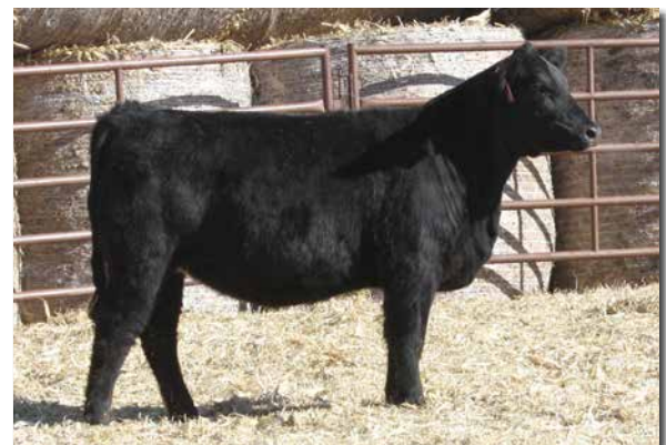
K2509 >> Daughter of Lot 101. Sells as Lot 237.