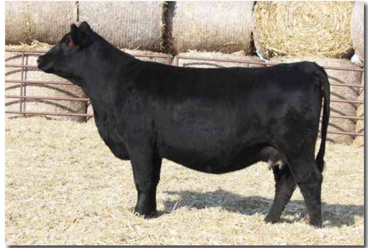
ADV MS EAGLE J1541 >> Sells as Lot 166.