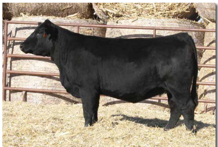
ADV MS TALON K2004 >> Sells as Lot 34.

Homozygous Black Cow ASA #4096133 Homozygous Polled K2004 5/8 SM 3/8 AN BD: 2/19/2022