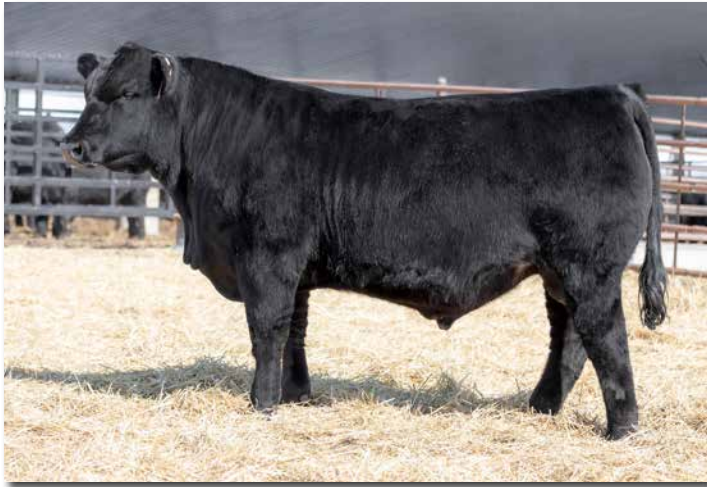
HOOK'S GALILEO 210 >> Al sire of Lots 35-37.