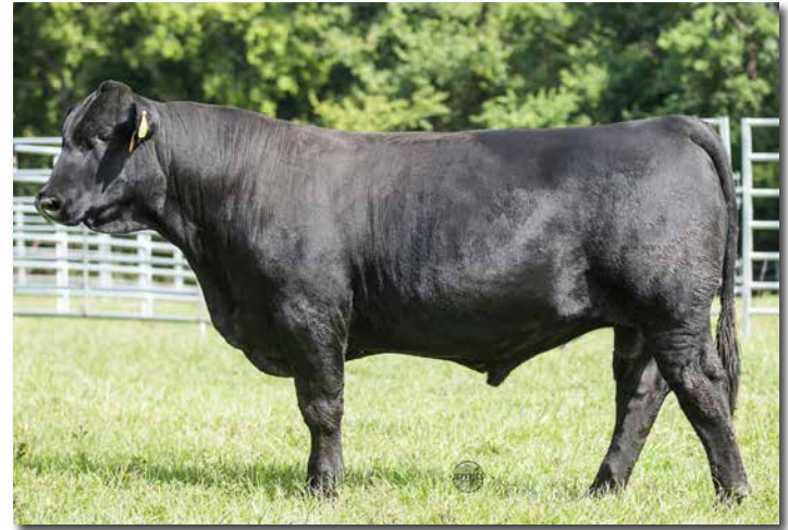
HA JUSTICE 30J >> Sire of Lots 179A, 180A.