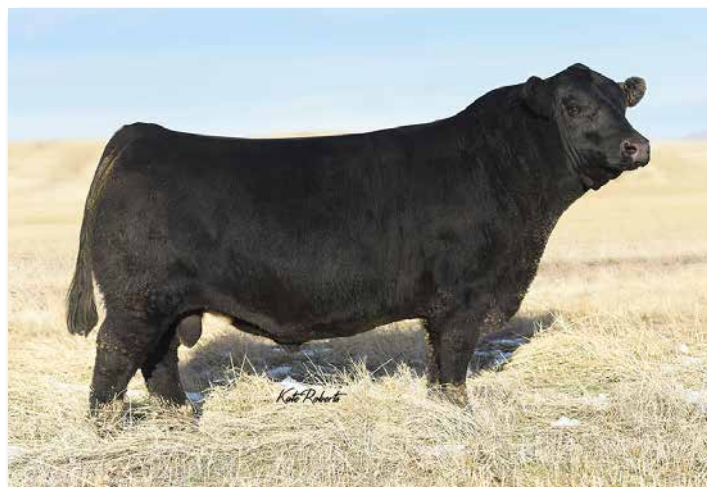
CCR BOULDER 1339A >> Sire of Lots 207, 208.