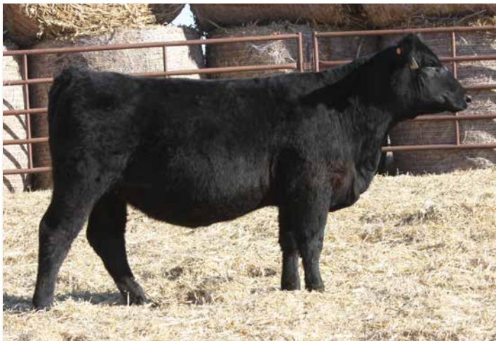
K2511 >> Daughter of Lot 100. Sells as Lot 227.