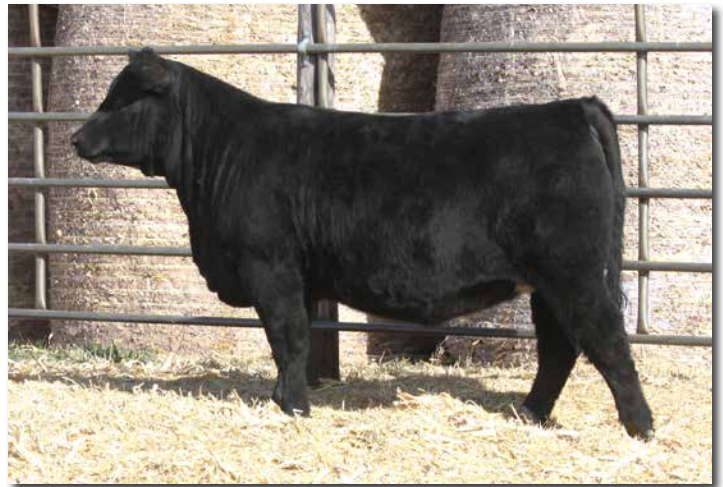
ADV MS TALON L3006 >> Sells as Lot 129.

This heifer is a truck and one that I would love to see the first few bull calves out of. Top 3% for API and top 5% for TI.