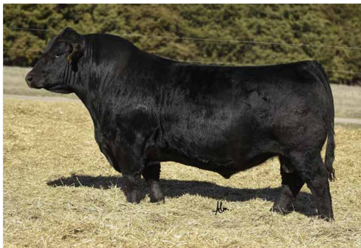
CLRS GUARDIAN 317G >> Sire of Lots 44-46.

Not hard to get these Guardian females to read as elite genomic animals. K2006 does it as a moderate framed heifer that traces back to another outstanding Admiral daughter. Take a look at the open heifers to see how Galileo worked in our cowherd, they are impressive.