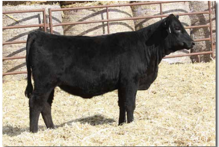
ADV MS TALON L3007 >> Sells as Lot 130.

The JC Talon sired calves have really impressed us with their consistent heifer calving ease, yet L3007 is a perfect example of the elite type and kind that you get. Talon is a shorter gestation herd sire and has lead to the confidence we have for his use in heifer projects of any size.