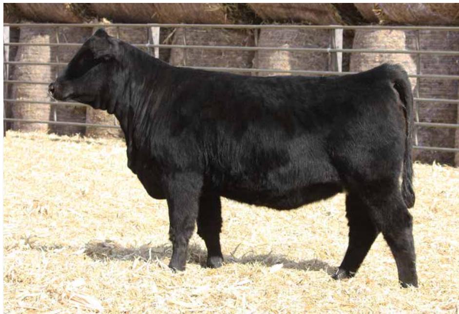
ADV MS GALILEO L3012 >> Sells as Lot 118.

One of the true breeding pieces in this group of opens. The Galileo's have been outstanding and to top it off their dispositions are outstanding.