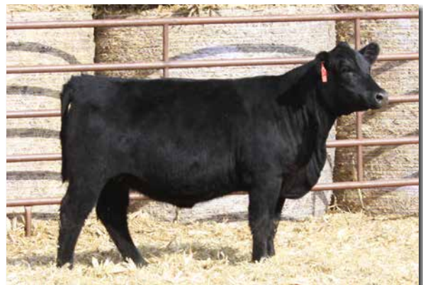
K2506 >> Daughter of Lot 101. Sells as Lot 236.