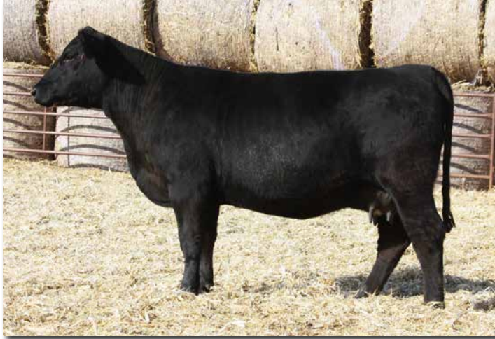
ADV MS GENESIS J1520 >> Sells as Lot 161.