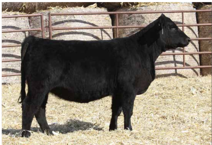
ADV MS GALILEO L3009 >> Sells as Lot 125.