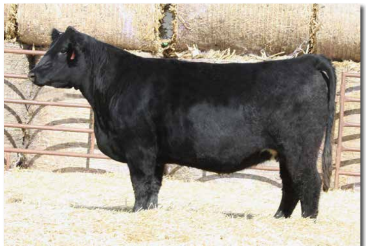
ADV MS ADMIRAL J1037 >> Sells as Lot 4.

Homozygous Black Cow ASA #3911744 Homozygous Polled J1037 5/8 SM 3/8 AN BD: 3/11/2021