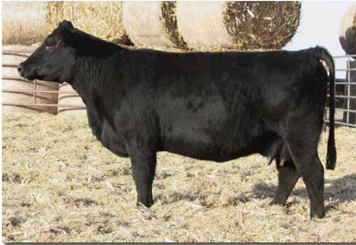
ADV MS EAGLE H0512 >> Sells as Lot 179.