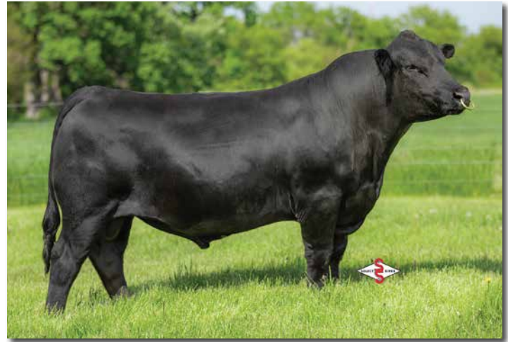
BROWN RRR EMBLEM J3541 >> Service sire of Lots 192-195.