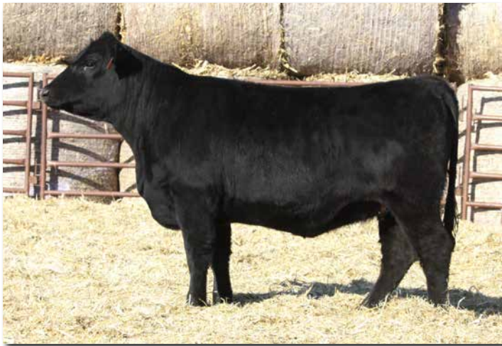
ADV MS TALON K2003 >> Sells as Lot 37.

Al bred 5/26/2023 to HOOK'S GALILEO 210 (3563620). PE 5/31/23 TO 9/12/23 to KM CLARIFIED 214 (4263232, AAA 20322913). Confirmed safe to PE. Due 4/29/2024.