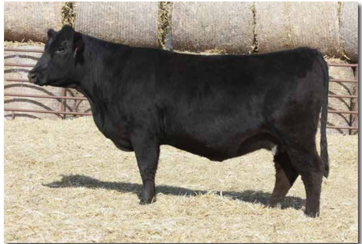
J1025 >> Daughter of Lot 99. Sells as Lot 15.