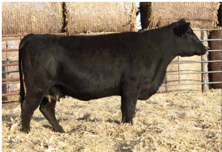
ADV MS S F TELLER H0522 >> Sells as Lot 185.