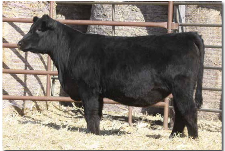
ADV MS TALON K2523 >> Sells as Lot 157.

K2523 is another complete Talon daughter out of a Diplomat x A384. Consistency is built in to this heifers pedigree. Top 10% for both API and TI.