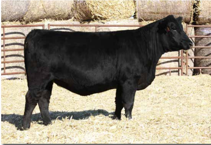
ADV MS TALON K2007 >> Sells as Lot 36.